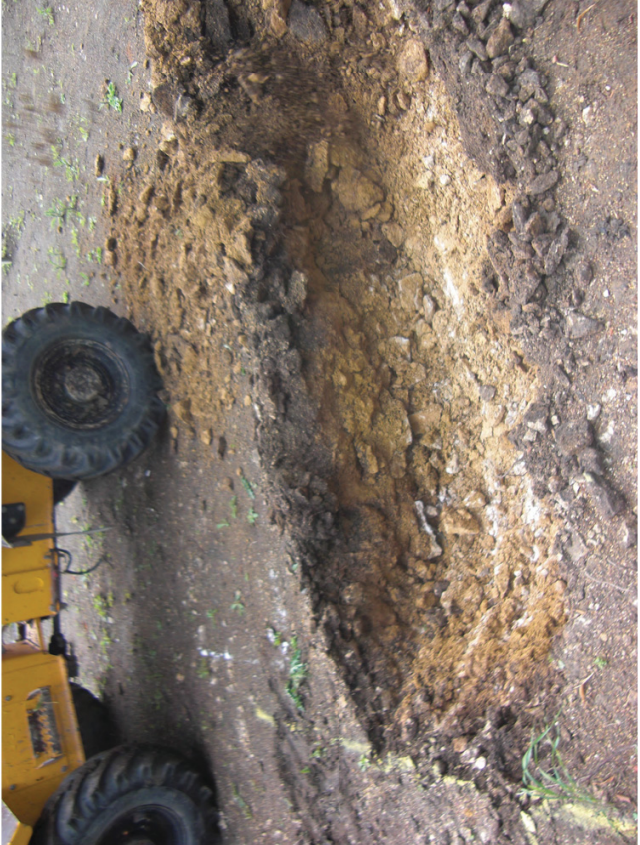
Plate 3. Foundations.