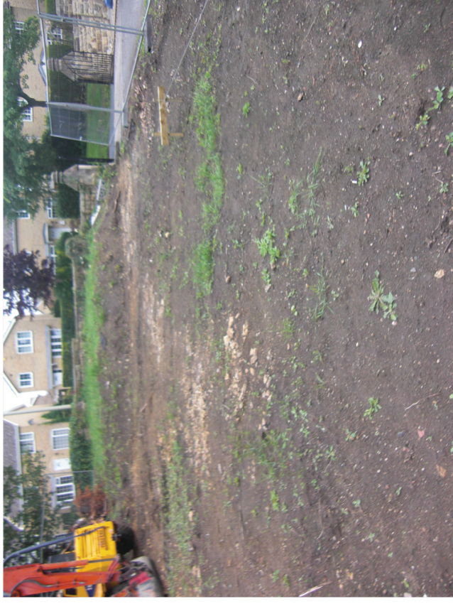
Plate 2. General View of Site. Facing North-East.