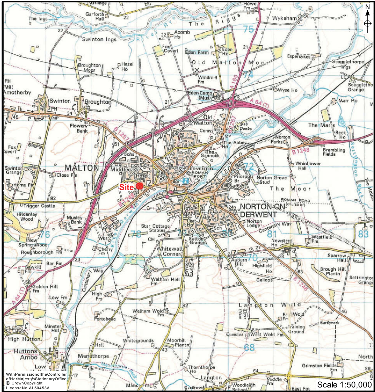
Figure 1. Site Location.