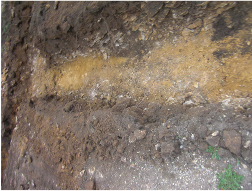
Plate 5. Foundations.