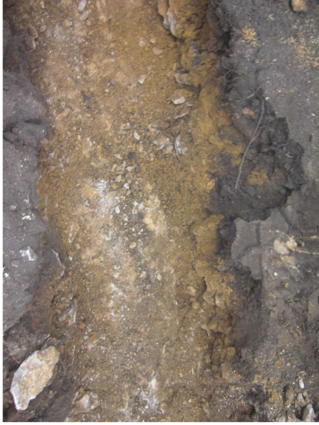
Plate 6. Foundations.