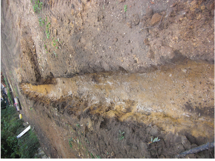
Plate 4. Foundations.