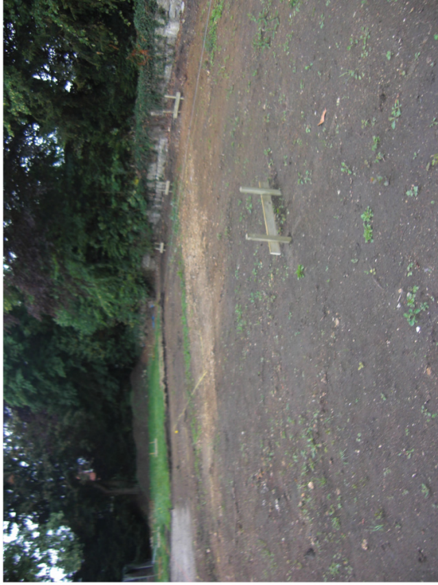
Plate 1. General View of Site. Facing South-west.