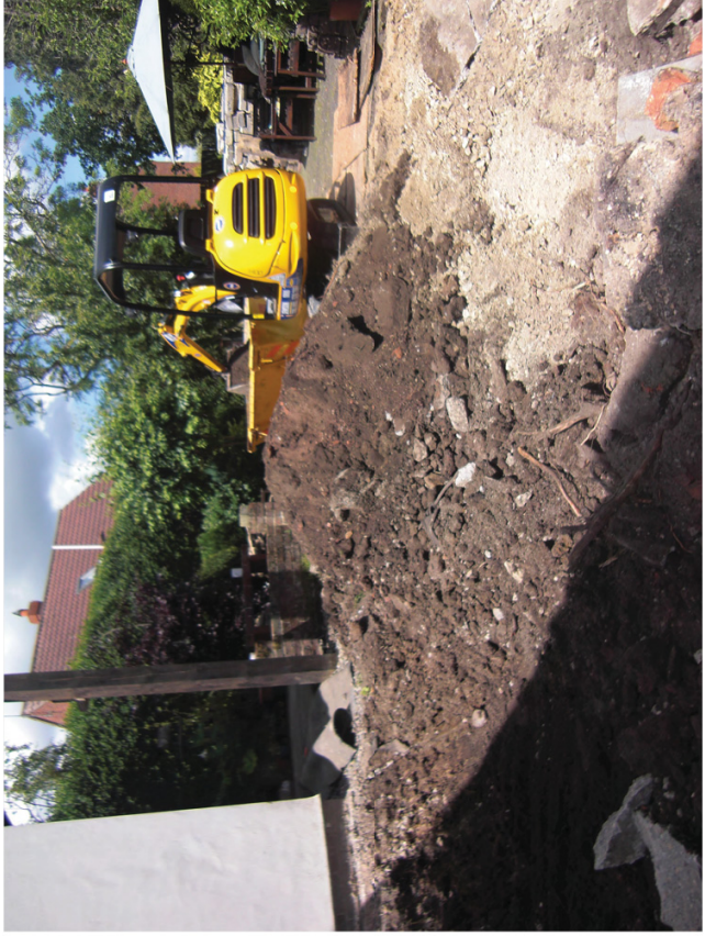
Plate 3. Area of New Extension.