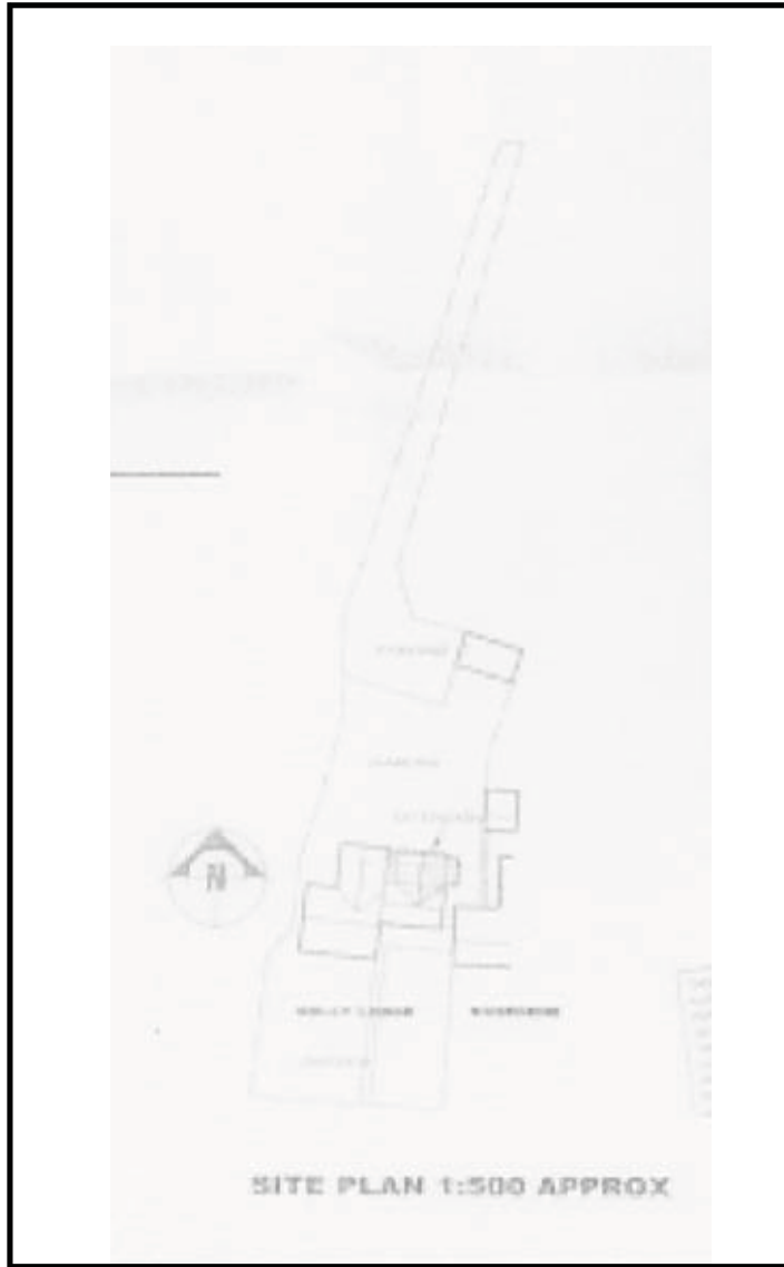
Figure 2. Proposed Development Area.