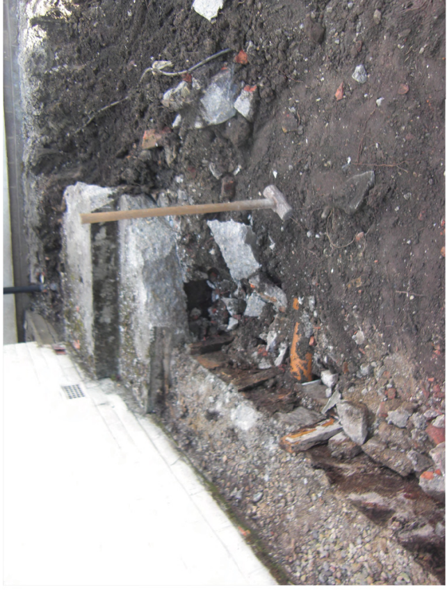
Plate 2. Area of prior disturbance.