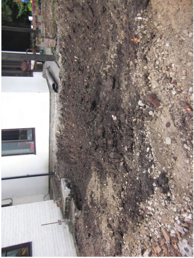
Plate 1. General View of Site.