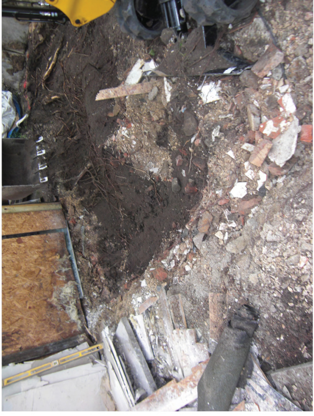
Plate 4. Area of New Extension.