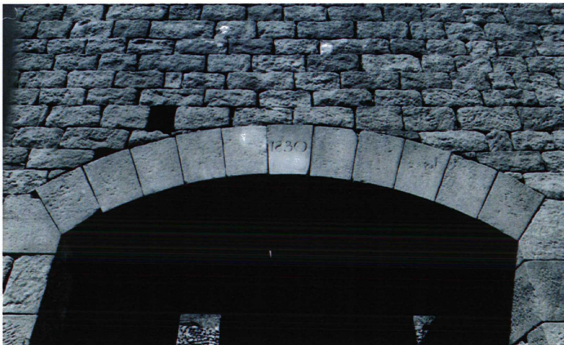
Fig 46. Brackenridge Field Barn. Detail of entrance with date.