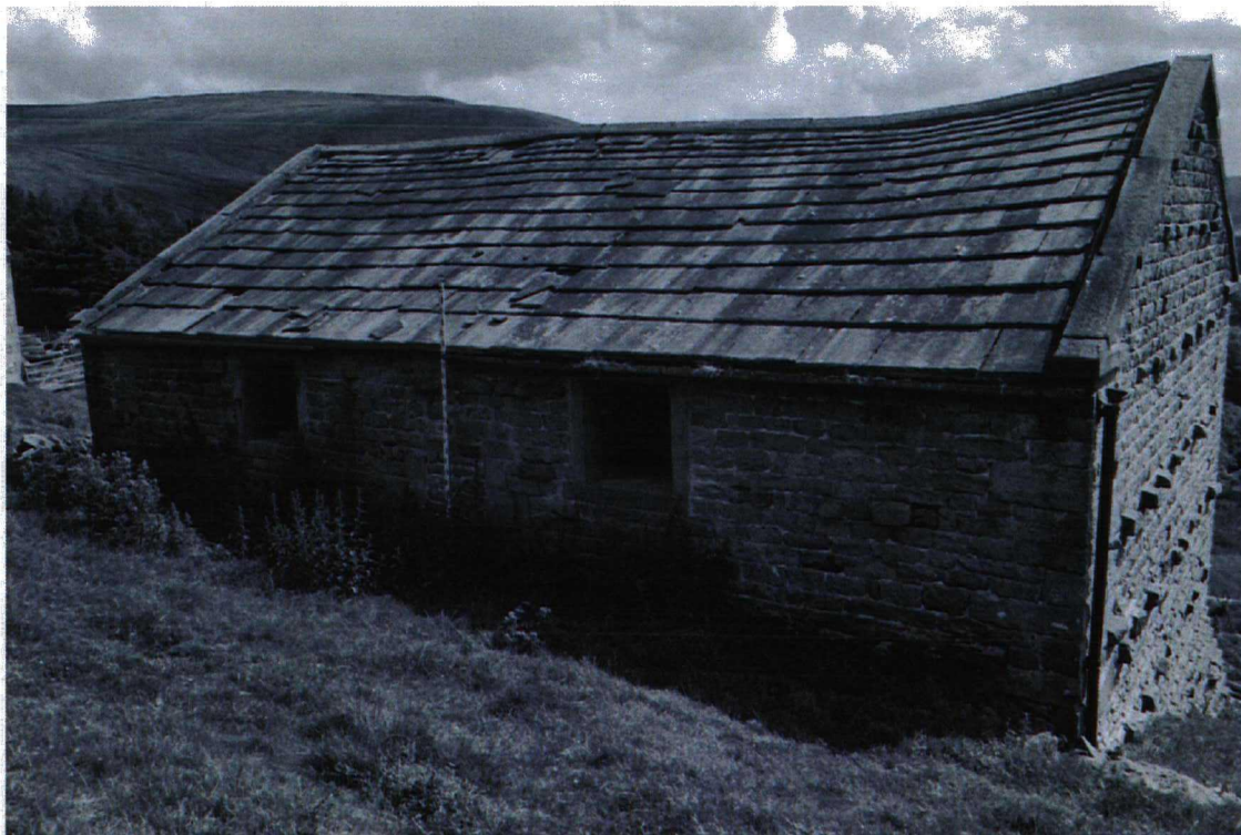
Fig 49. Brackenridge Field Barn. North elevation.