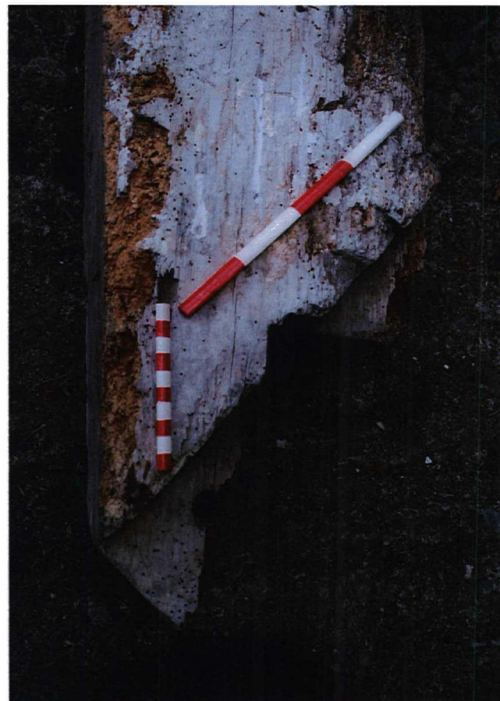
Figs 41 & 42; details of carpentry.