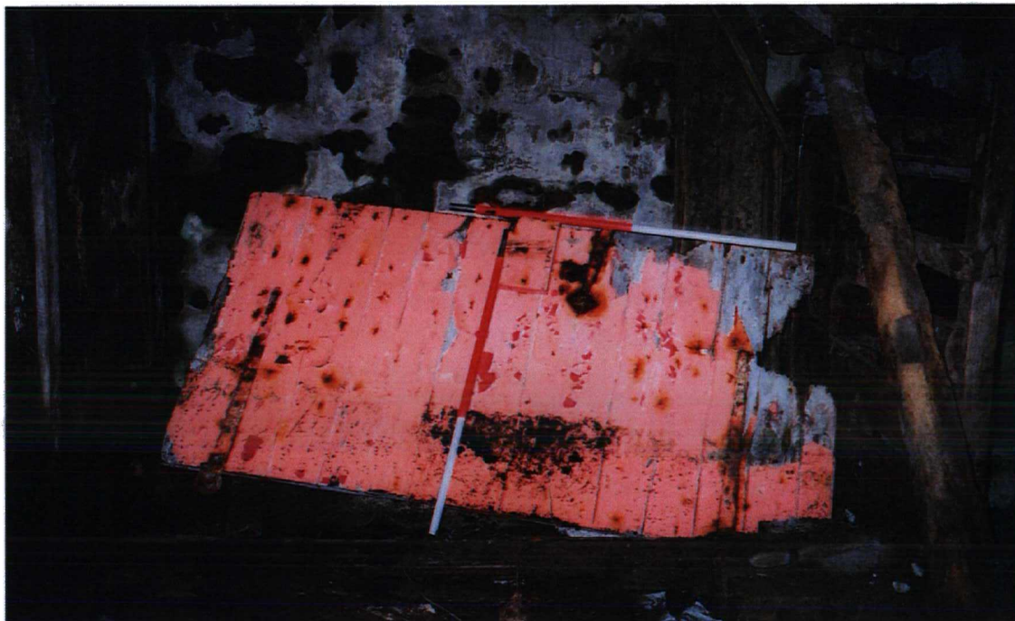
Fig 44 An exterior door, found in the main house, with horizontal planking. This may be the original front door.