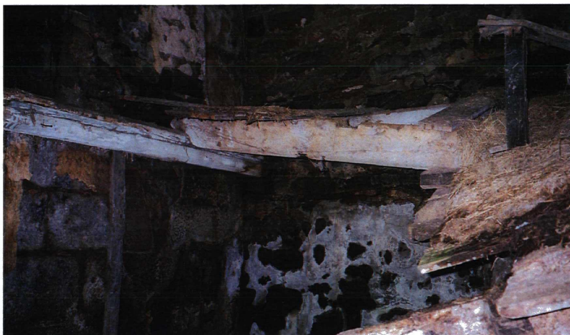
Figs 37 & 38 (below). Brackenridge OF. The collapsed first floor in the north-east corner of the main house (above) and along the north wall, showing original timbers.