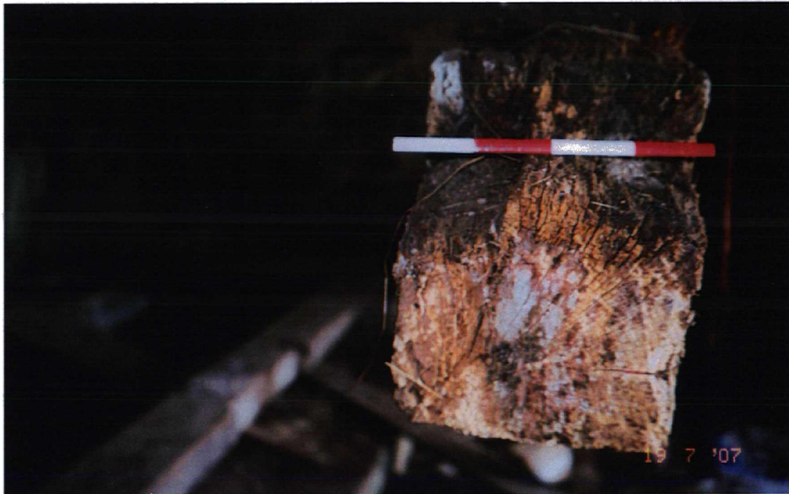
Fig 43 The recently sawn-off end of the original east-west beam supporting the first floor in the main house.