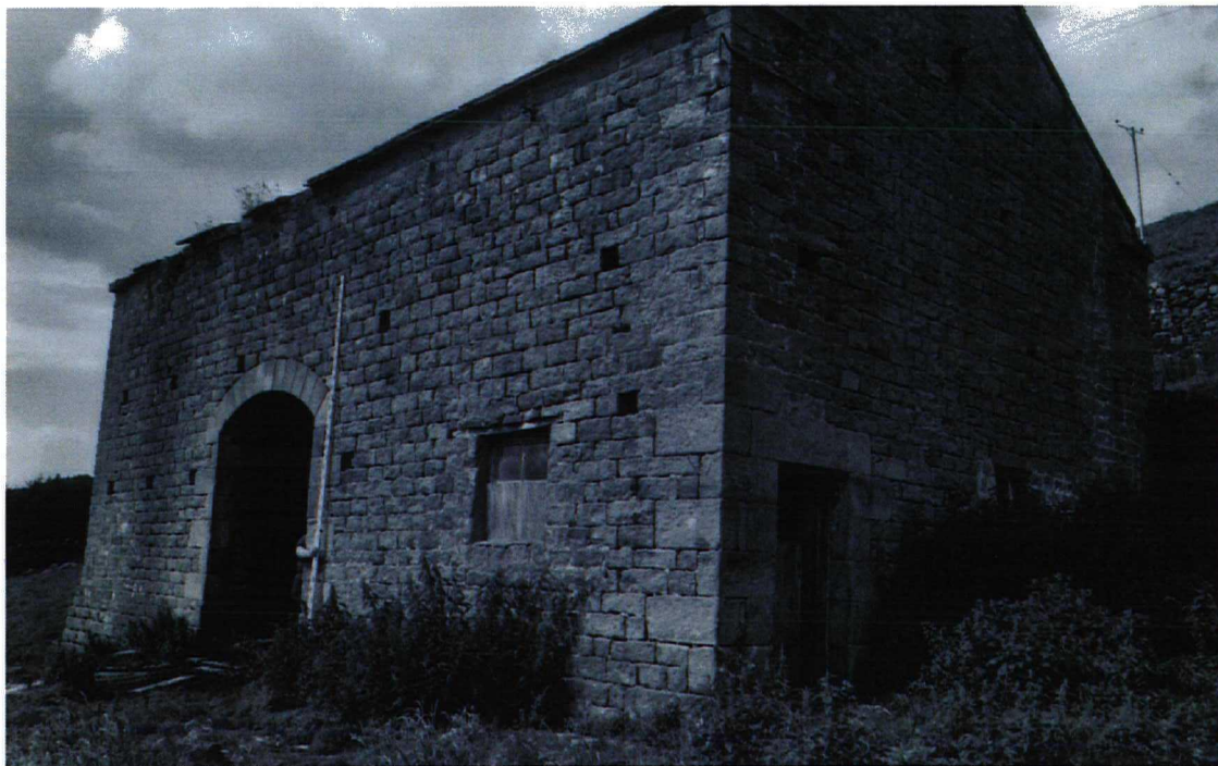
Fig 45. Brackenridge Field Barn. South elevation.