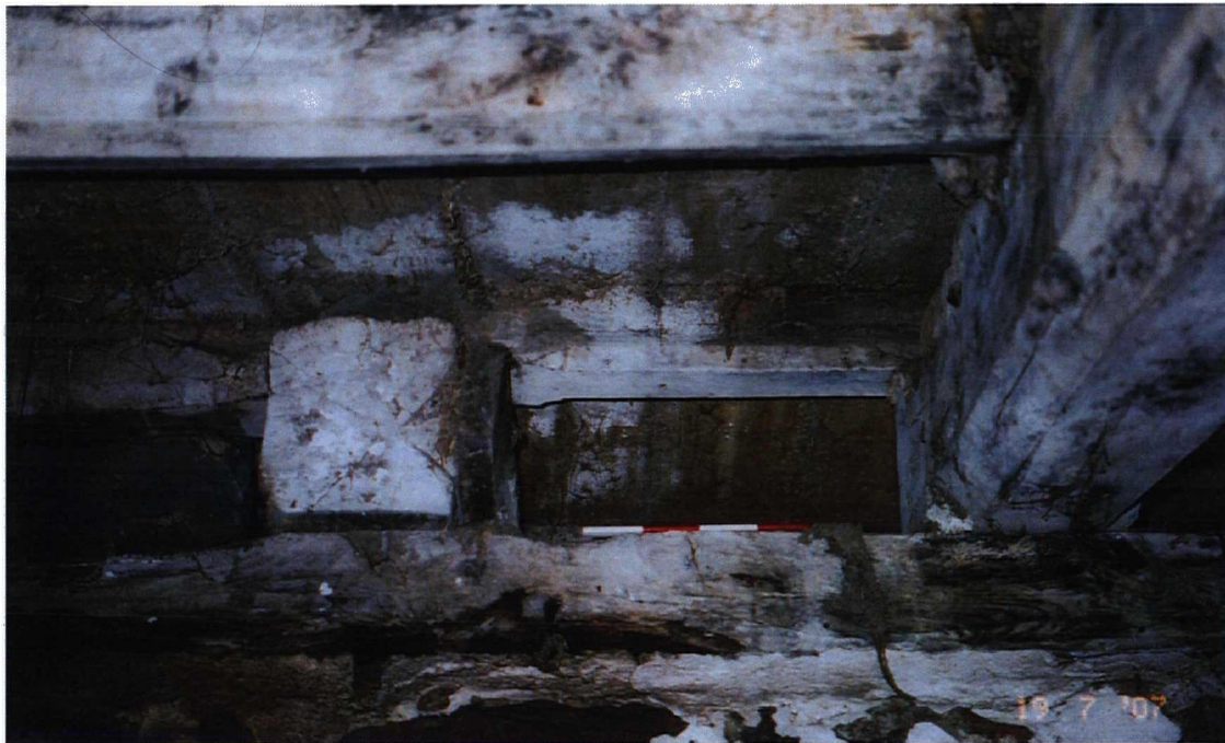
Figs 39 & 40 (below). Original timbers, still in place (right) or re-used (left) supported on the replacement partition wall. The re-used beam below has been turned so the chamfer is on the top left instead of the bottom.