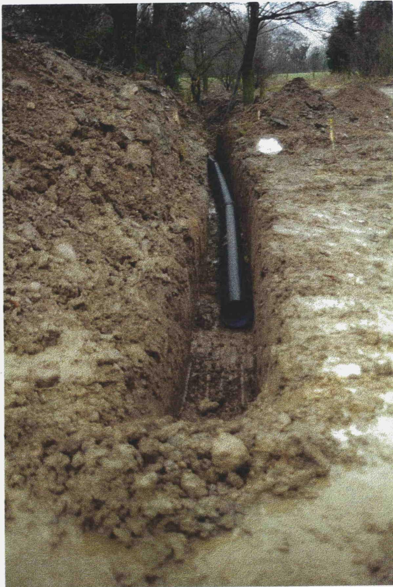
Plate 3. View of Drainage Run S1. Facing west.