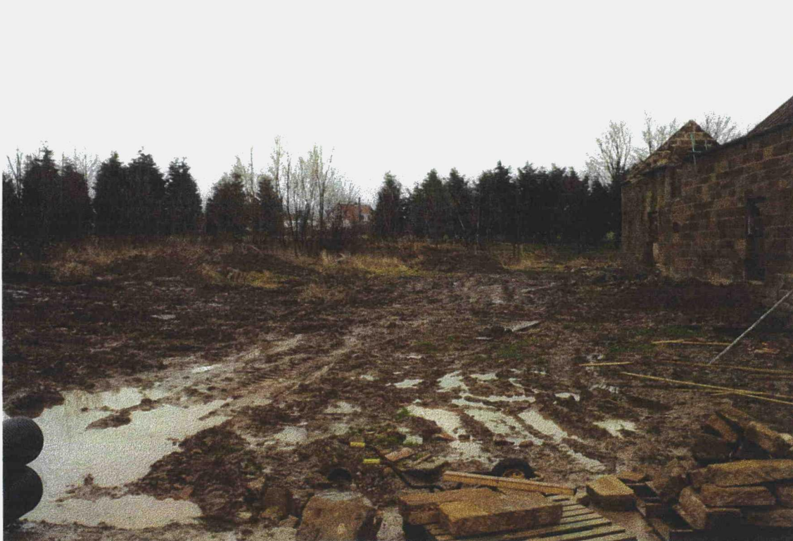
Plate 2. View of area to west of Buildings 2 and 3. Facing north.