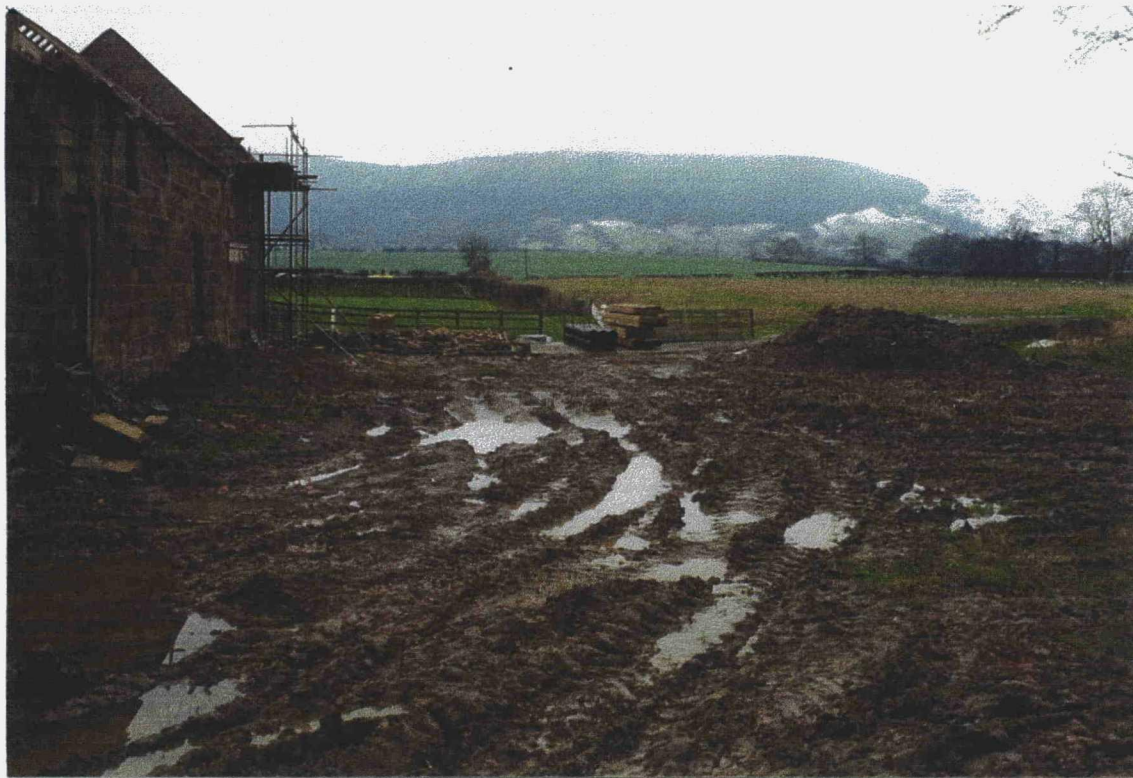
Plate 1. View of area to west of buildings 2 and 3. Facing north.