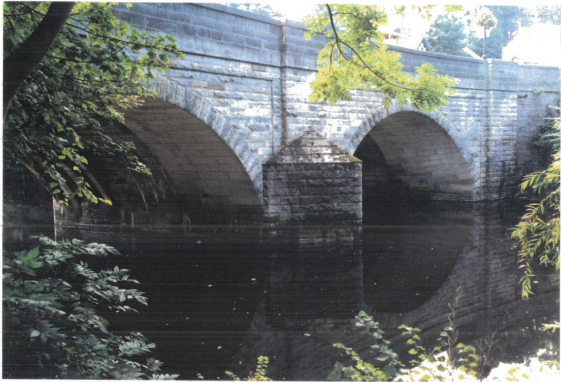
West facing elevation of High Bridge, revealing the three distinct phases of construction