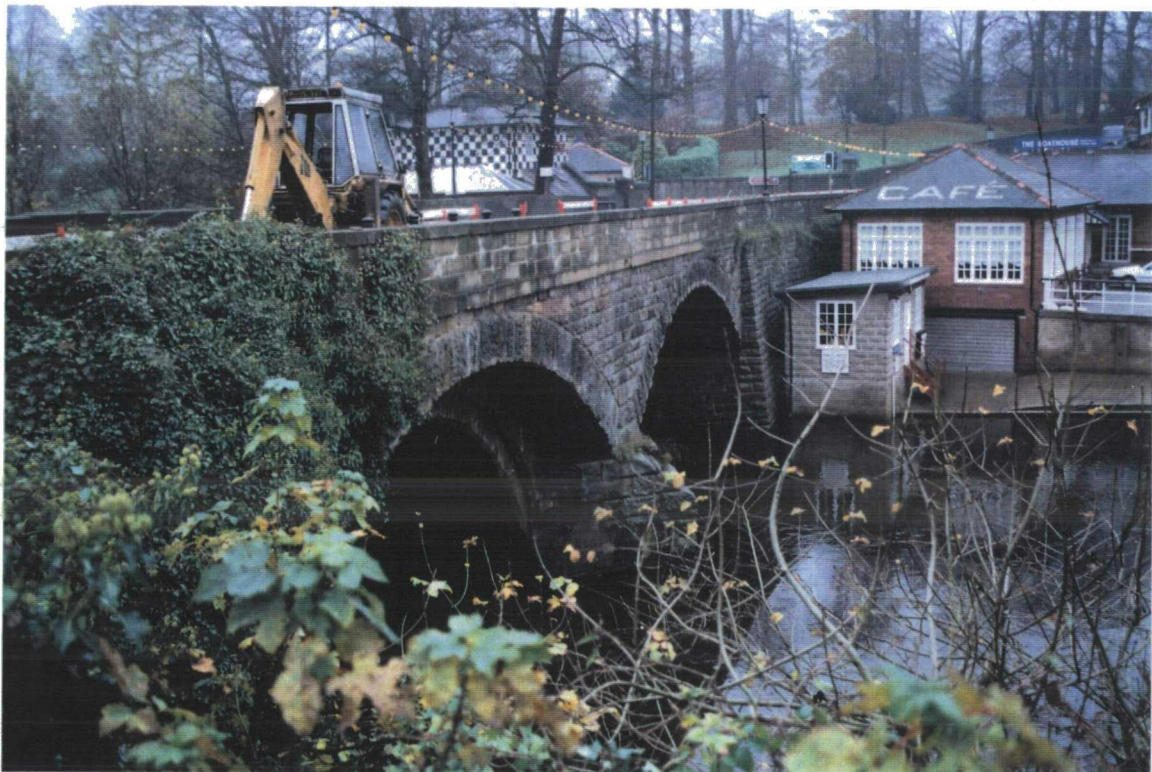
East facing elevation of High Bridge