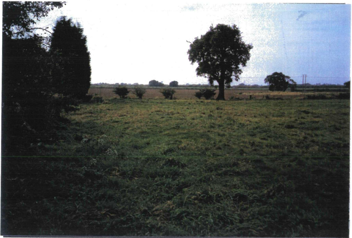
Plate 1. Feature A. Ridge and Furrow. Facing west.