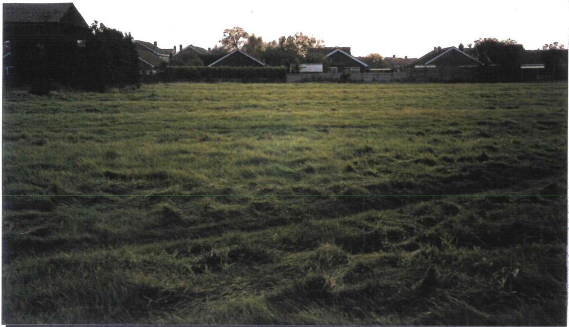
Plate 3. Feature B , facing south.