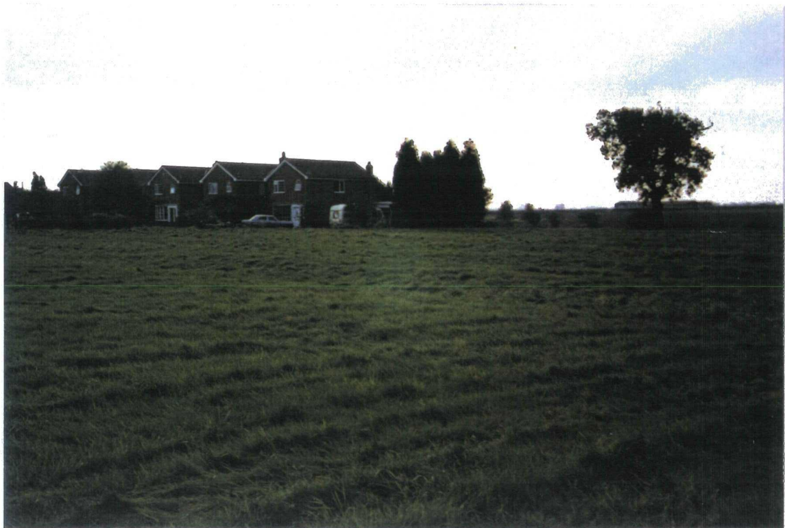
Plate 2 Features A and C. Facing south-west .