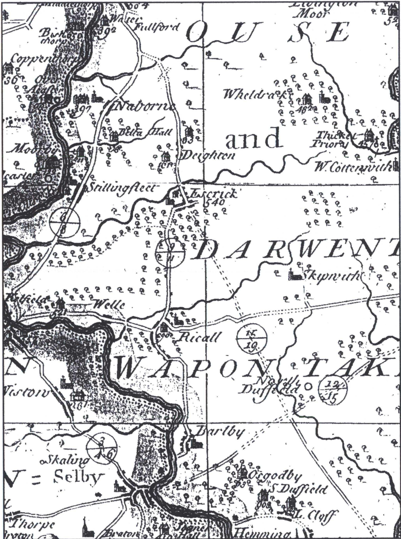
Figure 2. Warburton's map, 1720.