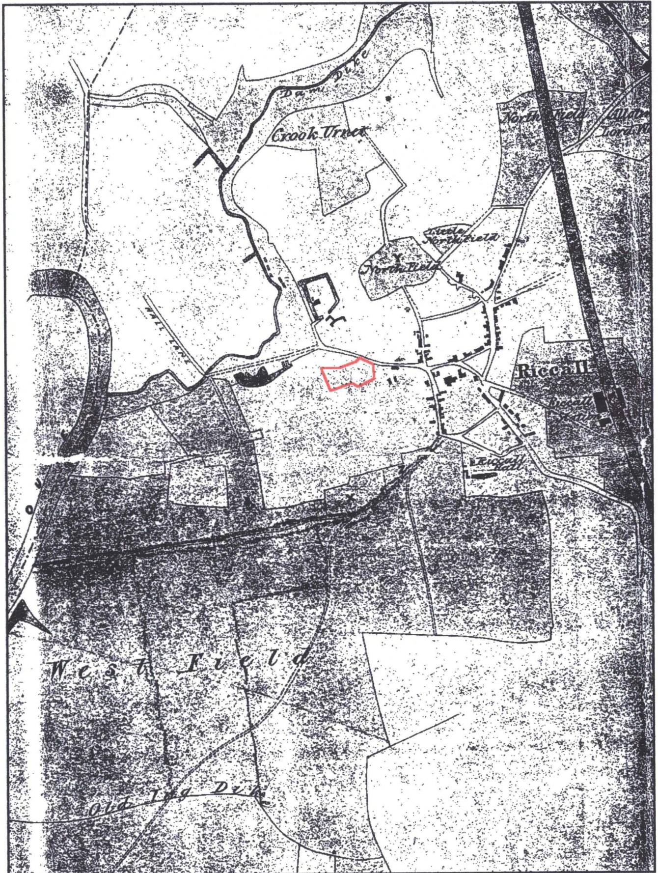
Figure 4. Estate map, 1890.