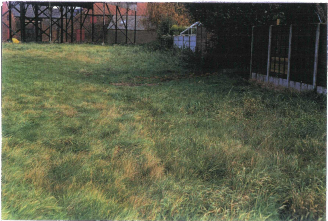
Plate 4. Features B and E. Facing east.