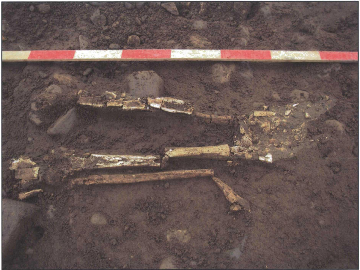
Plate 7. Inhumation SK1, looking north, 2011 (Scale @ 100mm intervals)