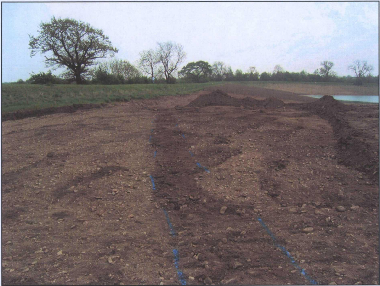
Plate 1. Ditch 1002/1004 looking south, 2006