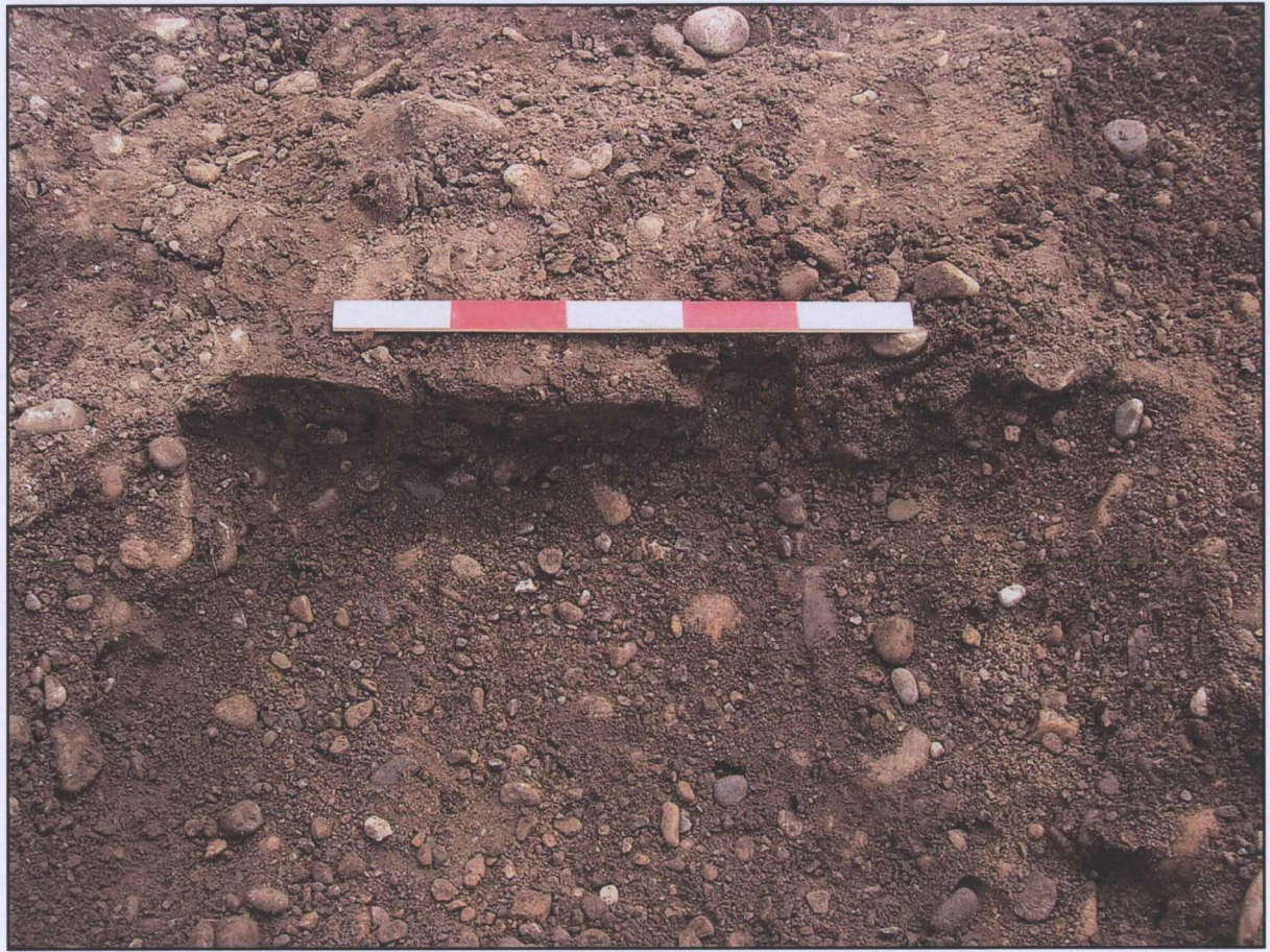
Plate 3. Section of Ditch 1008, looking north, 2007