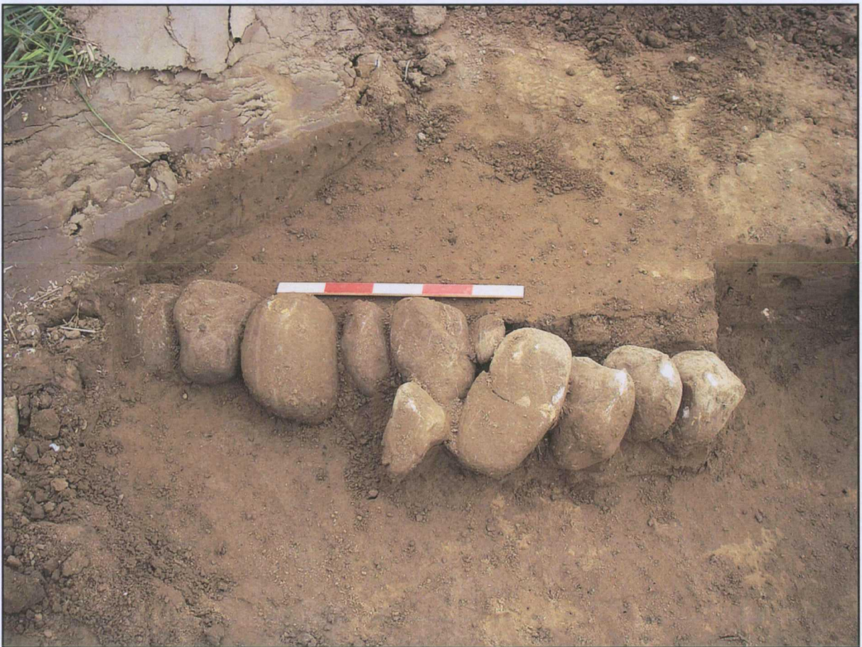
Plate 6. Linear stone feature 1021, looking south, 2009