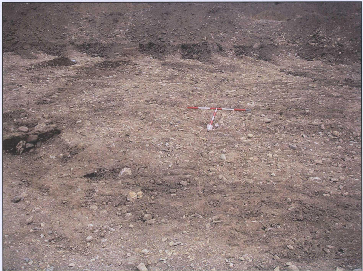
Plate 4. Corner of Ditch 1008, looking north, 2007