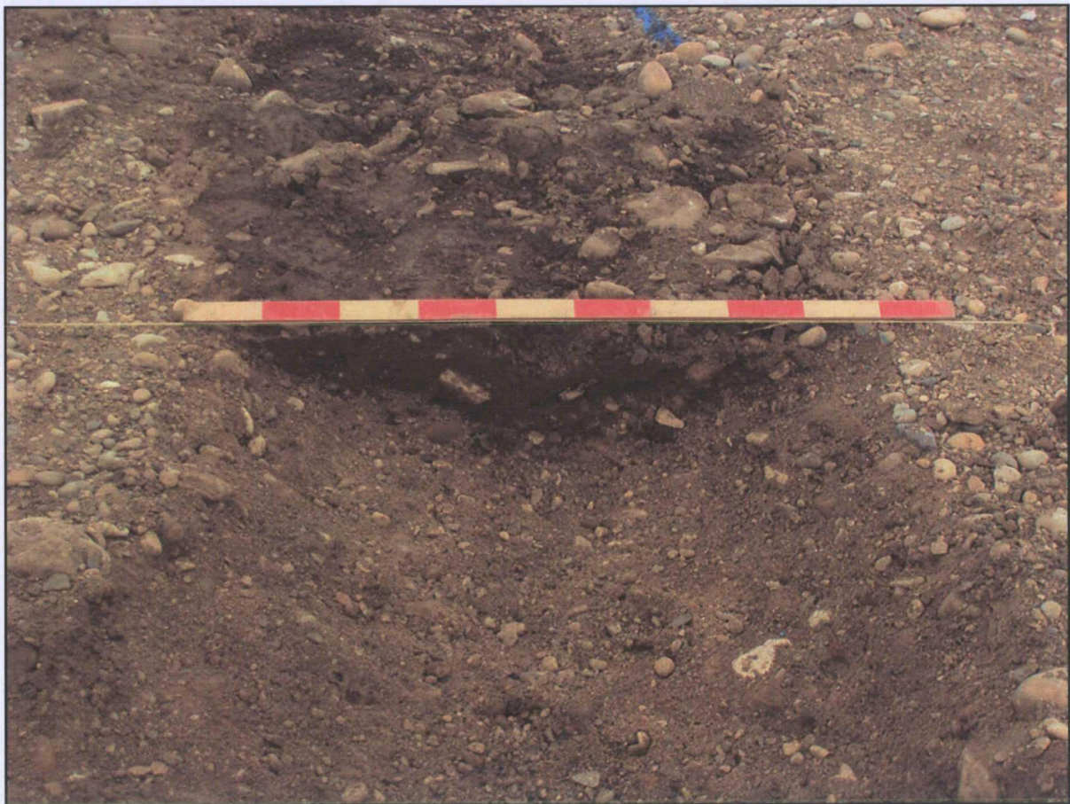
Plate 2. Section through Ditch 1002, looking north, 2006