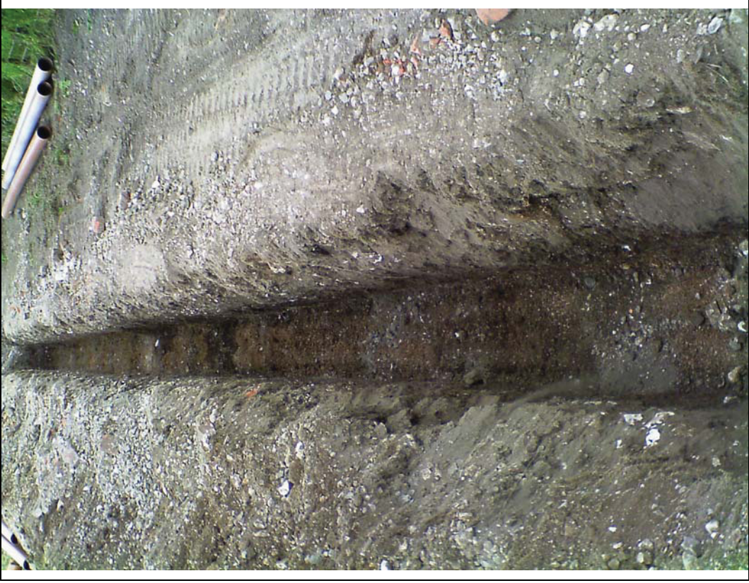
Plate 3. Drainage Trench. Facing South-west.