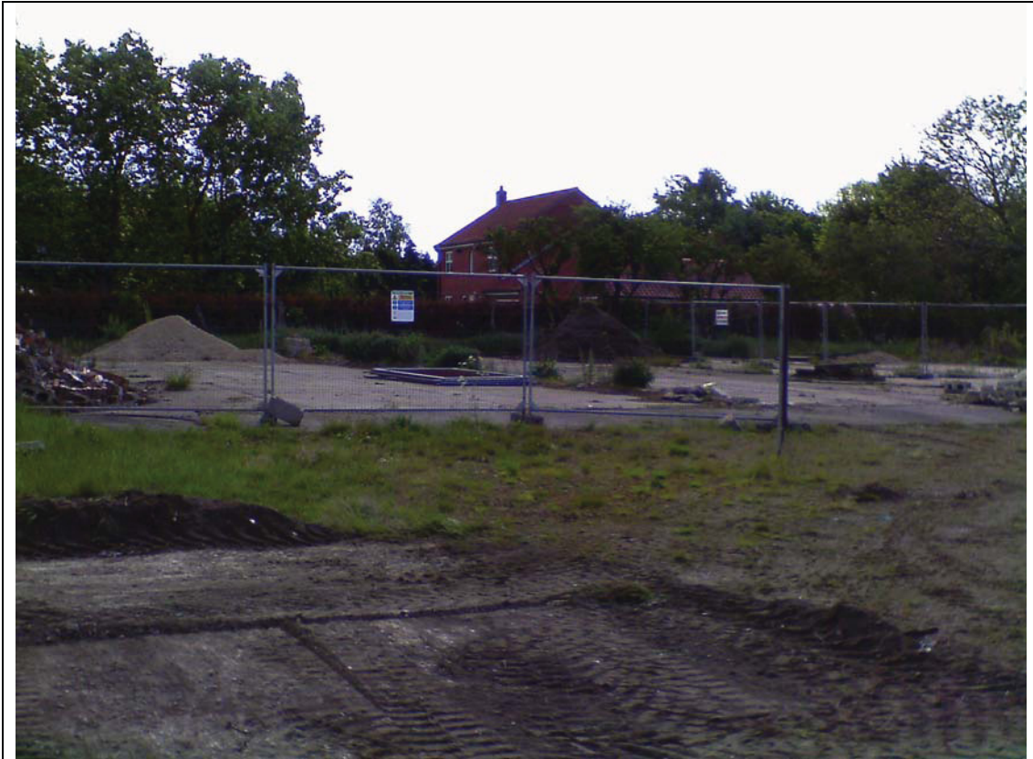
Plate 1. Proposed Development Area. Facing North-east.