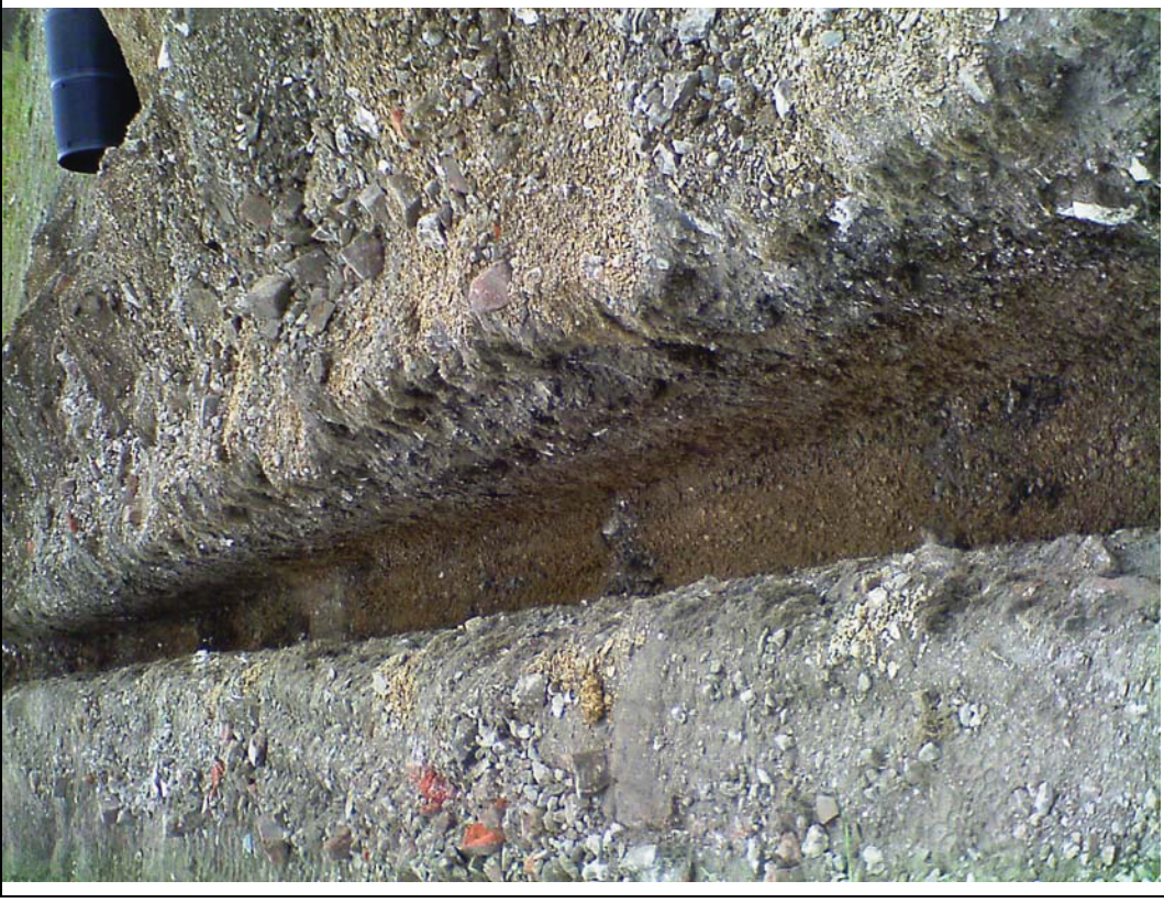
Plate 4. Drainage Trench. Facing North-west.