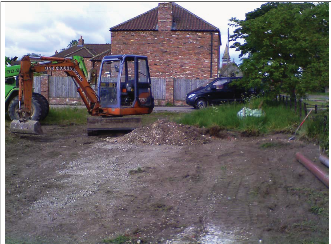
Plate 2. Proposed Development Area. Facing South-west.