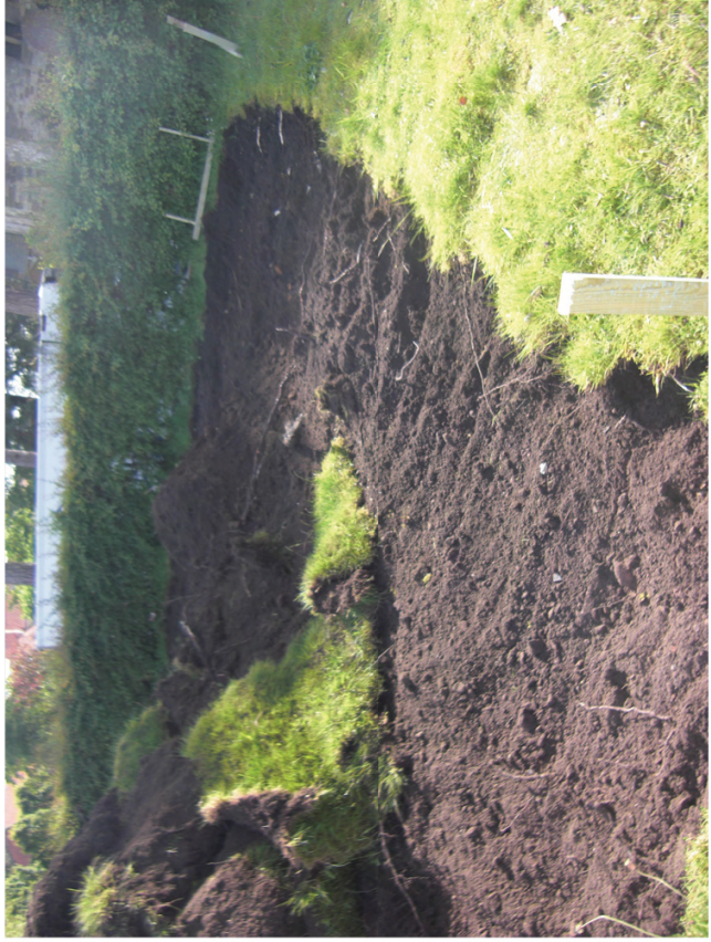
Plate 1. Topsoil Strip. Facing East.