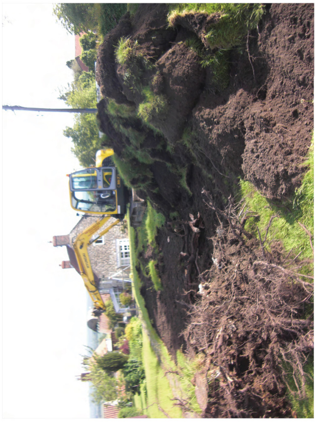
Plate 2. Topsoil Strip. Facing North.