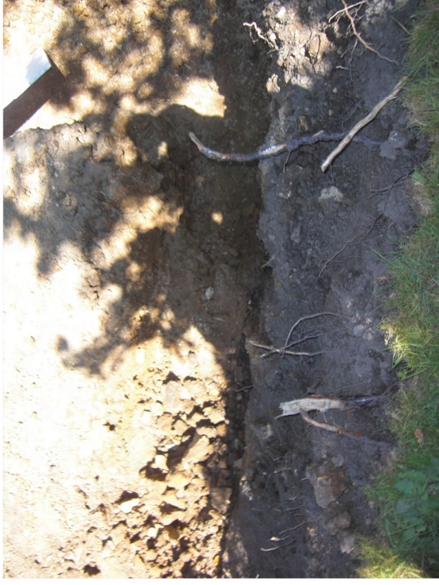
Plate 6. View of Footings.