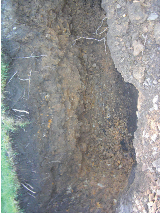
Plate 5. View of Footings.