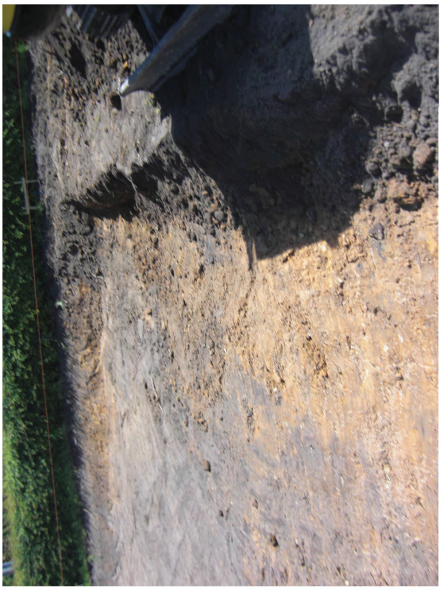
Plate 4. View of area of Footings.