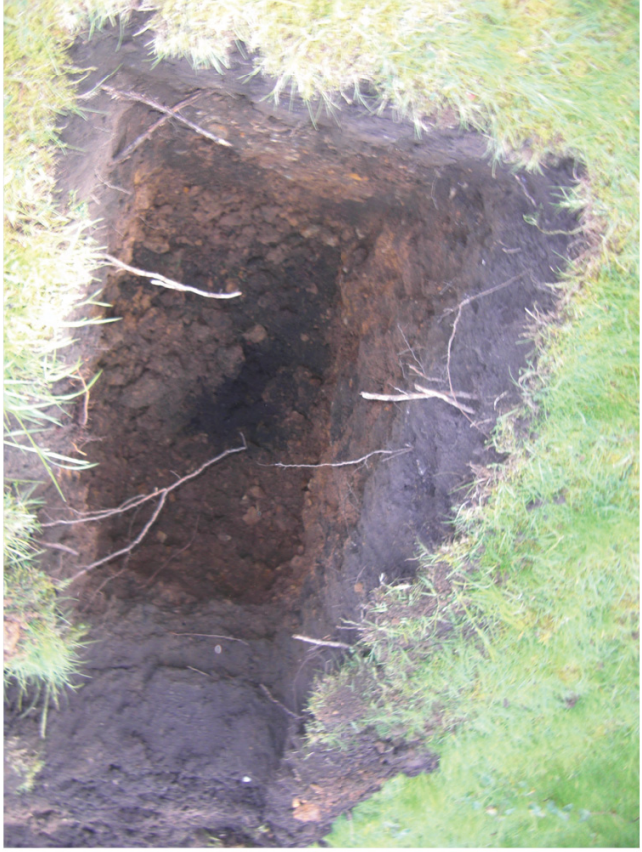
Plate 3. Testpit to show depth of foundation.