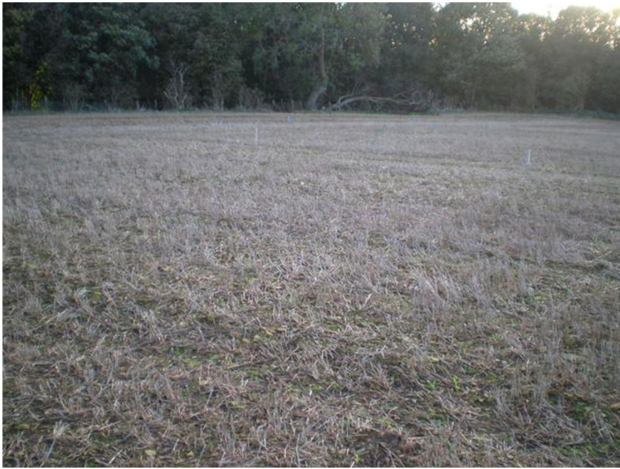
Plate 1. General View of Site. Facing South-east.