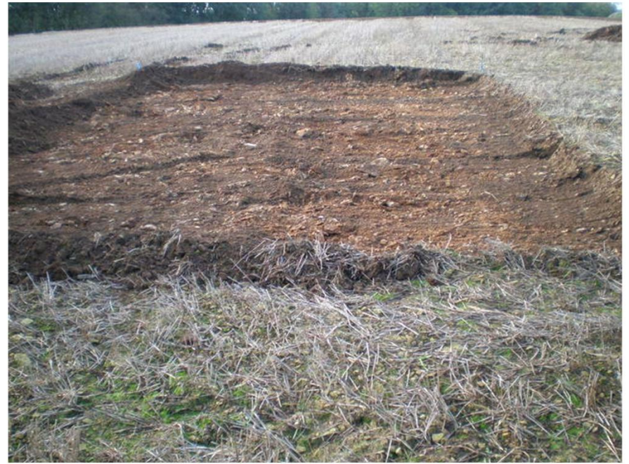
Plate 4. Garage Boundary after Topsoil Strip. Facing South-west.