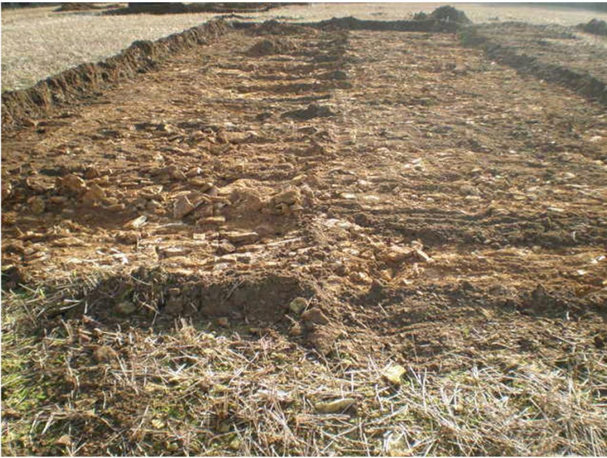
Plate 3. Plot Boundary after Topsoil Strip. Facing South-east.