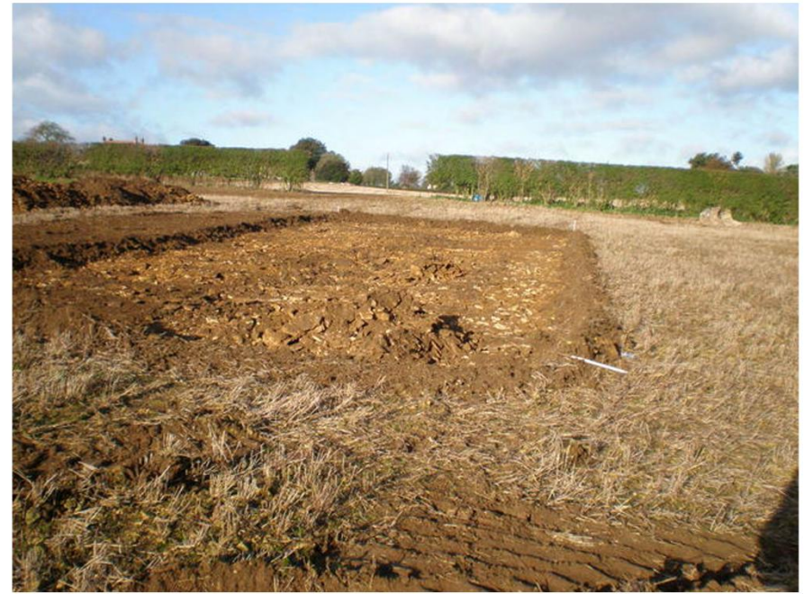
Plate 2. Plot Boundary after Topsoil Strip. Facing North-west.