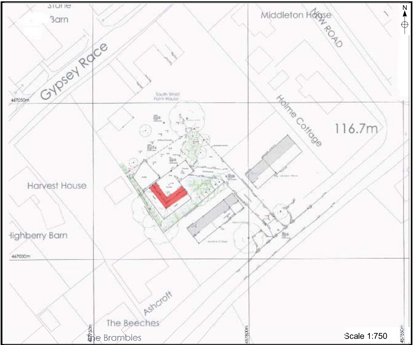
Figure 2. Location of Archaeological Watching Brief.