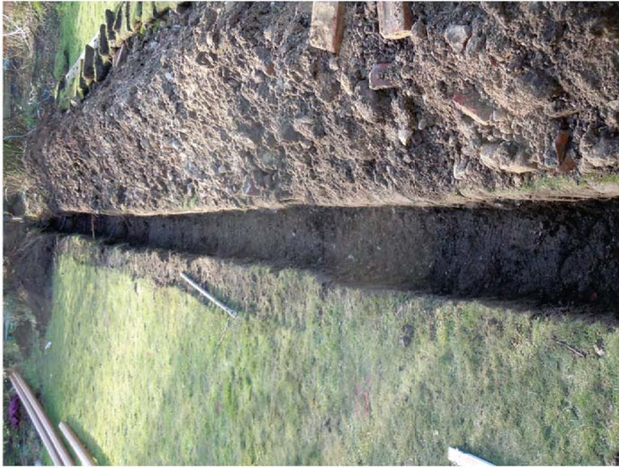
Plate 5. Service Trench. Facing West.