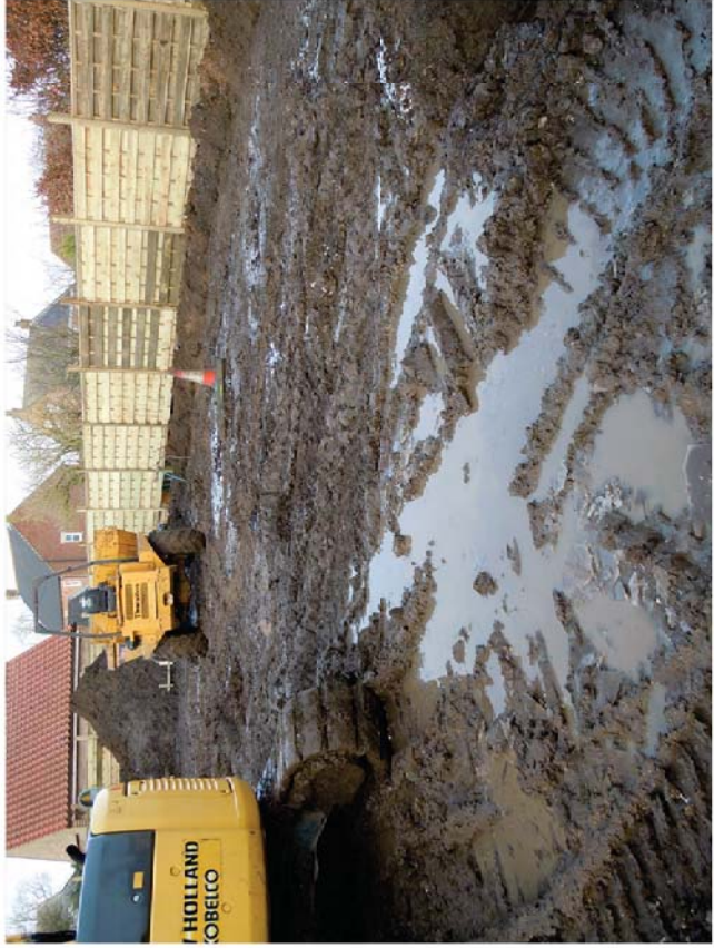
Plate 1. Site Pre-excavation. Facing North-west.