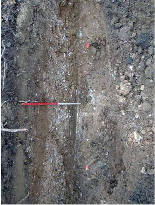
Plate 3. Southern Foundation Trench. Facing South.