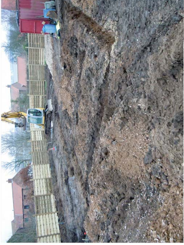
Plate 4. Completed Foundations. Facing North-east.