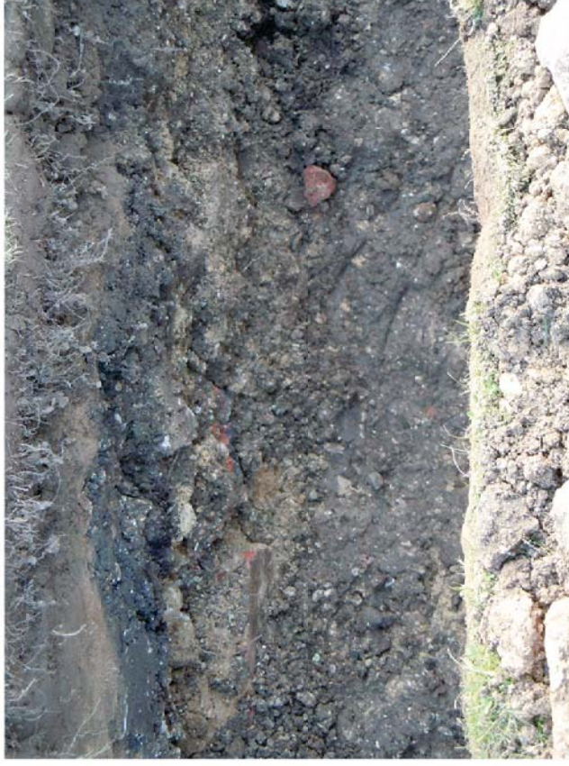
Plate 6. Service Trench showing Demolition Rubble. Facing North.