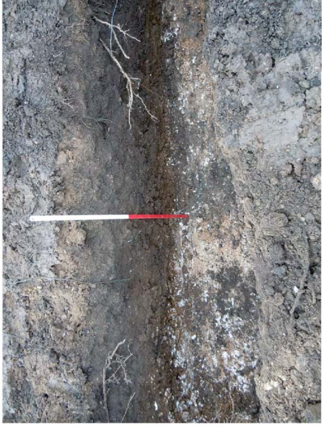
Plate 2. Foundations at North of Site. Facing North.