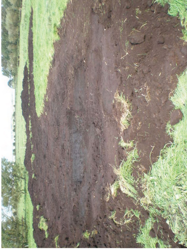
Plate 4, Scrape from Eastern end of Site. Facing North.