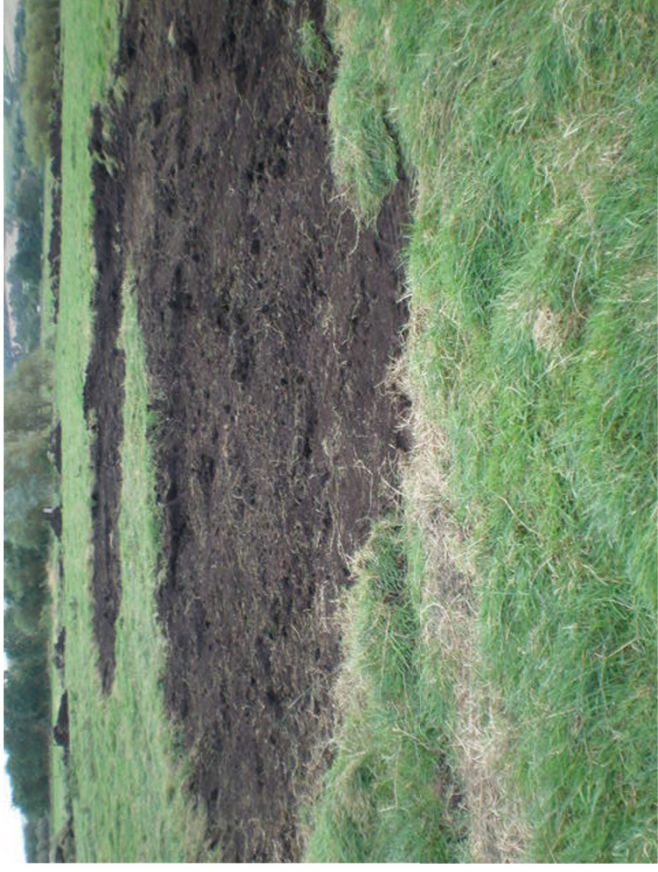
Plate 6. Scrape from Western end of Site. Facing South-east.