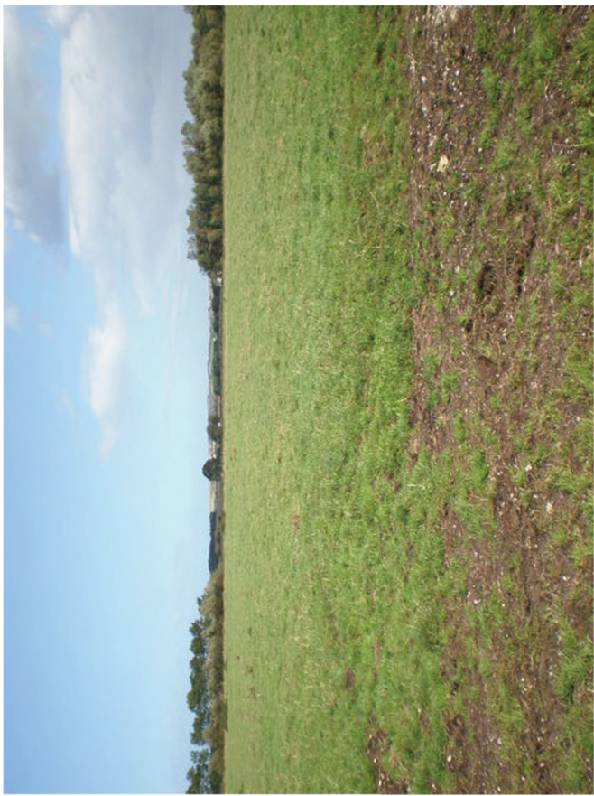
Plate 2. General View of Site. Facing East.