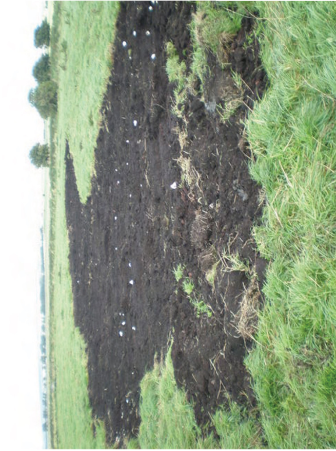
Plate 3. Scrape from Northern end of Site. Facing North-west.