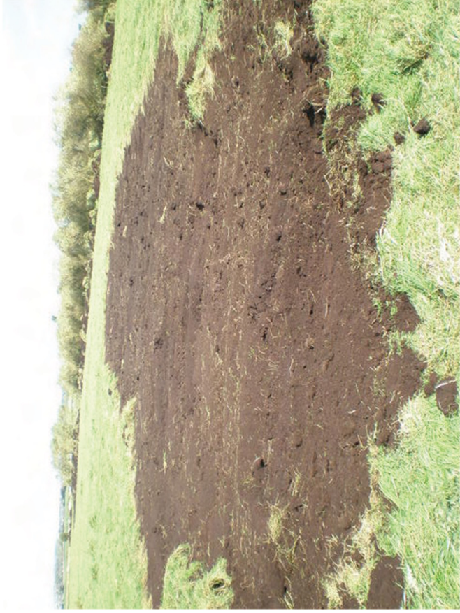
Plate 5. Scrape from Southern end of Site. Facing North-east.