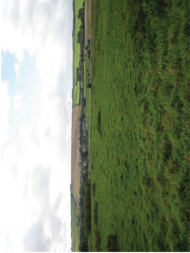
Plate 1. General View of Site. Facing South.