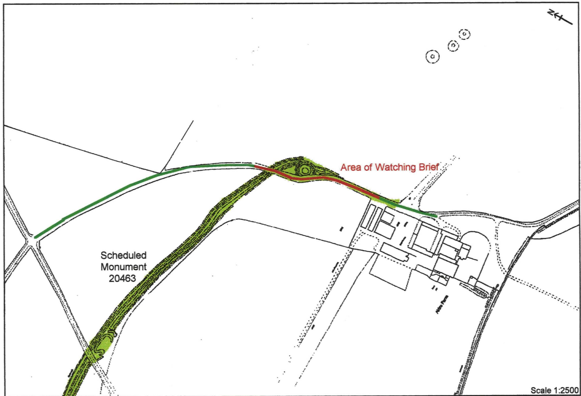
Figure 3. Location of Trench.