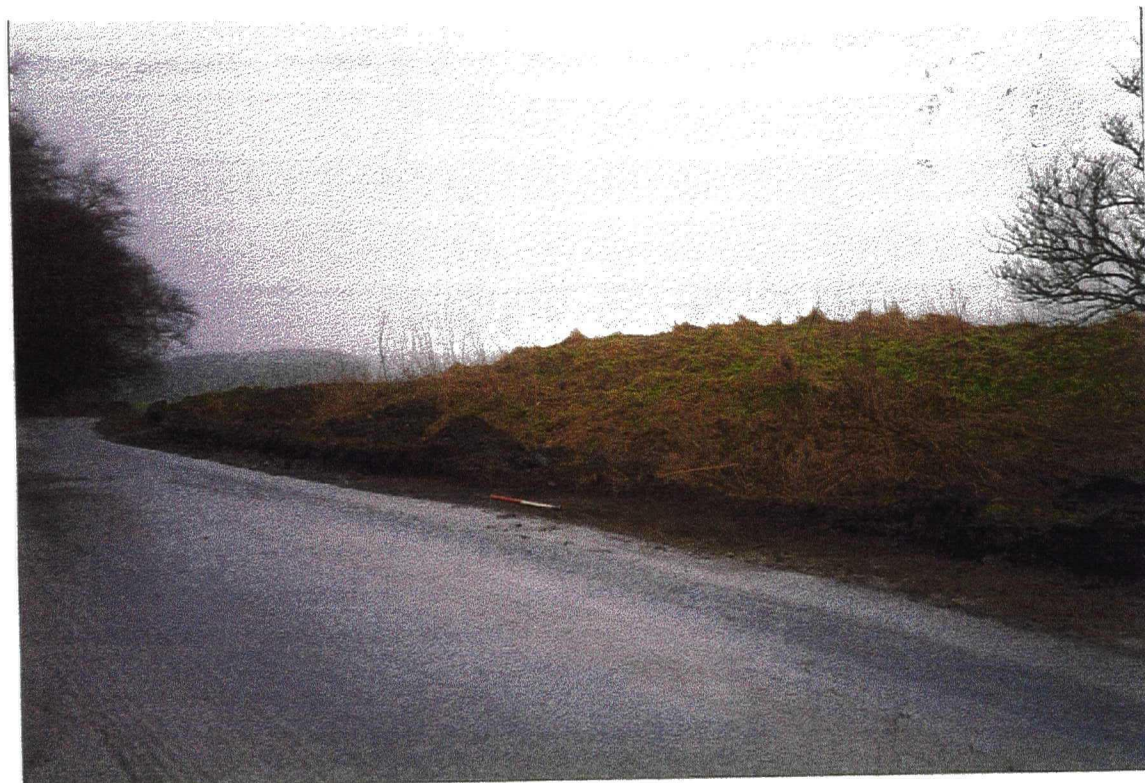
Plate 2. Aldro Rath Barrow, Showing Truncation by Road. Facing North-East.