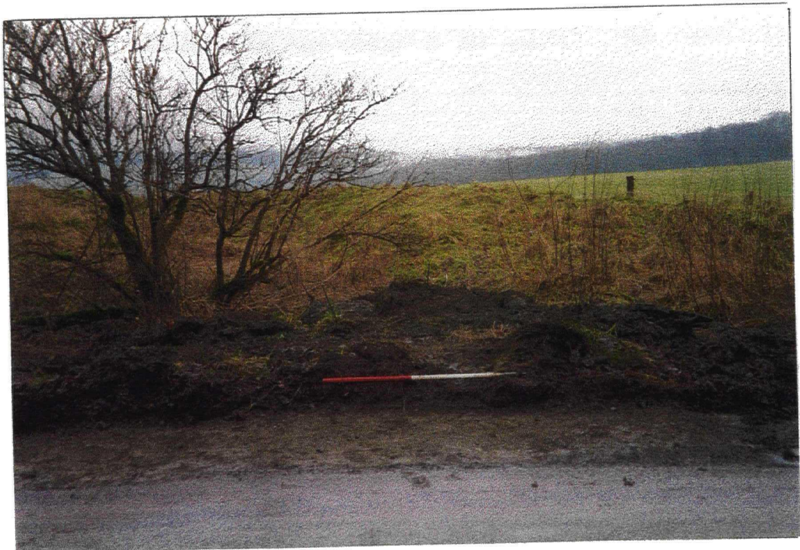
Plate 4. Aldro Rath: Southern Arm of Barrow Bank. Facing East.