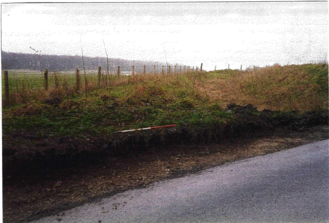
Plate 6. Section Through Northern Earthwork Bank. Facing East.