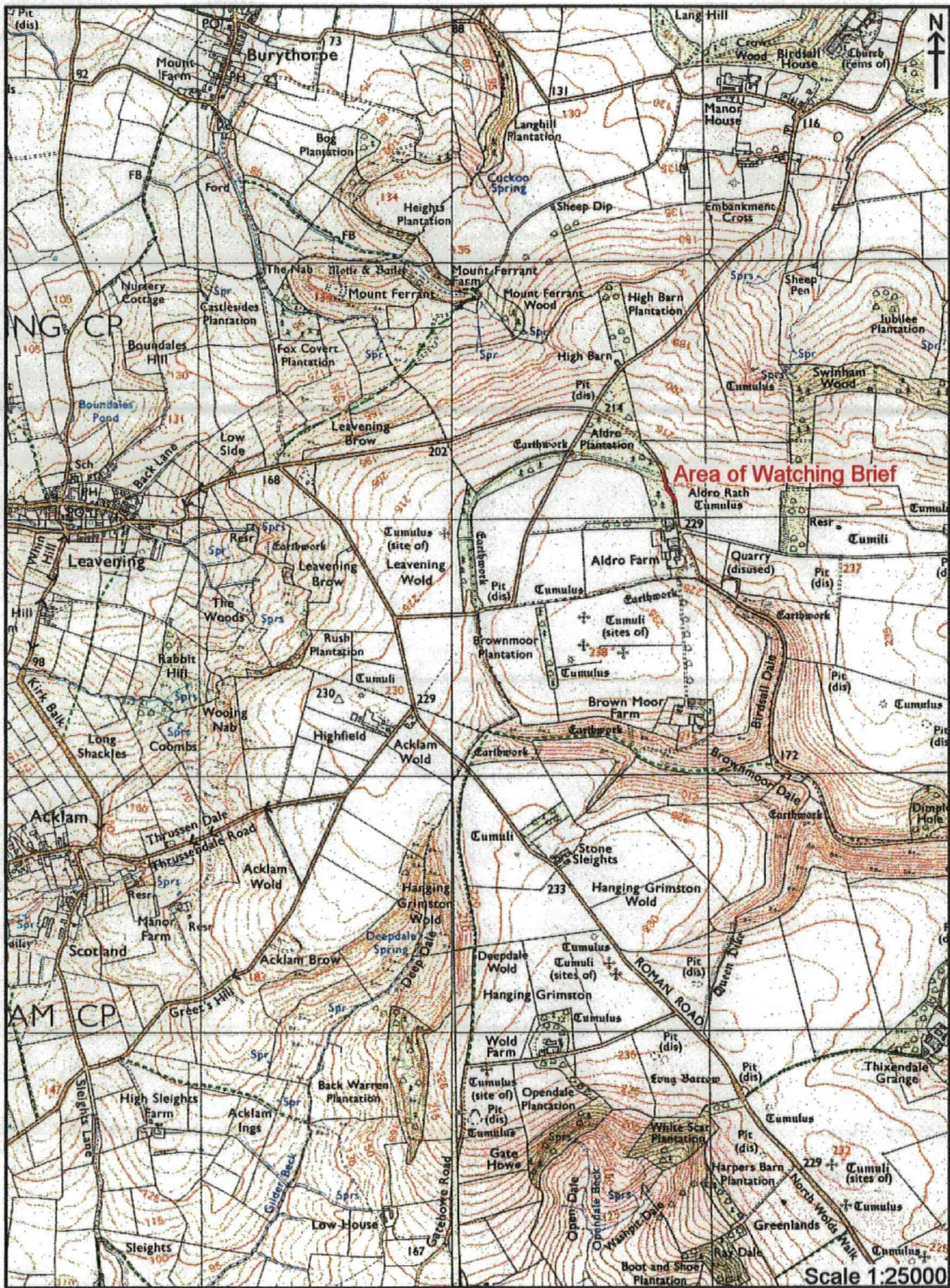
Figure 1. Site Location.