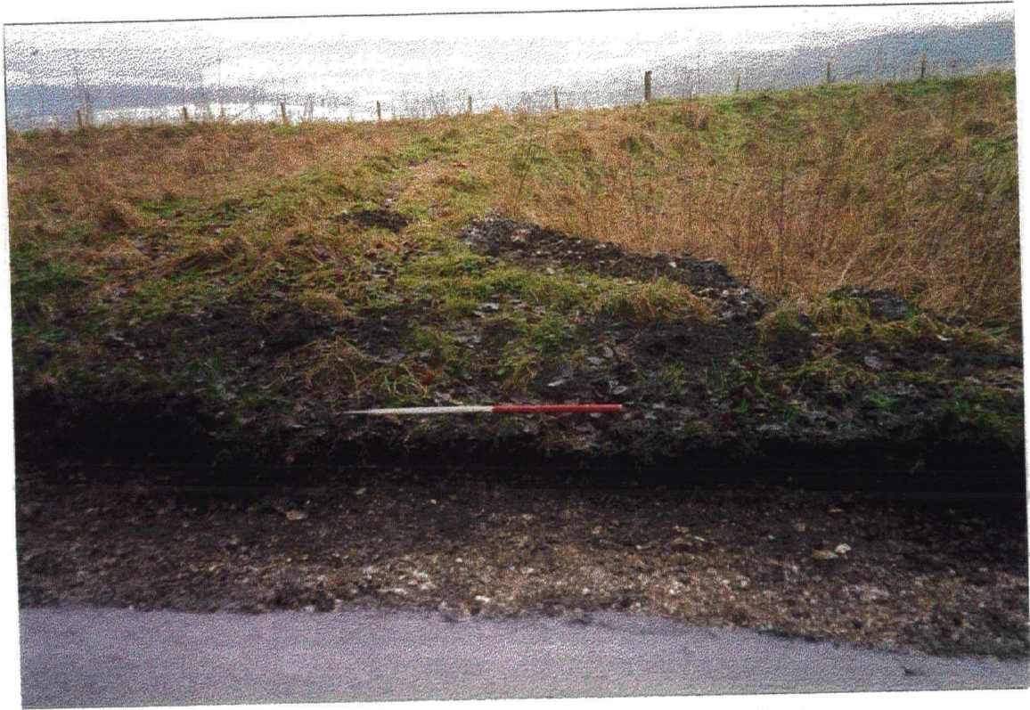
Plate 3. Aldro Rath: Northern Arm of Barrow Bank. Facing East.