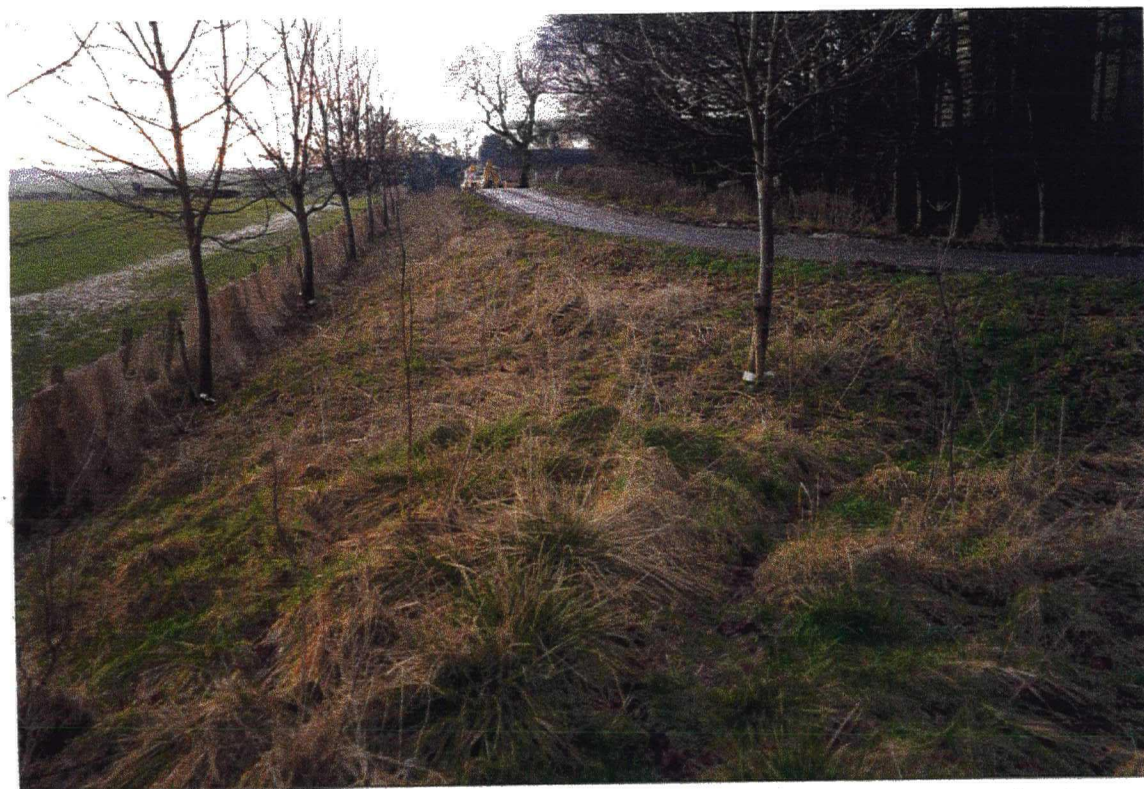
Plate 1. View Showing Southern End of Linear Earthwork and Road Embankment. Facing South.