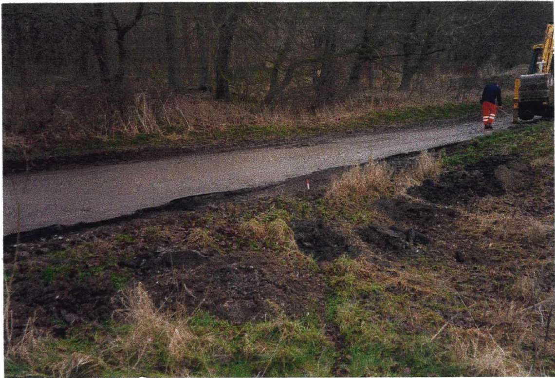
Plate 5. View of Infilled Earthwork Ditch. Facing North-West.