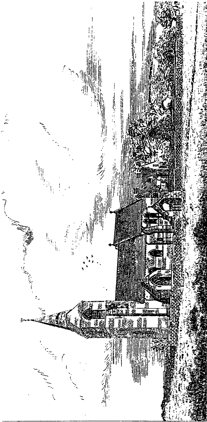
Figure 3: St. Peter's Church, Helpertorpe, circa 1880. Note Vicarage to the right of the church.