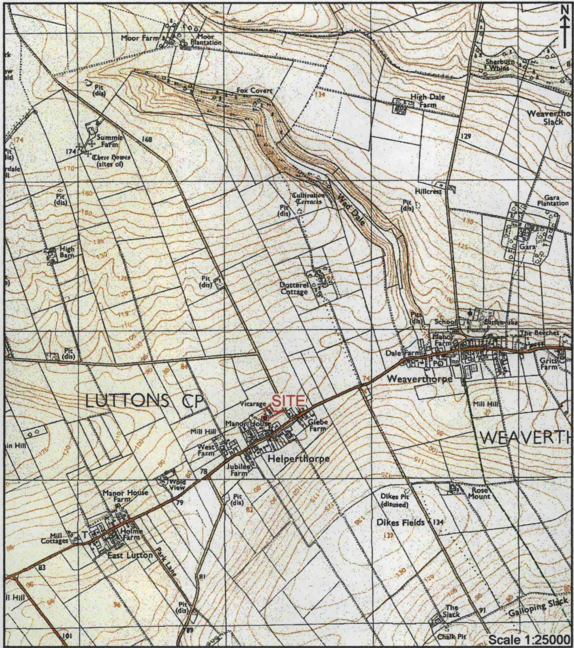
Figure 1. Site Location Map.