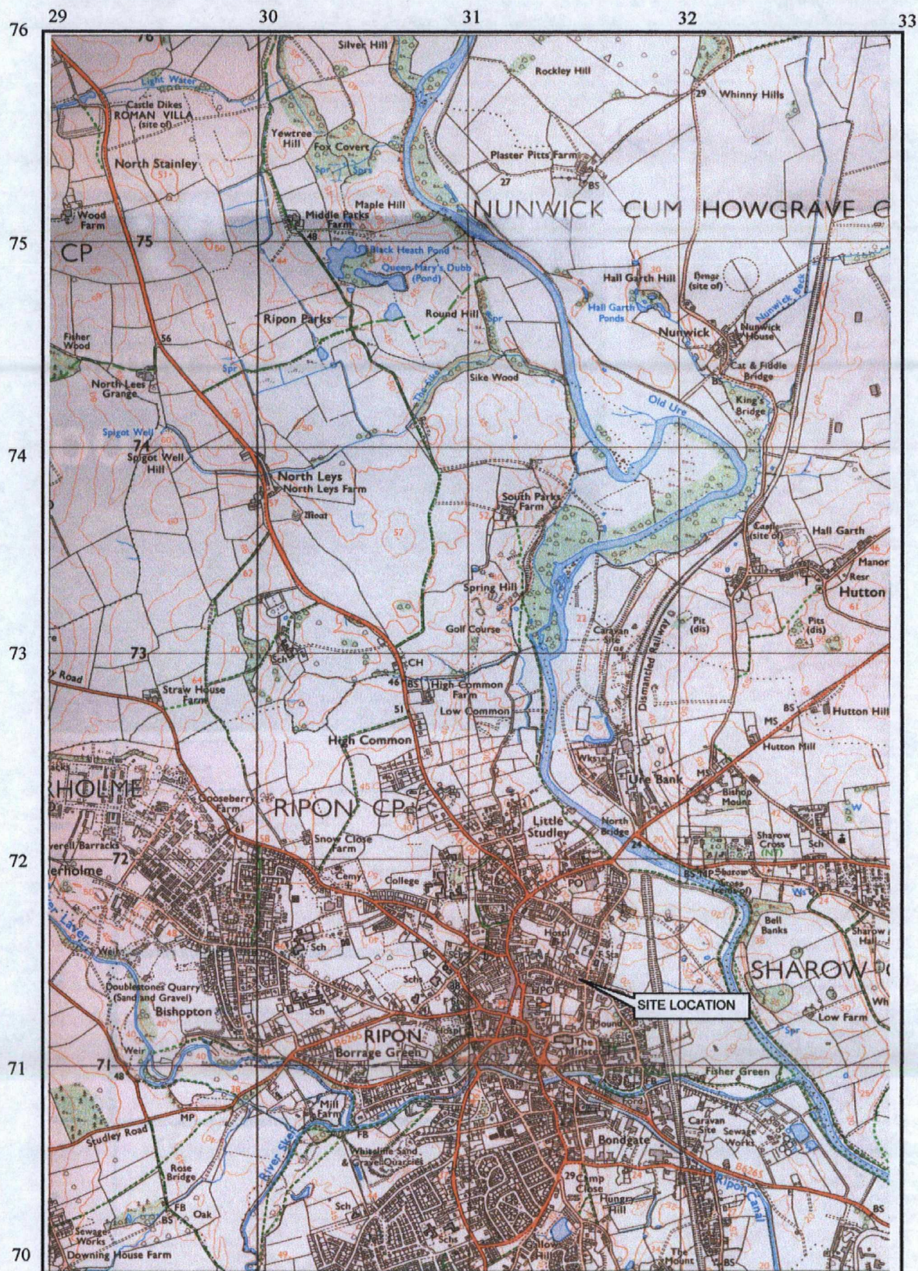
Figure 1. Site Location (NGR: SE 3154 7140)

Reproduced from the 1985 Ordnance Survey 1:25000 maps with the permission of The Controller of Her Majesty's Stationery Office. © Crown copyright. OSA Licence No: AL 52132A0001