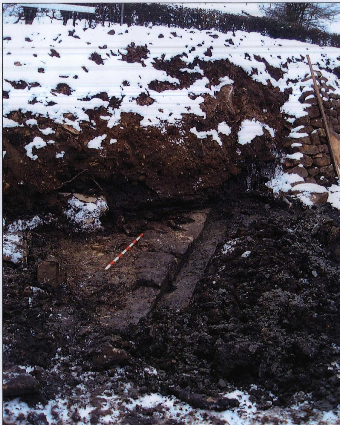
Plate 19. Tr 41, wall 4110.