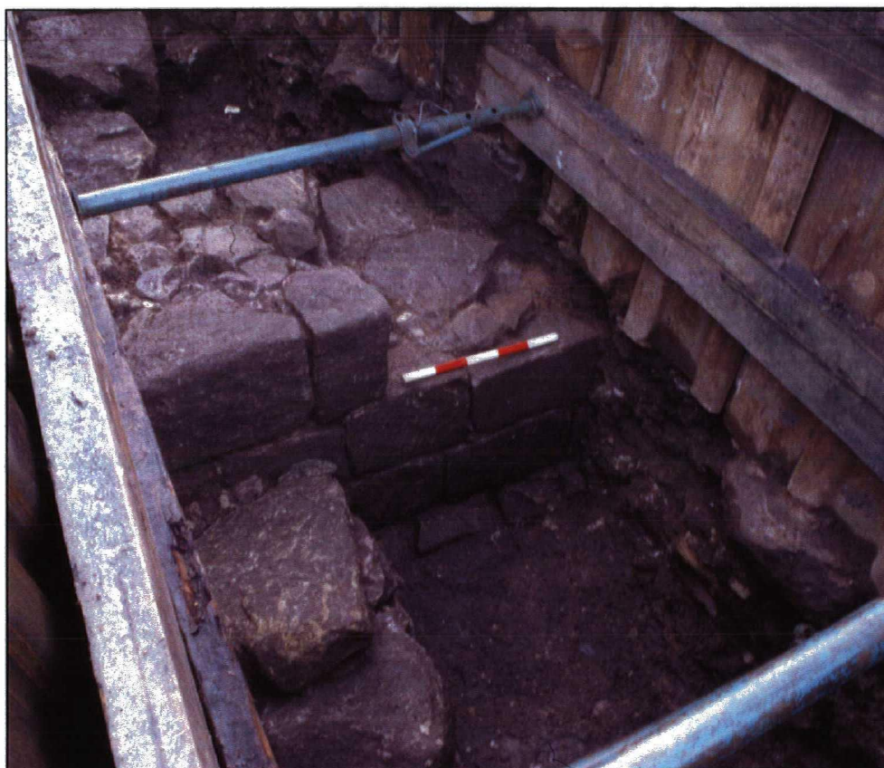
Plate 16. Tr 30, wall 3014.