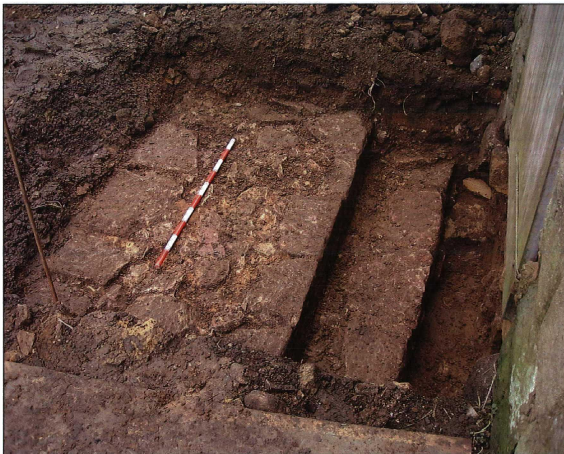
Plate 14. Tr 33, wall 3321.