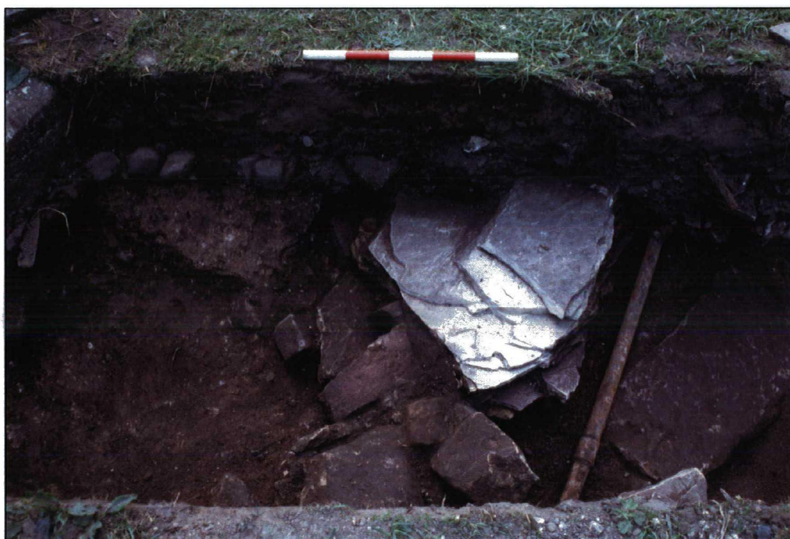
Plate 15. Tr 15, wall/rubble 1556.