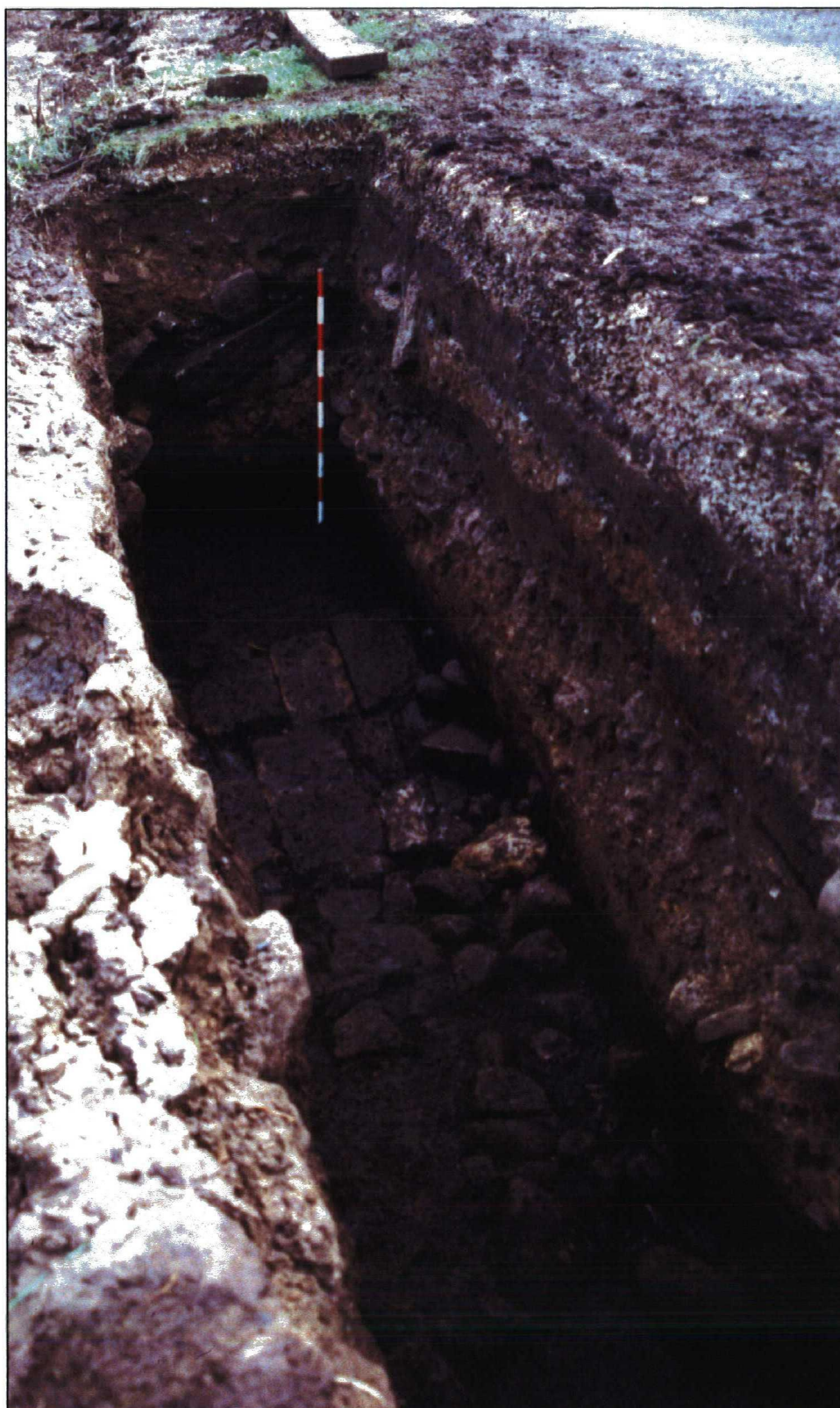
Plate 18. Tr 24, surface 2414.