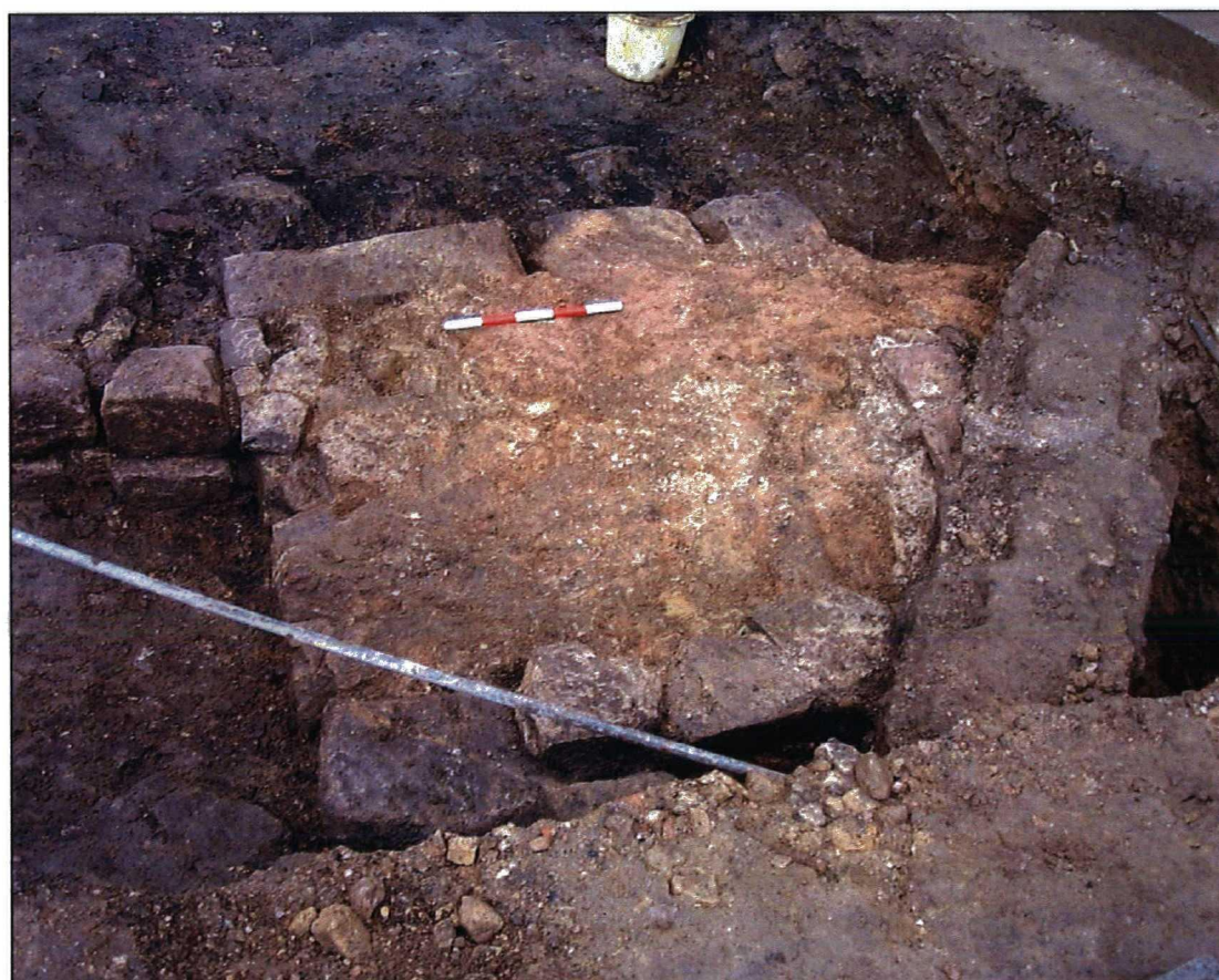
Plate 12. Tr 44, foundation 4480/4481.