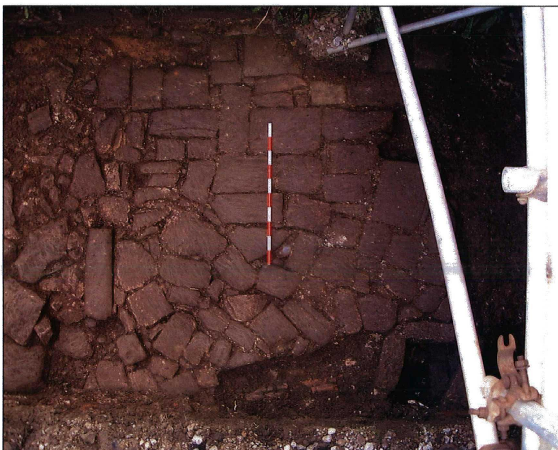
Plate 8. Tr 44, stone surfaces 4420 outside G8 doorway.