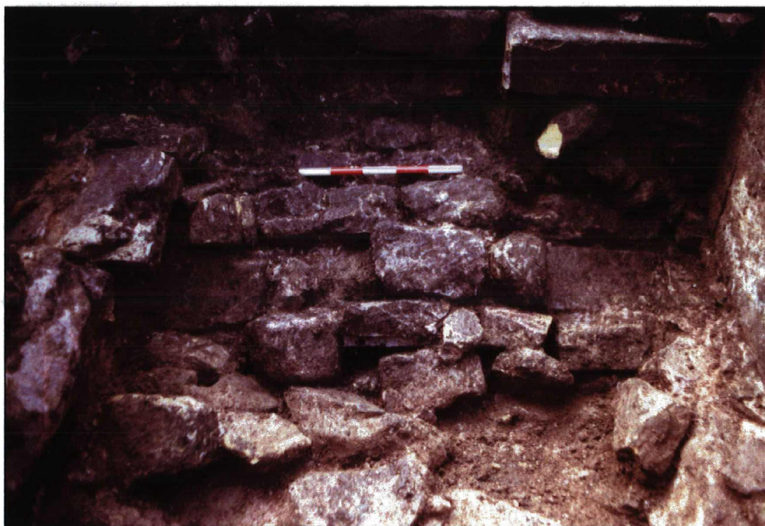
Plate 7. Tr 44, South culvert, 4390.