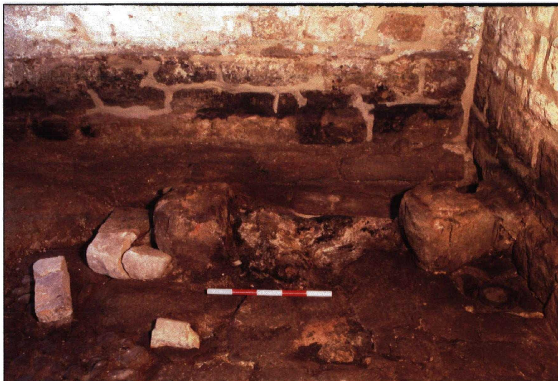
Plate 3. Room G1, cobble hearth 2711.