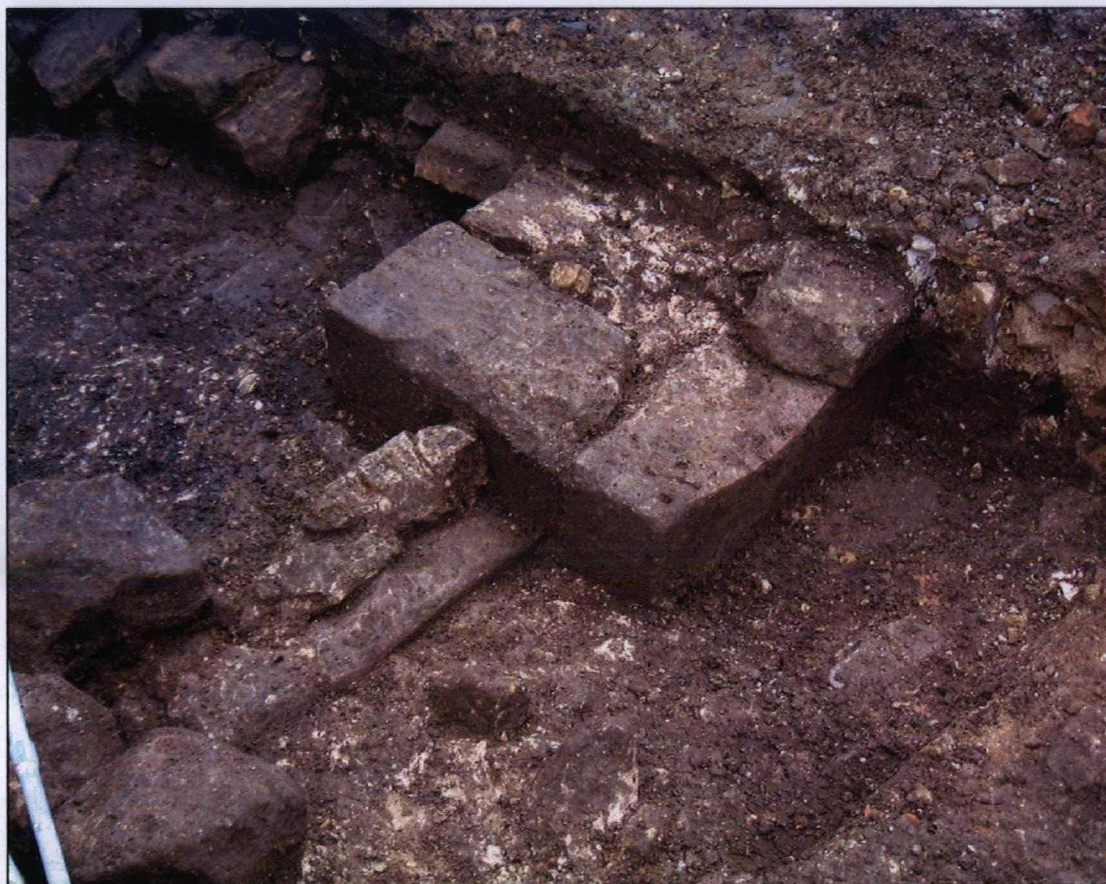
Plate 10. Tr 44, wall 4468.