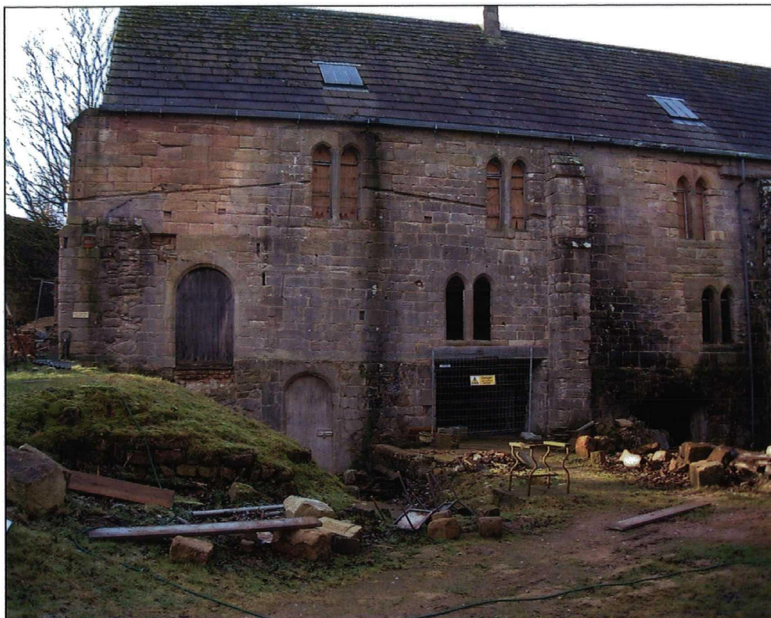
Plate 11. East wall of mill, showing roof scar.