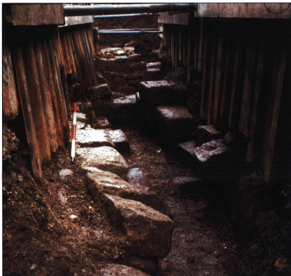
Plate 17. Tr 17/30, walls 3015 etc.