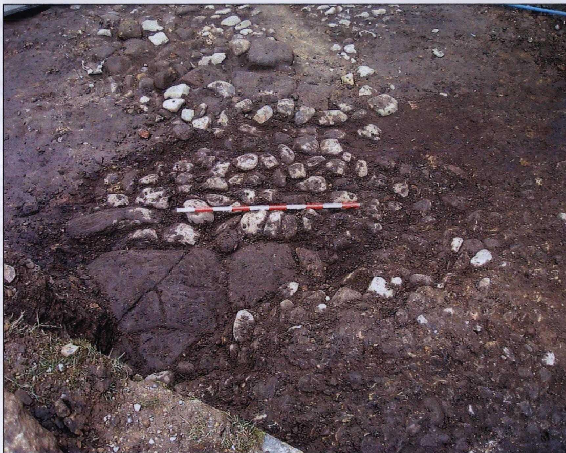
Plate 9. Tr 44, cobble trackway 4425.