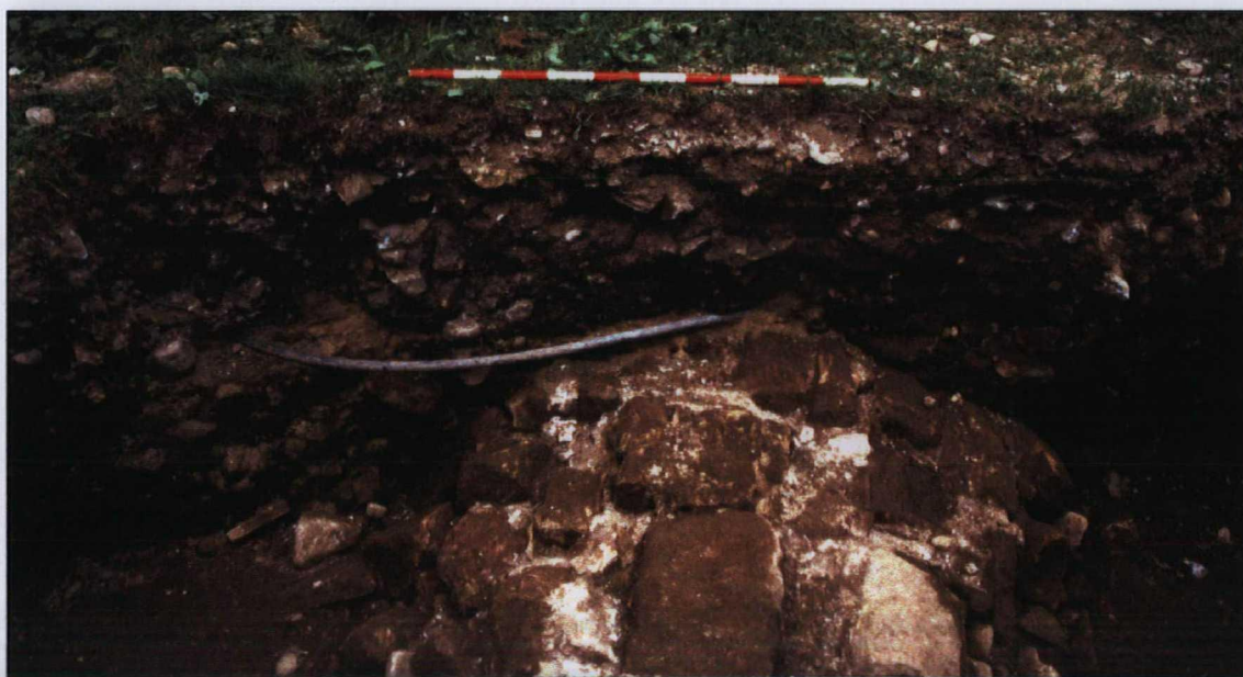
Plate 6. Tr 1 North culvert 1006.