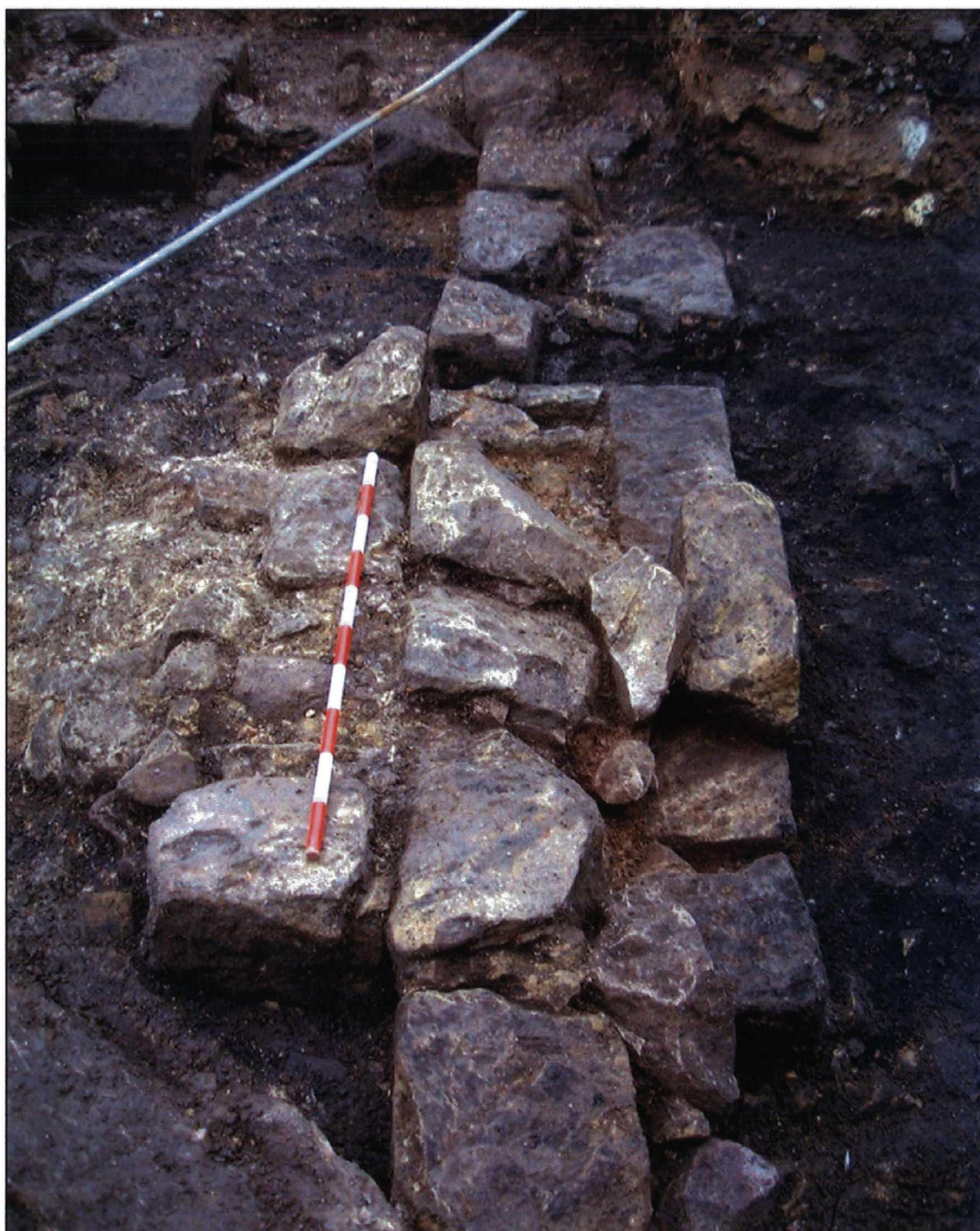
Plate 13. Tr 44, walls 4470, 4477 and 4494.