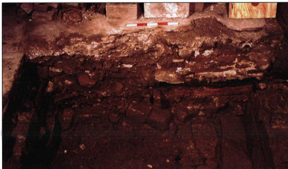
Plate 4. Tr 11, Foundations 1122 and 1121.