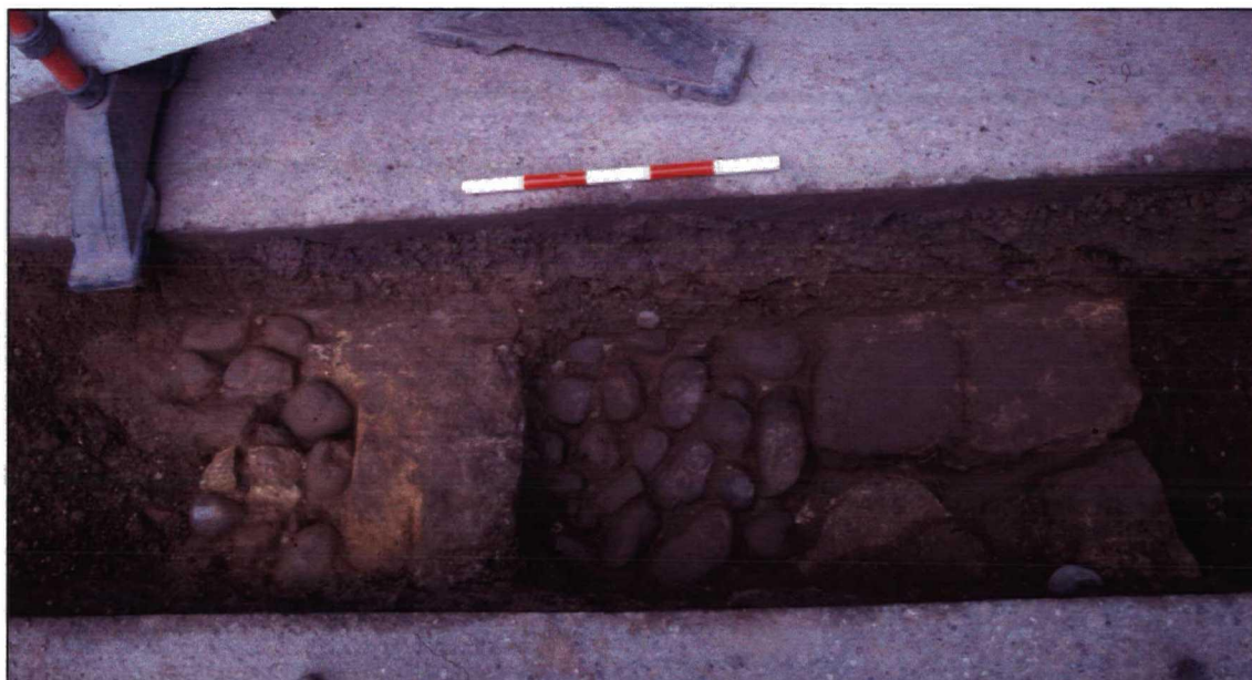
Plate 28. Tr 20, cobbles 2014 and 2016, kerb 2015 and surface 2013