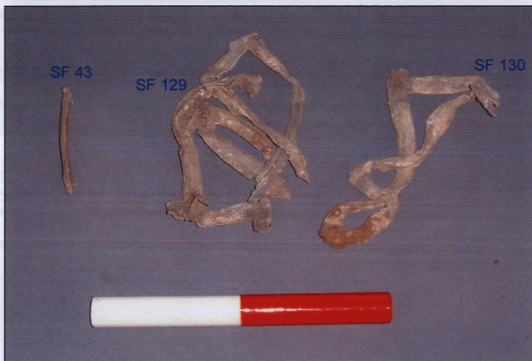
Plate 30. Lead window comes, SF Nos. 43, 129, 130.