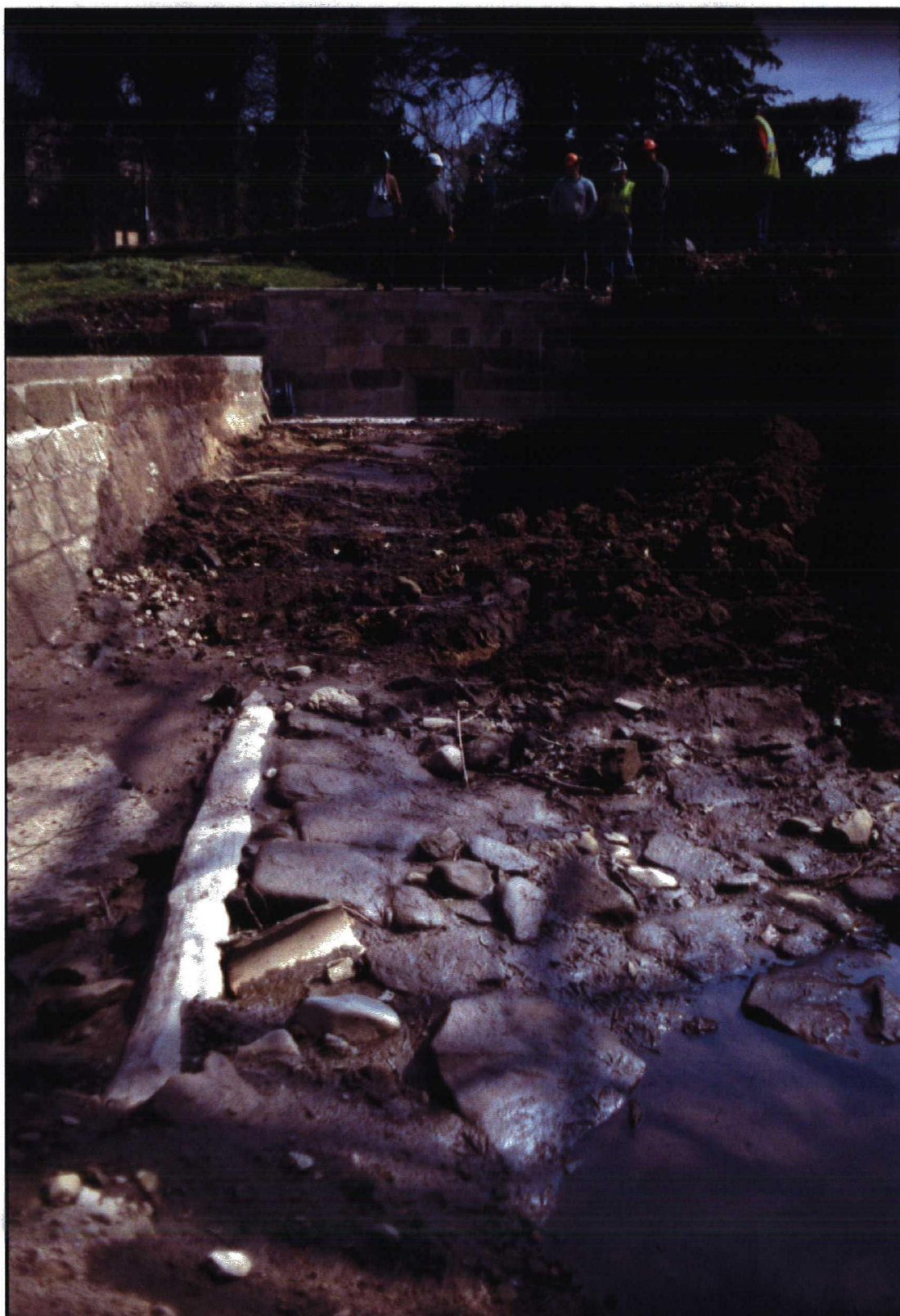
Plate 22. Timber beam and stone surface to the west of tr 42.