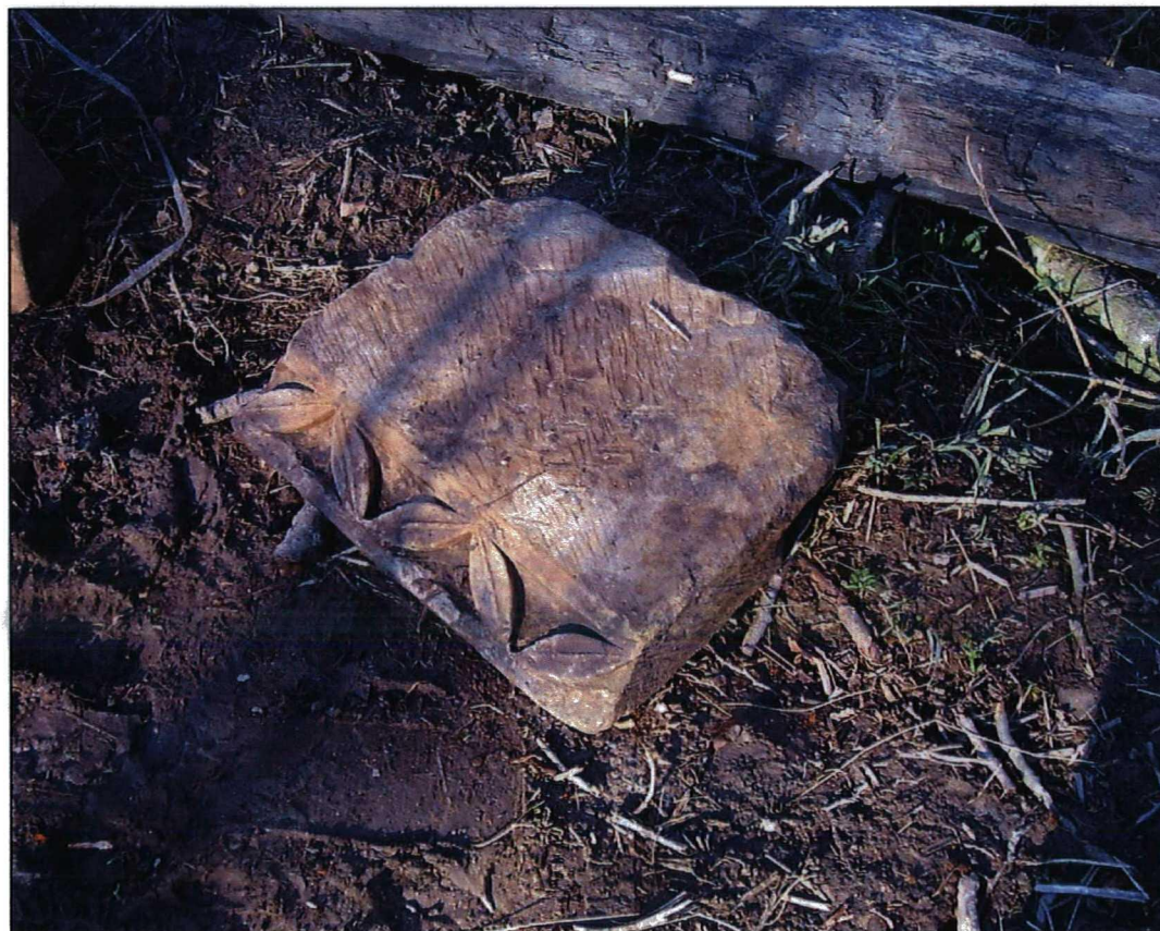
Plate 24. Architectural fragments retrieved from 4211.