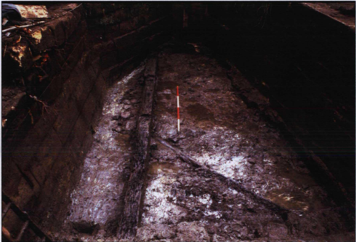
Plate 21. Tr 42, timber piles 4222 and beams 4213/4214