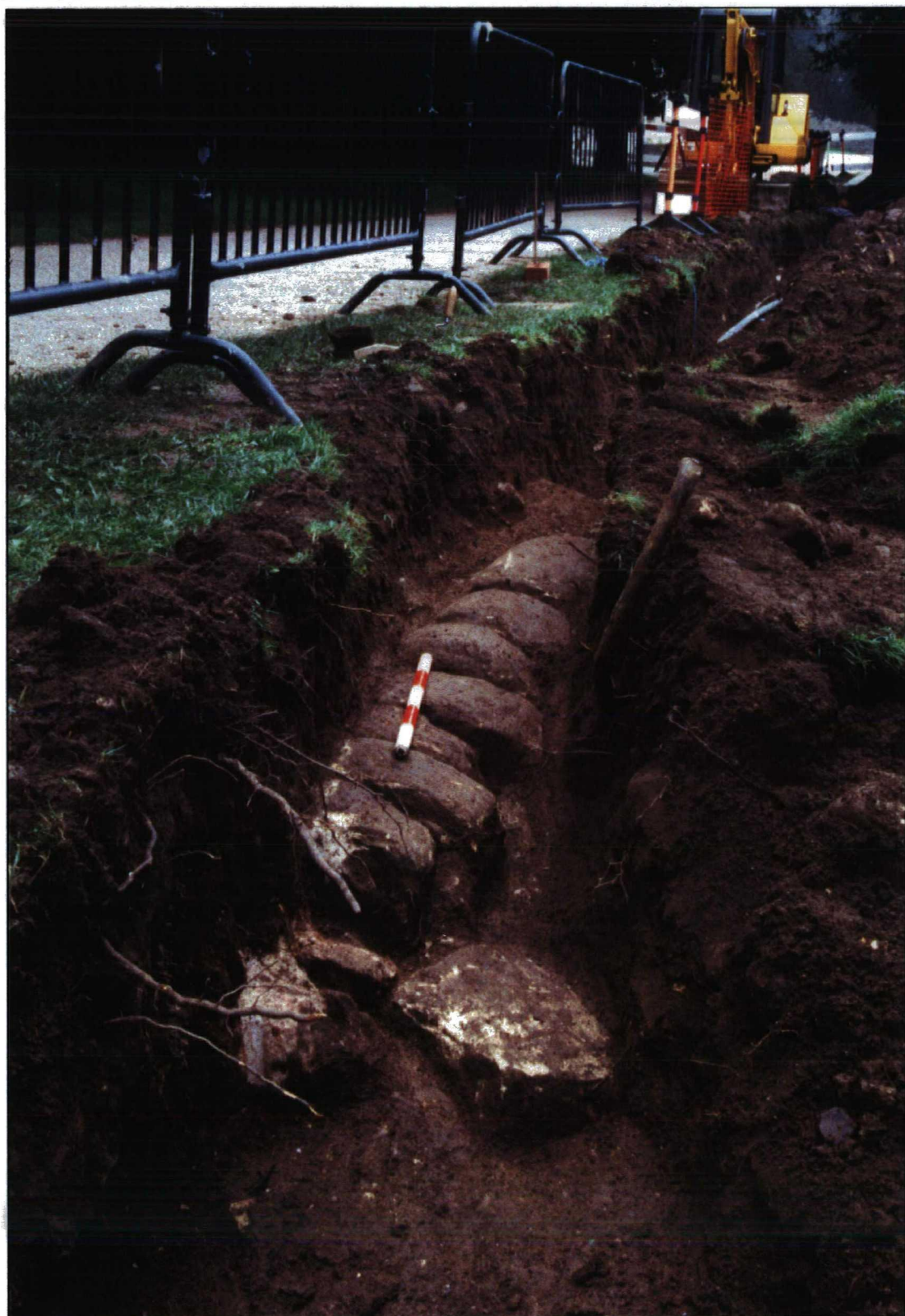
Plate 27. Tr 20, wall 2025