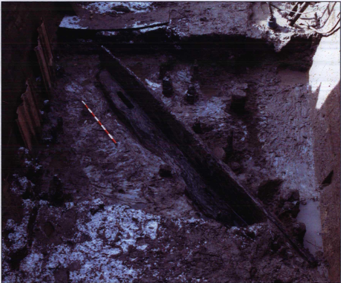
Plate 20. Tr 42, timber structure 4219/4226