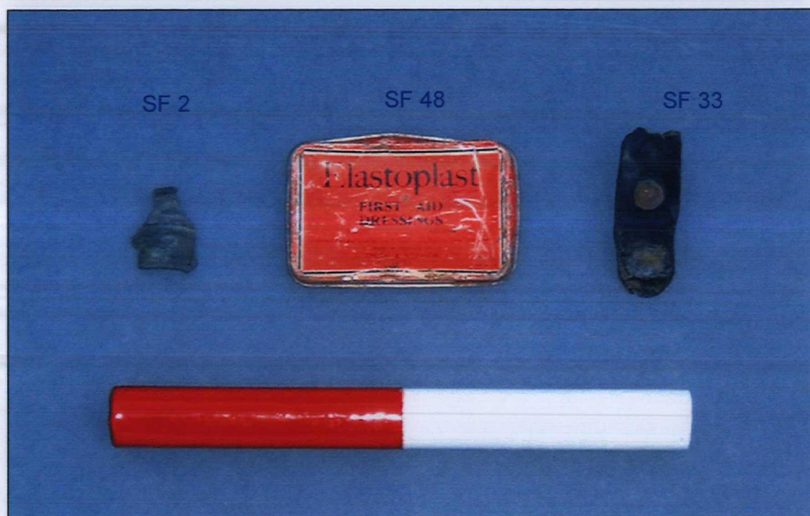
Plate 32. Copper alloy and tin, SF Nos. 2, 33, 48