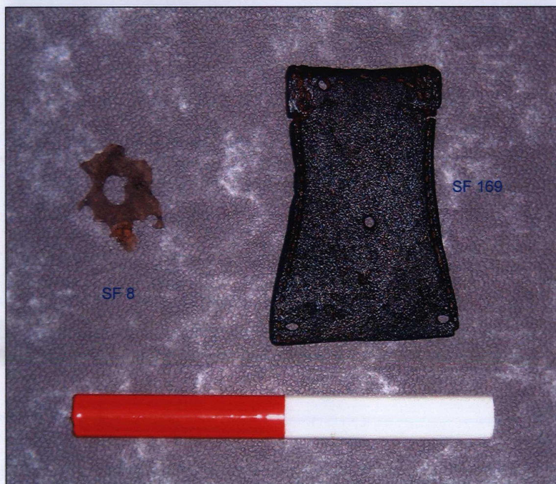
Plate 33. Leather SF Nos. 8, 169