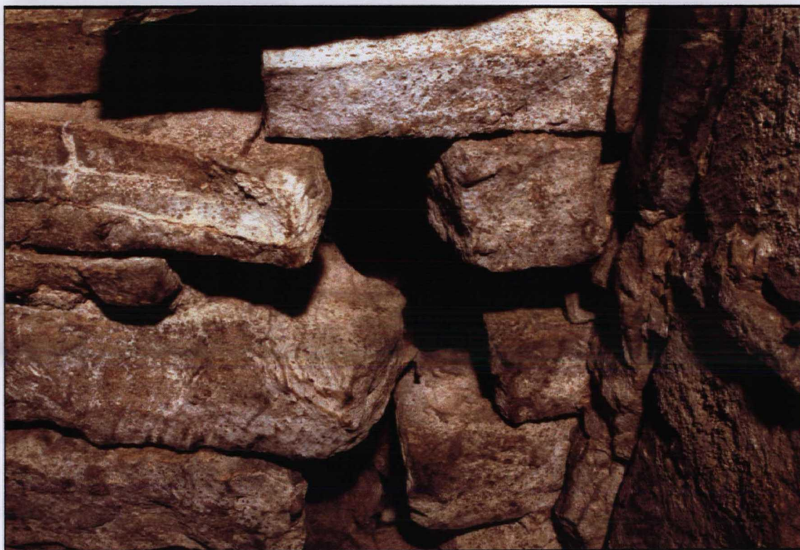
Plate 26. Collapsing arched underside of the road bridge.