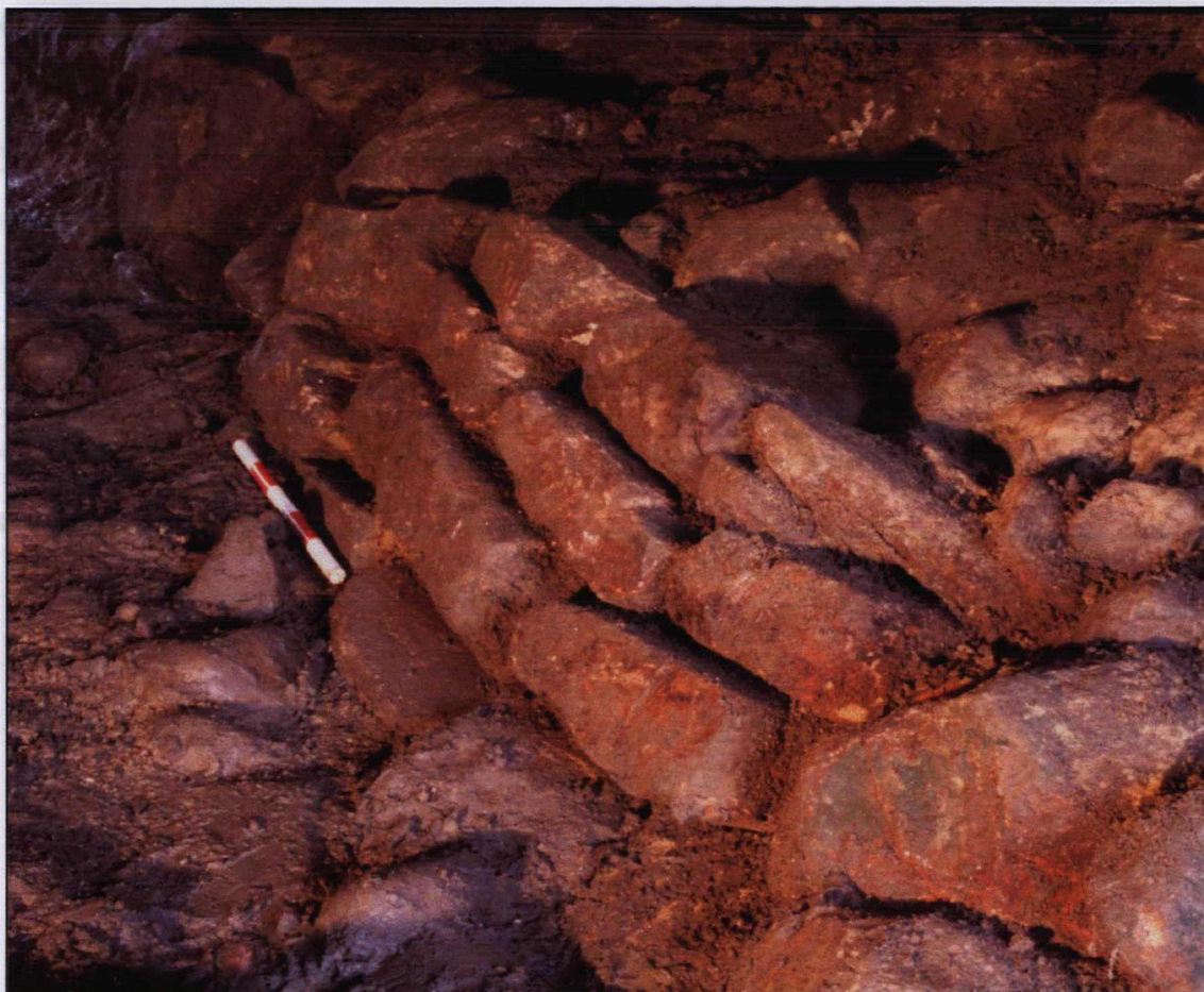
Plate 25. Tr 40, north retaining wall beneath road bridge.