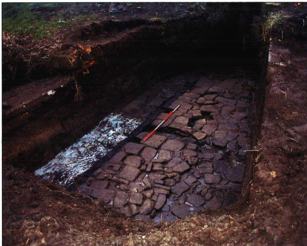
Plate 23. Tr 42, paved floor 4211