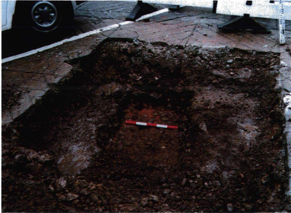
Plate 3. Trench 1, south facing section