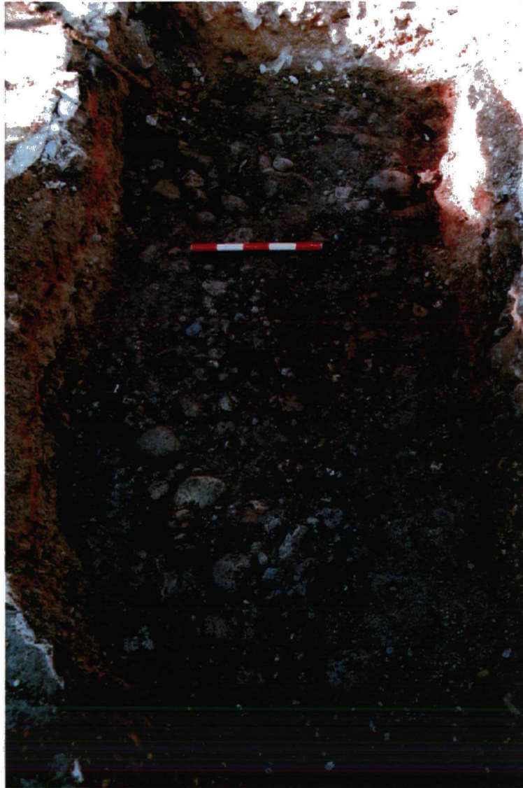
Plate 1. Trench 1, Context 1005, cobble surface