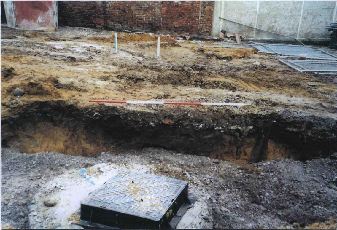
Plate 3. Ditch 2. West Facing Section. Facing East.