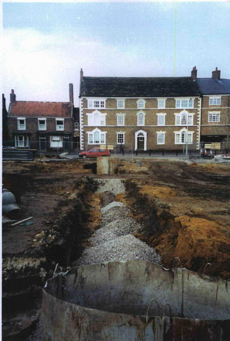
Plate 1. General View of Development Site. Facing East.