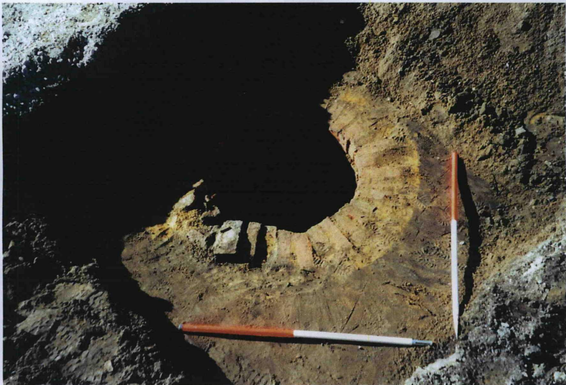
Plate 4. Brick Well. Facing South.