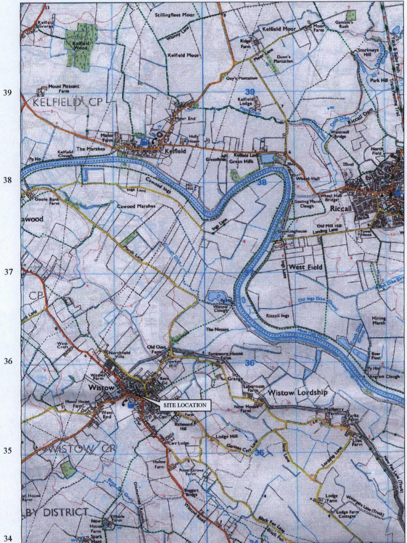
Figure 1. Site Location (NGR SE 920 3570)