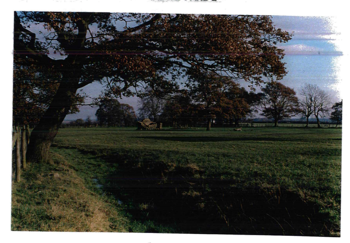
Field 4840, the Pre 18<sup>th</sup> century encroachment, facing east.