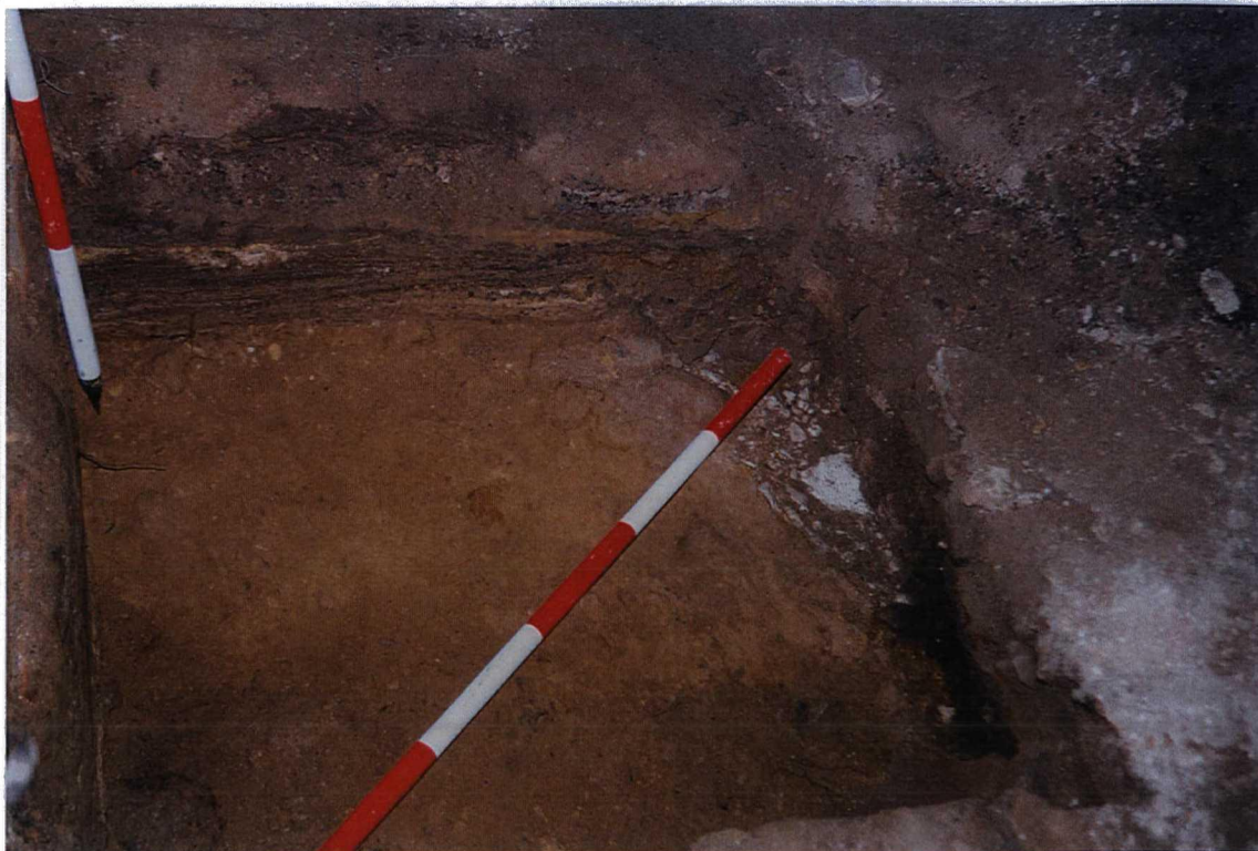
PLATE 25 TT1 FROM THE NORTH – CHALK LINED SLOT AT BASE