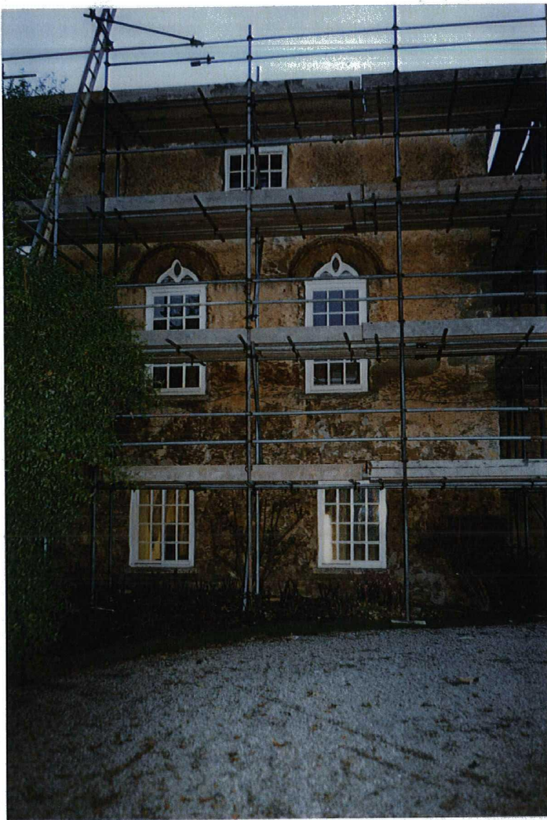
PLATE 35 ALTERED WINDOWS ON WEST SIDE OF UNDERCROFT