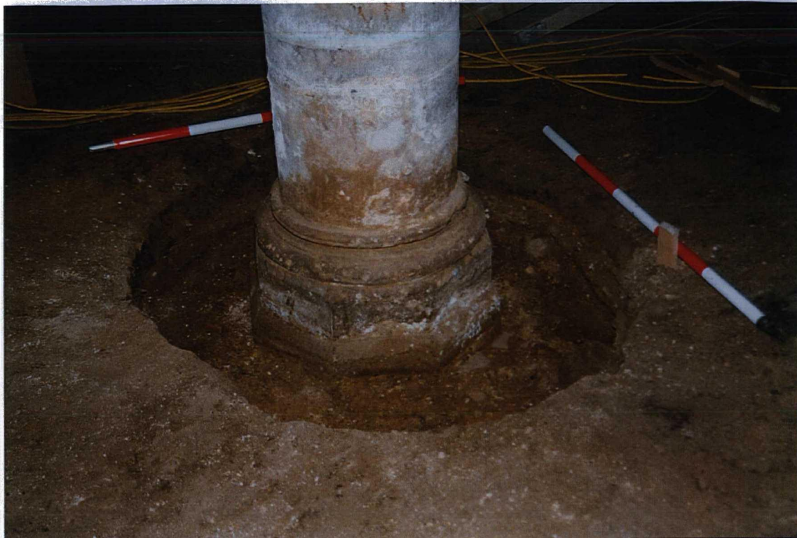
PLATE 31 BASE OF P3 FROM THE SOUTH