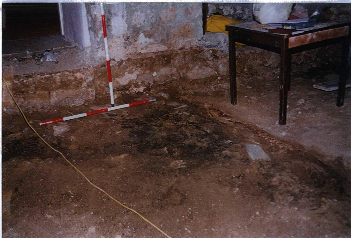
PLATE 23 WALL FOOTINGS AND COBBLES NEAR SOUTH DOOR