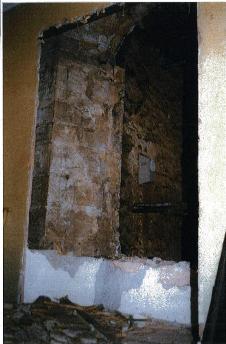
PLATE 36 EAST SIDE OF SOUTH WINDOW, UNDERCROFT HALL