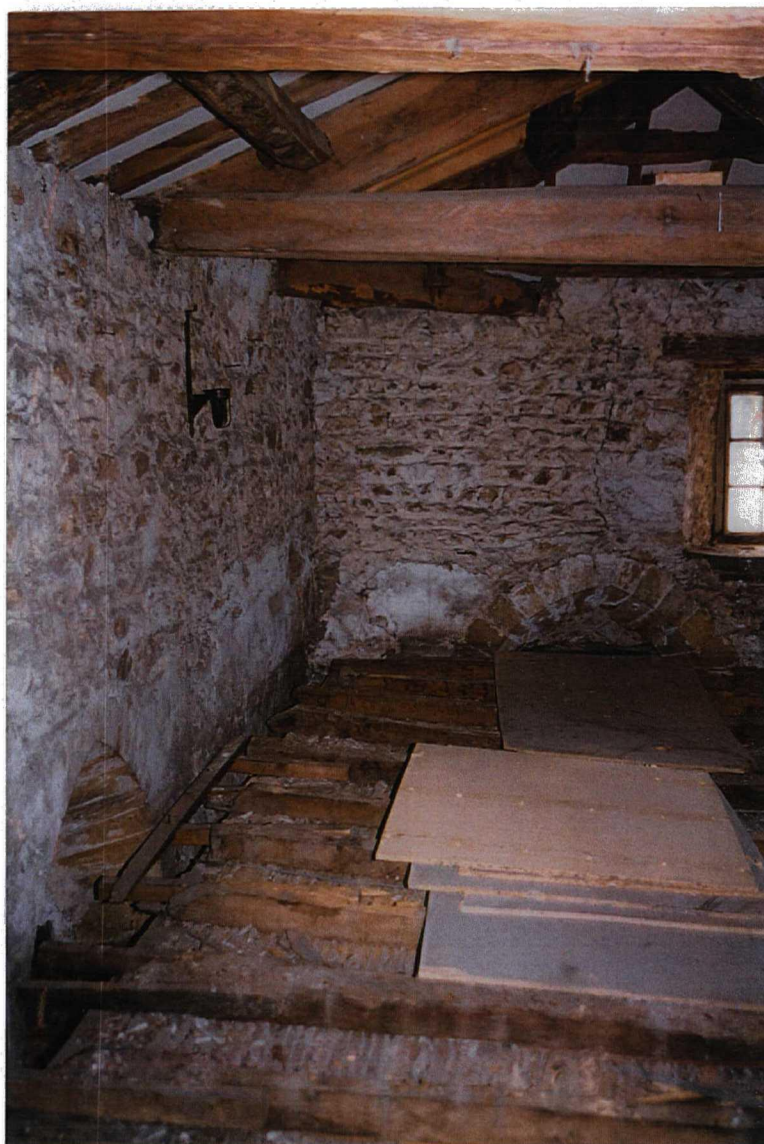
PLATE 32 TOP OF WINDOW IN WEST SIDE OF UNDERCROFT HALL