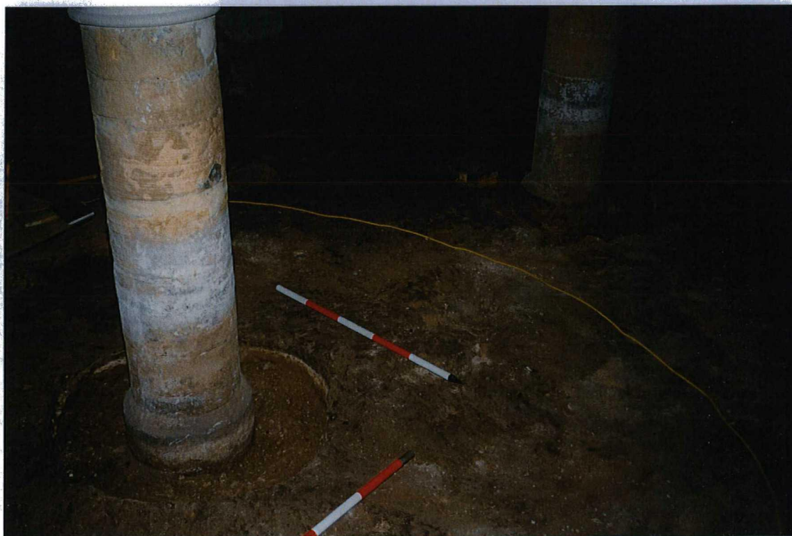
PLATE 30 BASE OF P2 FROM THE NORTH