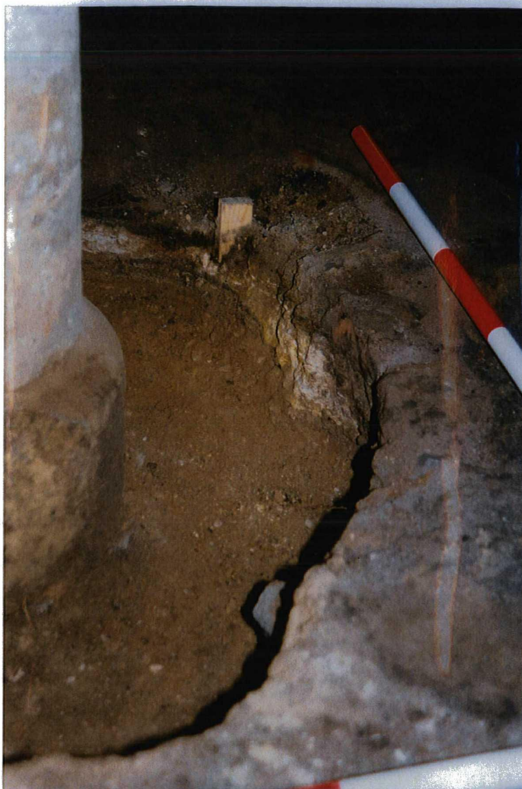
PLATE 29 BASE OF P1 FROM THE NORTH