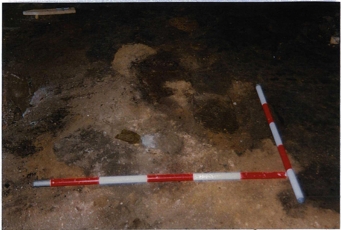
PLATE 27 PACKED LIMESTONE FLOOR WITH STONES AND DISTURBANCES