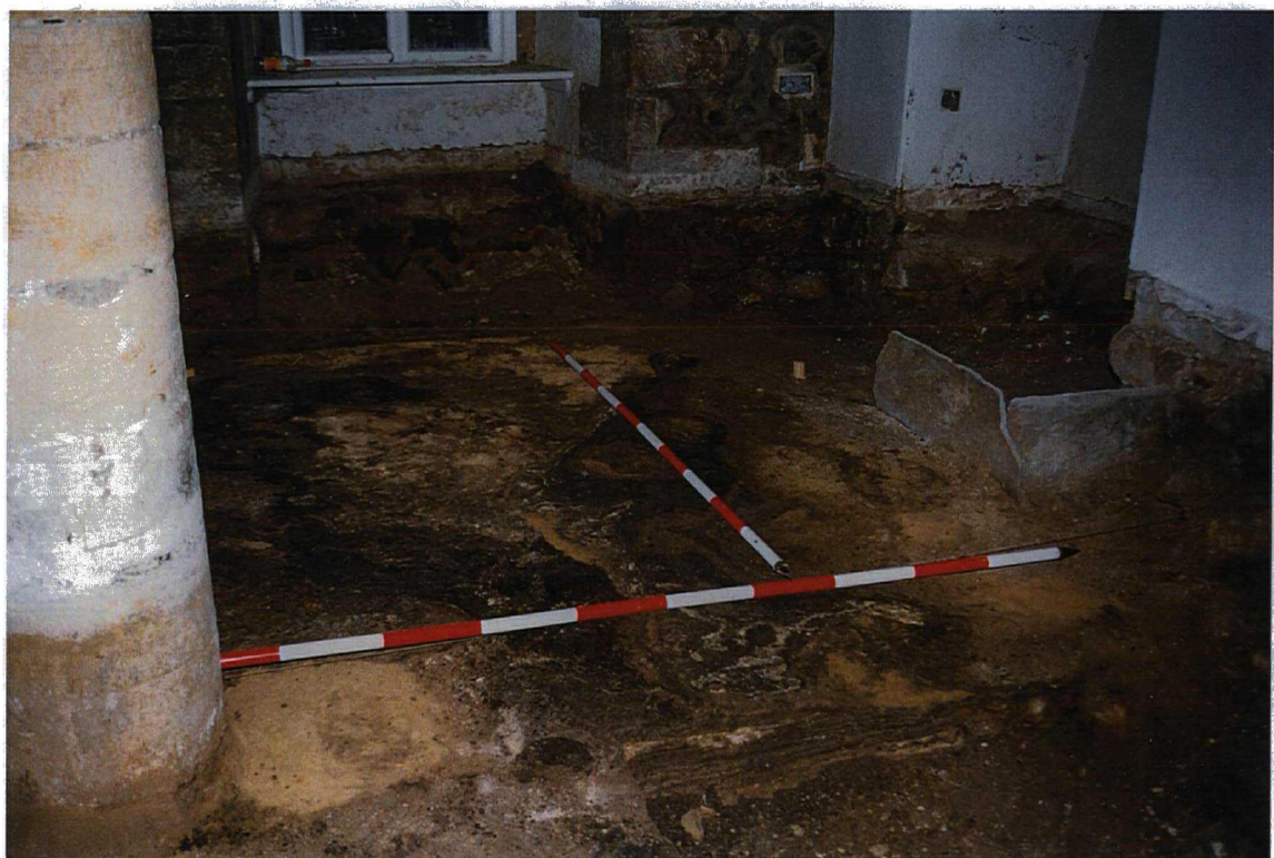
PLATE 28 FLOOR SURFACES IN SOUTH WEST CORNER OF UNDERCROFT