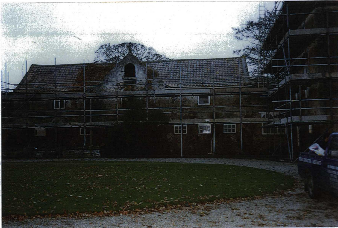
PLATE 41 STABLE RANGE FROM THE SOUTH