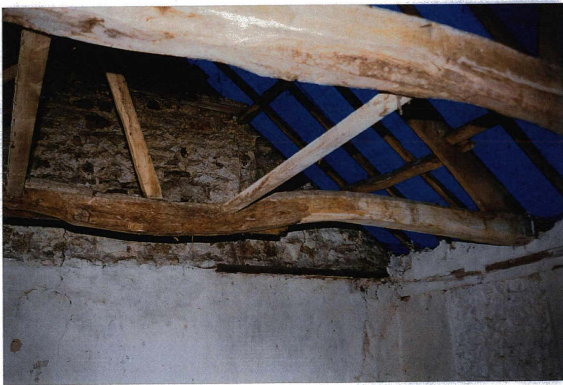
PLATE 42 EASTERNMOST TRUSS IN STABLE BLOCK ROOF