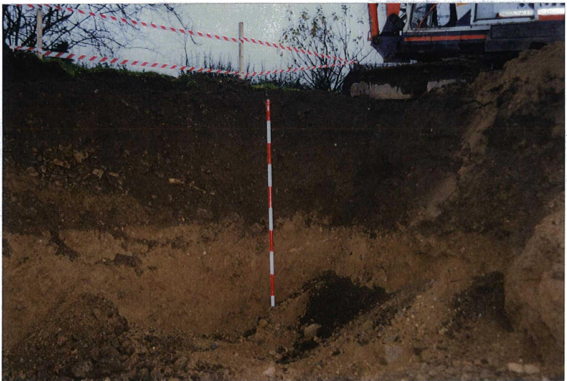
PLATE 40 NORTH EAST CORNER OF SWIMMING POOL