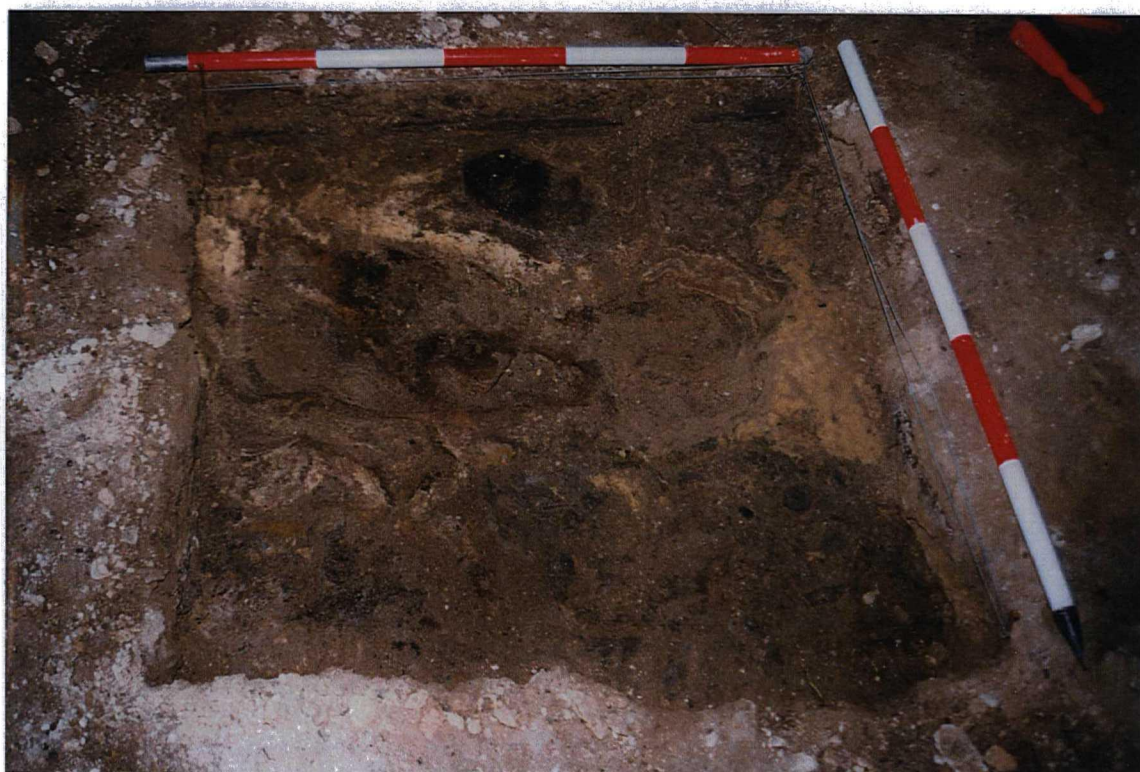
PLATE 24 TT1 FROM THE NORTH - ?FLOOR SURFACES AND BURNT AREAS