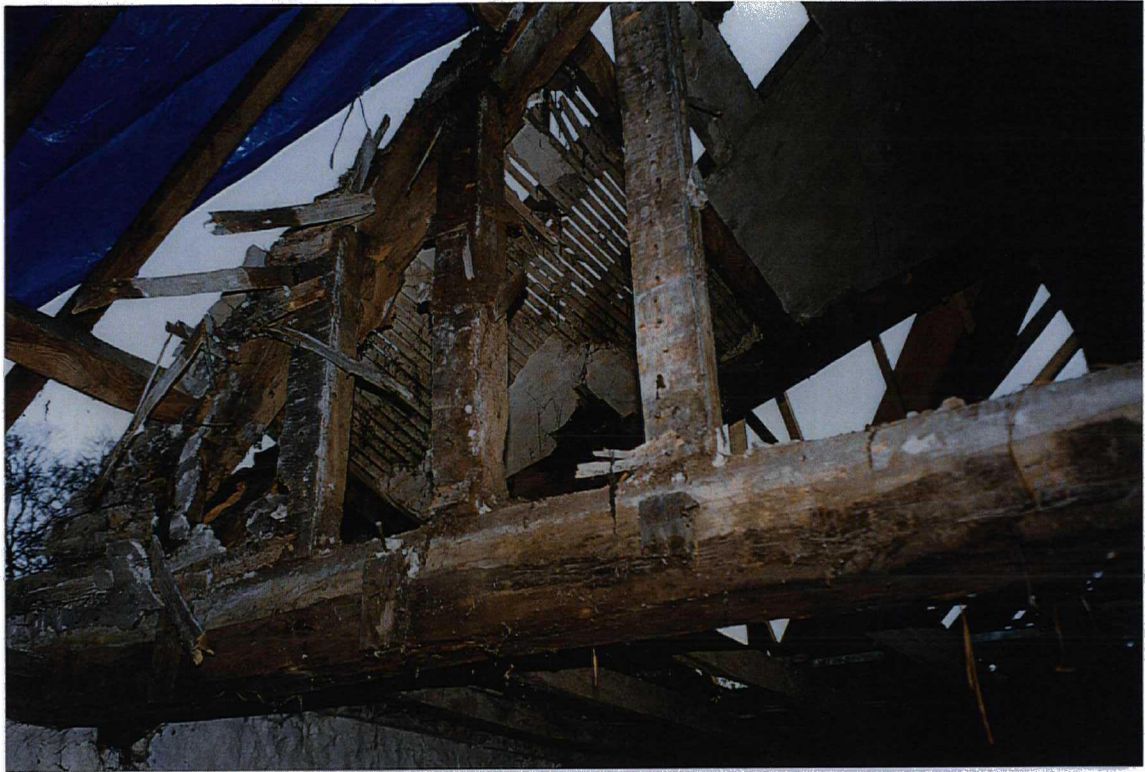
PLATE 43 STABLE BLOCK ROOF – TRUSS WITH STRUTS