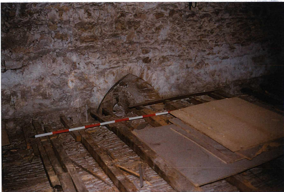
PLATE 34 TOP OF WINDOW IN SOUTH SIDE OF UNDERCROFT HALL