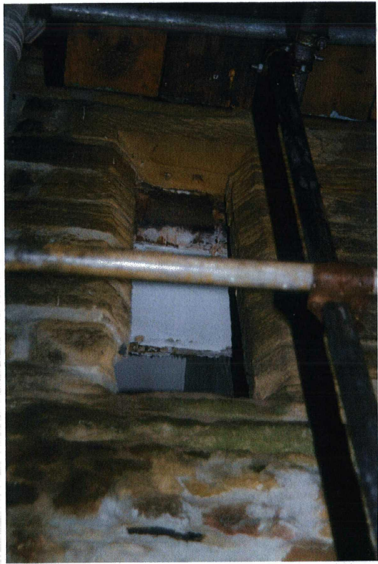
PLATE 39 OPENING IN SOUTH-EAST CORNER UNDERCROFT HALL, FROM OUTSIDE