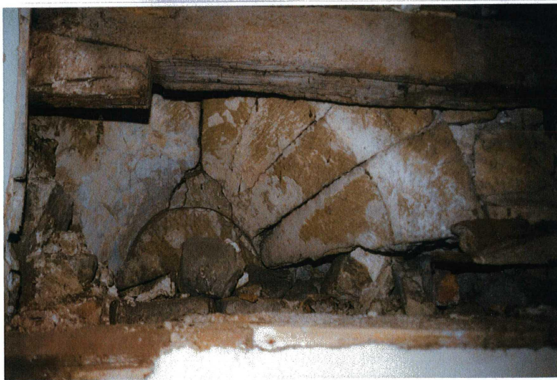
PLATE 38 REMAINS OF SECOND SOUTH WINDOW, UNDERCROFT HALL