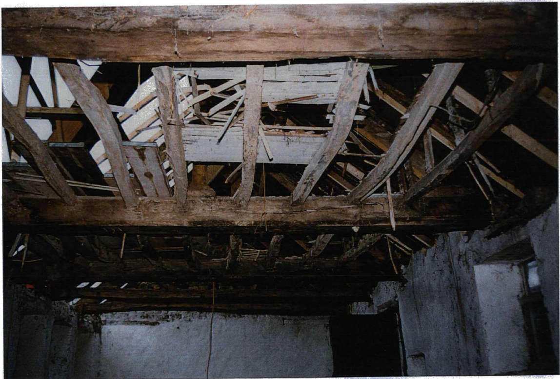
PLATE 44 STABLE BLOCK ROOF - RAFTERS