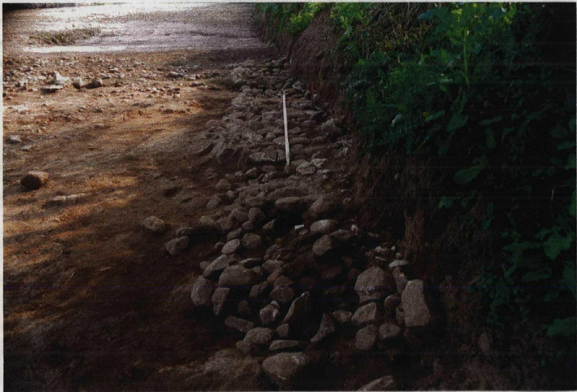
Plate 8. Cobble foundation. Facing south.