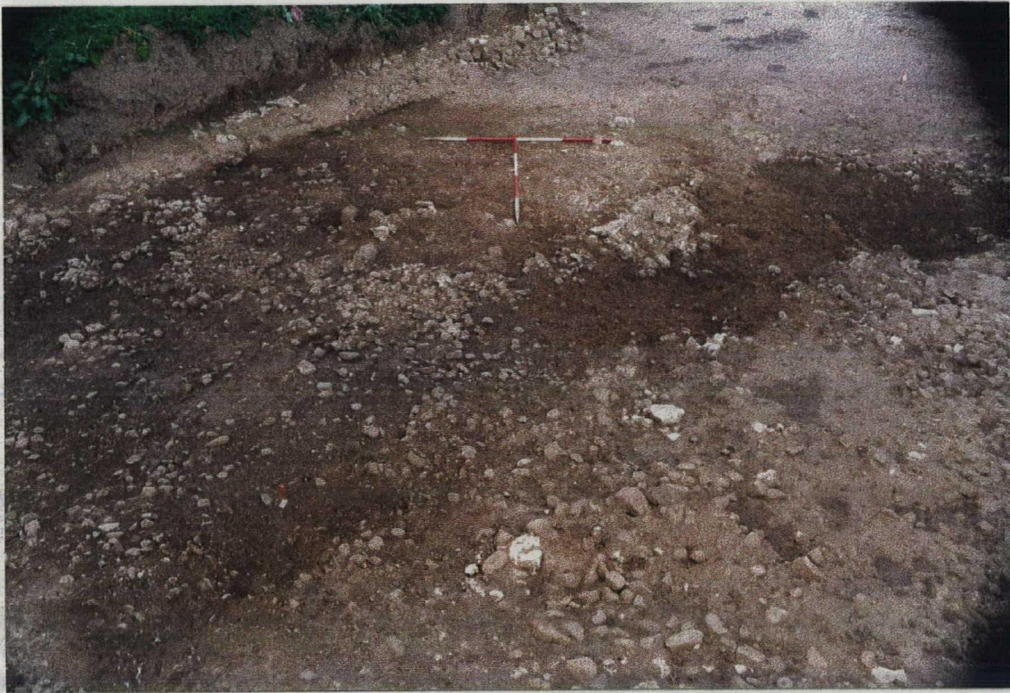
Plate 3. Cobbles 1005; Cobble raft beyond. Facing north-west.