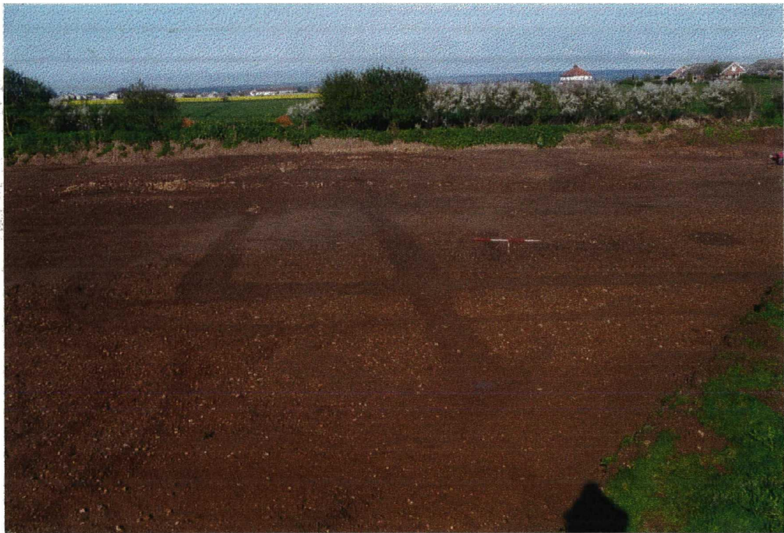
Plate 10. Intersection of Ditches 12, 13, 14 and 15. Facing west.