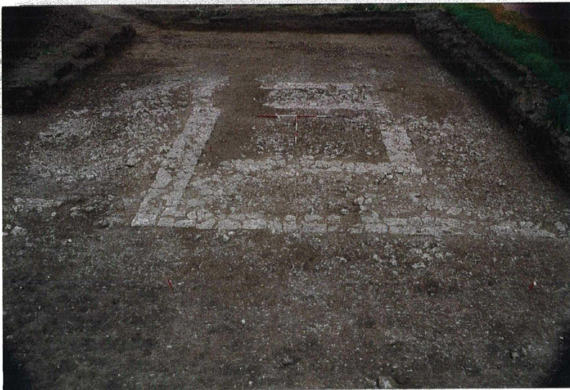
Plate 6. Limestone Building. Facing north.