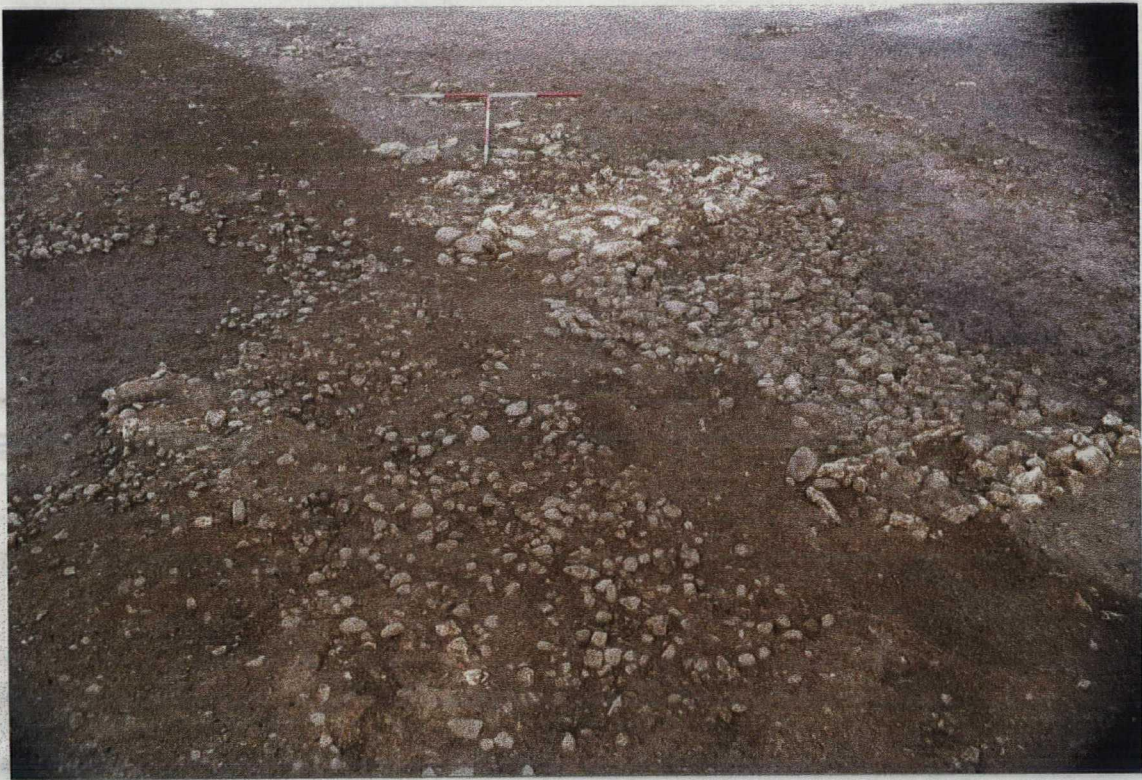
Plate 1. Cobbles 1007; Entrance structure 1009 and 1010