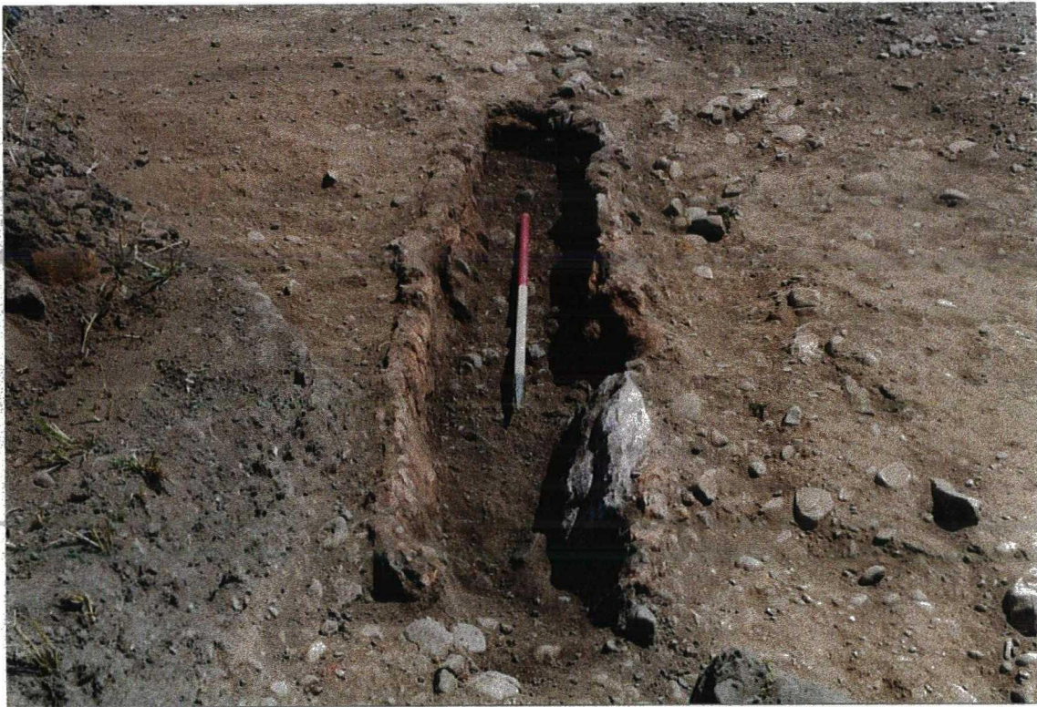
Plate 15. Malting oven. Facing south-east.