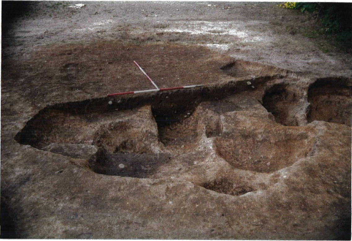
Plate 9. Clay Quarry. Facing south.