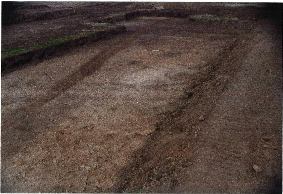
Plate 11. Ditch 4. Facing north-west.