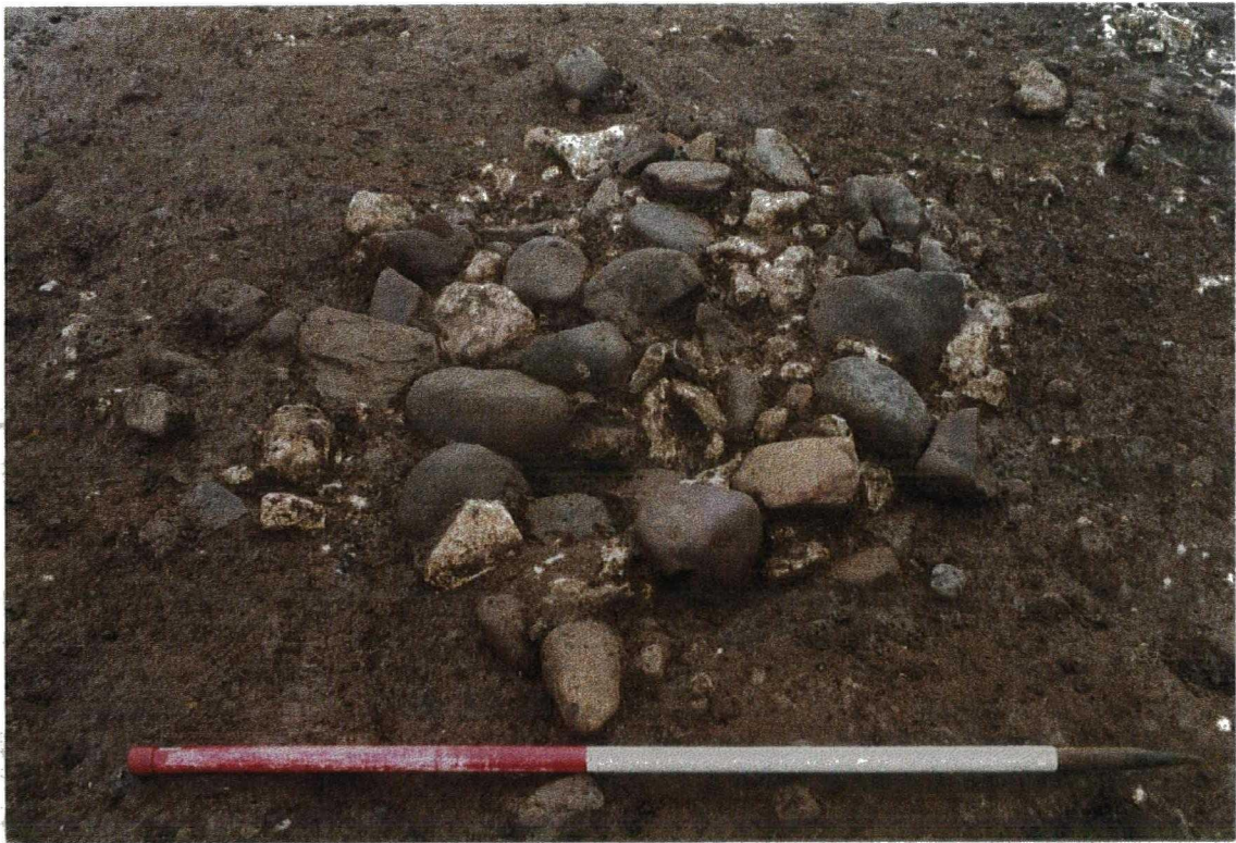
Plate 5. Posthole 1166. Facing south.