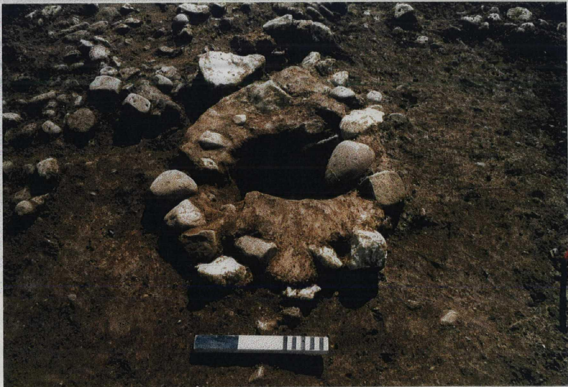
Plate 2. Posthole 1065. Facing west.