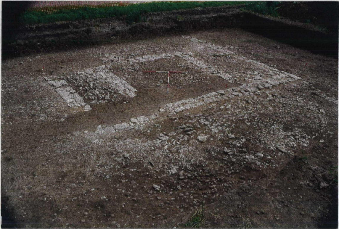
Plate 7. Limestone Building. Facing south-east.