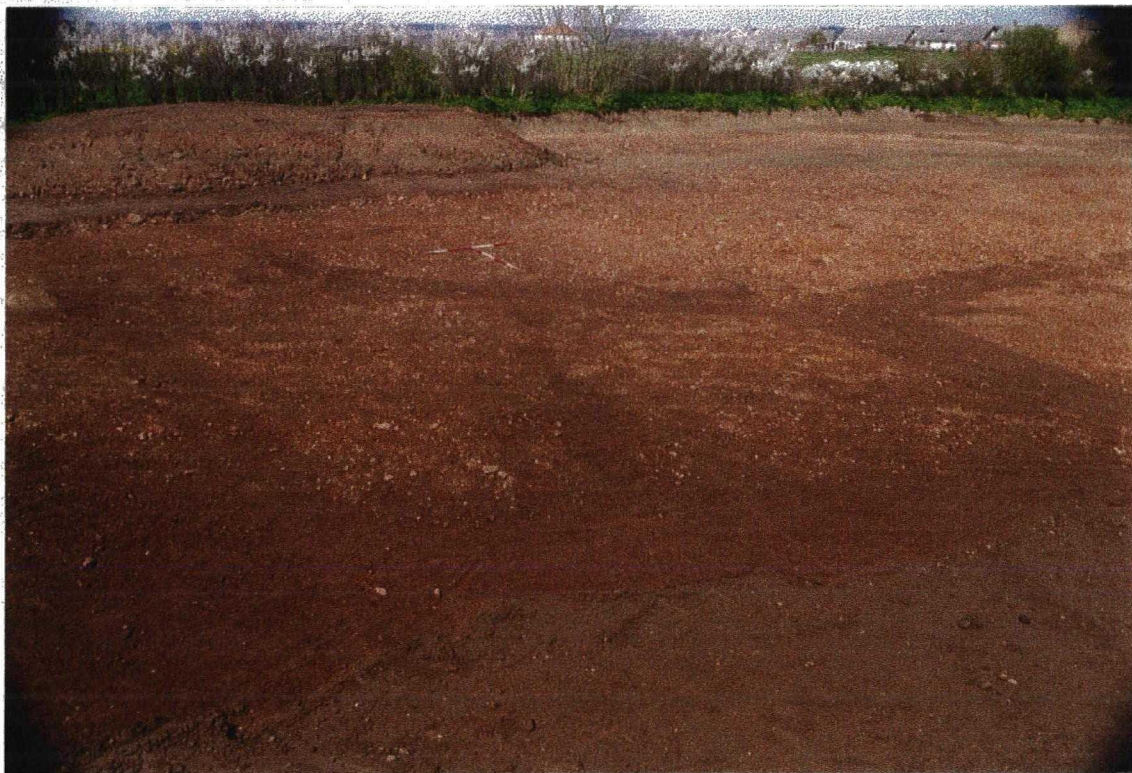
Plate 12. Ditches 18, 20, 21 and 22. Facing north-west.