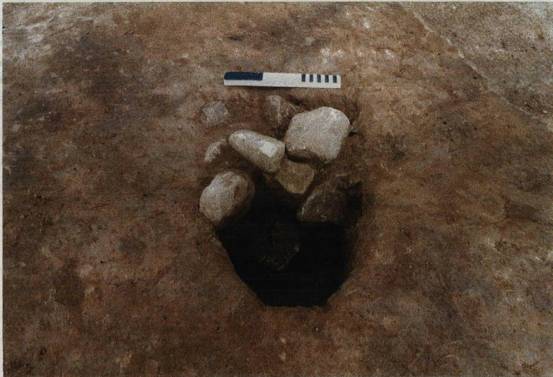
Plate 4. Posthole 1028. Facing north-west.