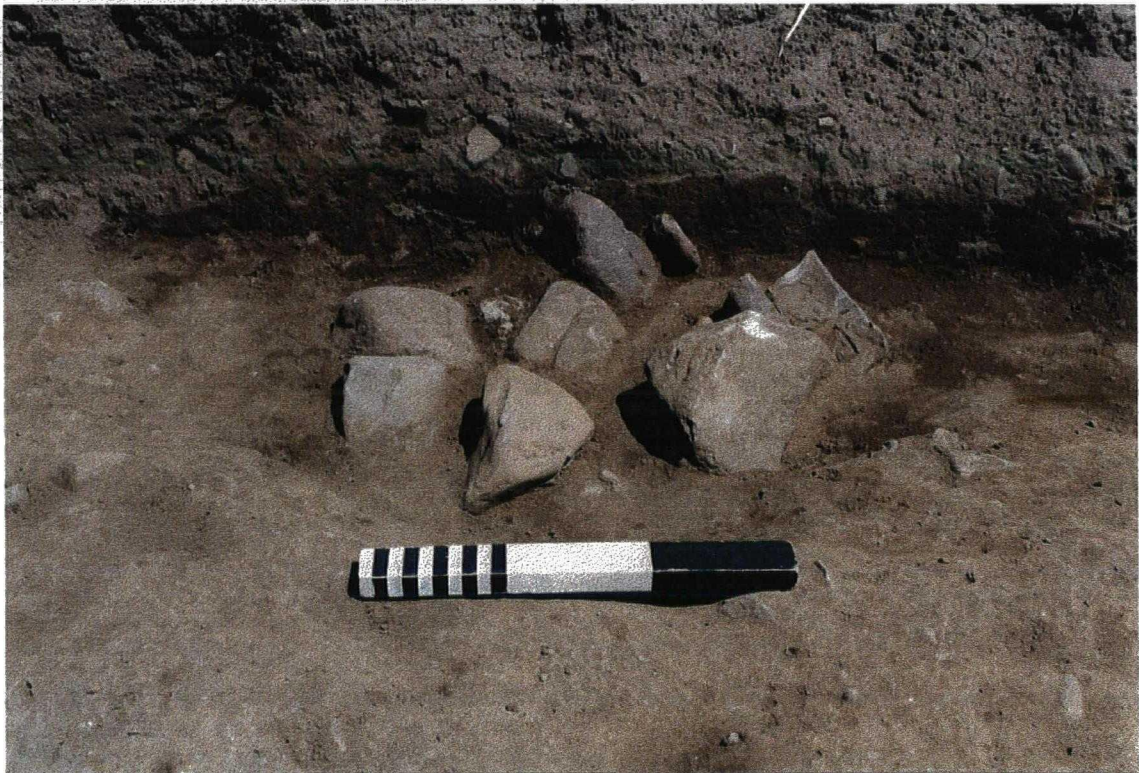
Plate 14. Posthole 4042. Facing east.