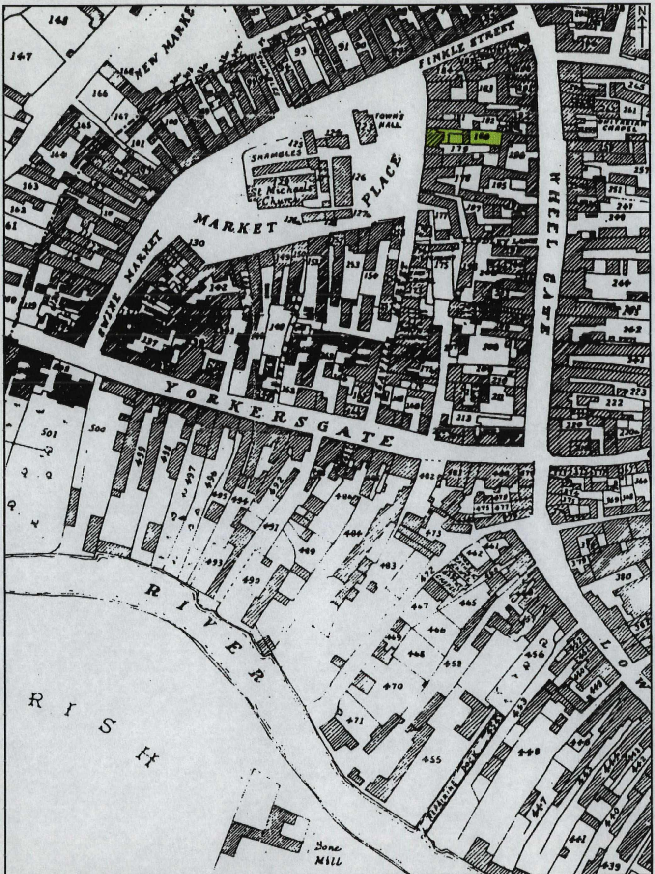
Figure 2. Robert Wise's Map of the Town of Malton, 1843.