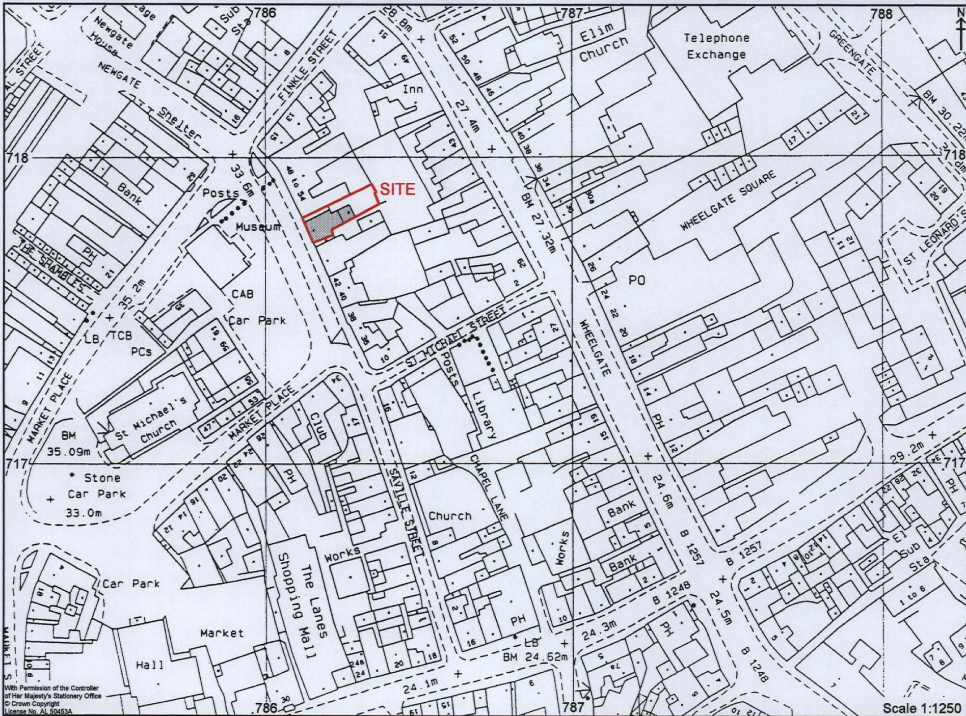
Figure 1. Site Location.