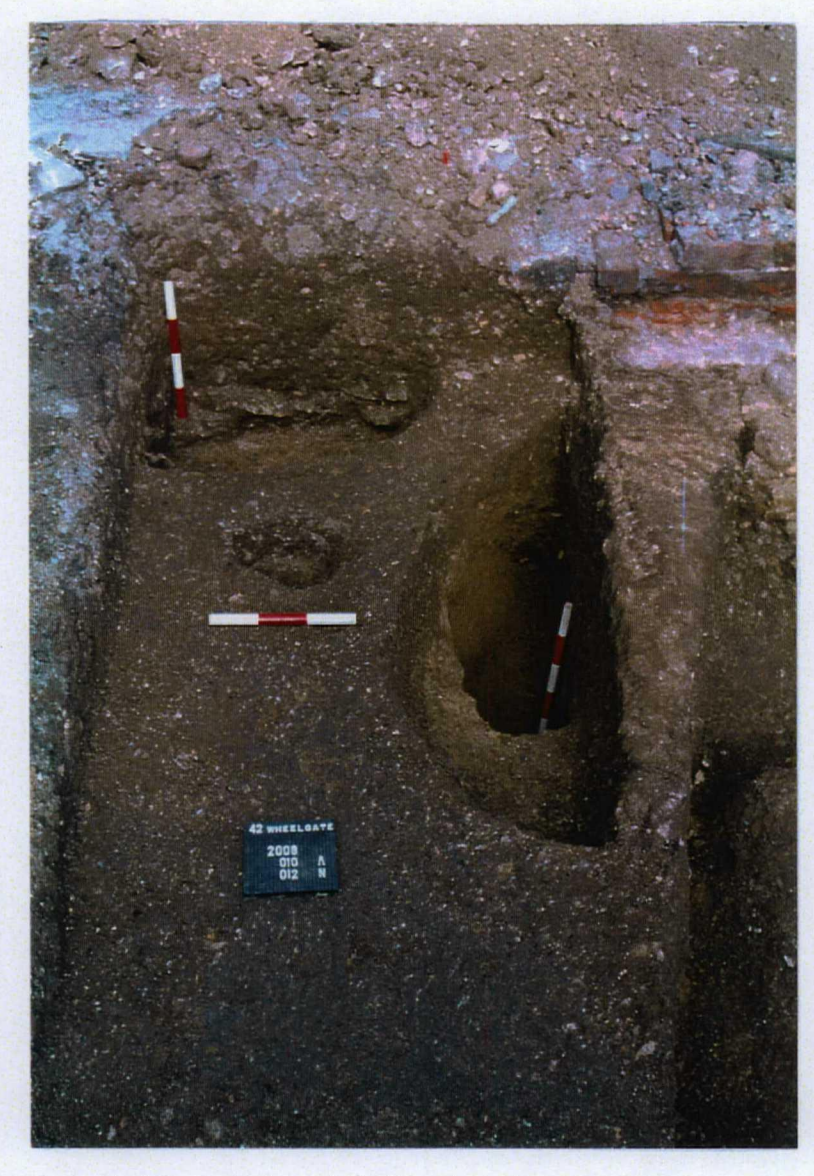
Plate 11. View of Trench 2 Showing Cuts 2008, 2010, 2012. Facing north.