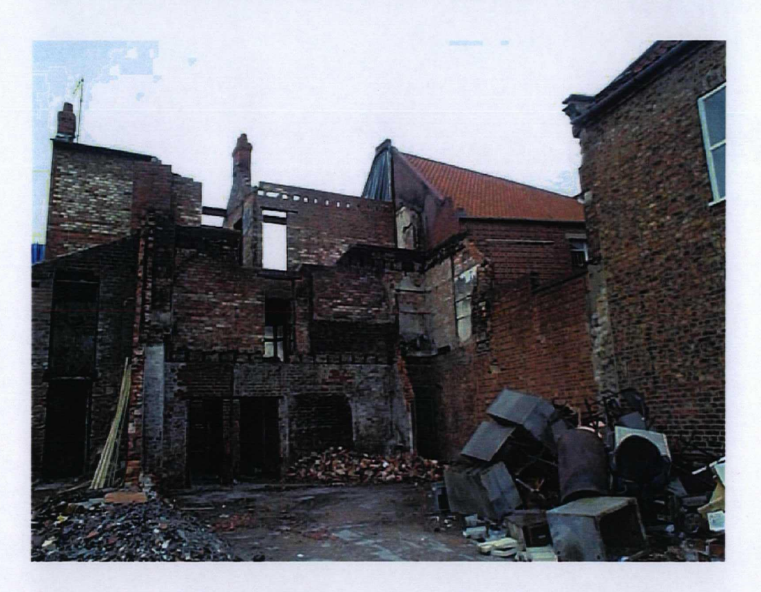
Plate 6. View of southern boundary to No. 42 Wheelgate. Facing south.