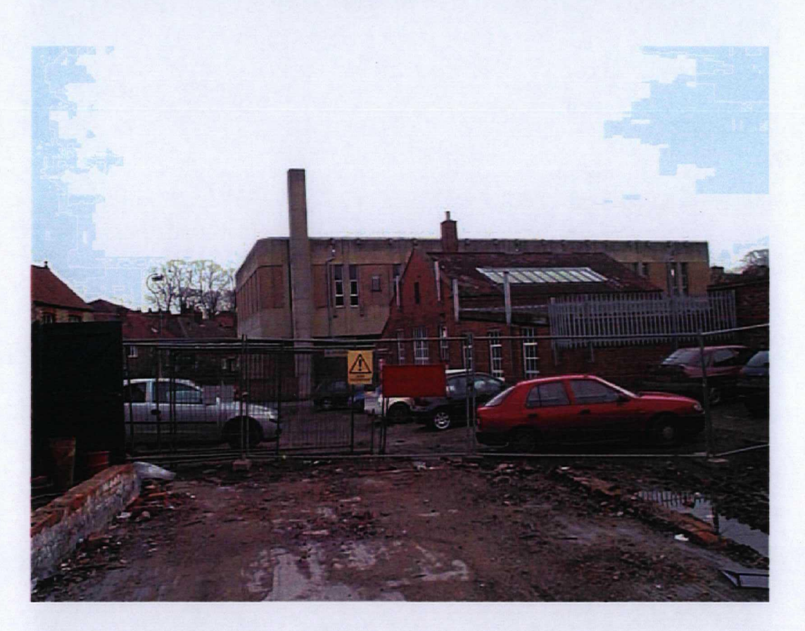
Plate 4. View of Nos. 44 & 46 Wheelgate. Rear of property. Facing east.