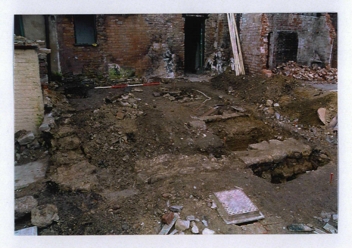
Plate 8. General view of Excavations Showing Stone Structure. Facing west.