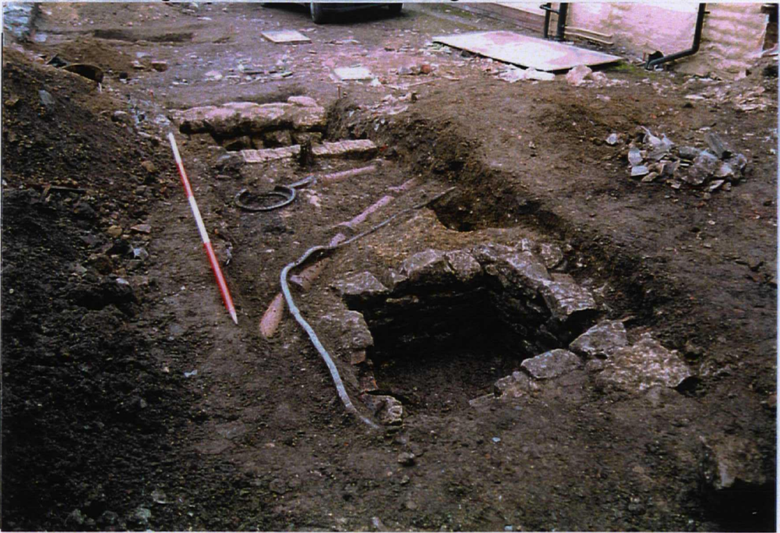
Plate 10. View of Trench 1 Showing Well 1015. Facing east.