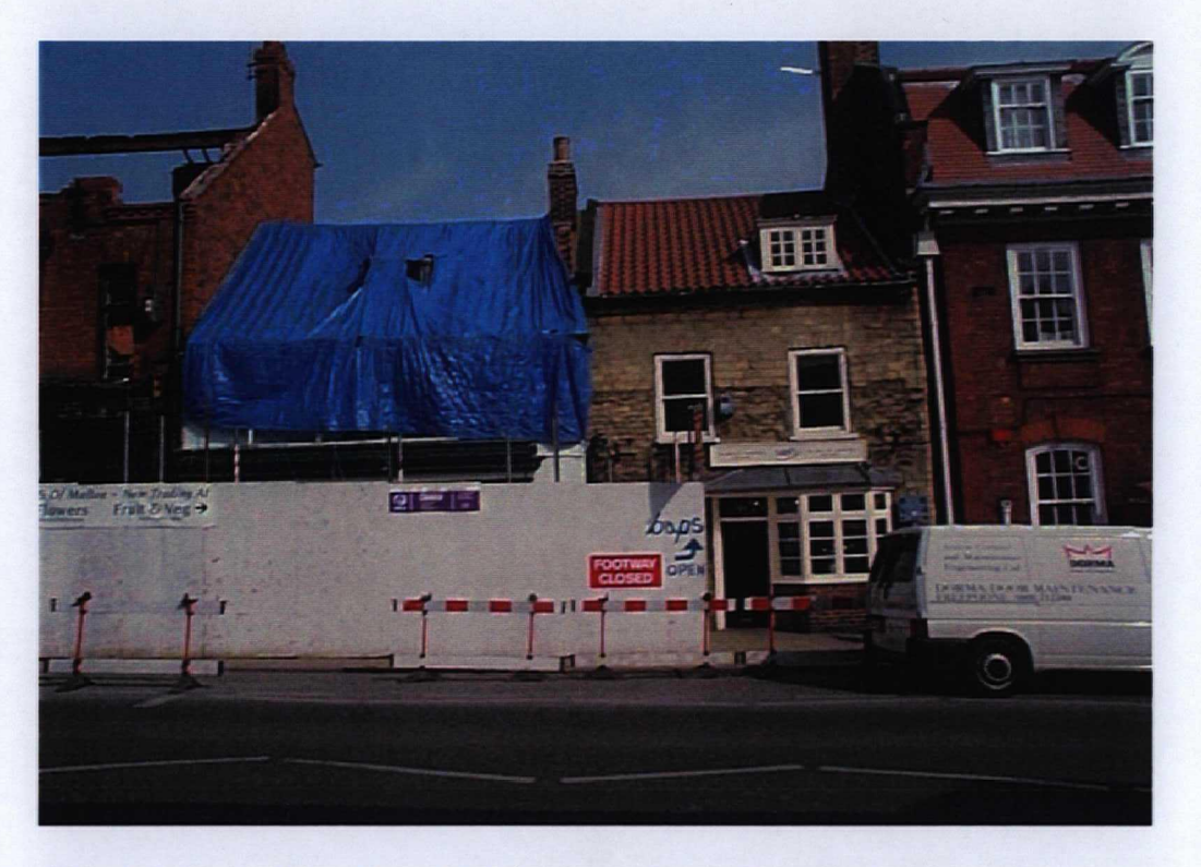
Plate 1. View of Nos. 40 & 42 Wheelgate. Street Frontage. Facing east.