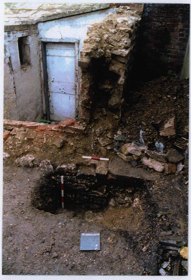
Plate 9. Standing Stone Wall in Trench 3. Facing north.