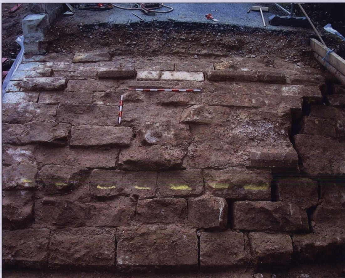
Plate 6. The exposed vault of the arch (1006) viewed from the east.