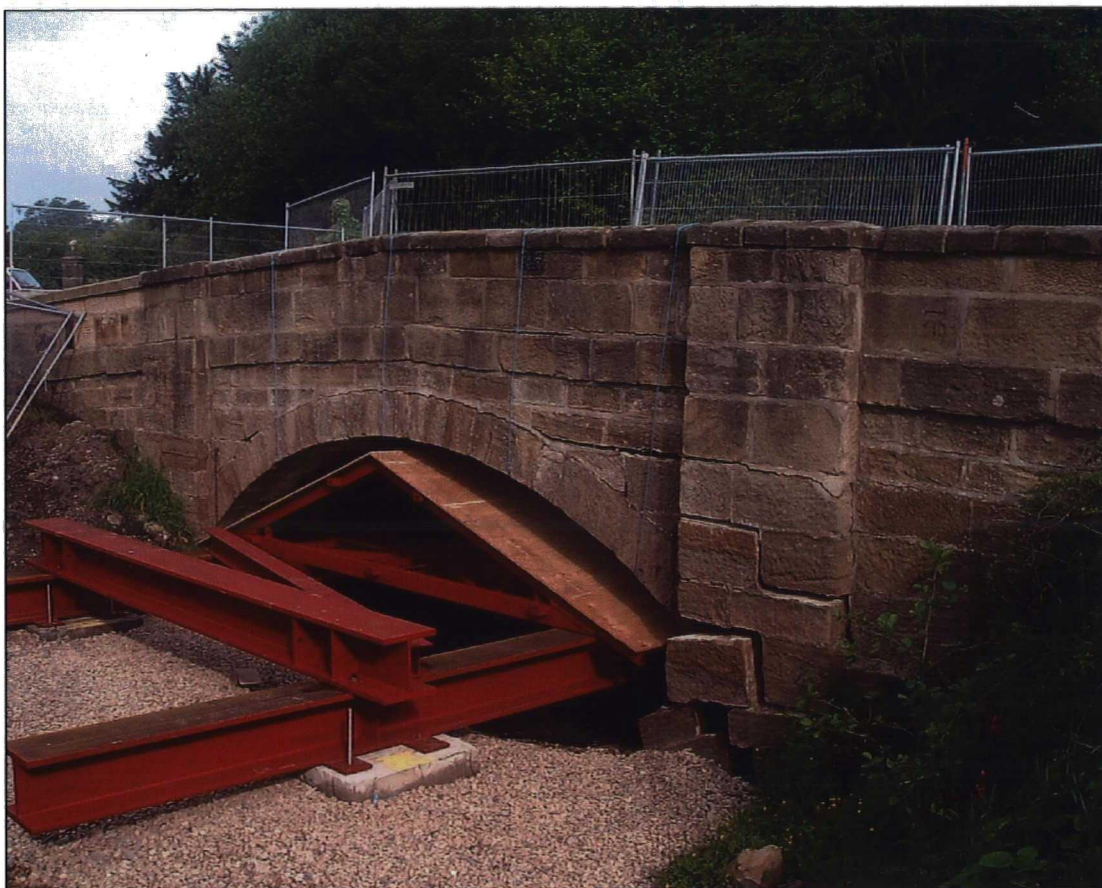
Plate 3. The east abutment viewed from the south, showing the failure of the lower portion.