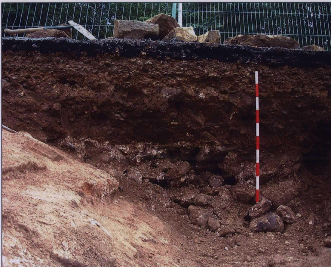
Plate 5. Contexts (1000) (1001) (1002) (1003) and (1006) viewed from the south.