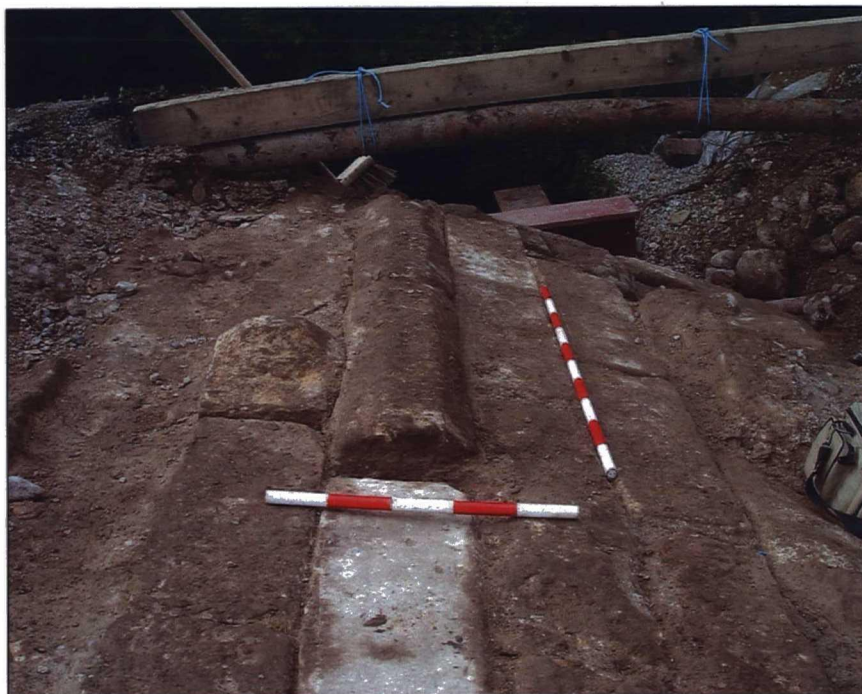
Plate 7. One of the reused copings viewed from the south.