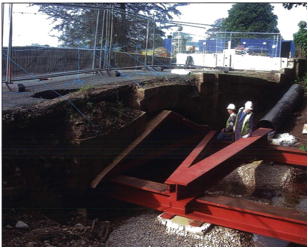
Plate 2. Bridge viewed from the north, showing the failure of the arch and damage to the abutment.