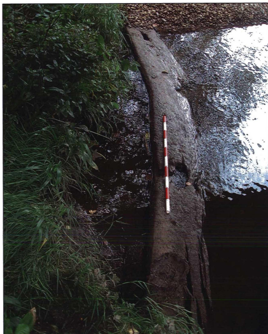
Plate 8. Possible cruck timber in Kex Beck, viewed from the north.