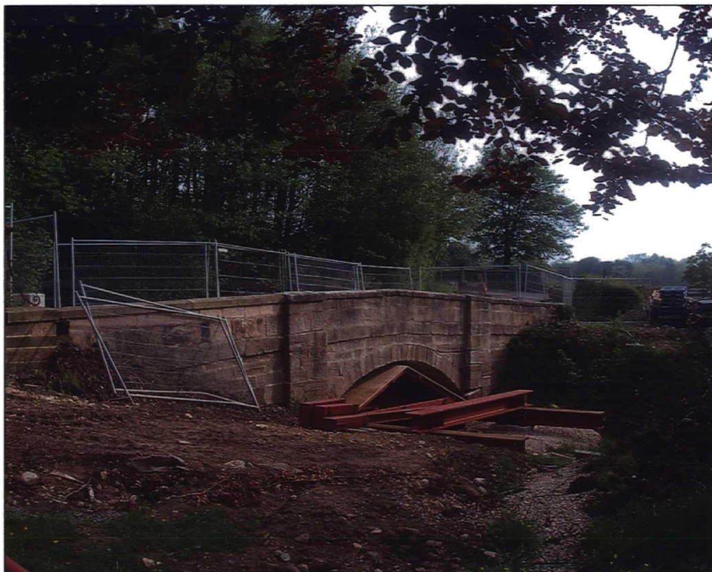
Plate 1. General view of bridge and support structure from the south.