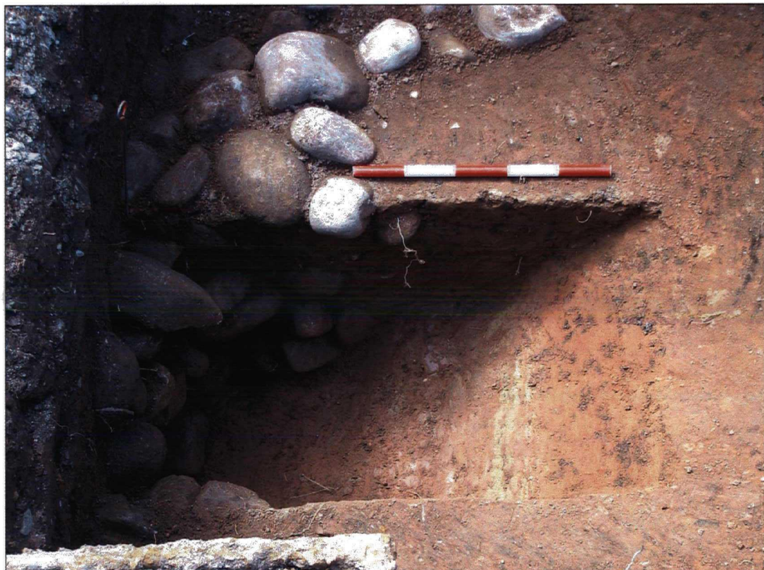
Plate 2. Trench 1 (1012) & [1013], east facing section. (Scale of 0.5m).