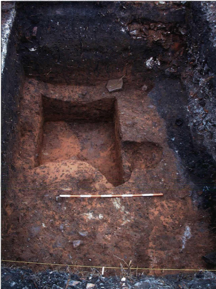
Plate 4. Trench 2, looking south. (Scale of 1m).