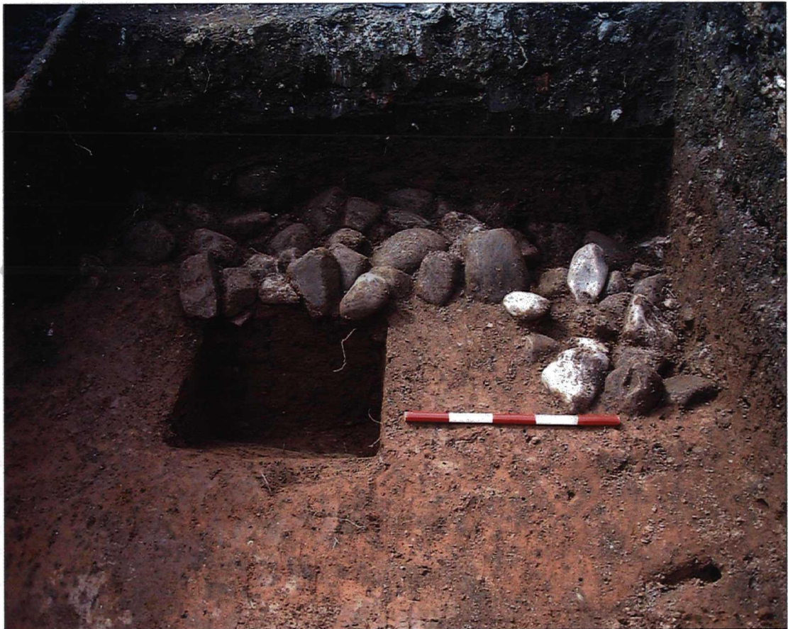
Plate 1. Trench 1 (1012), looking south. (Scale of 0.5m).