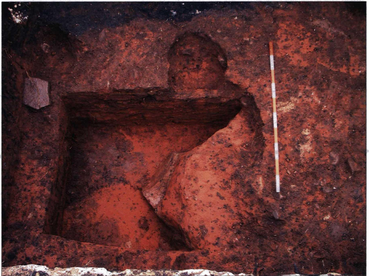
Plate 5. Trench 2, showing detail of [2022] & [2025]. (Scale of 1m).