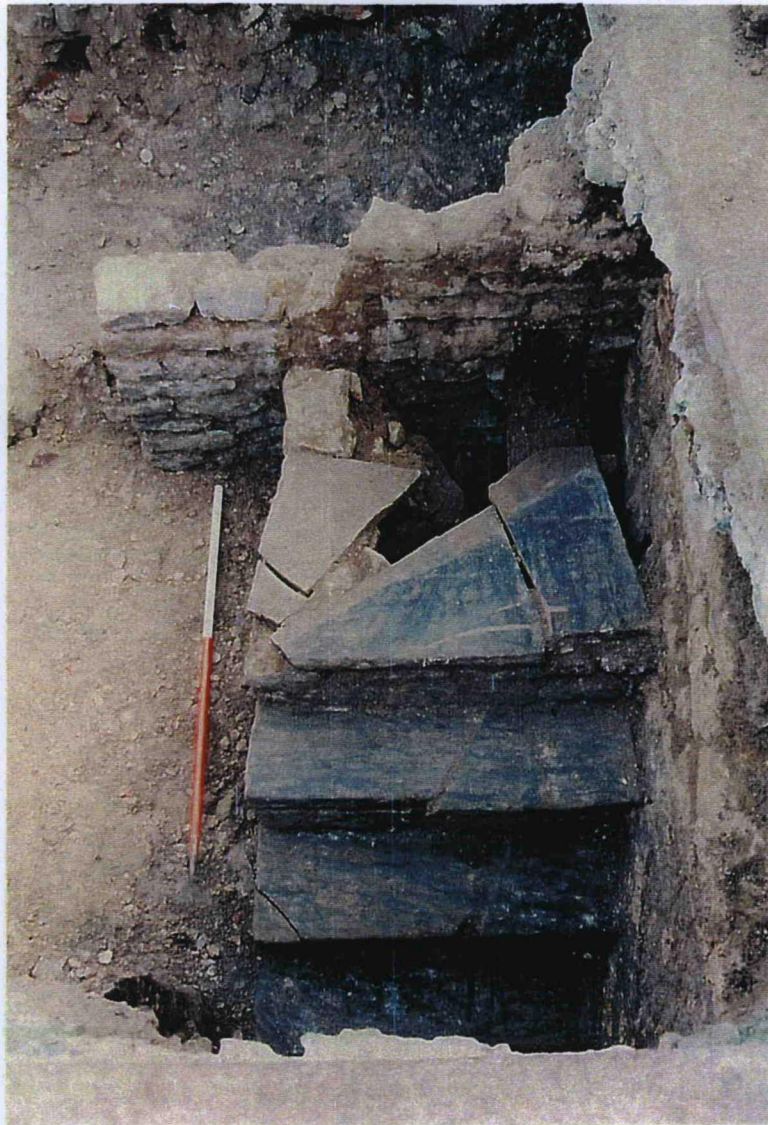
Plate 5. Trench 2. Staircase 2003. Facing south east