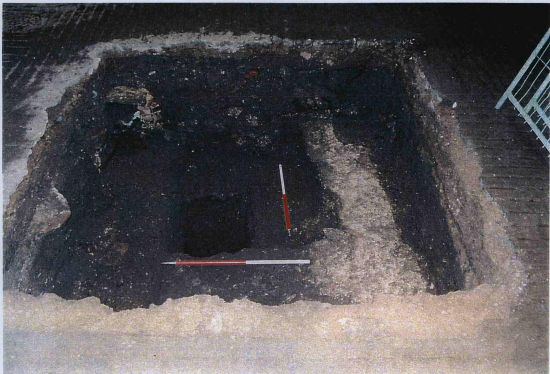
Plate 2. Trench 1. Wall 1016 and deposit 1006. Facing south west.