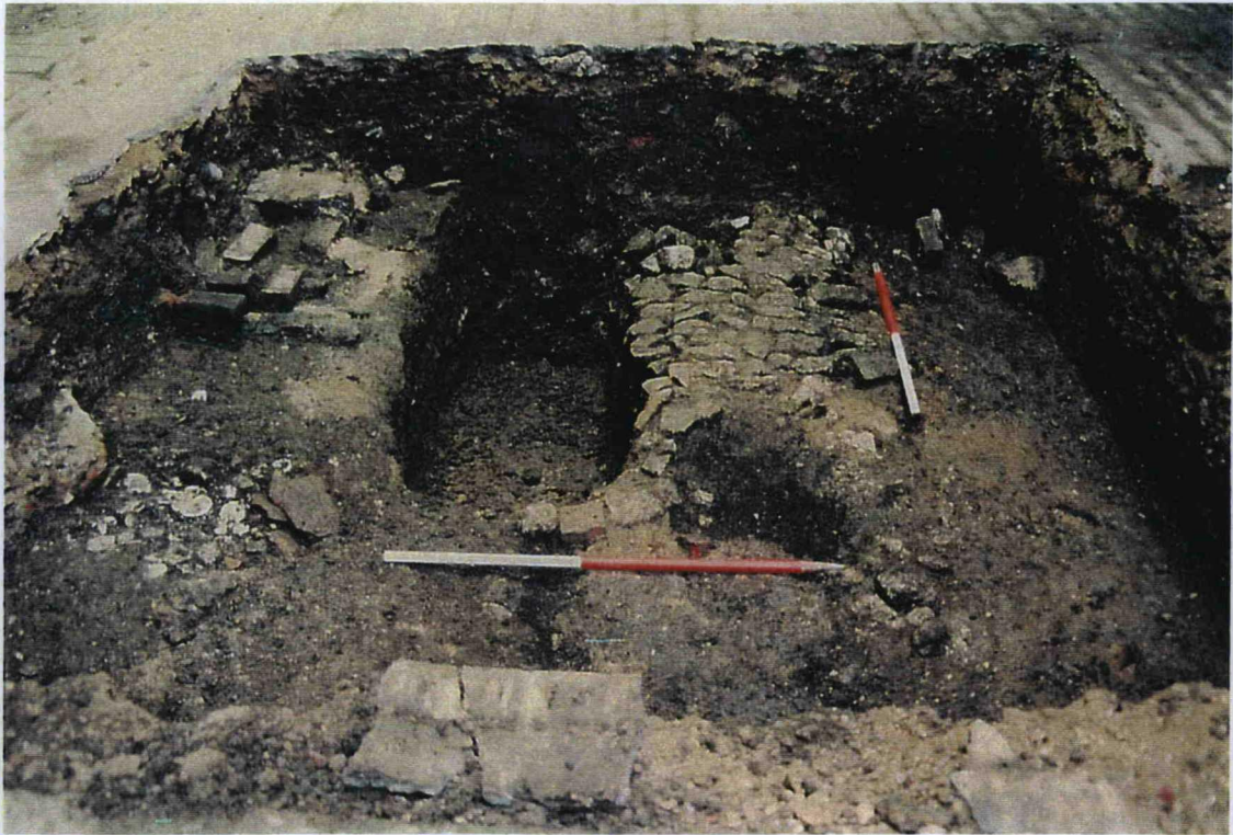
Plate 1. Trench 1. Stone surface 1003. Facing south west.