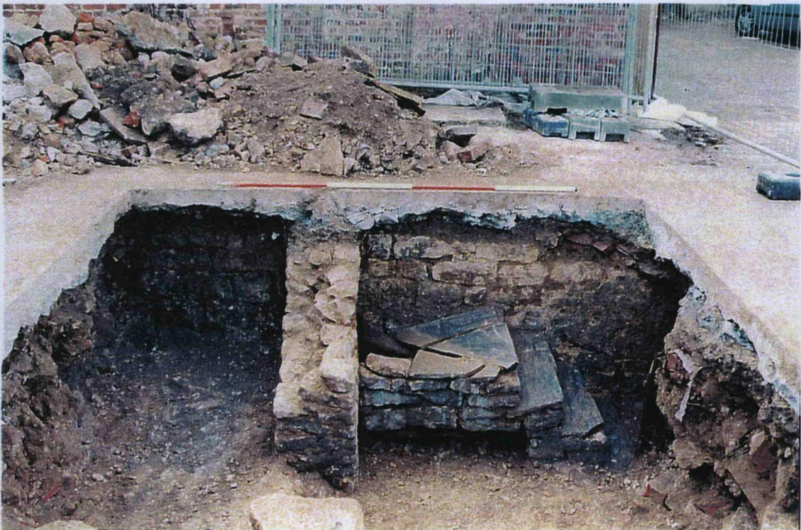
Plate 4. Trench 2. Walls 2004, 2005 and staircase 2003. Facing south west