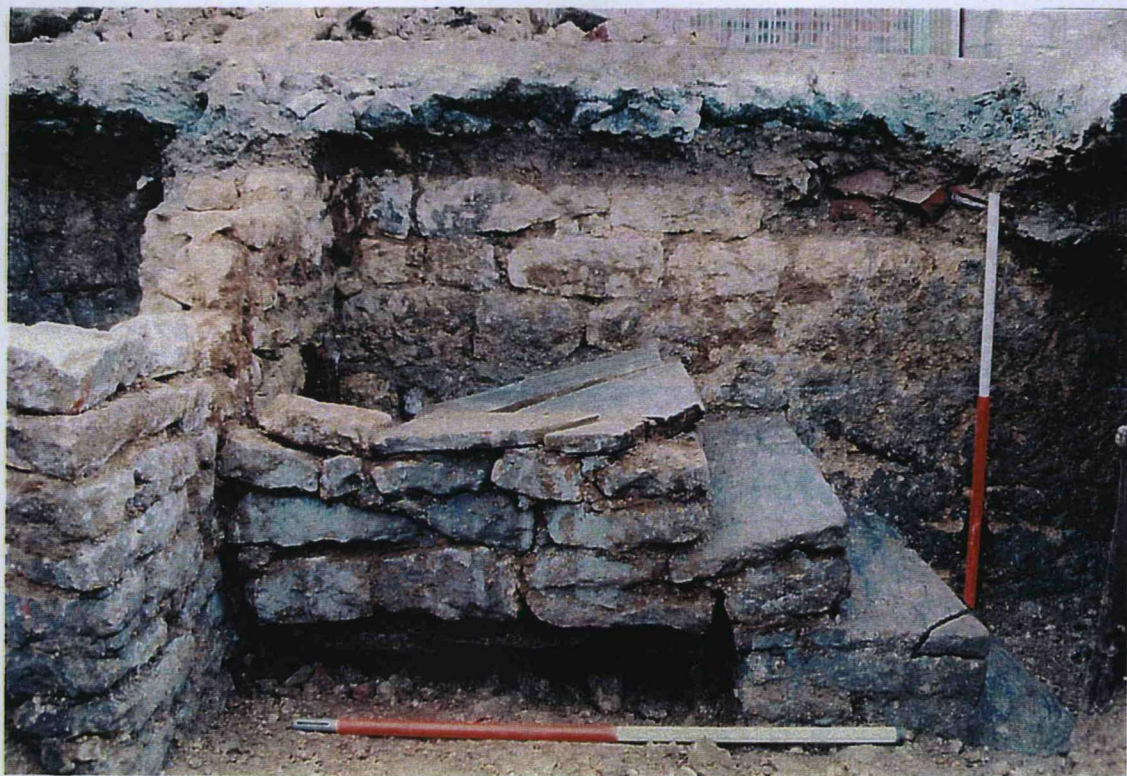
Plate 6. Trench 2. Staircase 2003 showing wooden lintel. Facing south west