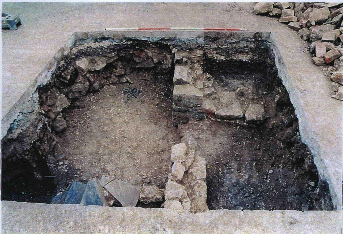
Plate 8. Trench 2. Walls 2004, 2008 and soil deposits 2006 and 2007. Facing north east