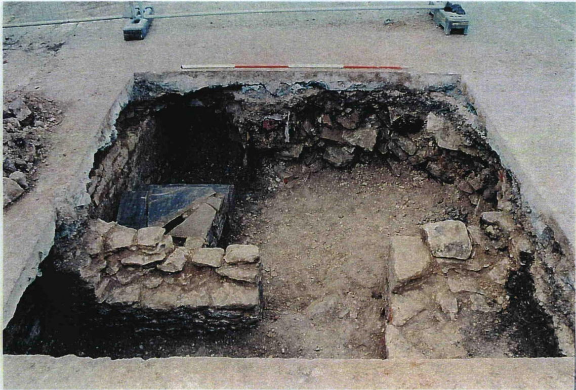
Plate 7. Trench 2. Walls 2004/2008 and rubble backfill 2009. Facing north west