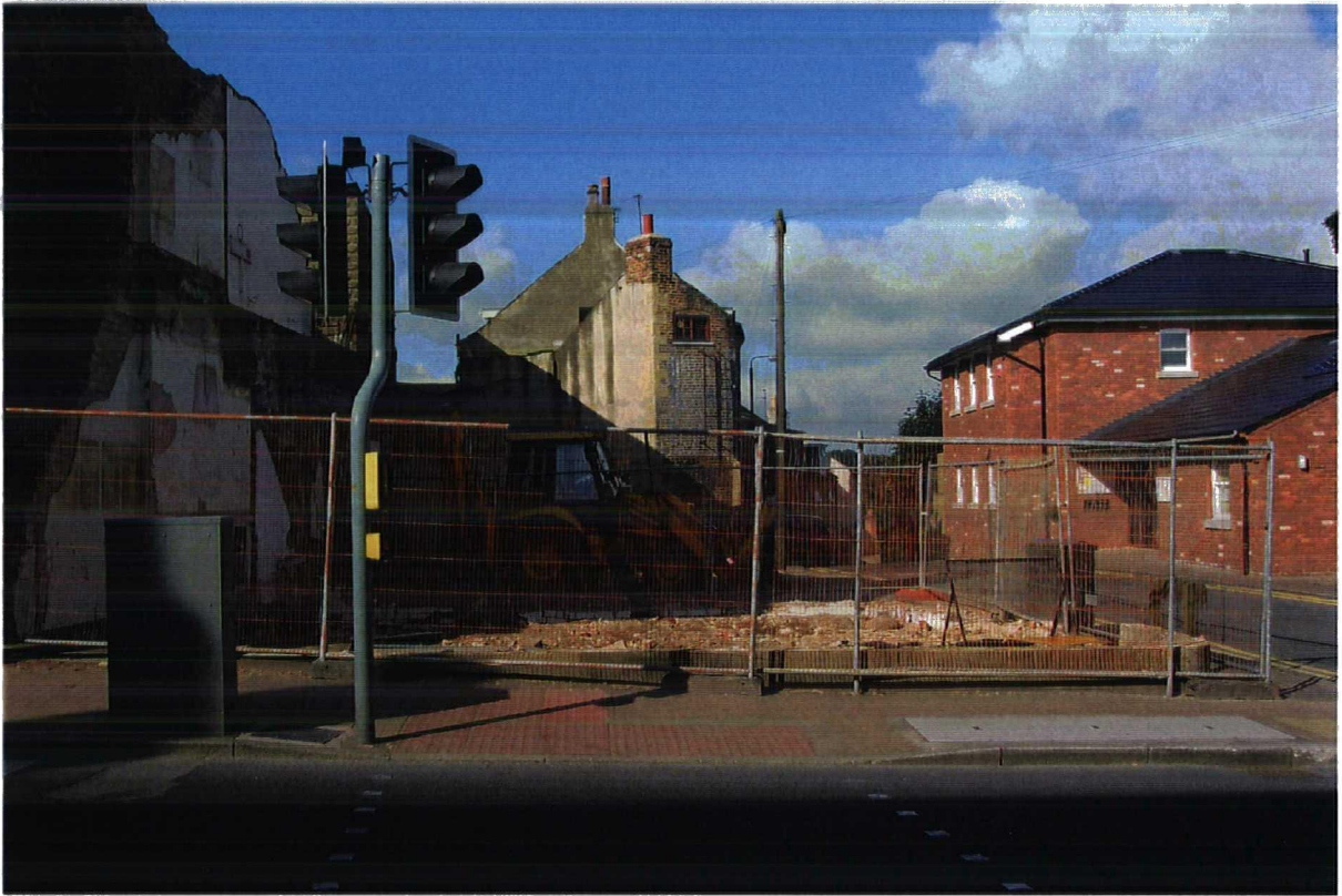
Plate 1. View of Site. Facing south-west.