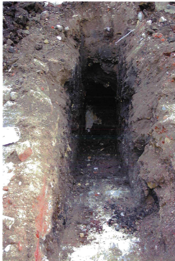
Plate 5. Test Pit 2 Excavation. Facing north-east.