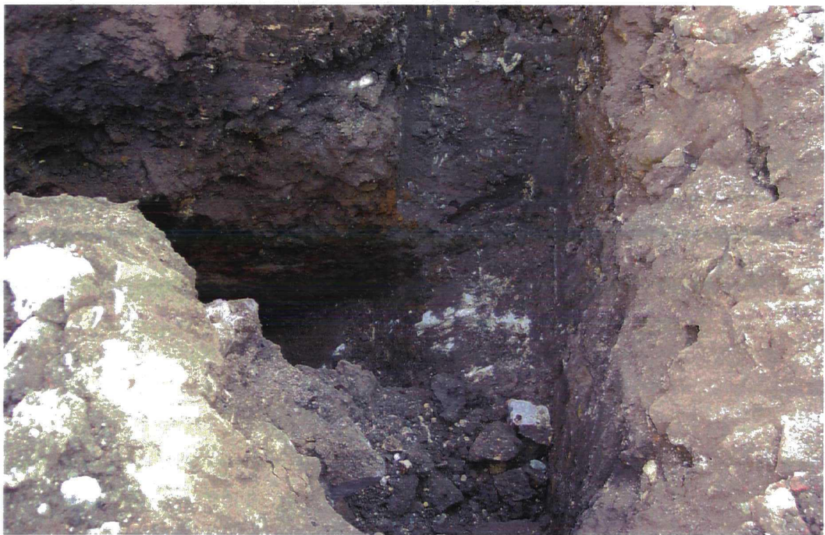
Plate 6. Test Pit 1. South-west section. Facing north-east.