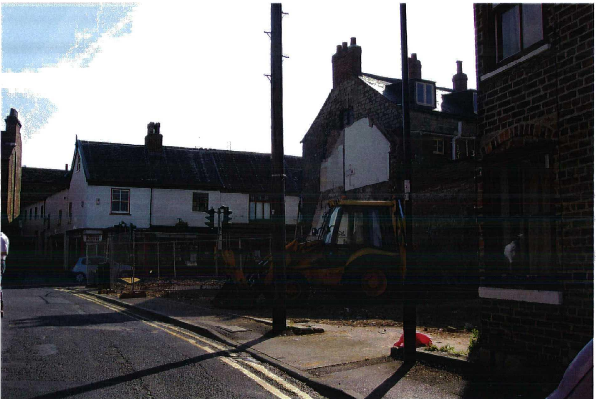
Plate 2. View of Site. Facing north-east.