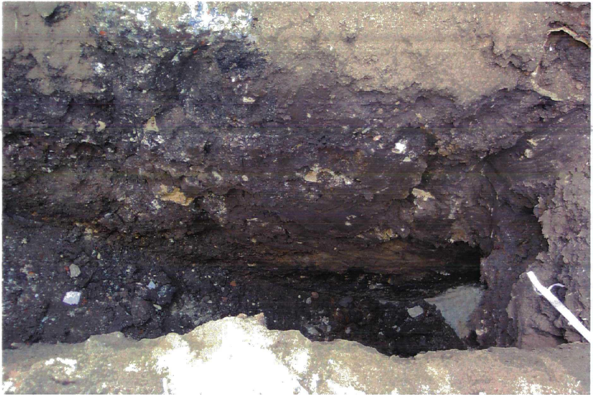
Plate 7. Test Pit 2. South-east section. Facing north-west.