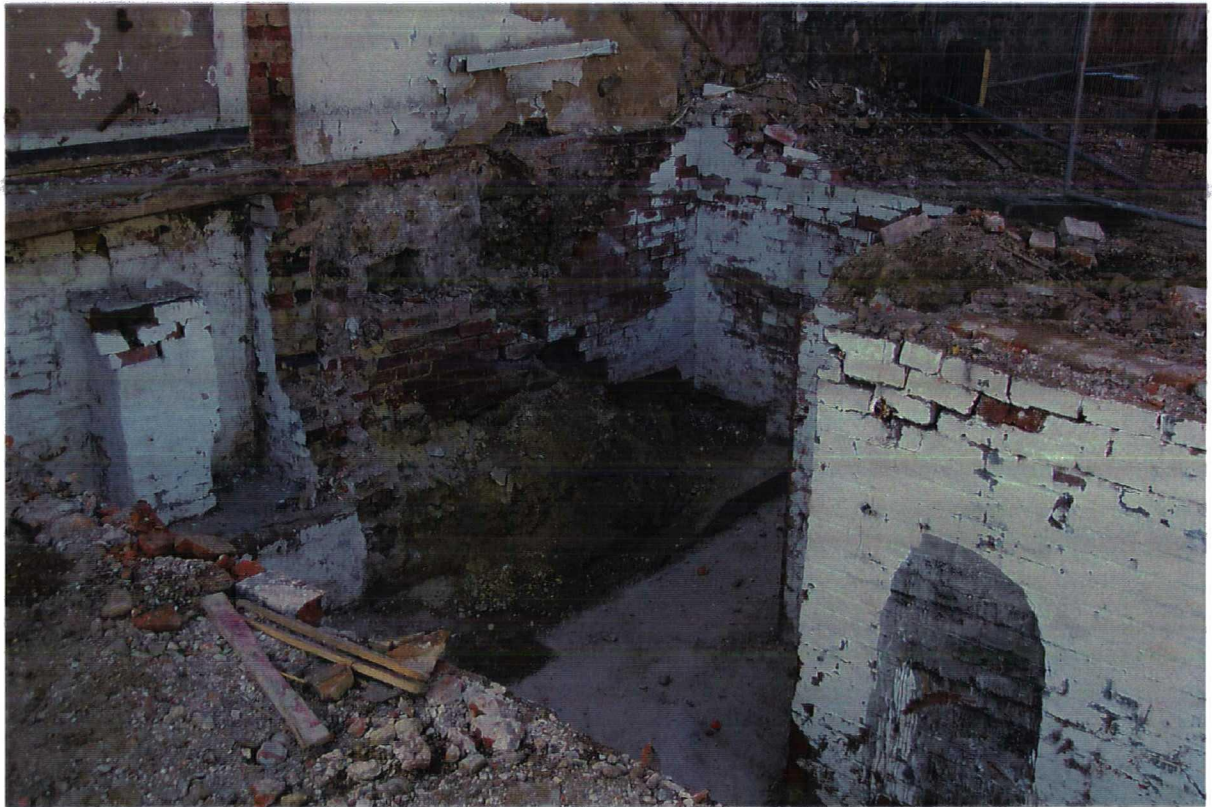
Plate 3. View of cellar. Facing north.