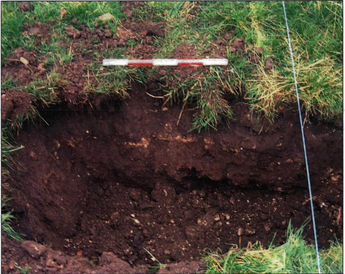
Plate 1. Example of an excavated foundation trench. (scale of 0.50m).