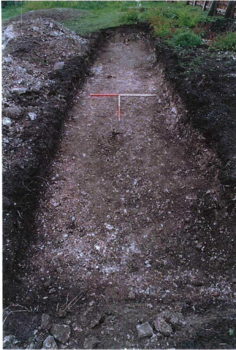
Plate 9. Trench 1. Facing West. Scale 2x1m