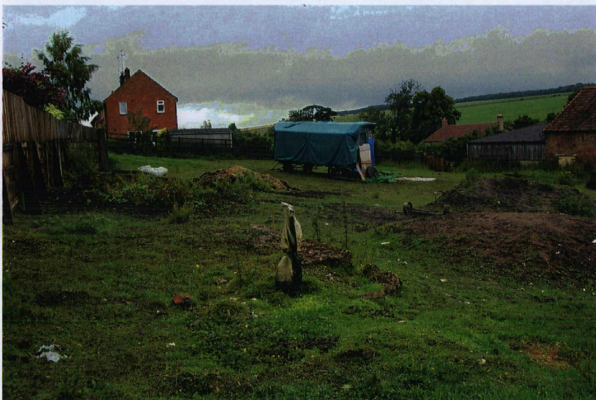
Plate 2. Low Farm paddock. Facing east.