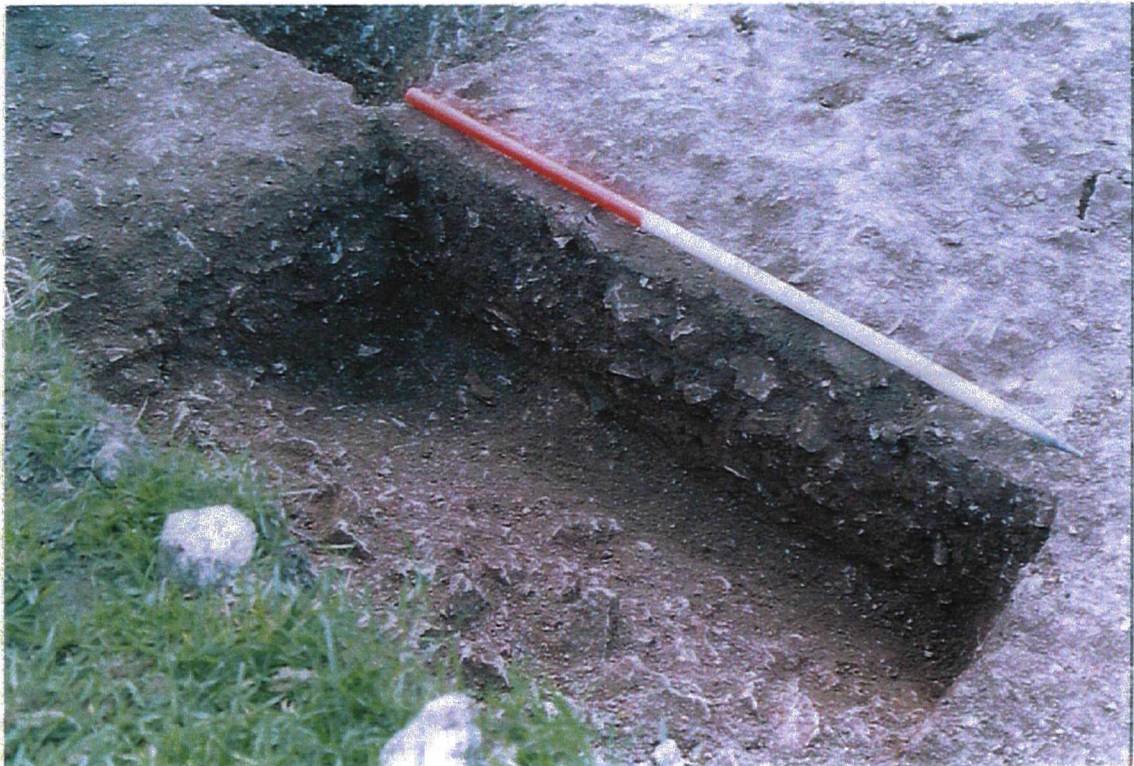
Plate 11. Trench 2. Ditch Section 2010. Facing South-East. Scale 1m