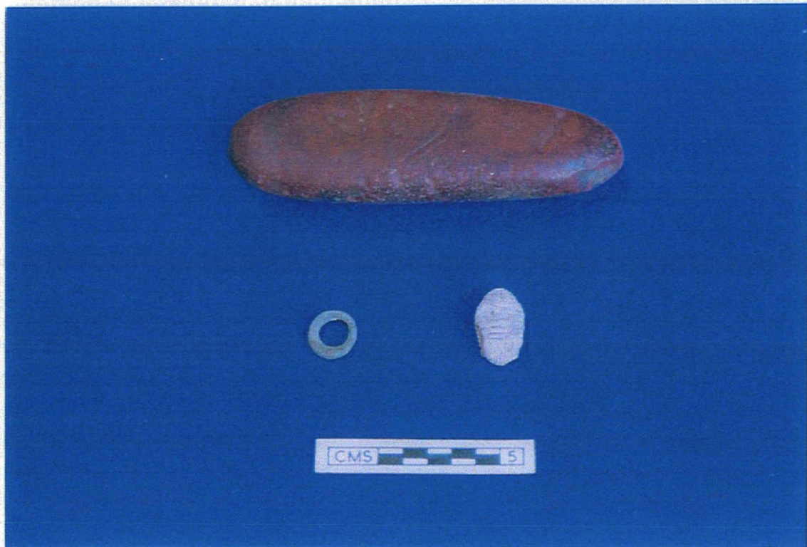
Plate 15. Small Finds. Whetstone, Ring, Carved Stone