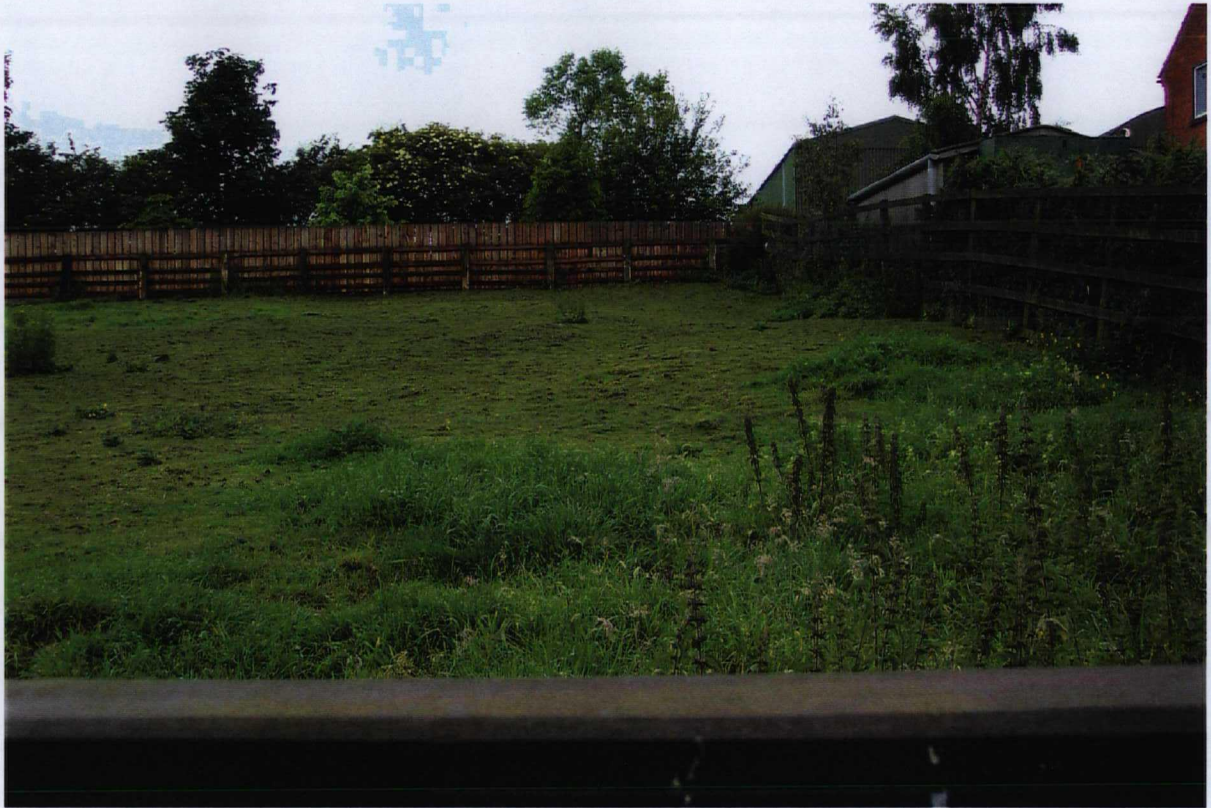
Plate 3. Low Farm paddock. Location of Trench 2 Prior to excavation. Facing north.