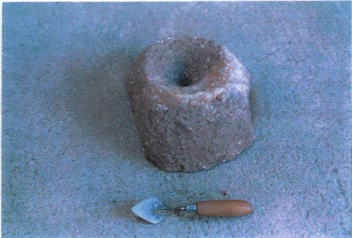
Plate 17. Beehive Quern Stone. Trowel Scale