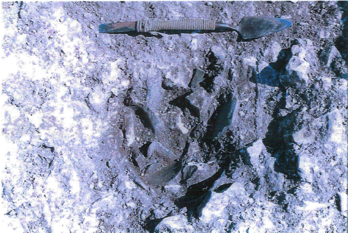
Plate 18. Trench 3. Collapsed Pot (In Situ). Scale 0.25m Trowel