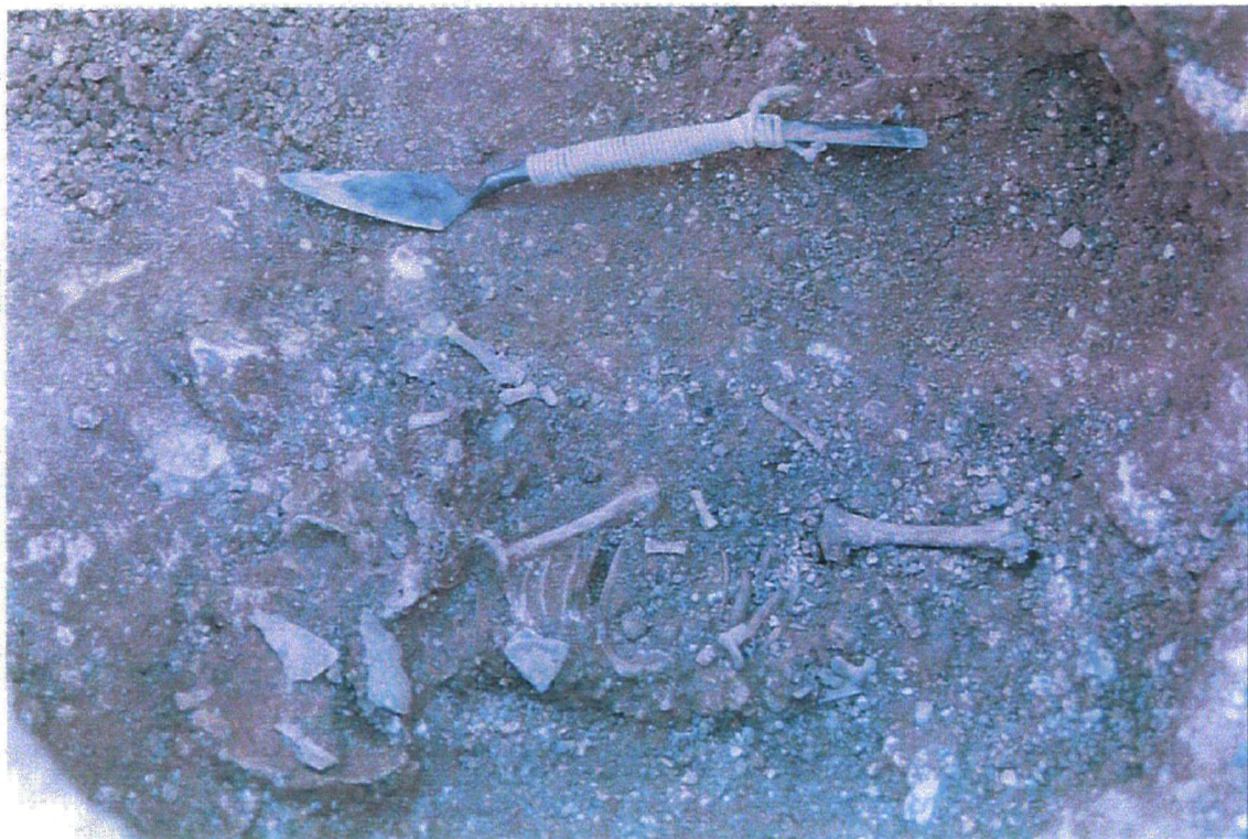
Plate 14. Trench 3. Infant Burial. 0.25m Trowel Scale