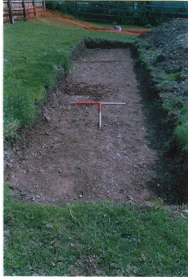
Plate 10. Trench 2. Facing East. Scale 2x1m