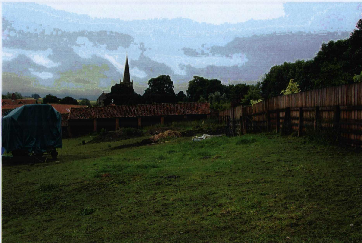
Plate 1. Low Farm paddock. Facing west.