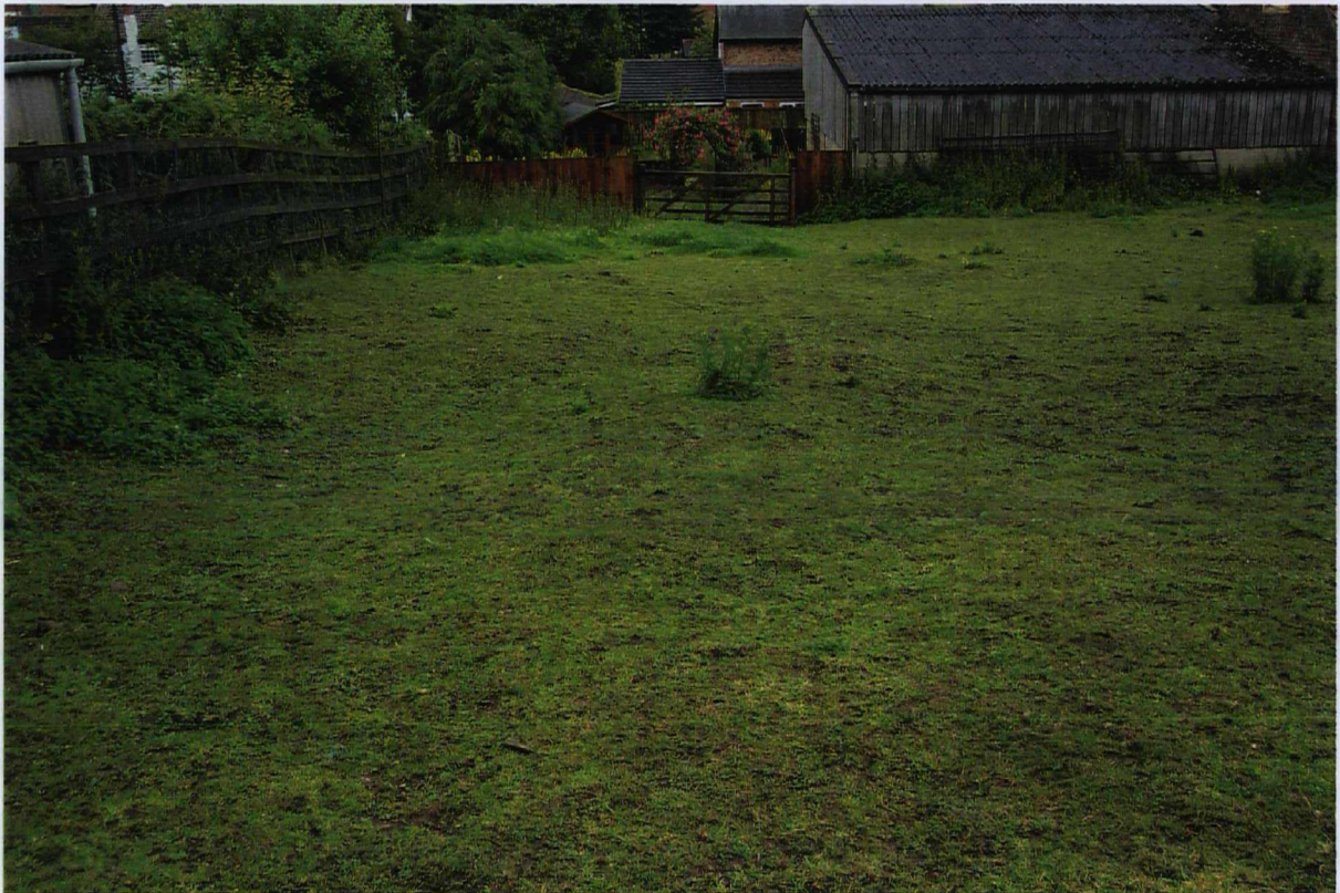
Plate 4. Low Farm paddock. Location of Trench 2 Prior to excavation. Facing south.