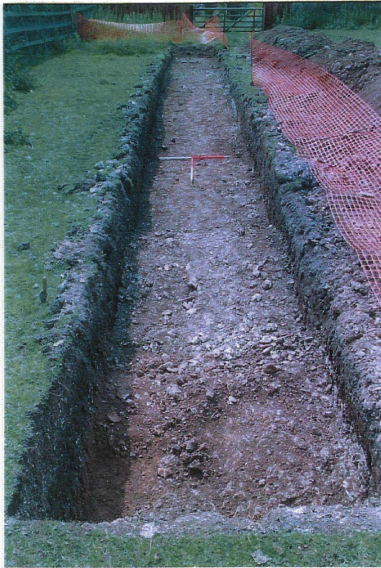
Plate 13. Trench 3. Facing South. Scale 2 x 1m