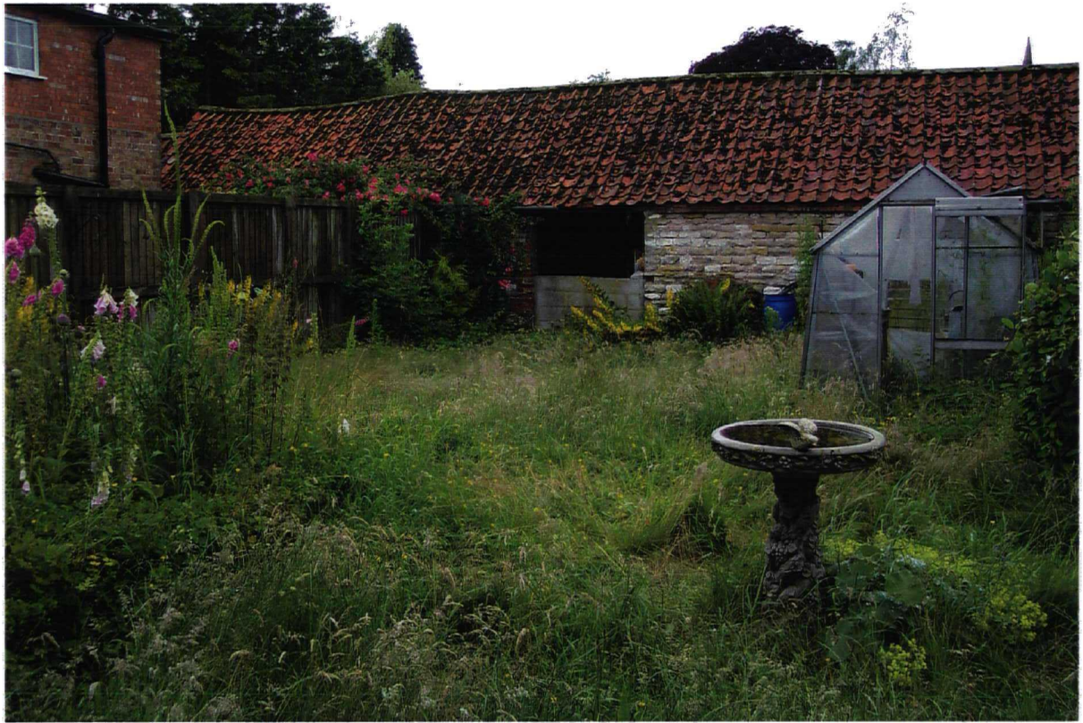
Plate 7. Low Farm garden. Location of Trench 4, prior to excavation. Facing west.