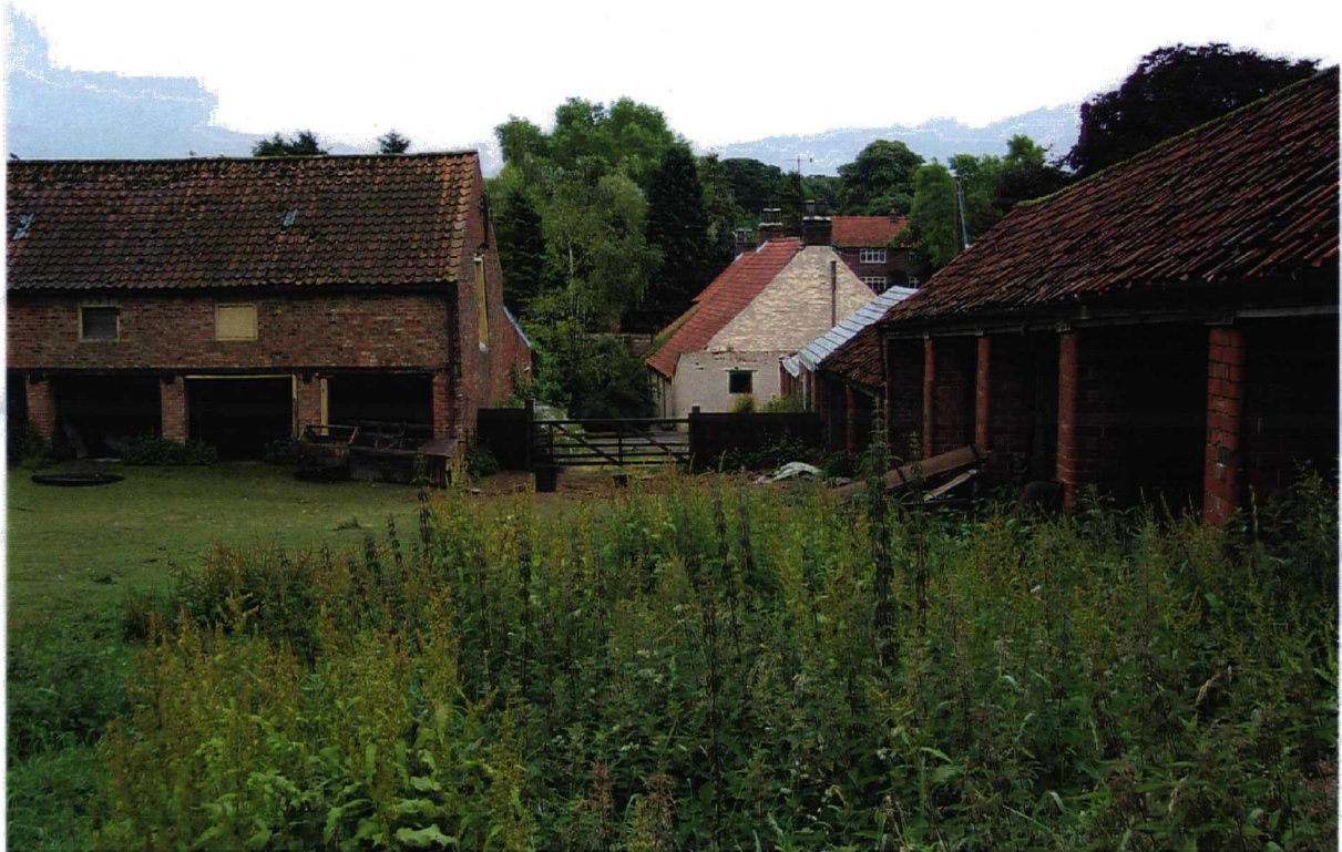
Plate 5. Low Farm paddock. Western sector. Facing south.