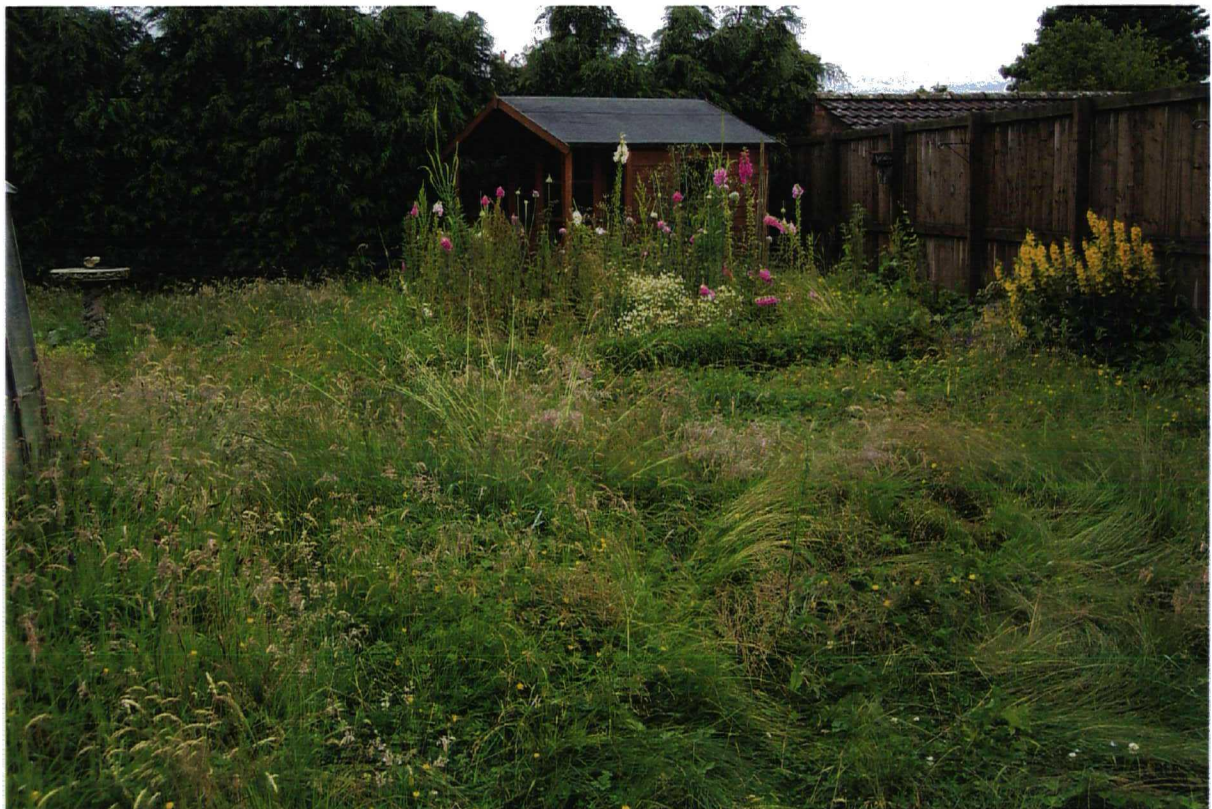
Plate 8. Low Farm garden. Location of Trench 4, prior to excavation. Facing east.