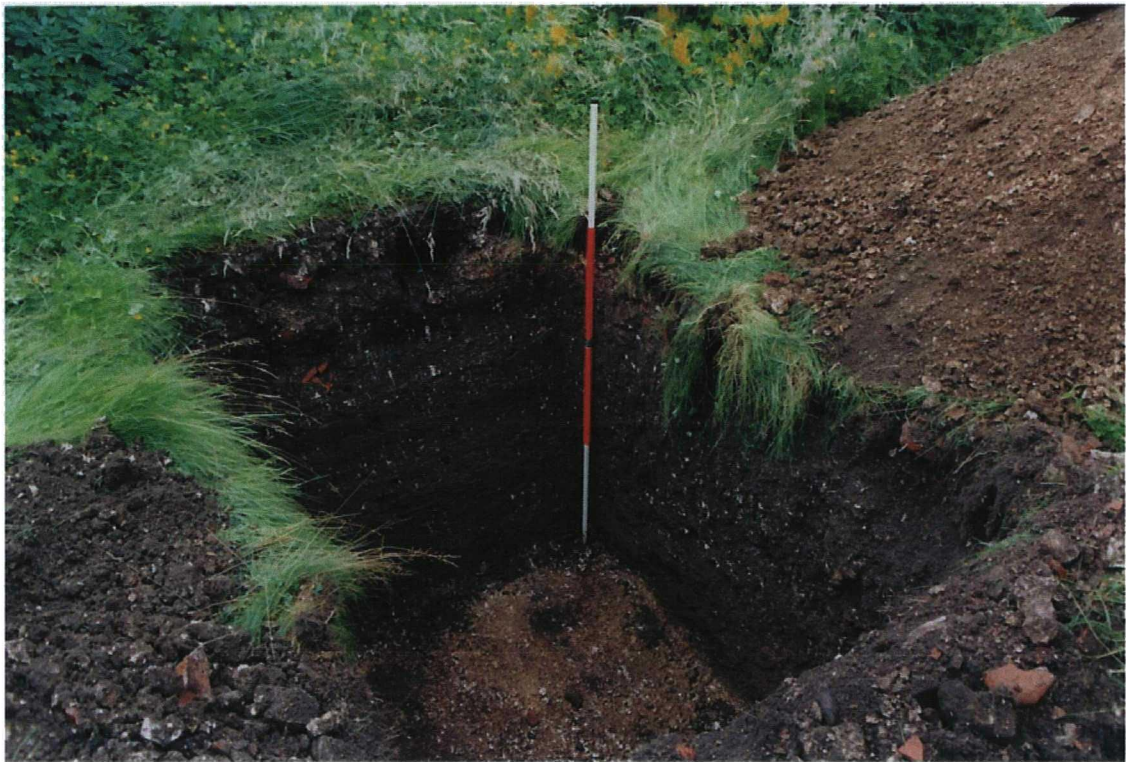
Plate 19. Trench 4. Section of Made Ground Deposits. Facing West. Scale 2m