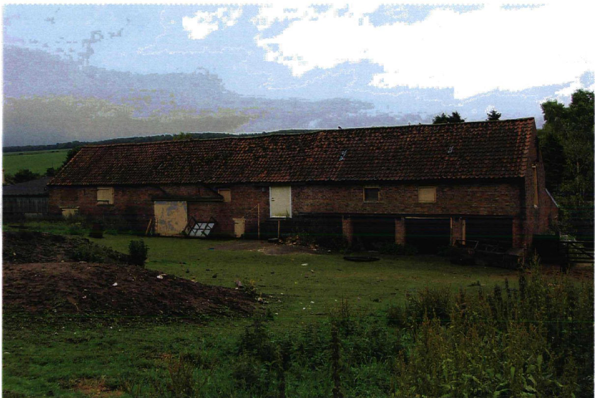
Plate 6. Low Farm - Barn. Facing south.