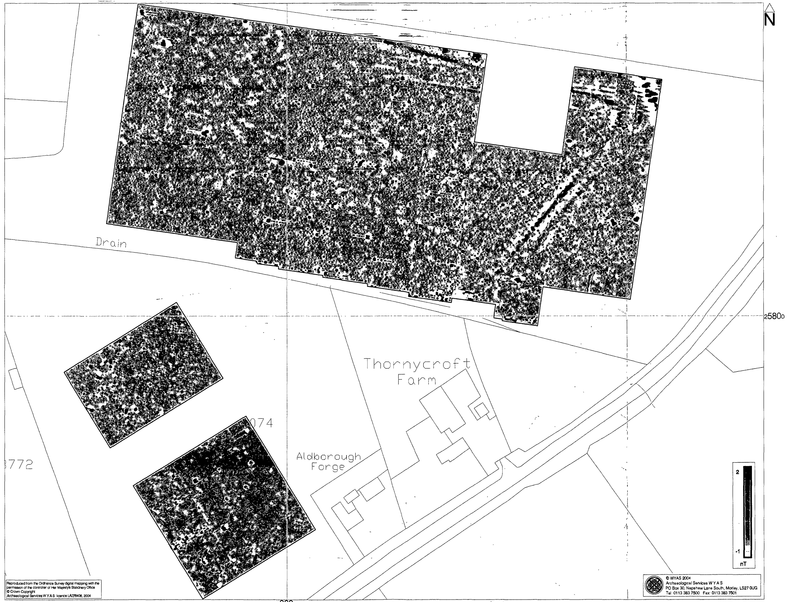
Fig. 3. Greyscale plot of gradiometer data