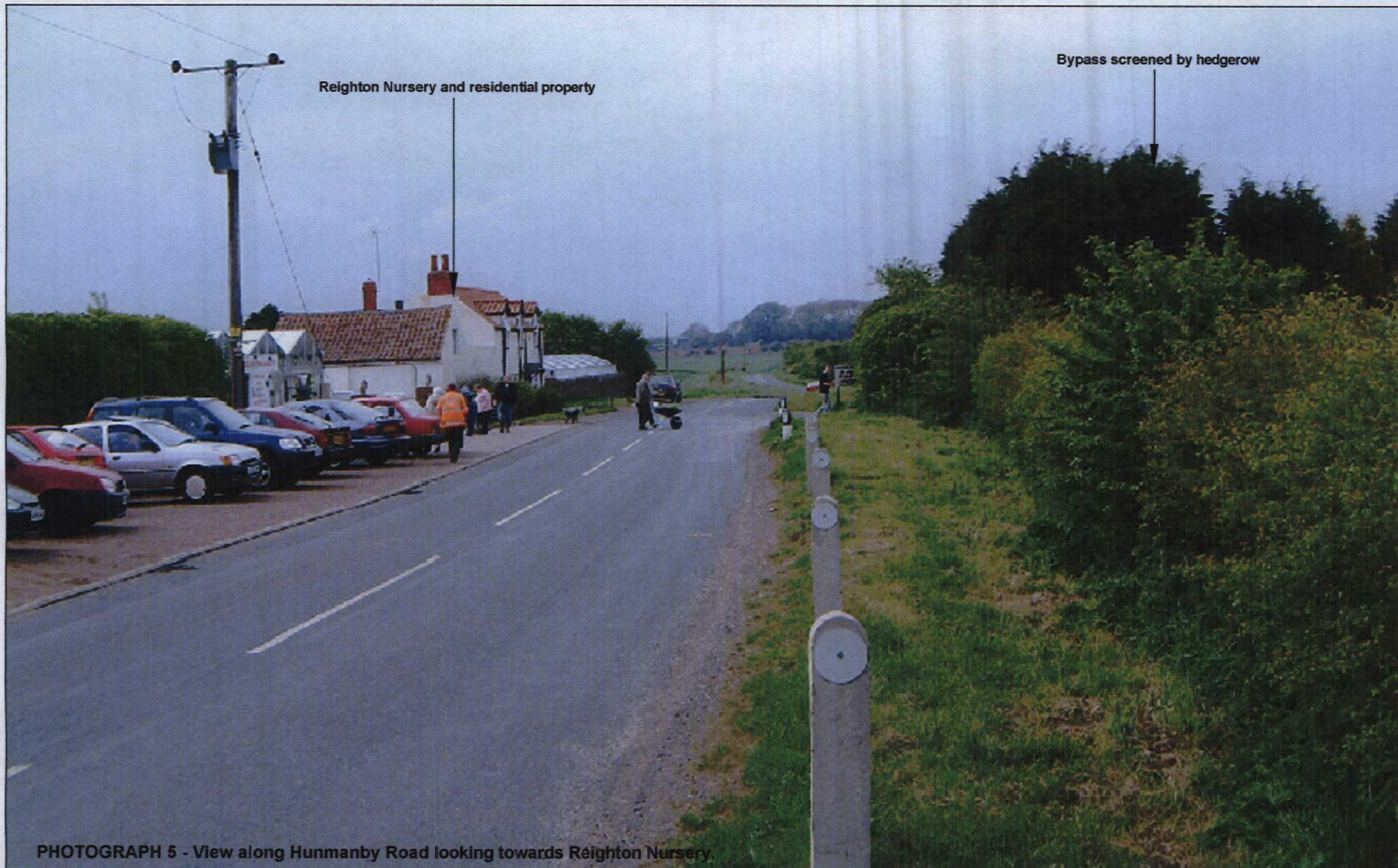
PHOTOGRAPH 5 - View along Hunmanby Road looking towards Reighton Nursery.