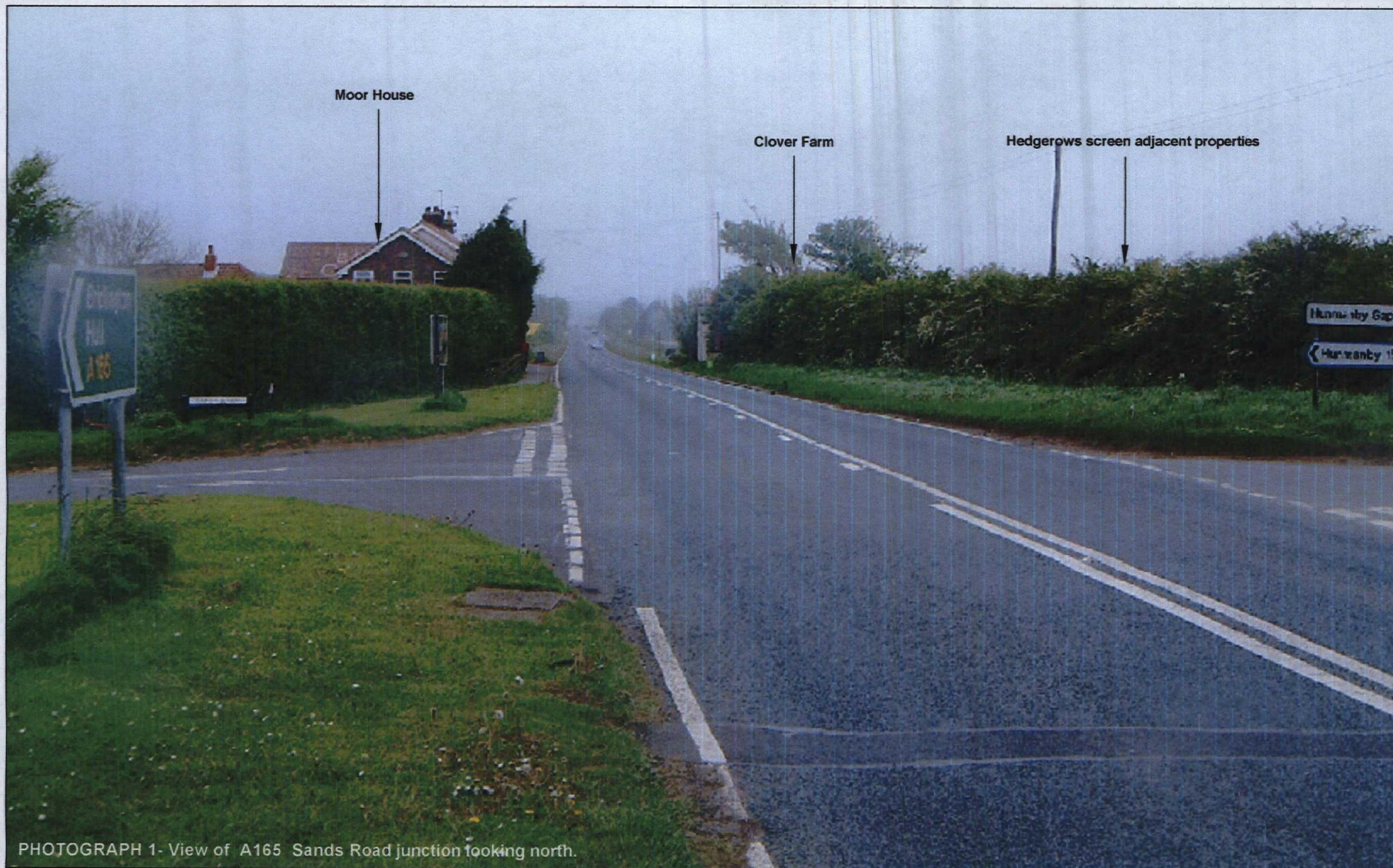
PHOTOGRAPH 1- View of A165 Sands Road junction looking north.