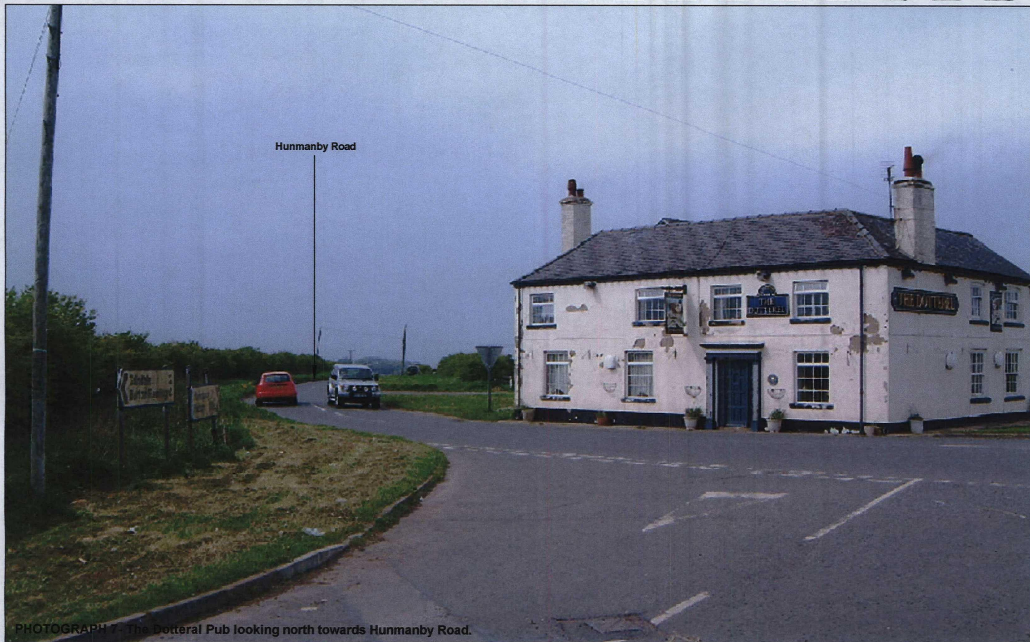
PHOTOGRAPH 7 - The Dotteral Pub looking north towards Hunmanby Road.