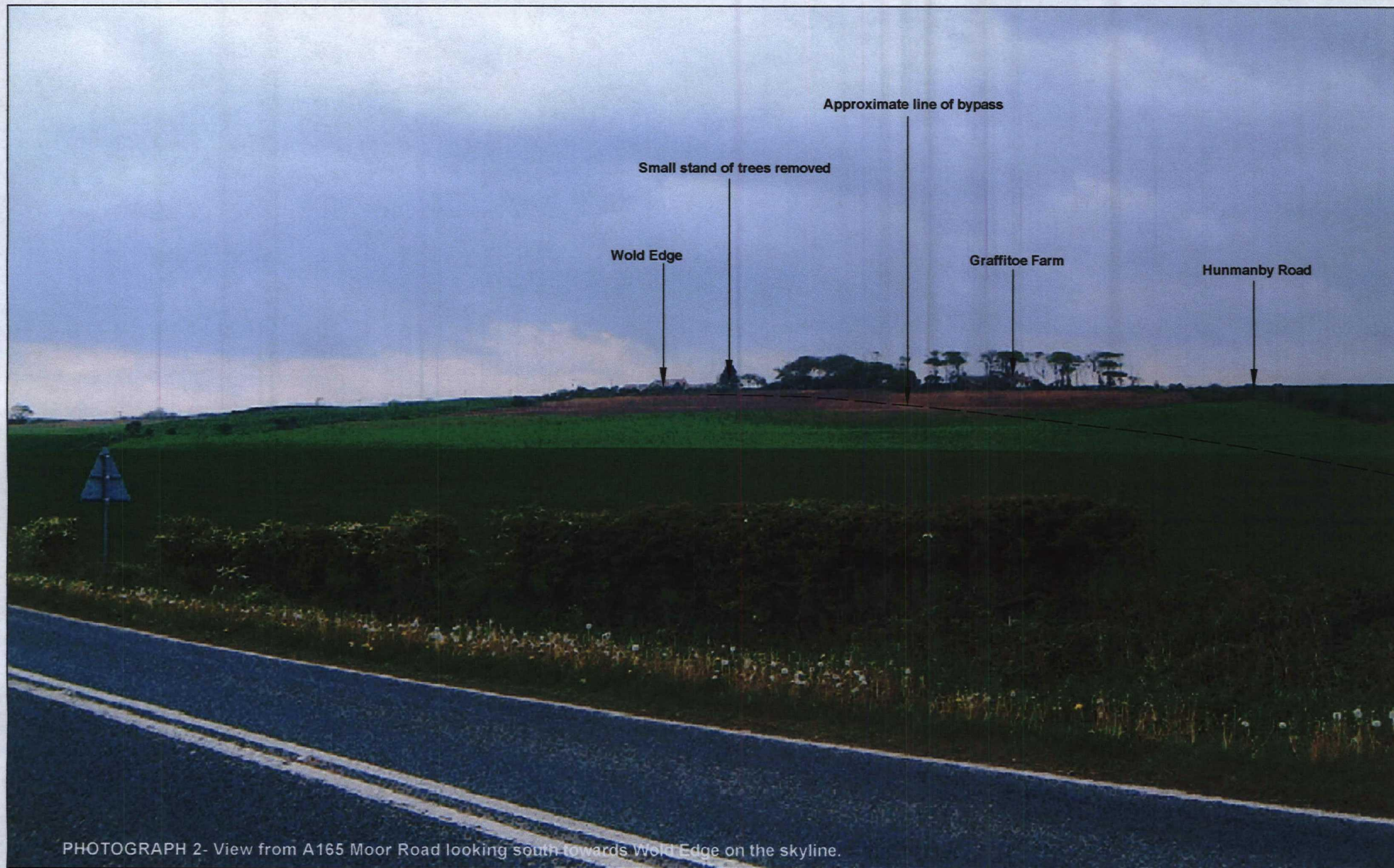
PHOTOGRAPH 2- View from A165 Moor Road looking south towards Wold Edge on the skyline.