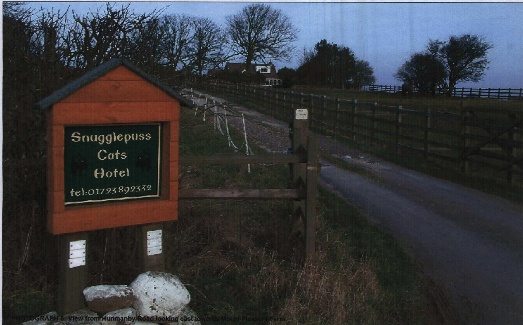
PHOTOGRAPH 6- View from Hunmanby Road looking east towards Mount Pleasant Farm.