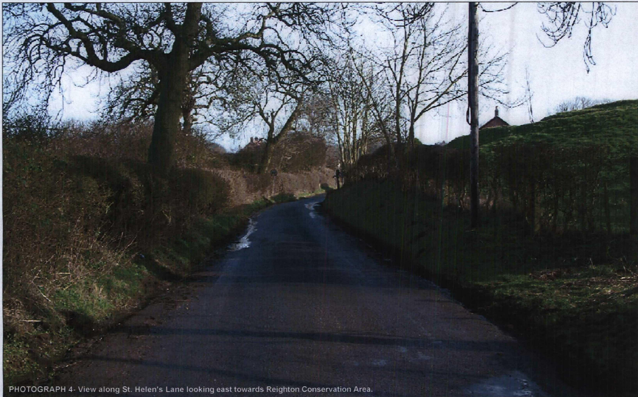
PHOTOGRAPH 4- View along St. Helen's Lane looking east towards Reighton Conservation Area.