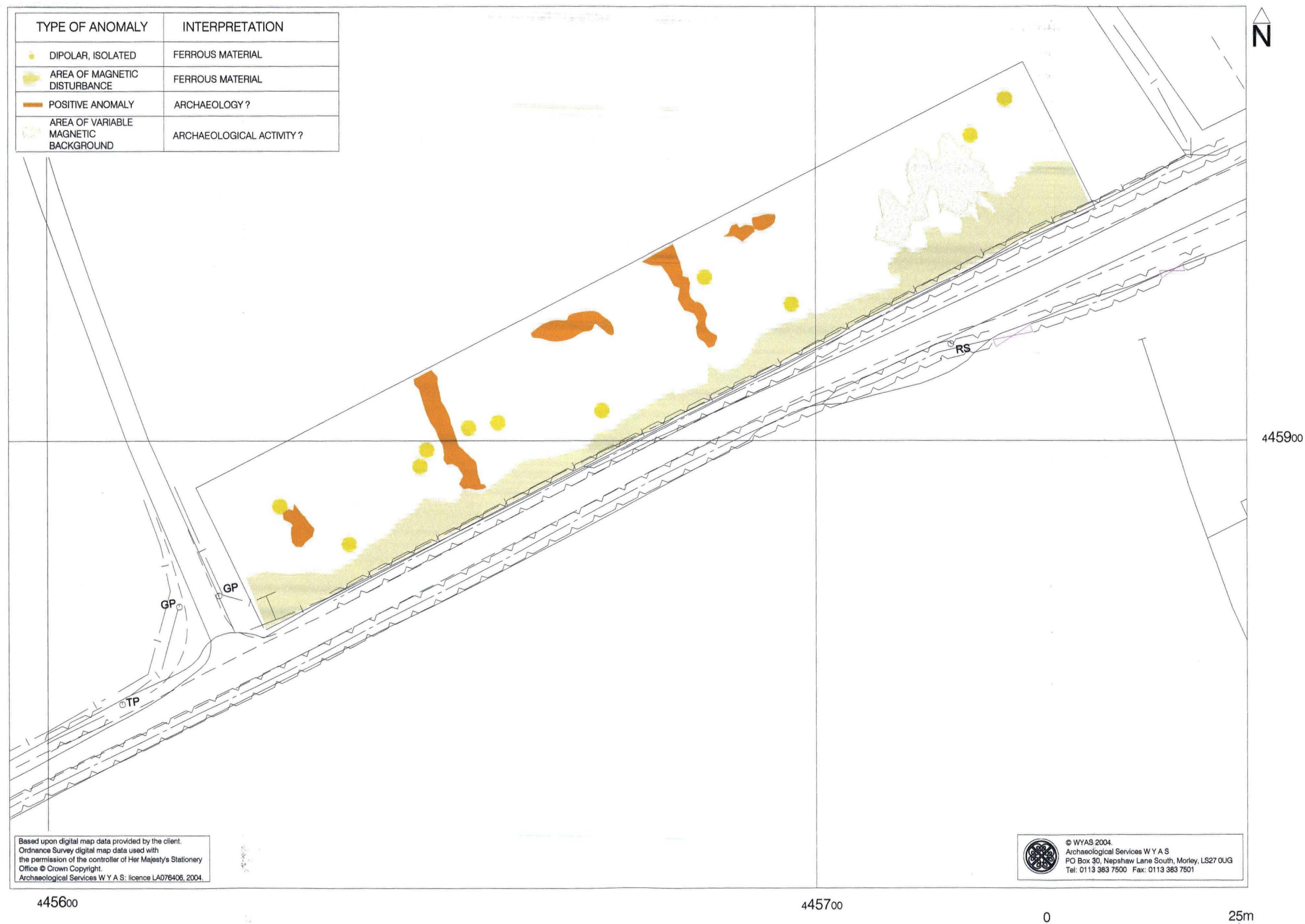
Fig. 10. Interpretation of magnetometer data: Field 3