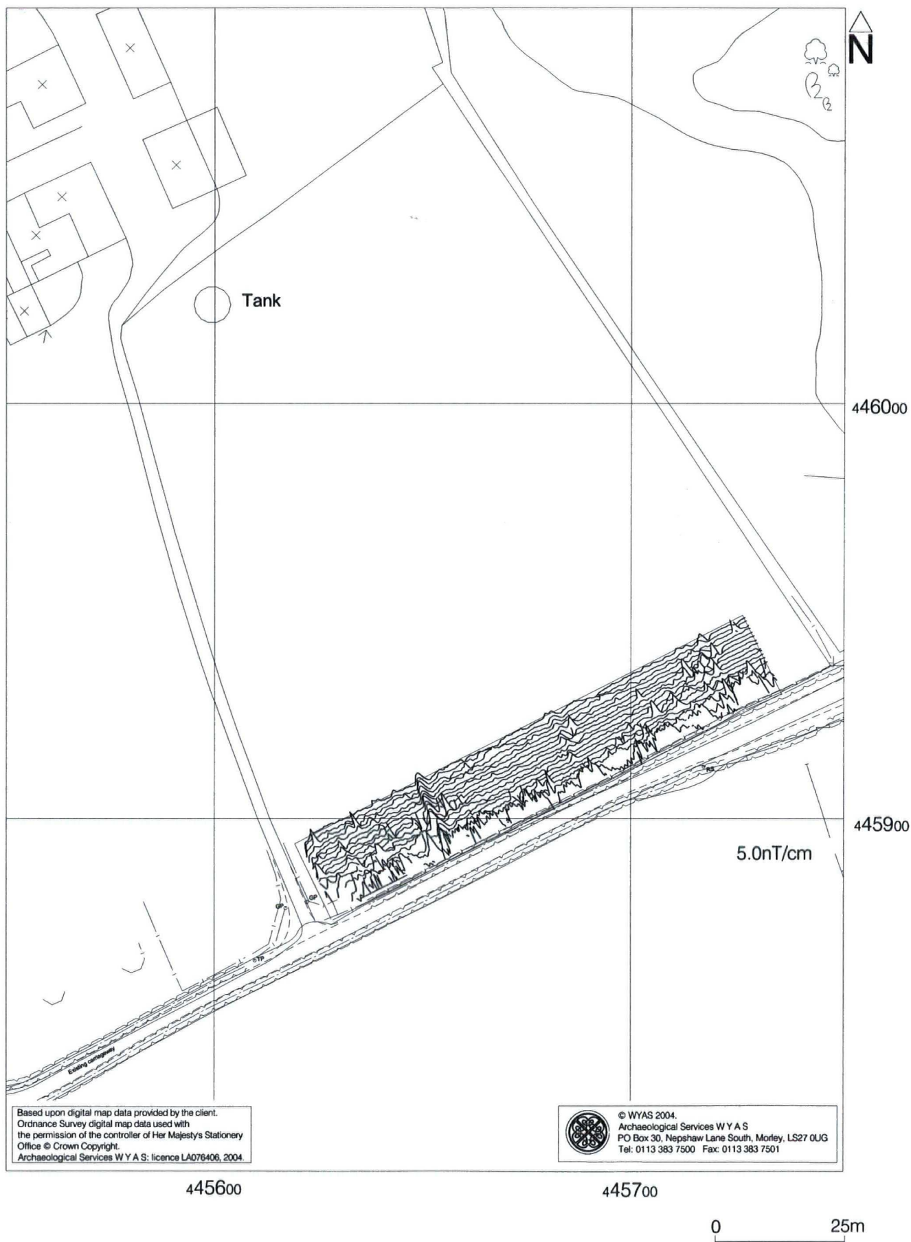
Fig. 8. X-Y trace plot of magnetometer data: Field 3.