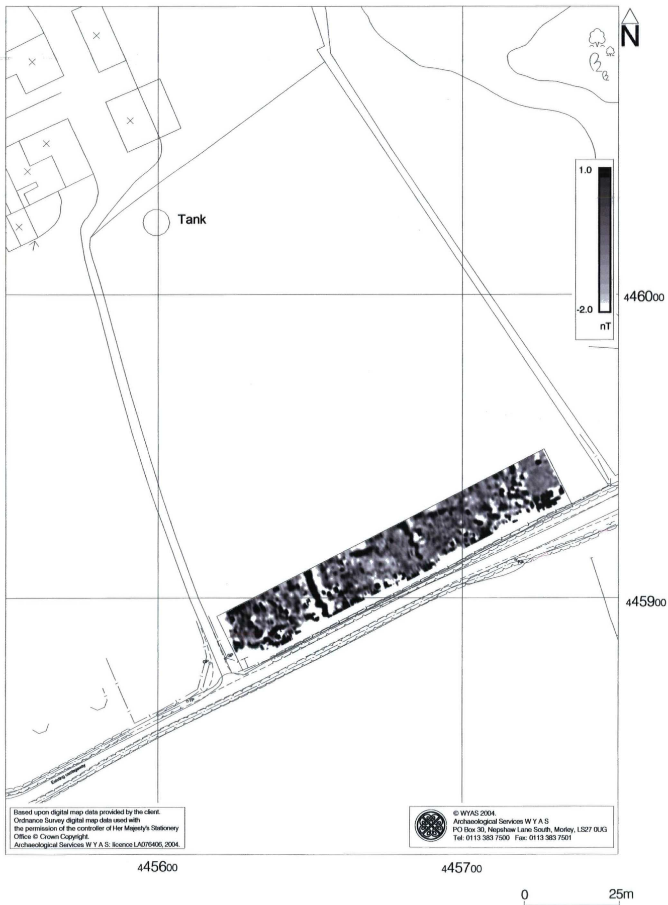
Fig. 6. Plot showing greyscale magnetometer data: Field 3.