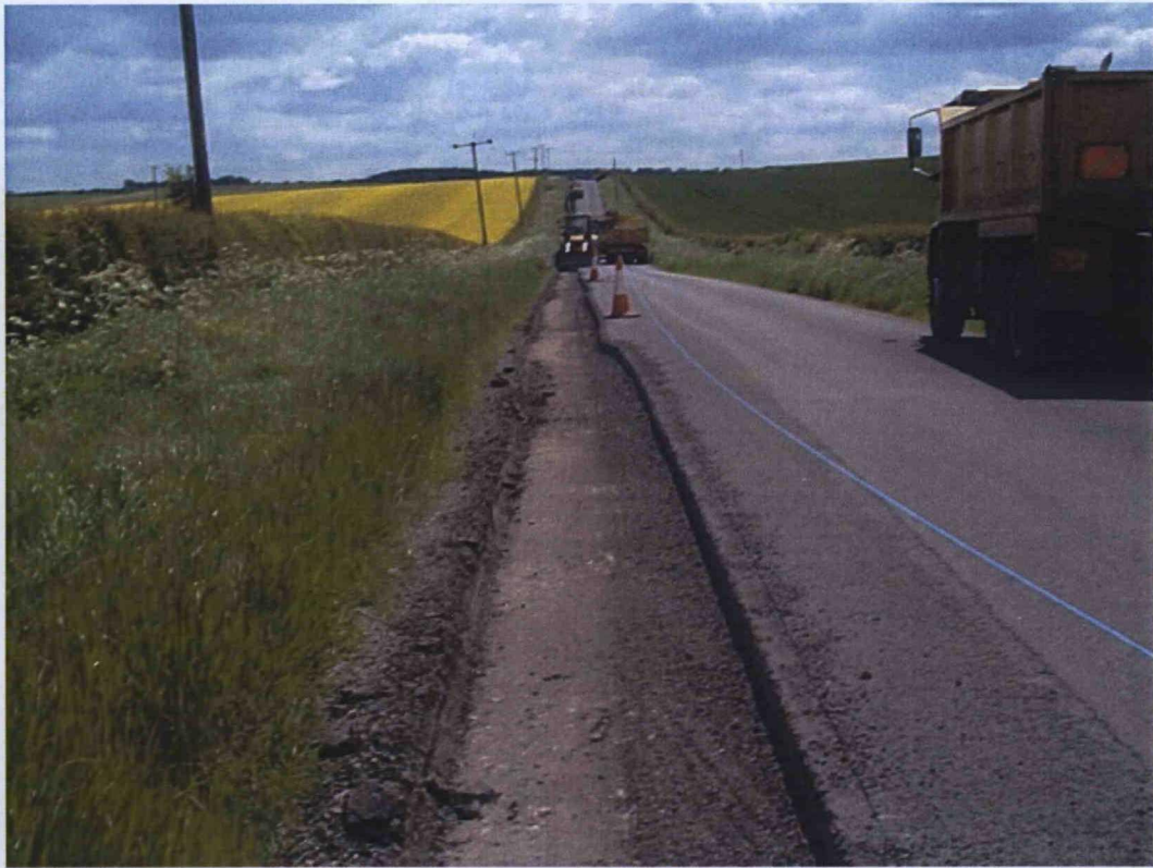
Plate 1. Road maintenance, facing south east