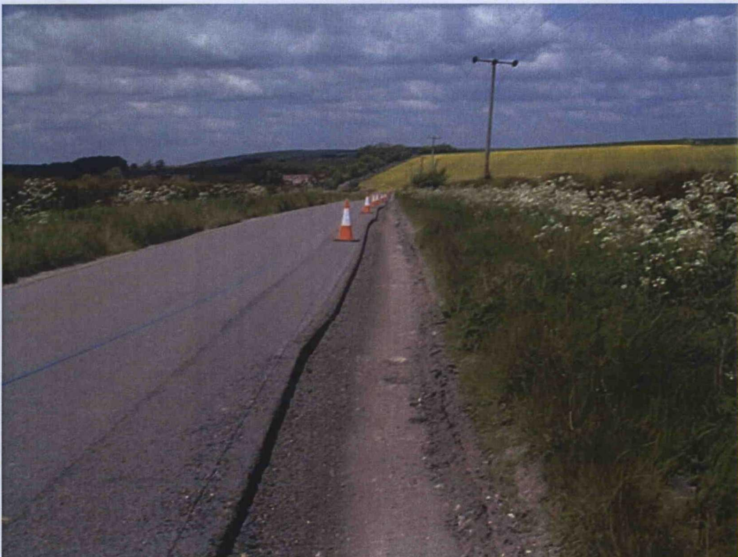
Plate 2. Road maintenance, facing north west