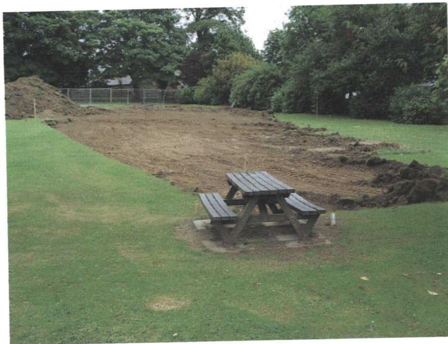
Richmond Skate Park