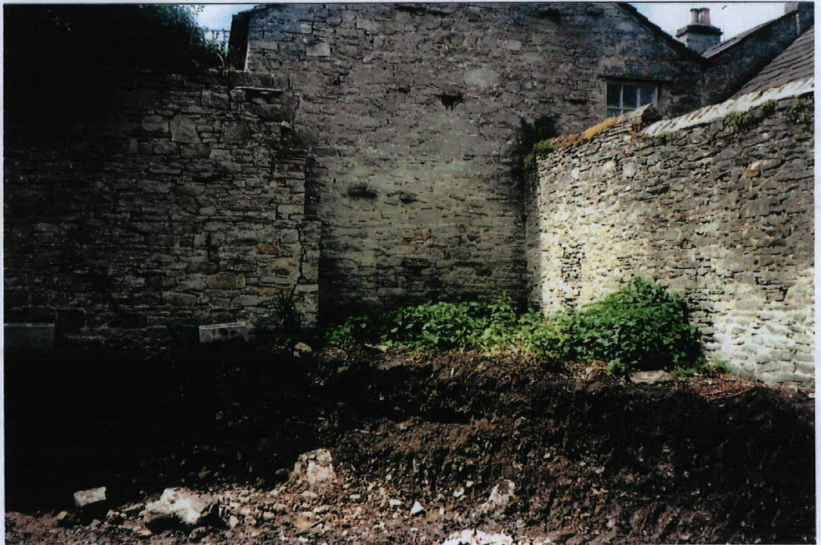
2 NORTH-WEST SIDE OF EXCAVATION SHOWING C19 DUMP AREA