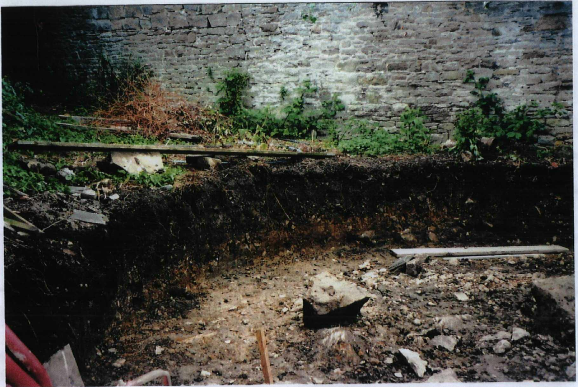
1. SOUTH-WEST SIDE OF EXCAVATION SHOWING NATURAL BELOW TOPSOIL