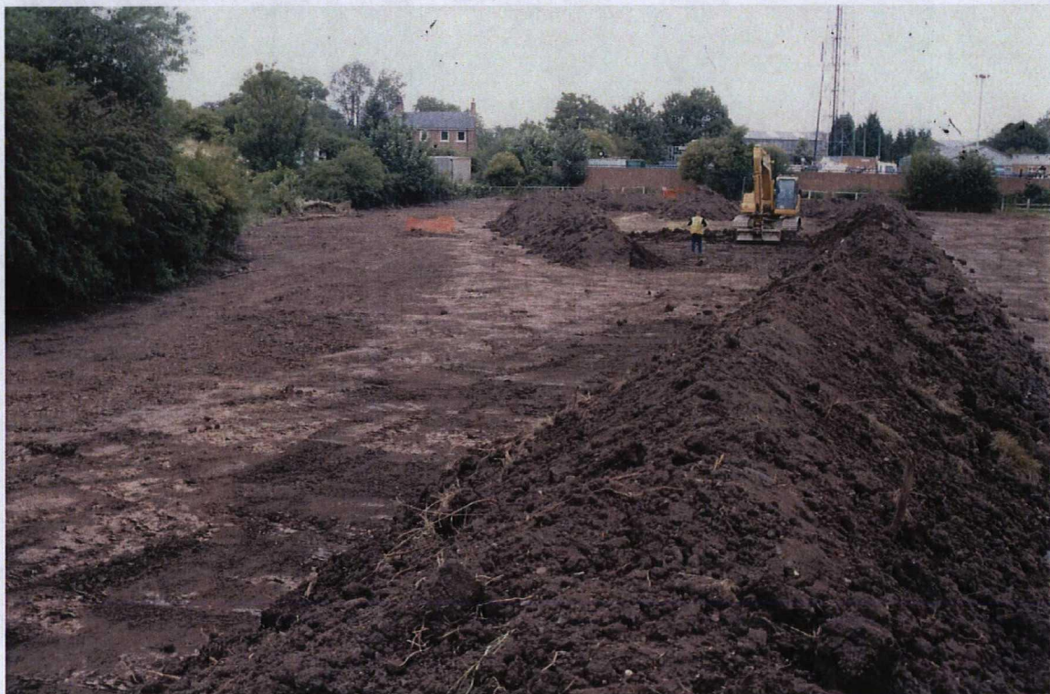
Plate 4. Topsoil stripping. Facing north