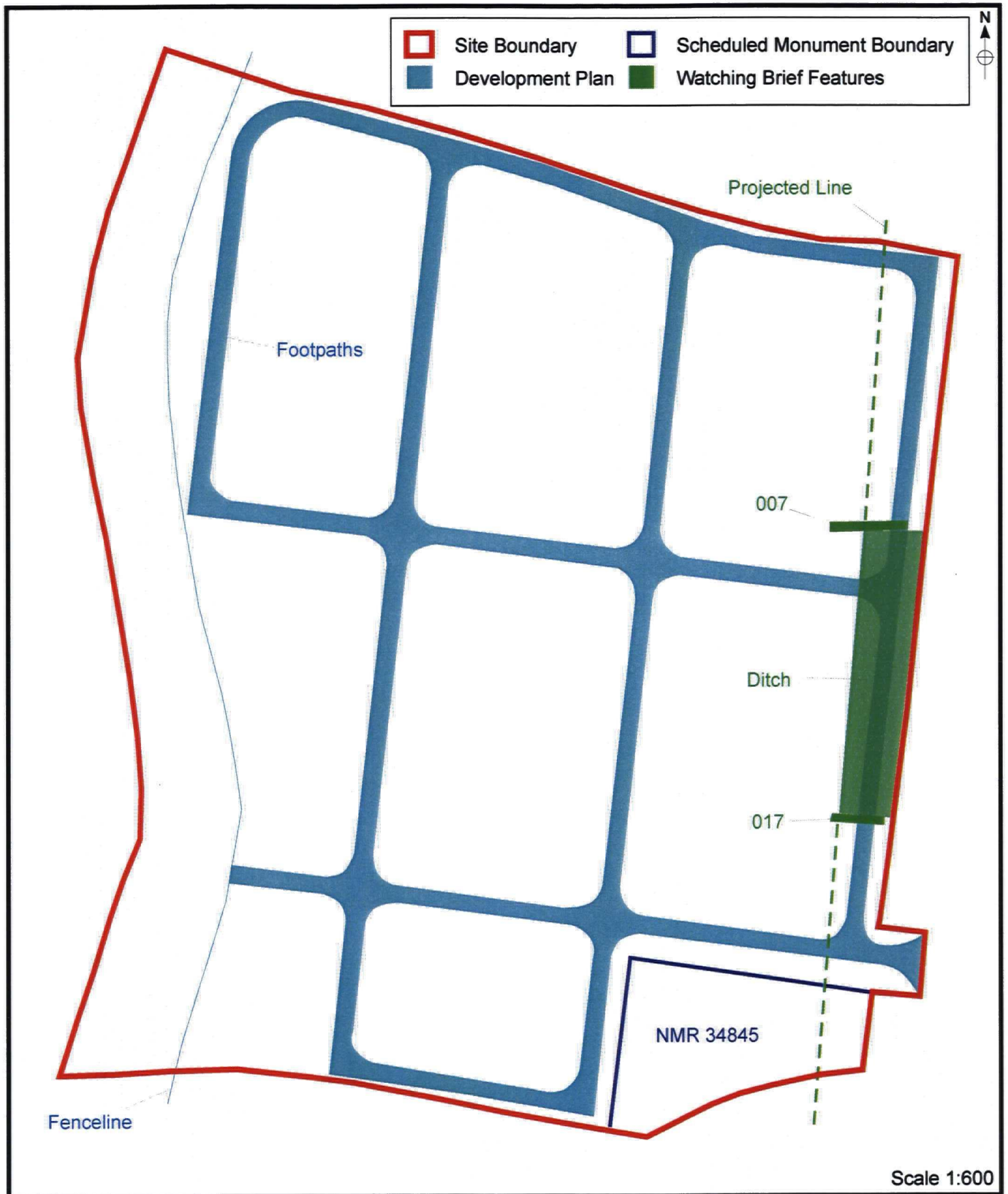
Figure 6. Archaeological Features on Development Plan