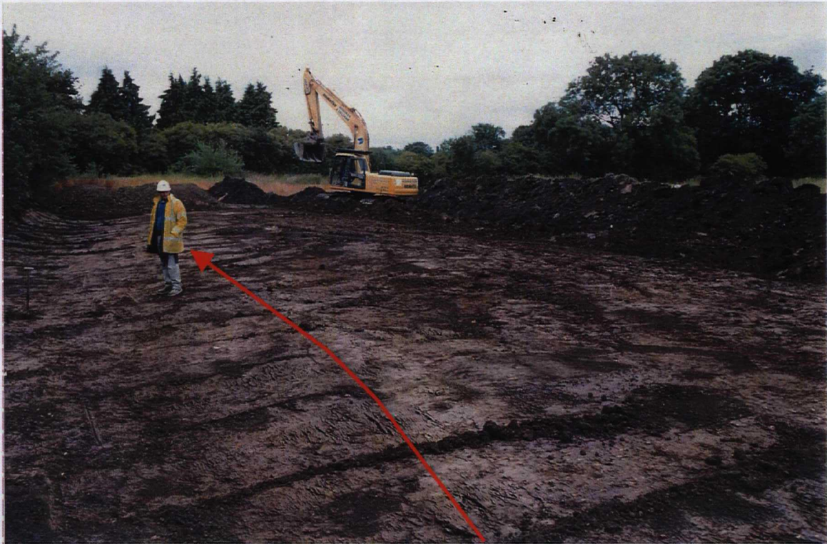
Plate 1. Eastern side of site showing location of ditch. Facing south