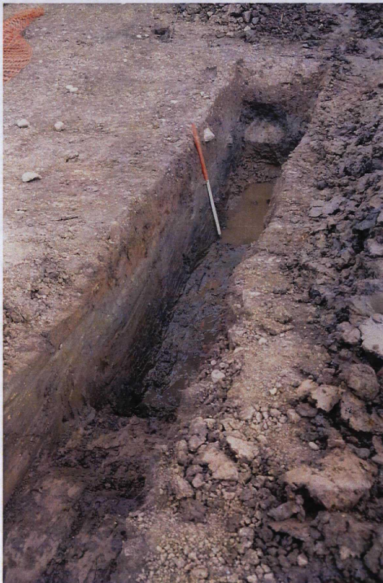
Plate 2. Ditch segment 007. Facing north east