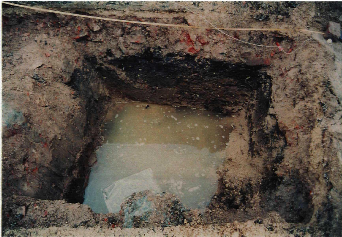
Plate 3. West Facing Section of Trench 1 Showing Flooding