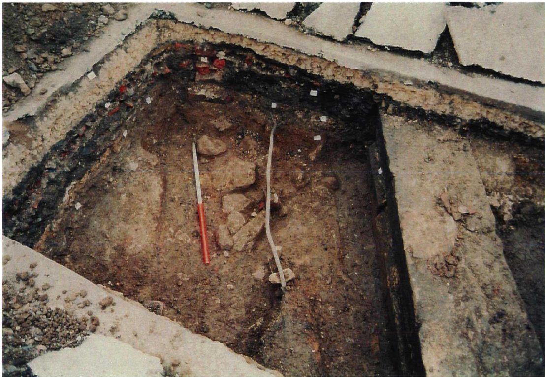
Plate 8. Overall View of Trench 3. Facing South East