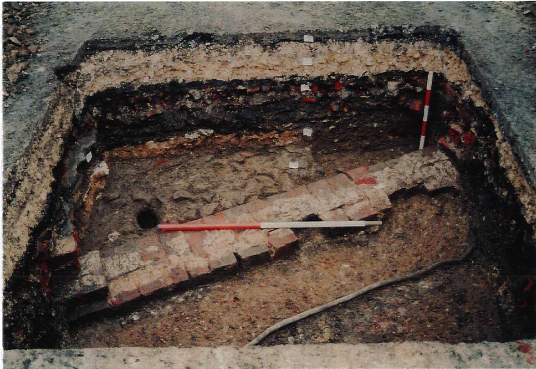
Plate 7. View of Modern Wall 3005. Facing East