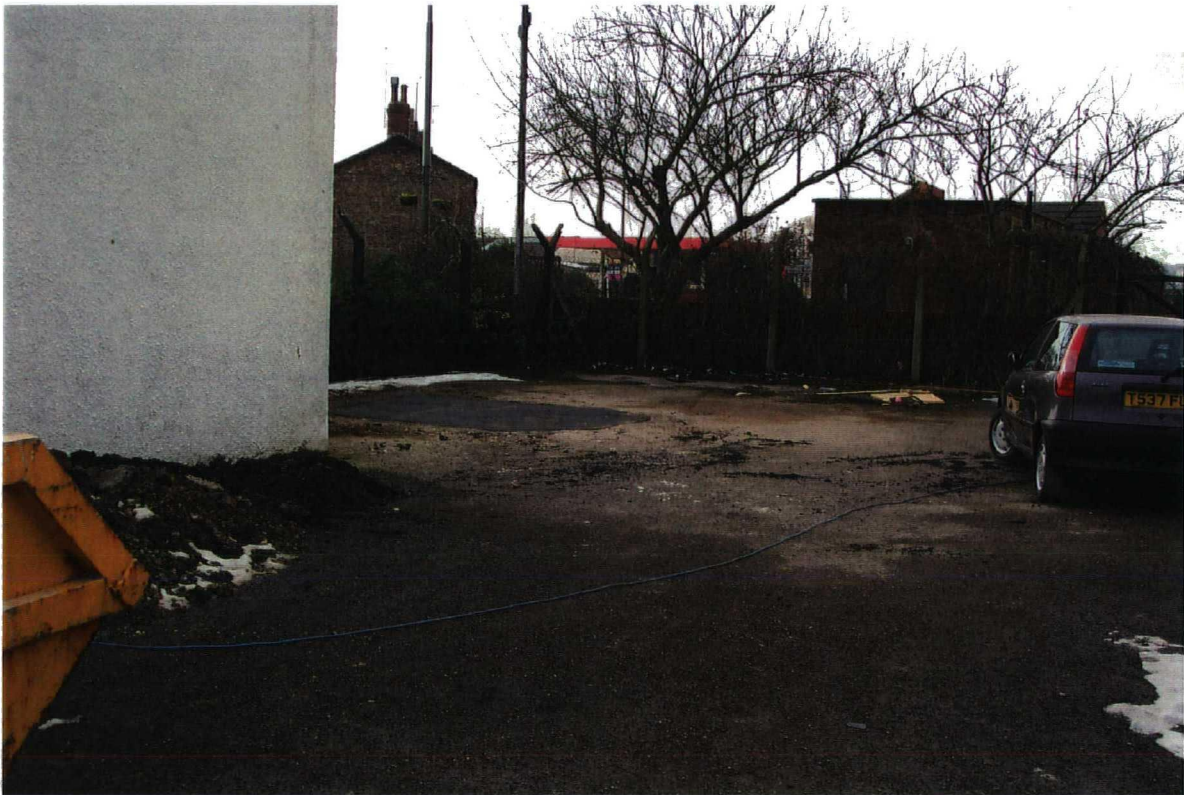
Plate 2. View of Site. Facing west.