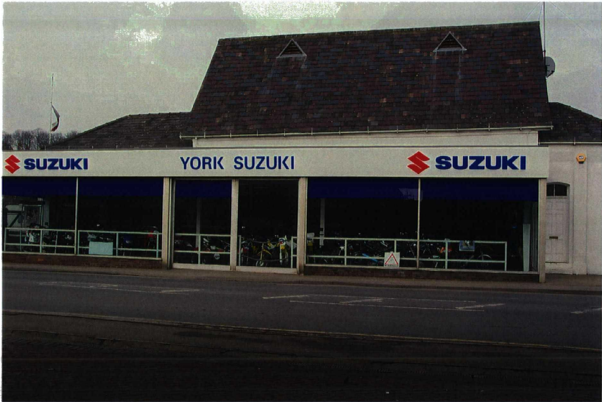
Plate 1. View of Site. Facing north.