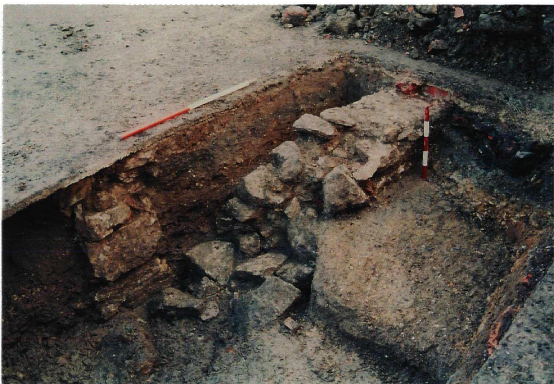
Plate 4. View of Walls 2014 and 2030. Facing South West