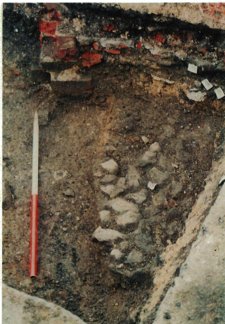
Plate 6. View of Cobbled Surface 3007. Facing North West