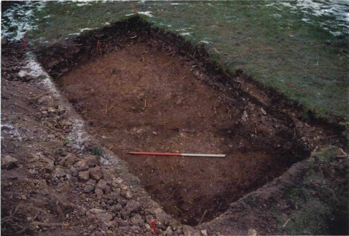
Figure 11. Trench 2. Modern Service Trench 2007. Facing North West