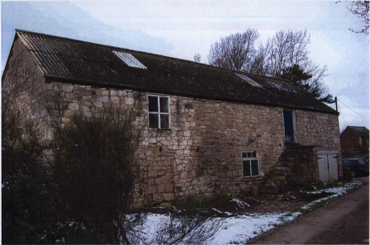
Plate 3. Lead Hall Farm. Farm Building. Facing north-west