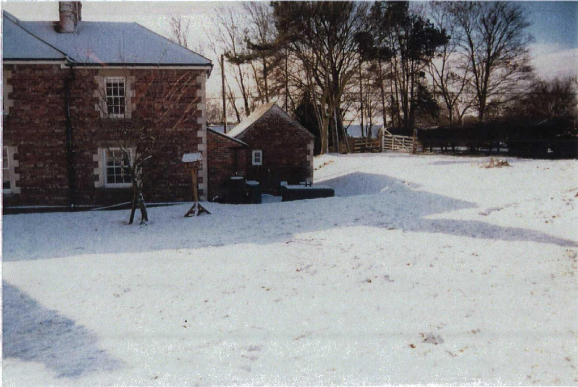
Figure 7. Lead Hall Farm. Facing South West