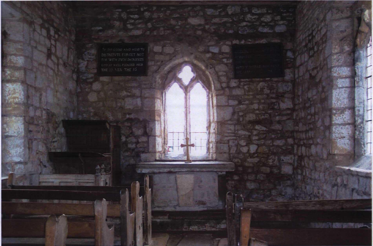
Plate 5. Lead Church. Interior view of altar Facing east