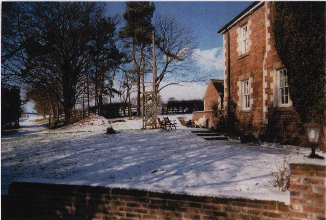
Figure 10. Trench 2. Facing West