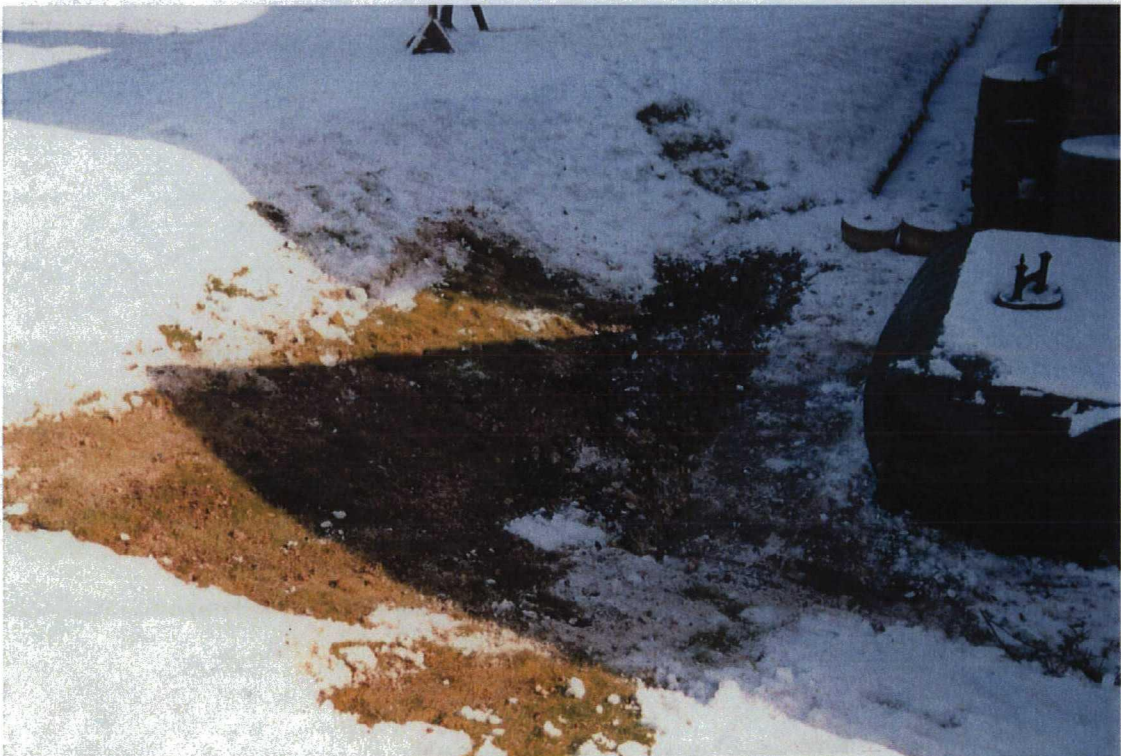
Figure 8. Trench 1. Prior to Excavation. Facing West