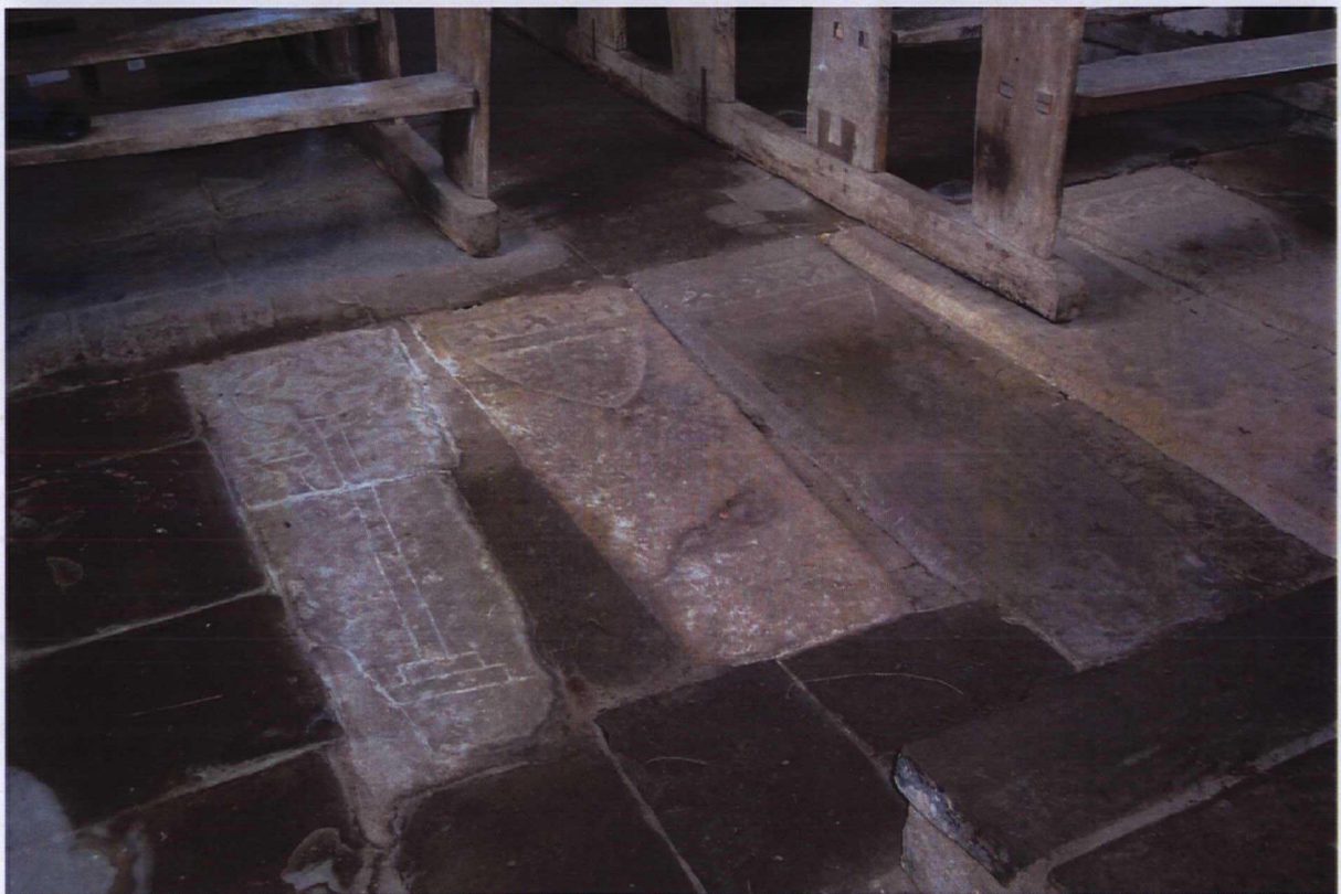
Plate 6. Lead Church. Tombs of the Tyas family. Facing west