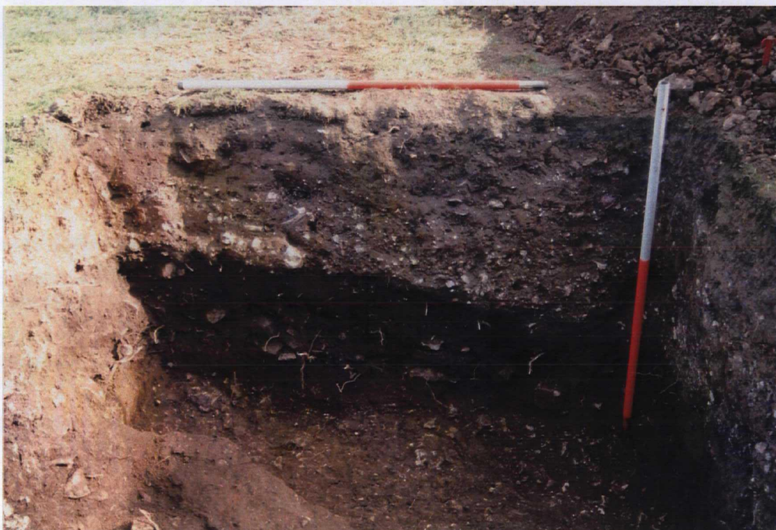
Figure 14. Trench 2. West Facing Section. Facing East