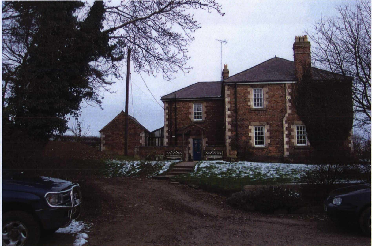
Plate 2. Lead Hall Farm. Facing north