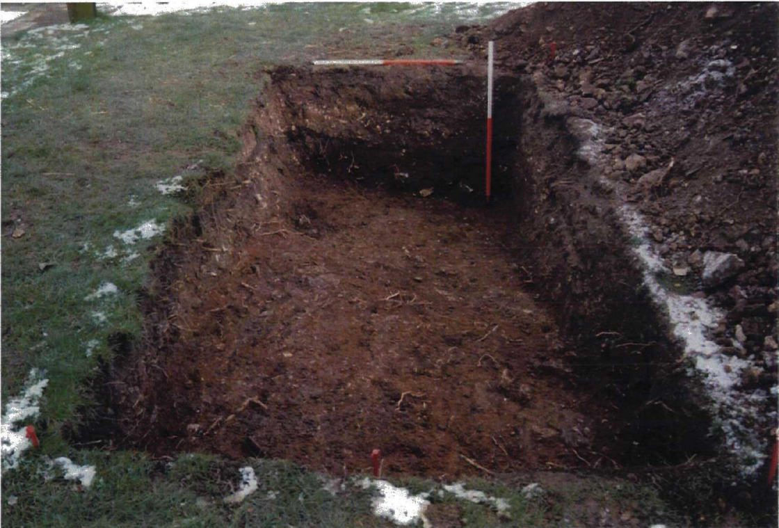
Figure 12. Trench 2. Post Excavation. Facing East