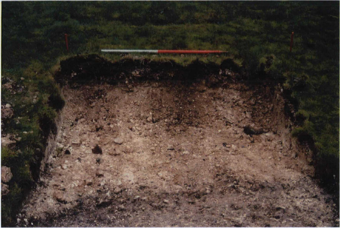
Figure 9. Trench 1. Post Excavation. Facing North