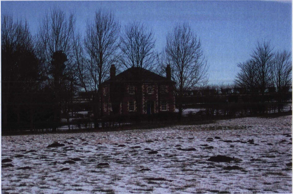
Plate 1. Lead Hall Farm. Facing west