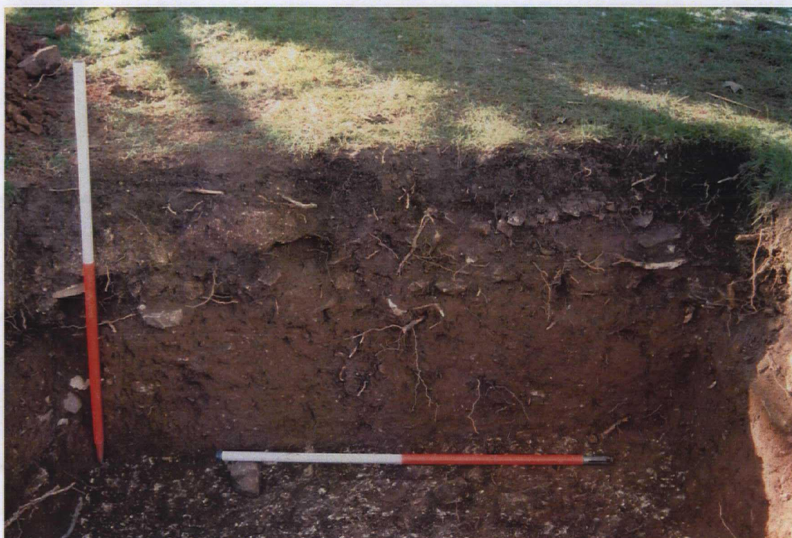
Figure 13. Trench 2. East facing Section. Facing West