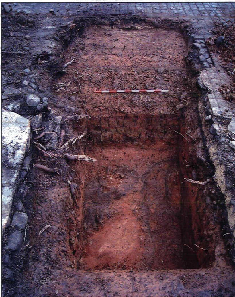
Plate 3. Trench 2, overall view of trench looking east. (Scale of 1m).