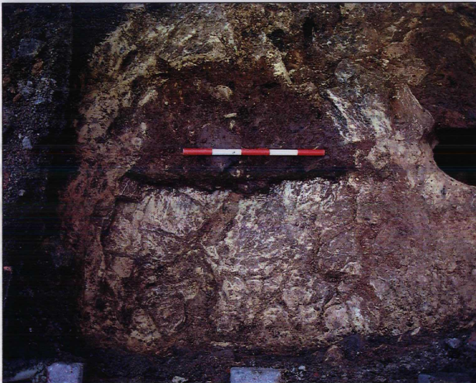
Plate 2. Trench 1, showing half sectioned pit [1004] & fill (1003), looking south. (Scale of 0.5m).