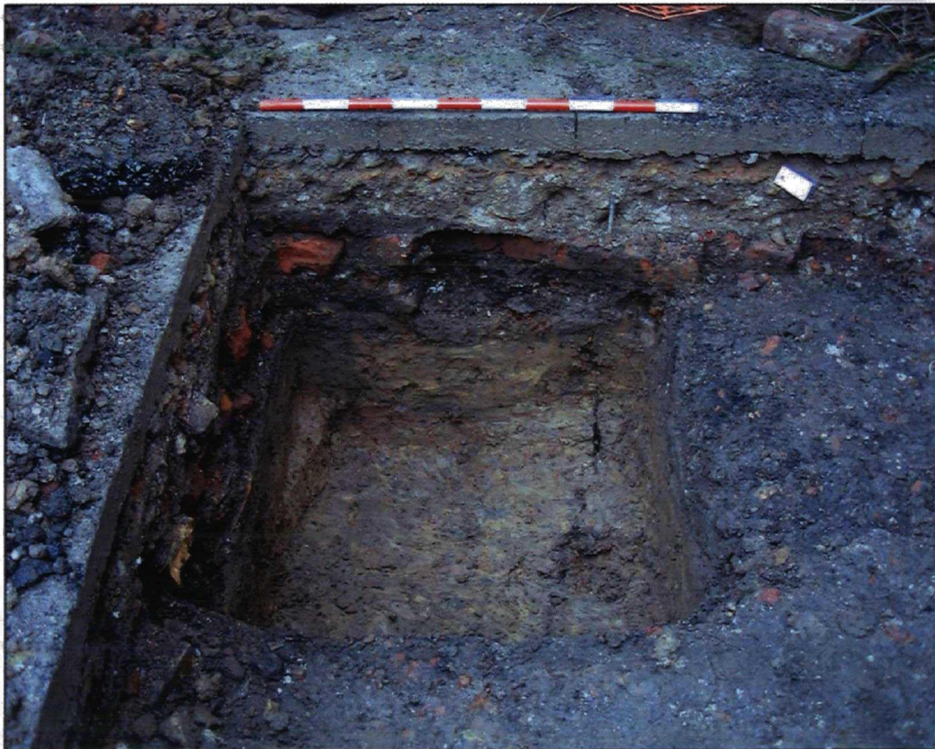
Plate 2. Northeast facing section of trench and pit [1027], facing southwest. (Scale of 1m).