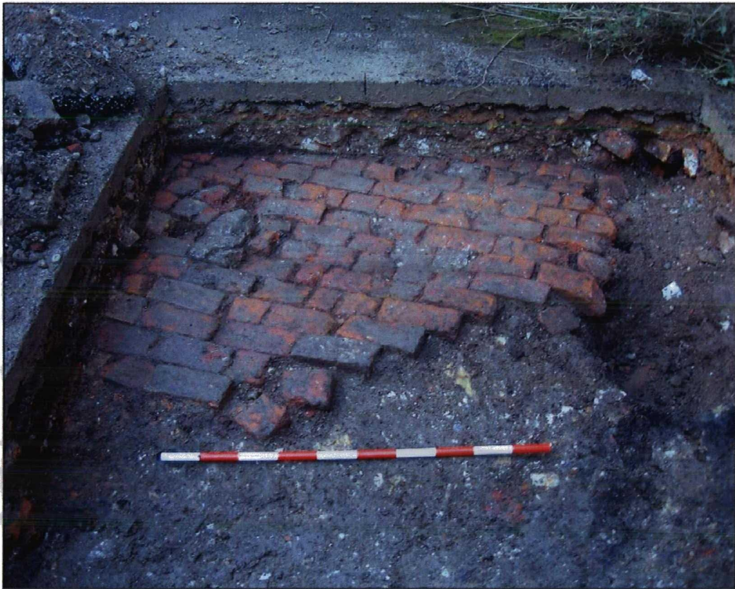
Plate 5. Brick surface (1009), looking northeast. (Scale of 1m).