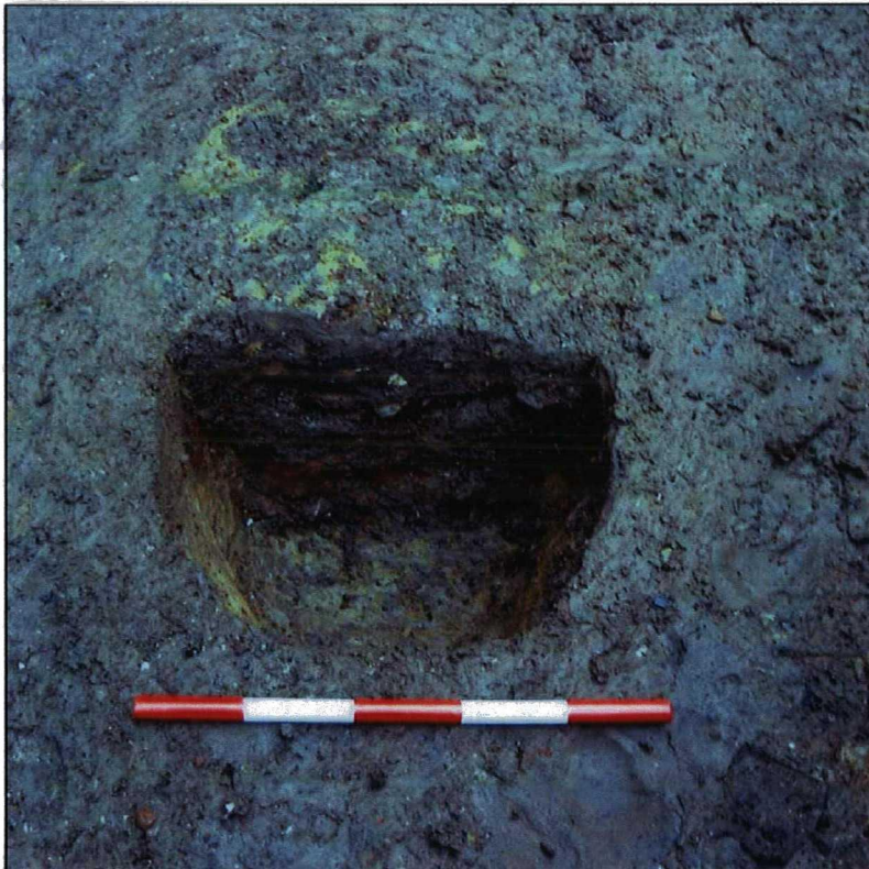
Plate 4, North facing section of [1022]. (Scale of 1m).