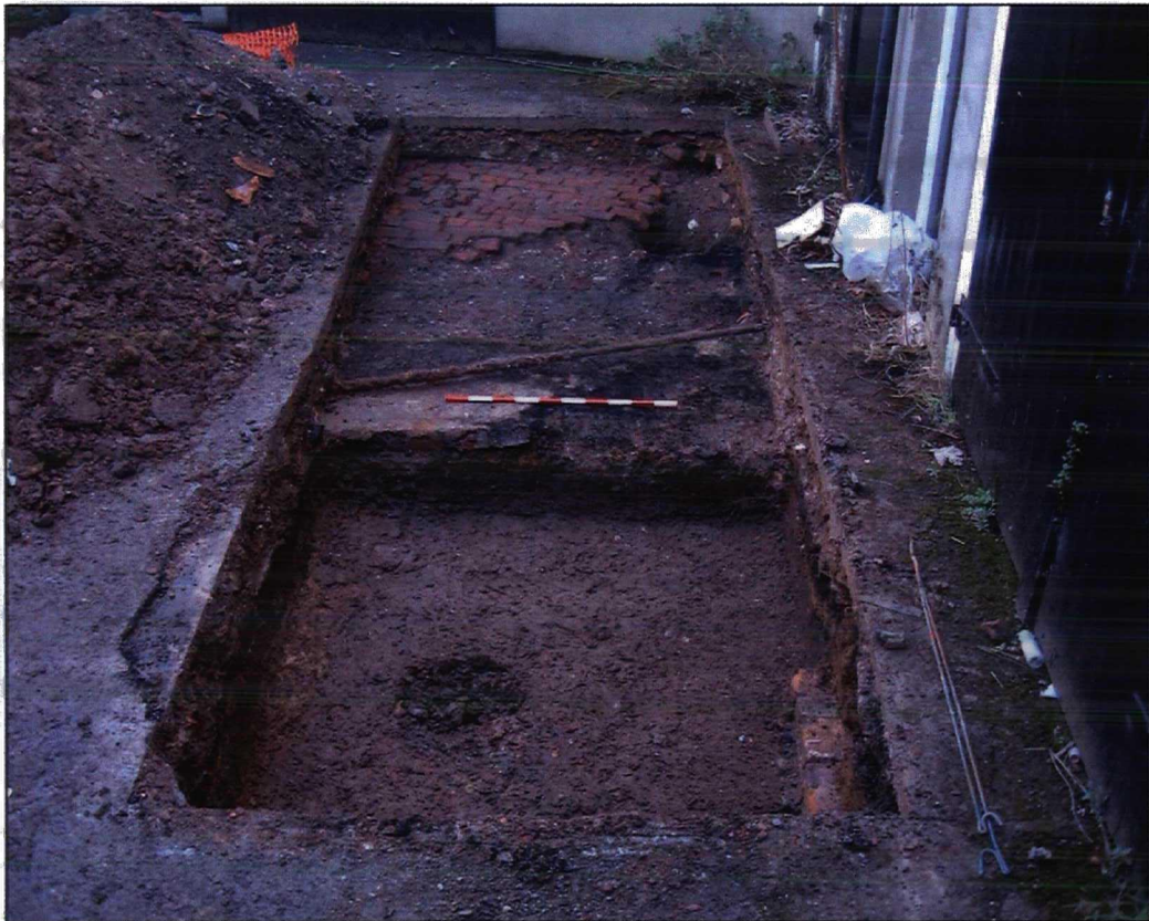
Plate 1. General view of trench 1, looking northeast. (Scale of 1m).