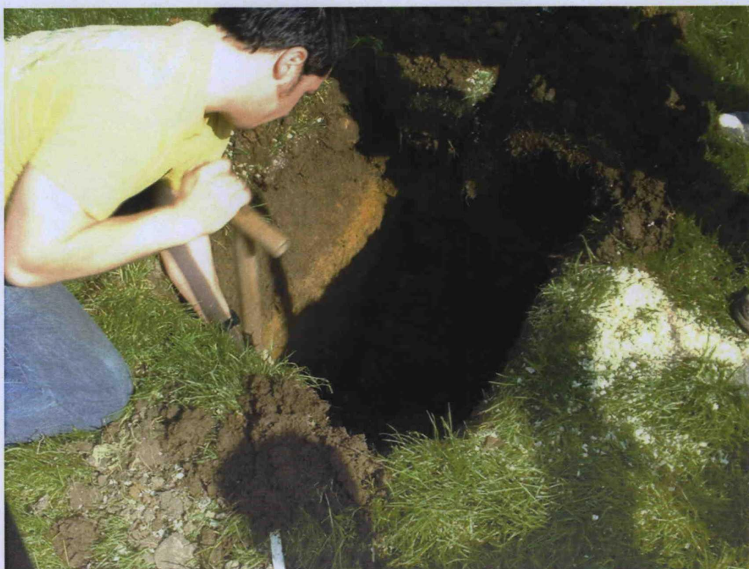
Plate 2. Floodlight Foundation Hole under Excavation. Facing South West