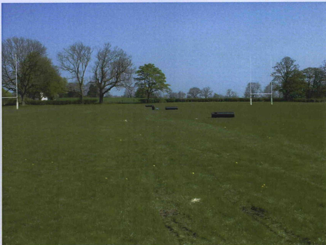
Plate 1. General View of Site. Facing North East