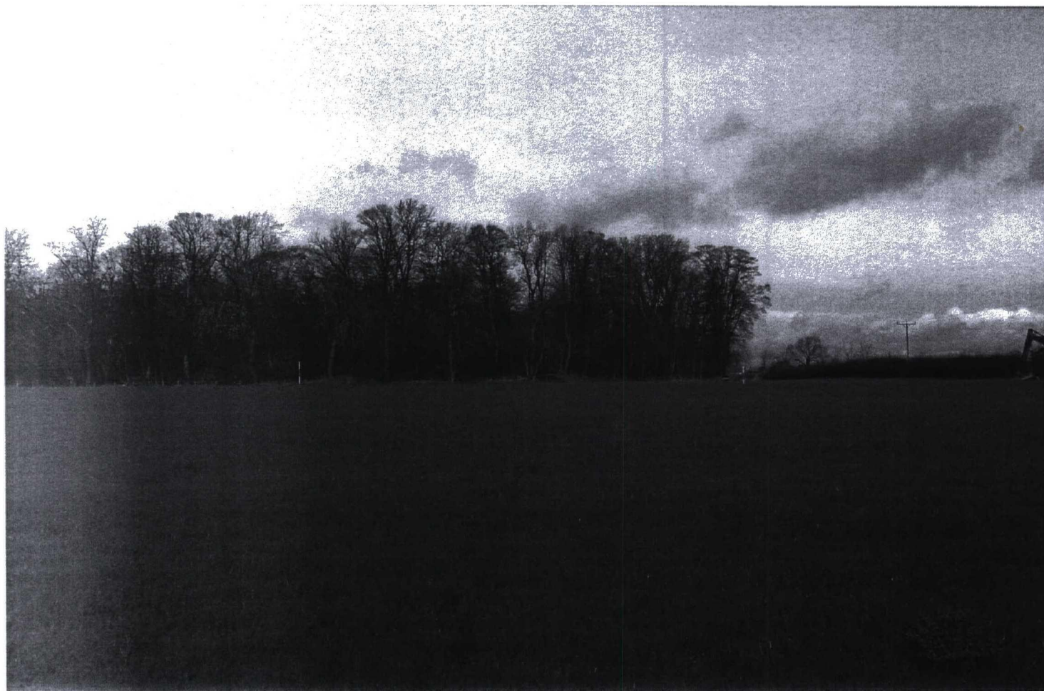
Plate 22. Alignment of Trench 2 pipe trench, prior to excavation. Facing north.