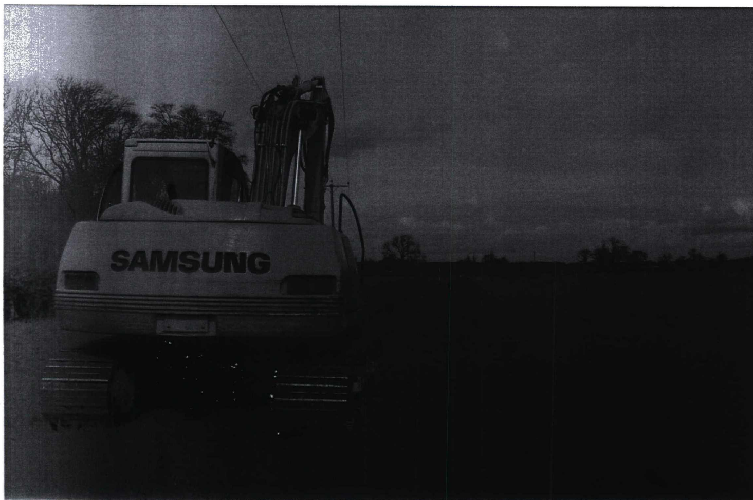
Plate 16. Trench 1 under excavation. Facing north-west.