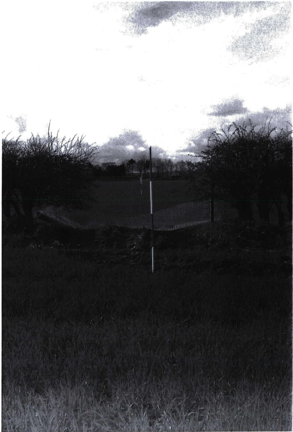
Plate 18. Alignment of Trench 2 pipe trench, prior to excavation. Facing south-west.