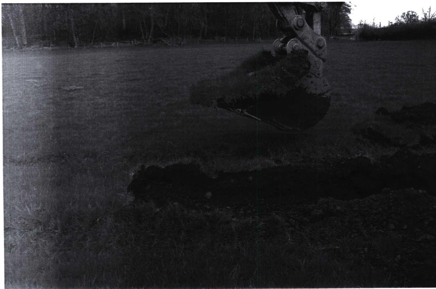
Plate 32. Trench 2 under excavation, removal of the turf and topsoil . Facing north-west.