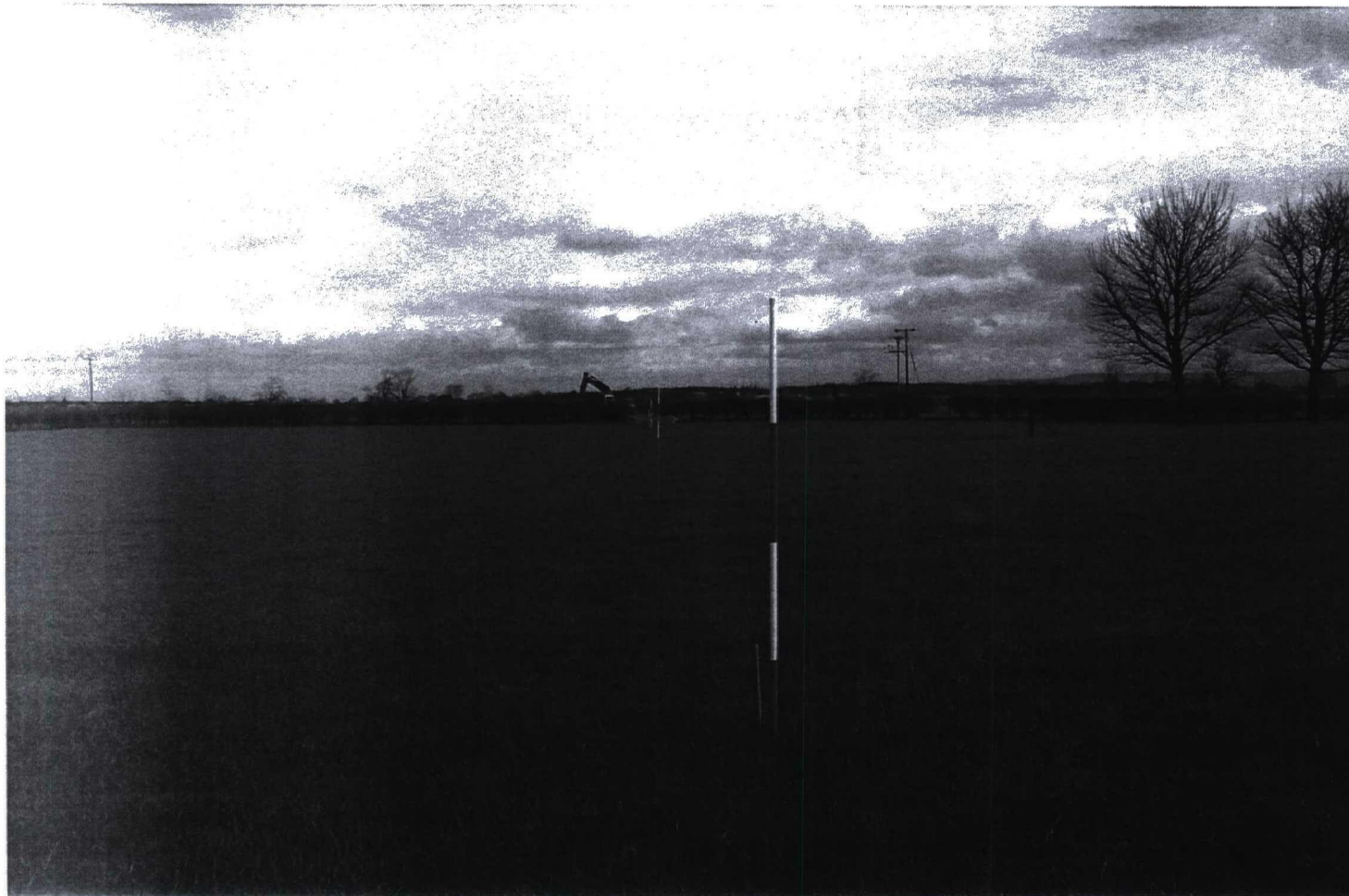
Plate 26. Alignment of Trench 2 pipe trench, prior to excavation. Facing north-east.