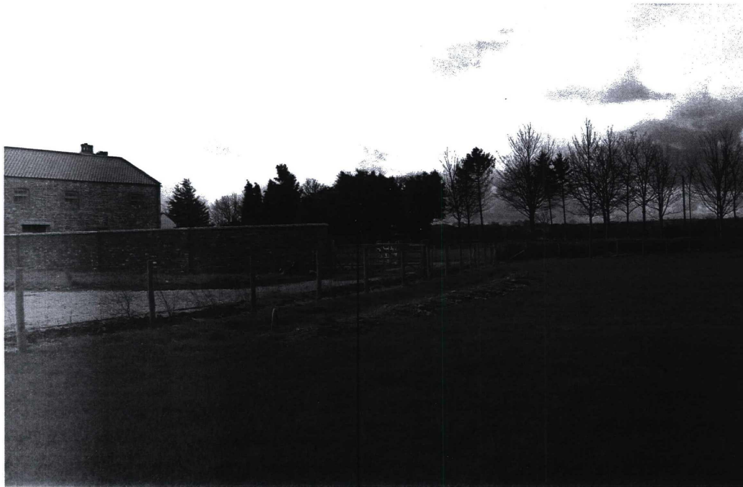
Plate 27. Previous backfilled excavation for pipe trench to west of Trench 2. Facing south-west.