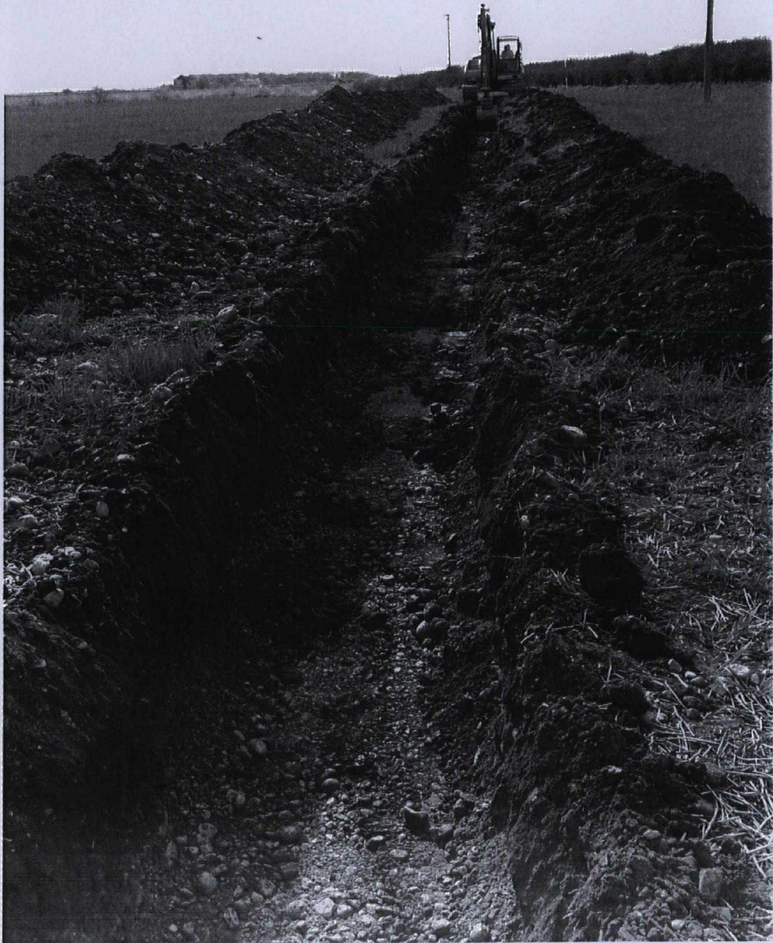
Plate 14. Trench 1 under excavation. Facing south-east.