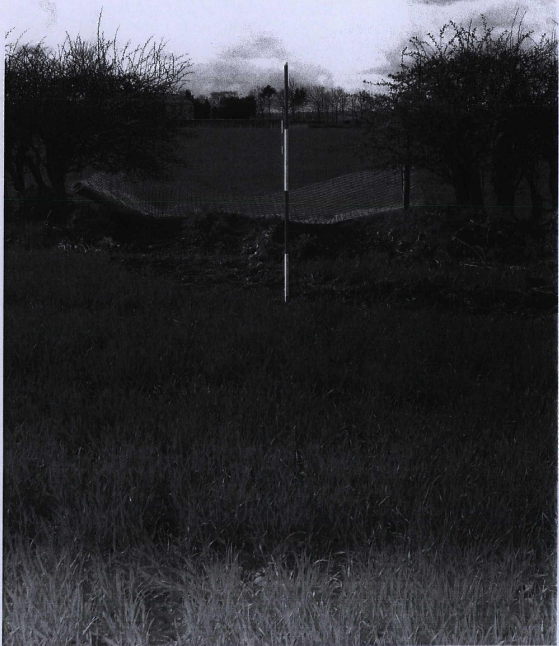
Plate 19. Alignment of Trench 2 pipe trench, prior to excavation. Facing south-west.