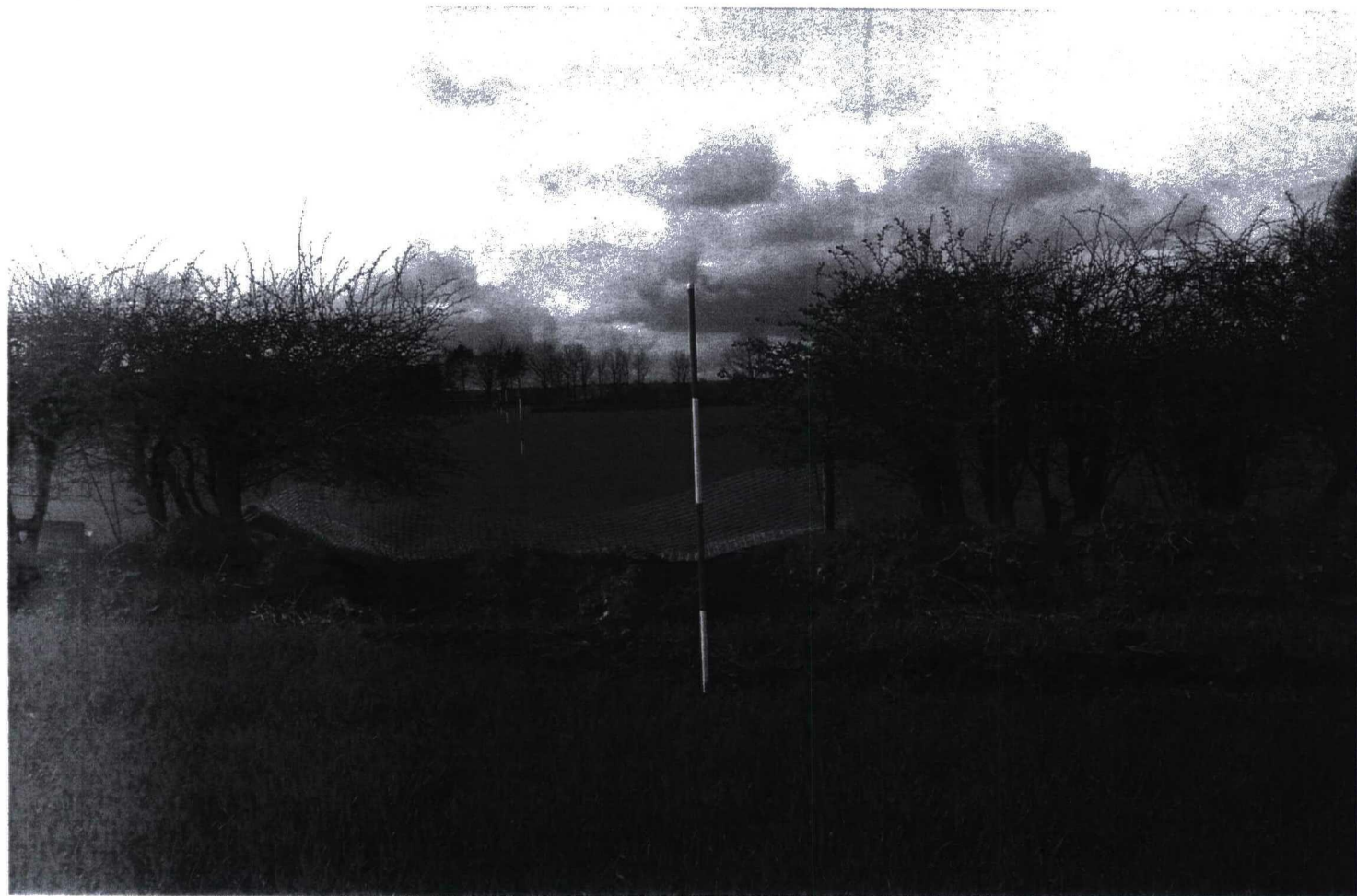
Plate 20. Alignment of Trench 2 pipe trench, prior to excavation. Facing south-west.