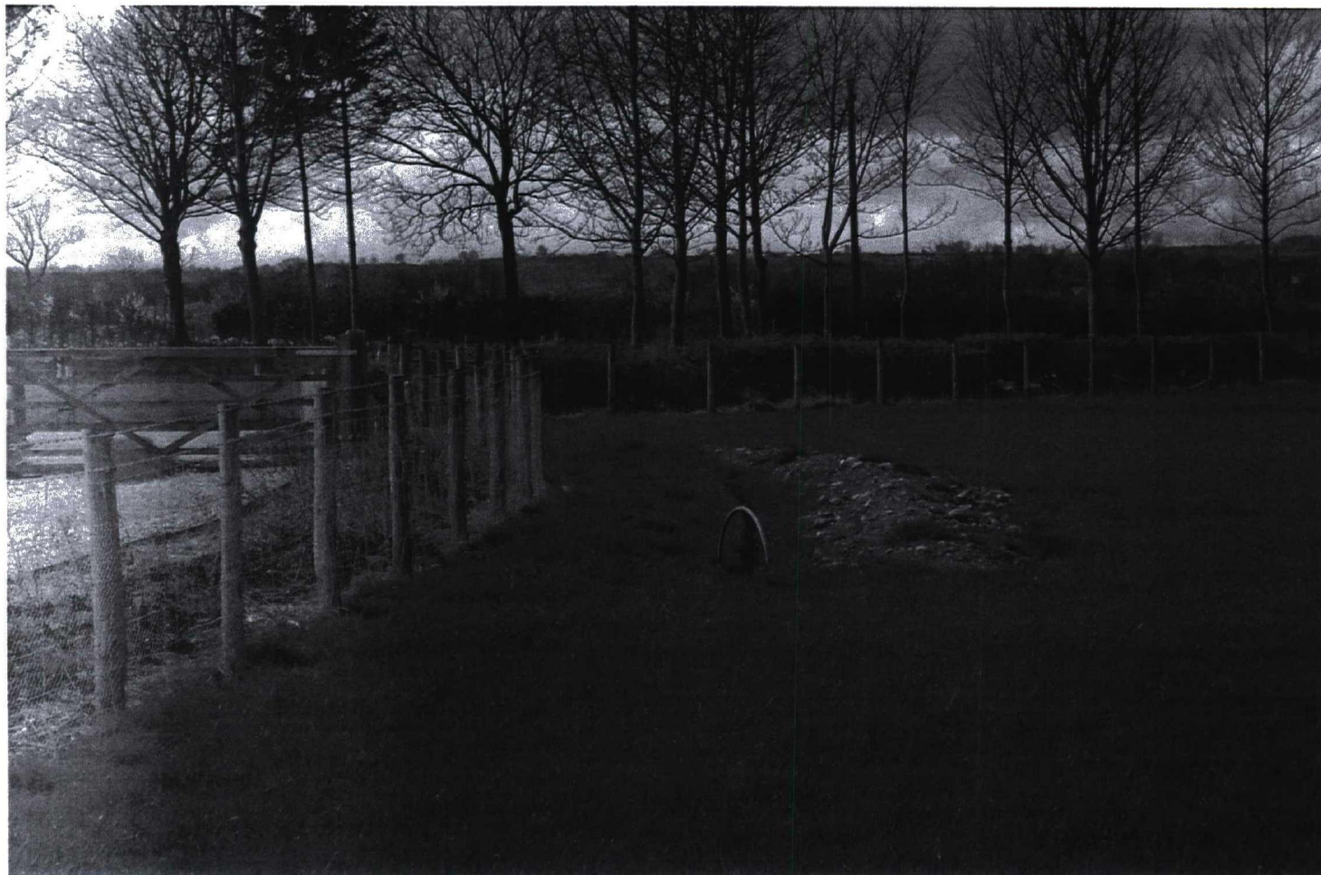
Plate 25. Previous backfilled excavation for pipe trench to west of Trench 2. Facing west.