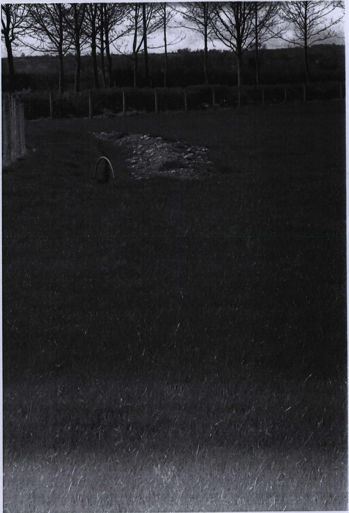
Plate 24. Previous backfilled excavation for pipe trench to west of Trench 2. Facing west.