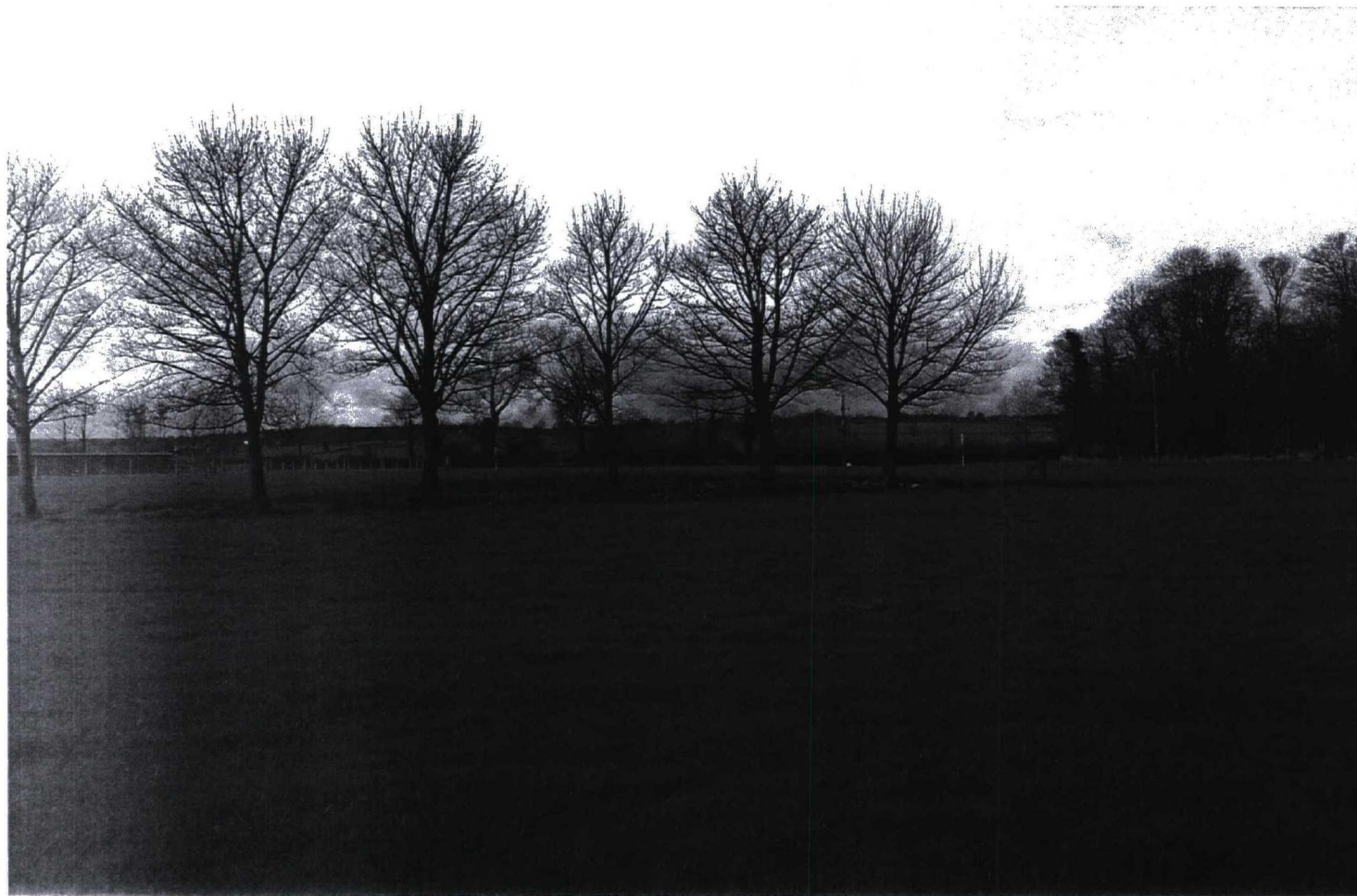
Plate 21. Alignment of Trench 2 pipe trench, prior to excavation. Facing north-west.