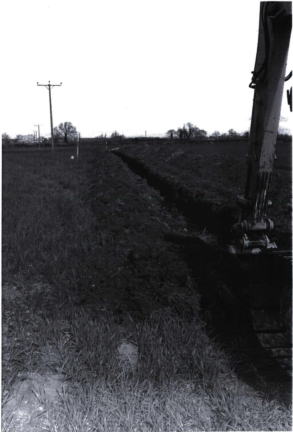
Plate 17. Trench 1 under excavation. Facing north.