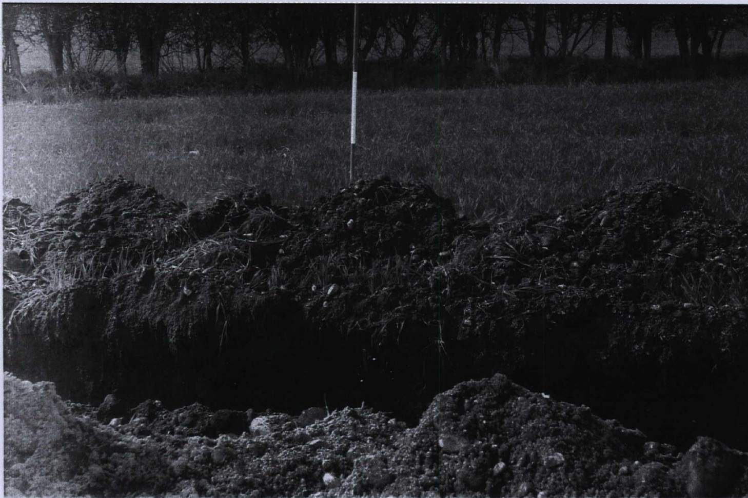
Plate 31. Aluminium marker in Trench 1. Facing west.