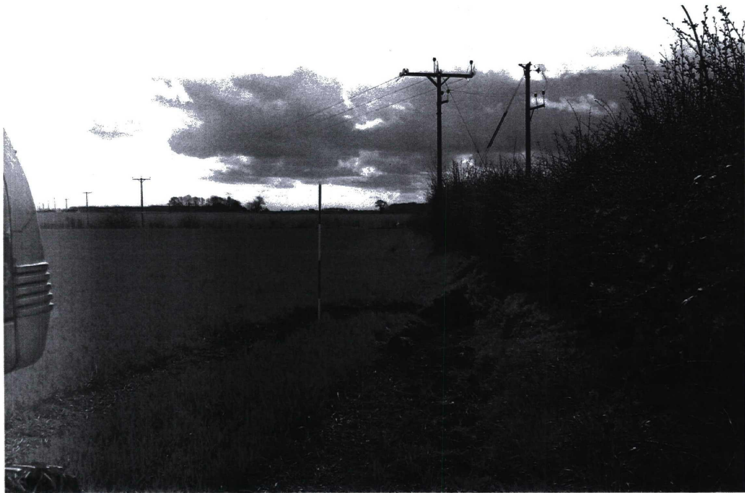
Plate 15. Location of junction between Trenches 1 and 2. Facing South-east.