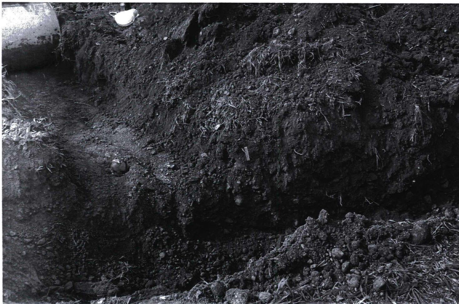
Plate 28. Aluminium marker at junction of Trenches 1 and 2. Facing west.