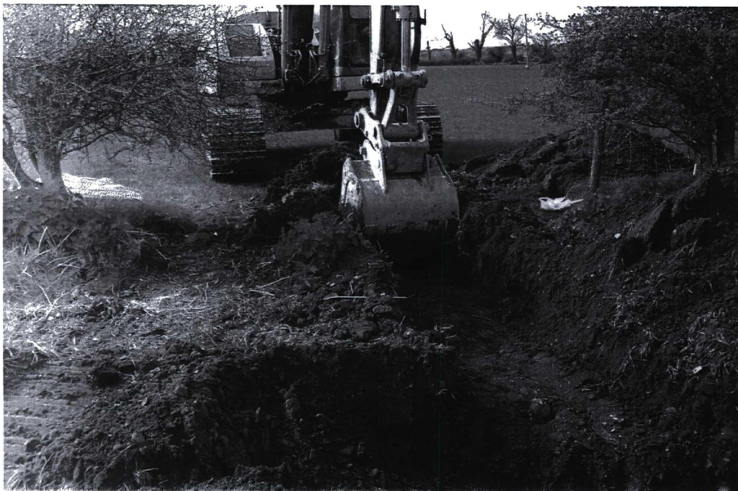
Plate 29. Initial excavations in Trench 2. Facing south-west.