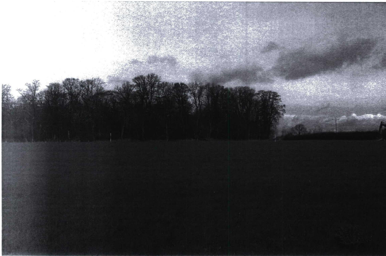
Plate 23. Alignment of Trench 2 pipe trench, prior to excavation. Facing north-north-west.