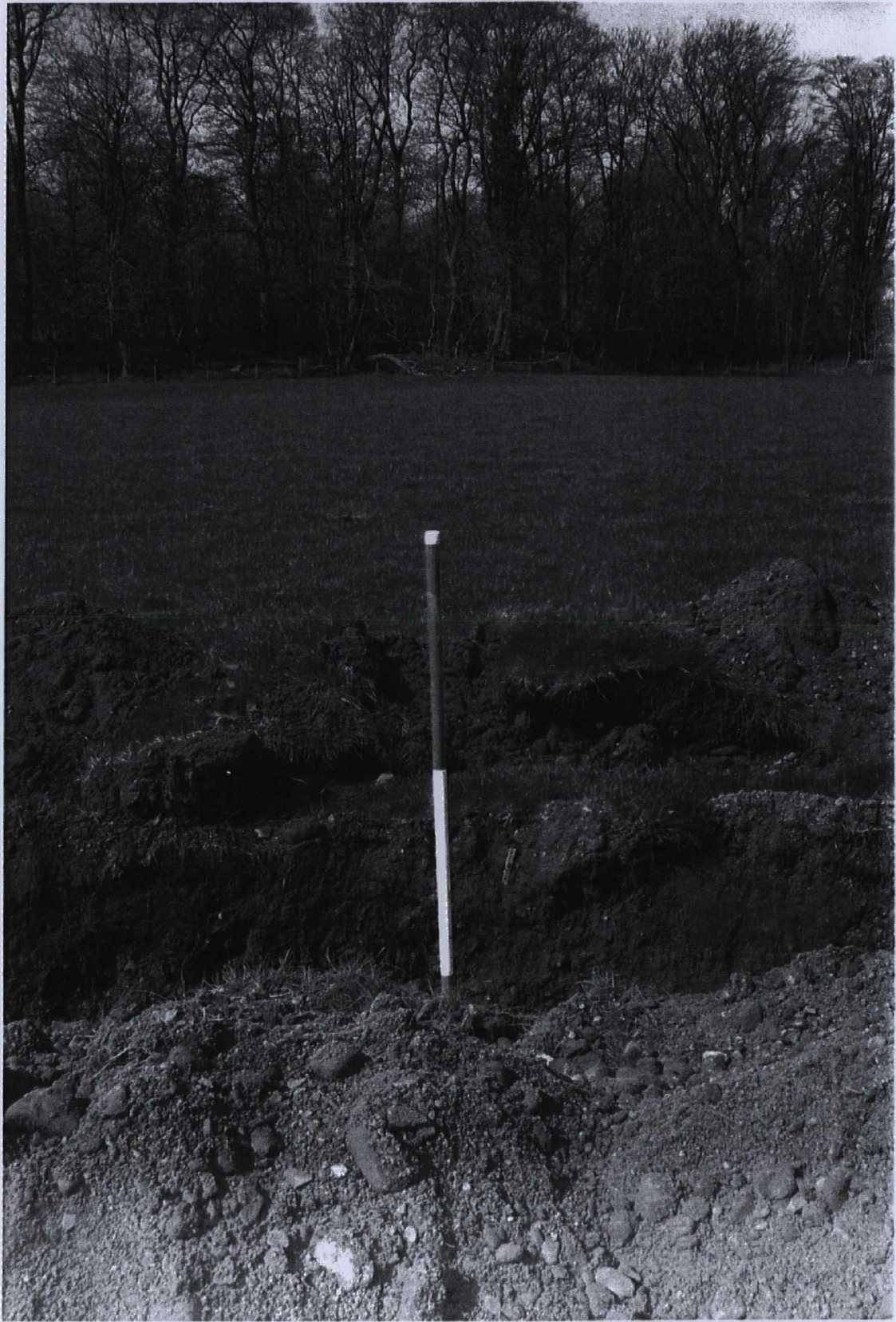
Plate 33. Aluminium marker in Trench 2. Facing north-west.