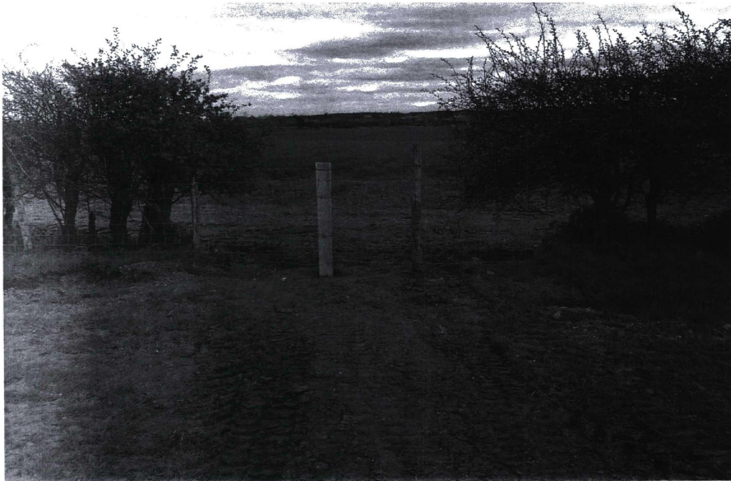
Plate 68. Junction of Trenches 1 and 2 after backfilling. Facing east.