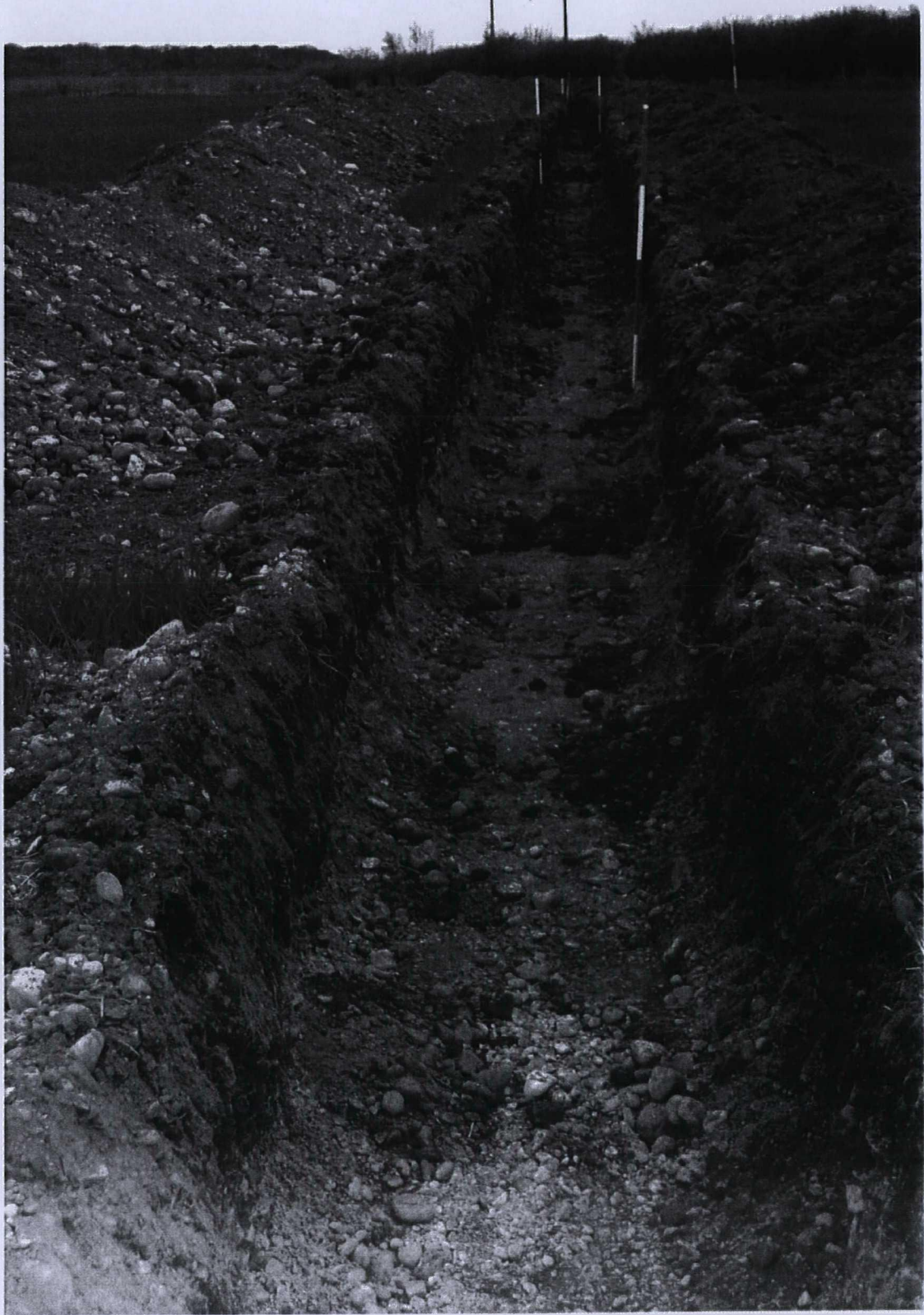
Plate 55. Completed excavation of Trench 1. Facing south-east.