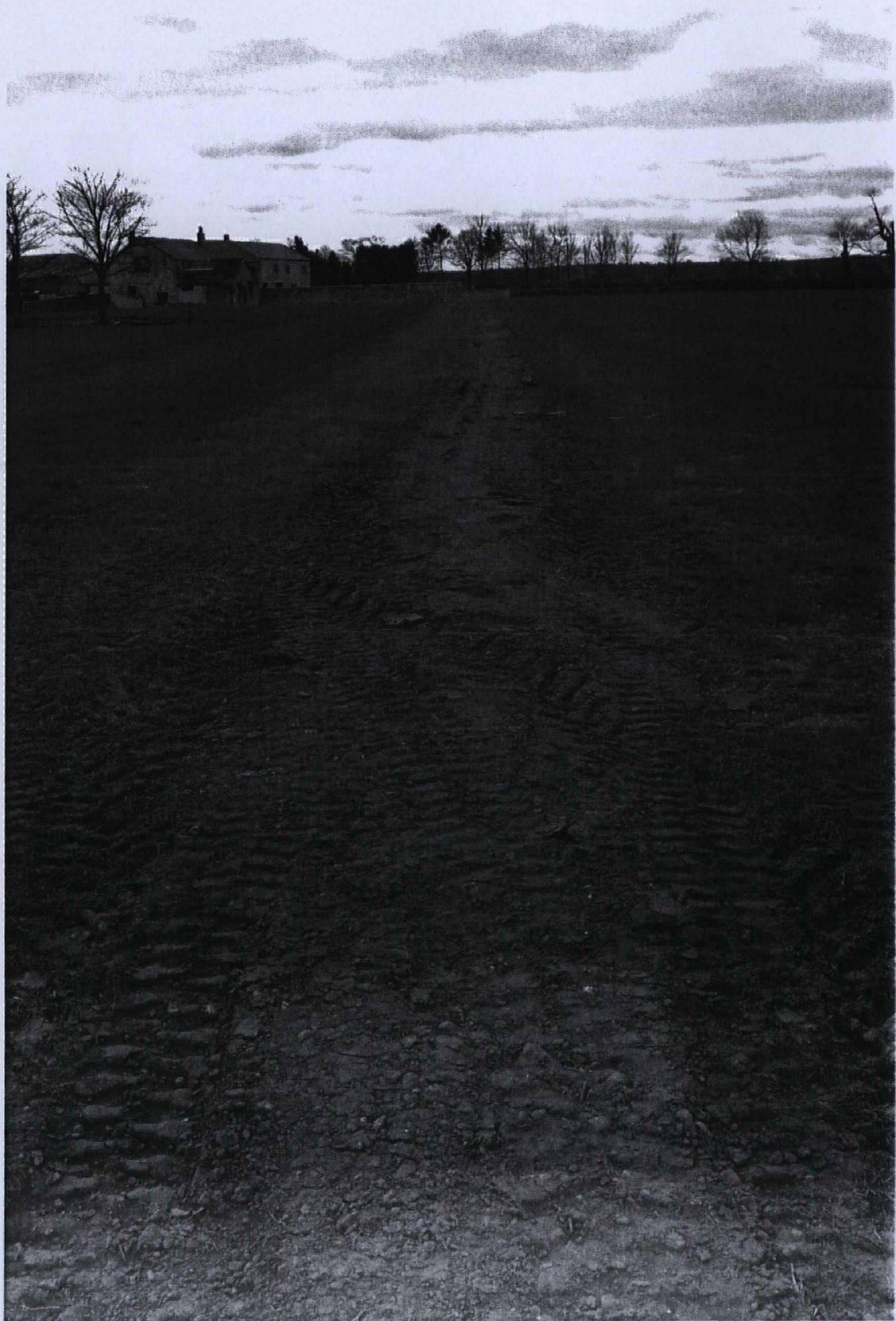
Plate 66. Trench 2. After backfilling. Facing south-west.