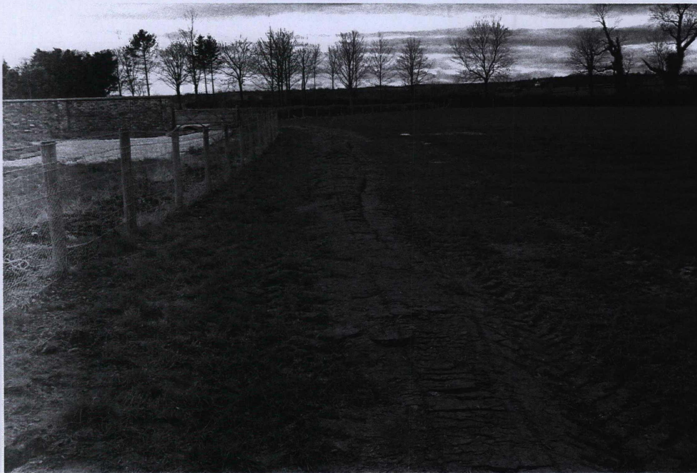
Plate 63. Trench 2. After backfilling Facing south-west.