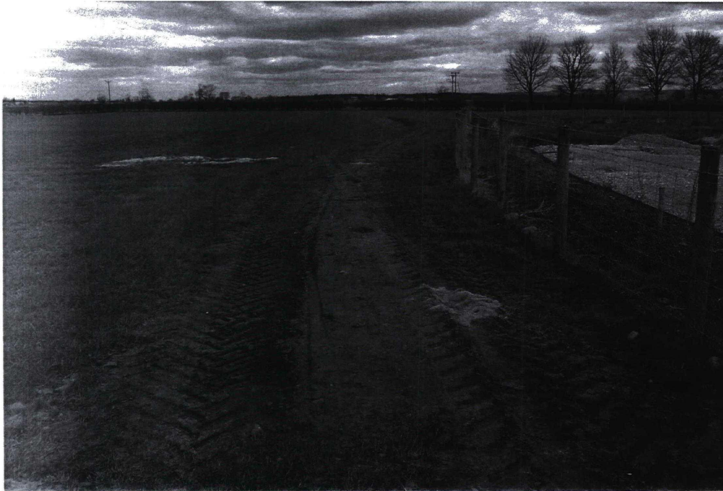
Plate 65. Trench 2. After backfilling Facing north-east.