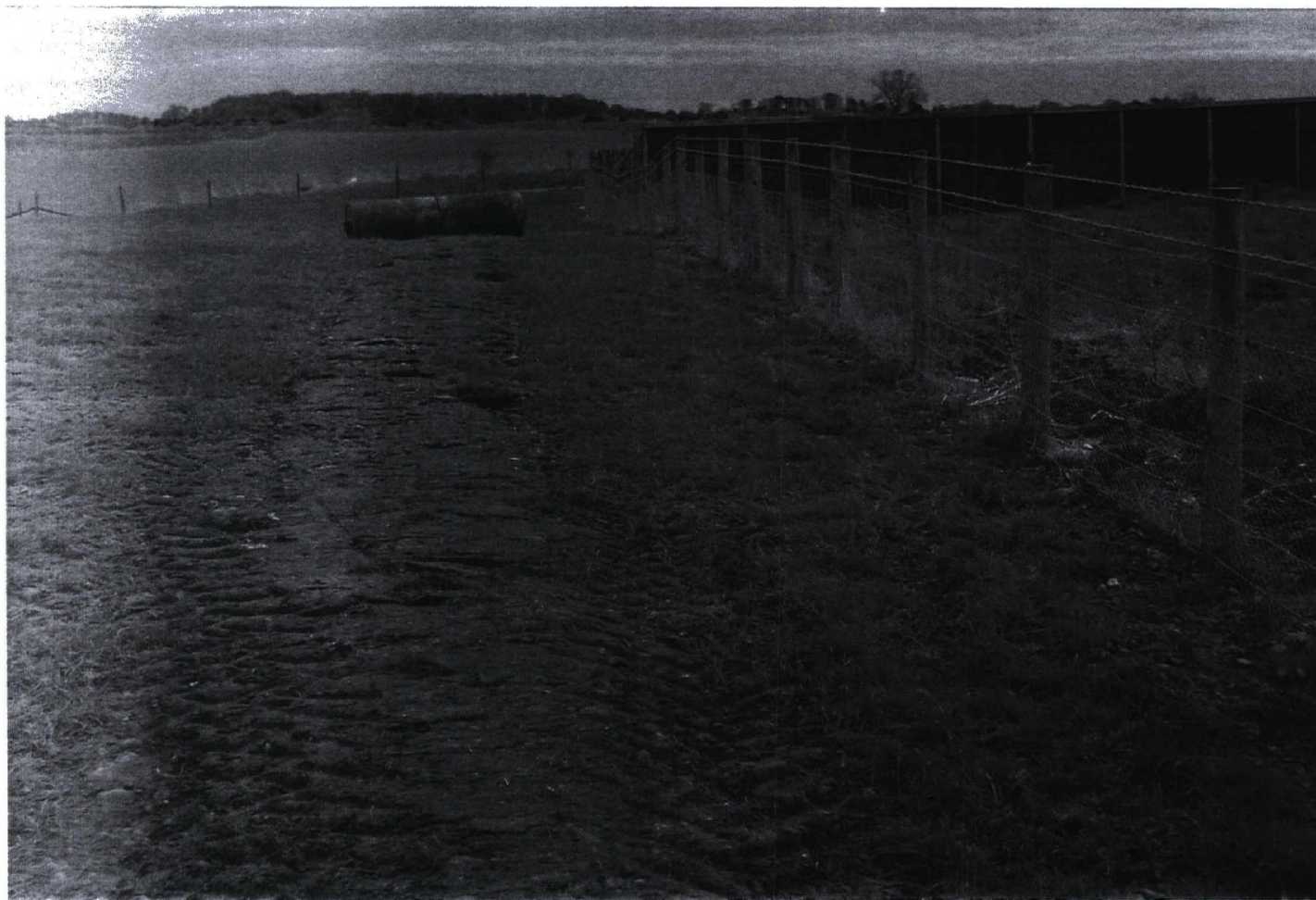
Plate 61. Trench 3. After backfilling Facing south-east.