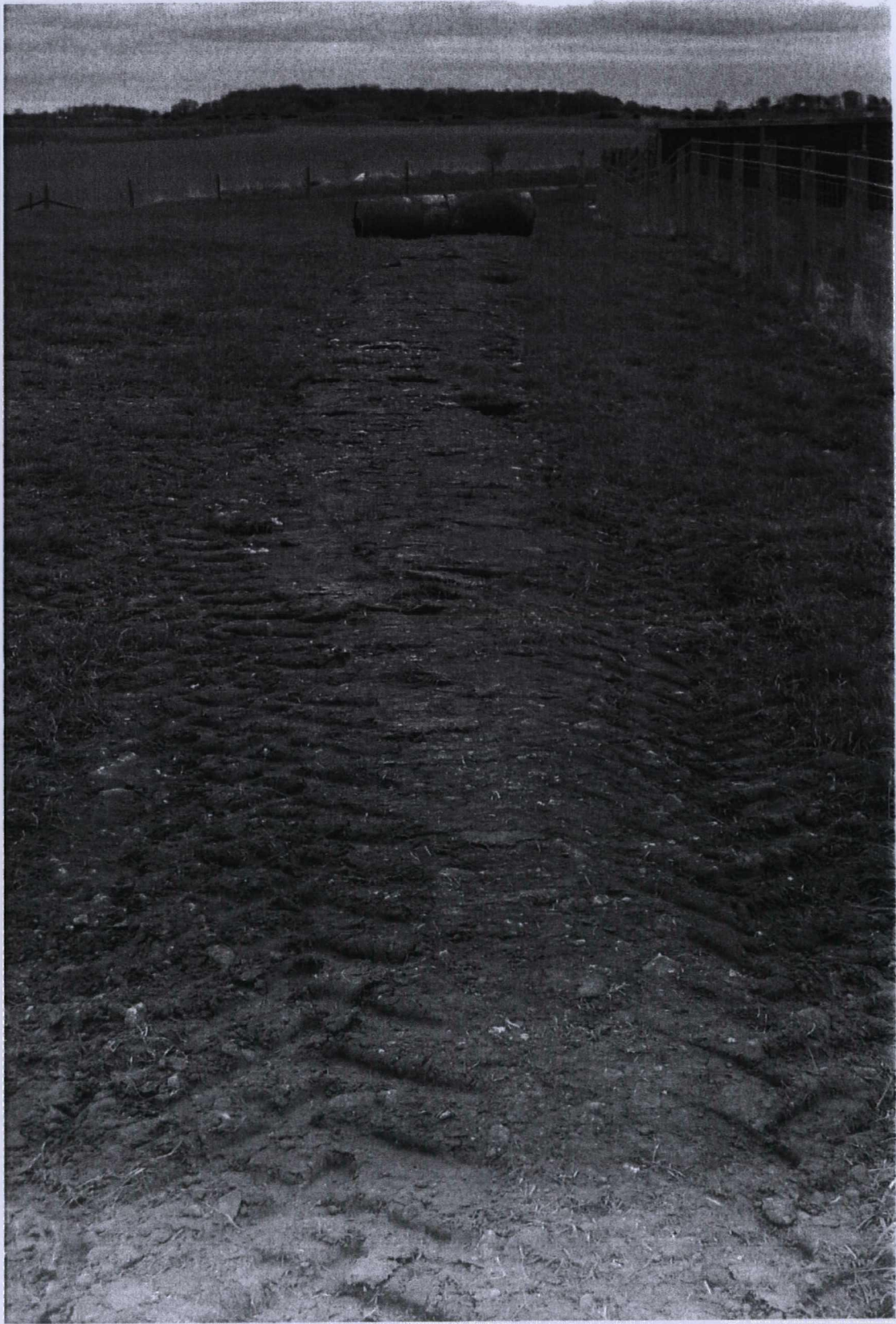
Plate 62. Trench 3. After backfilling. Facing south-east.