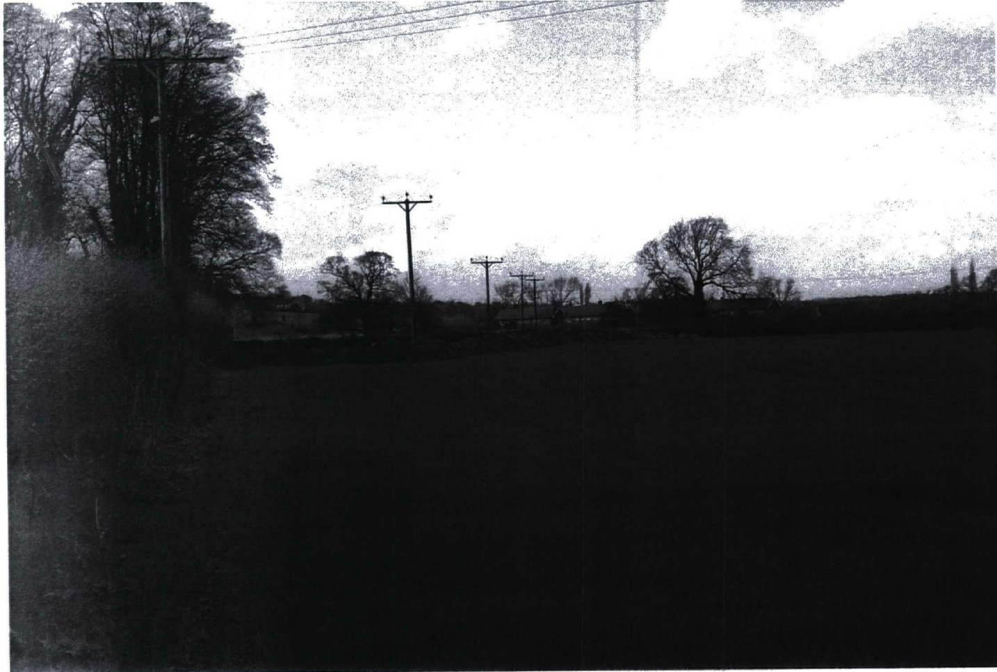
Plate 58. Completed excavation of Trench 1. Facing north-west.