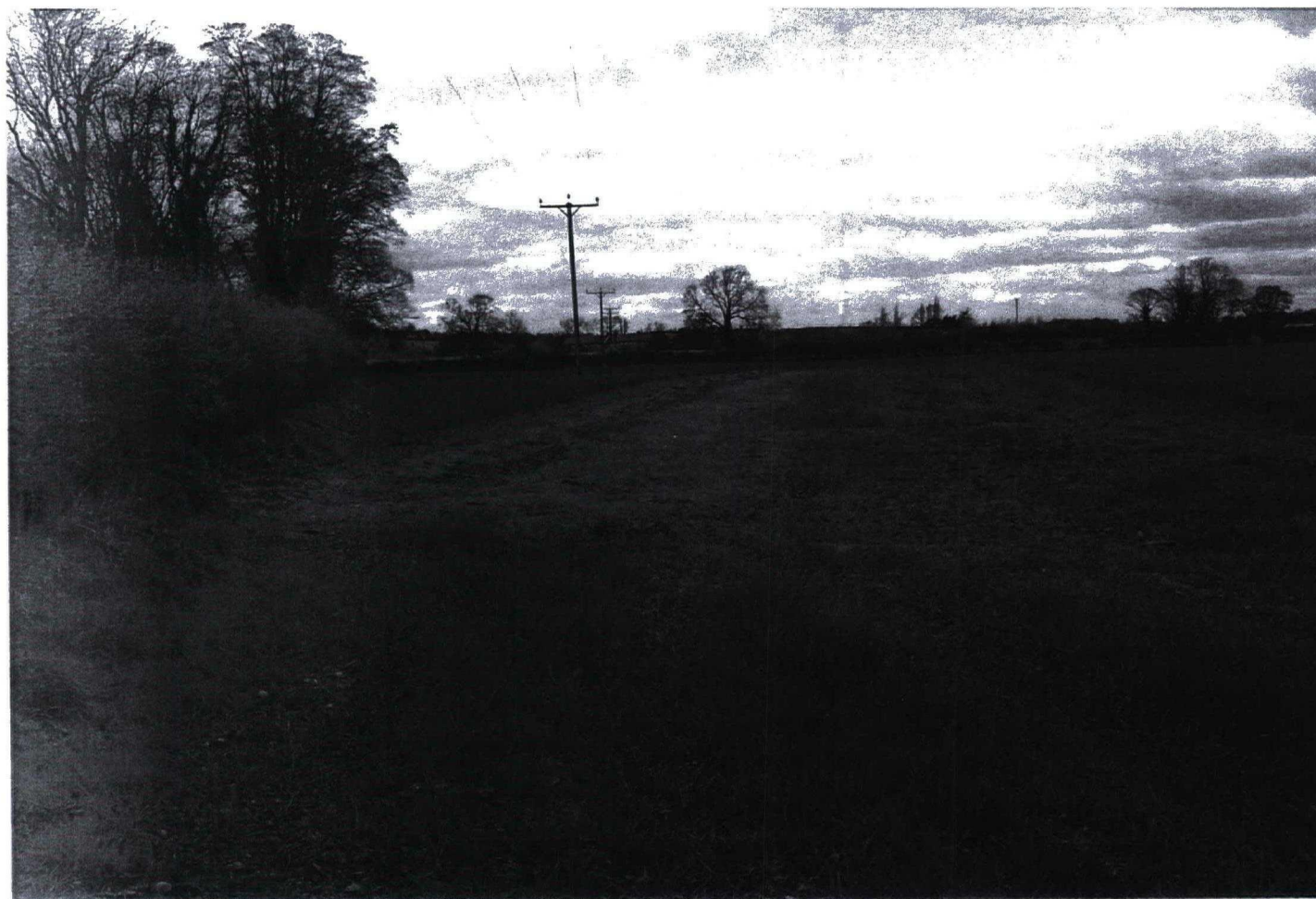
Plate 70. Trench 1 After backfilling. Facing north-west.