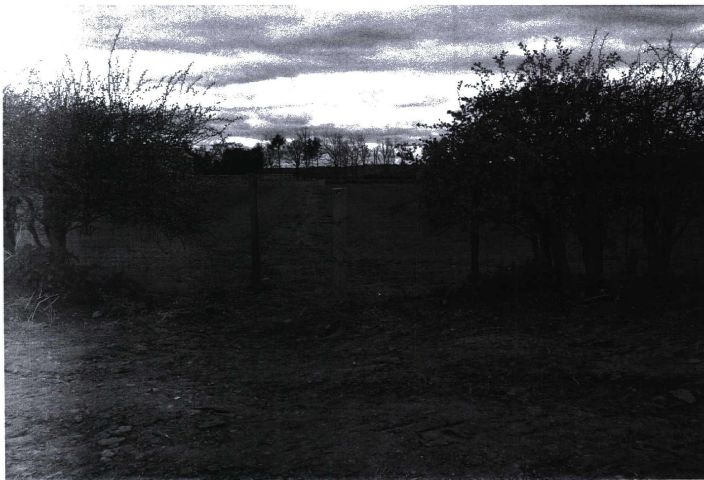
Plate 71. Junction of Trenches 1 and 2 after backfilling. Facing west.