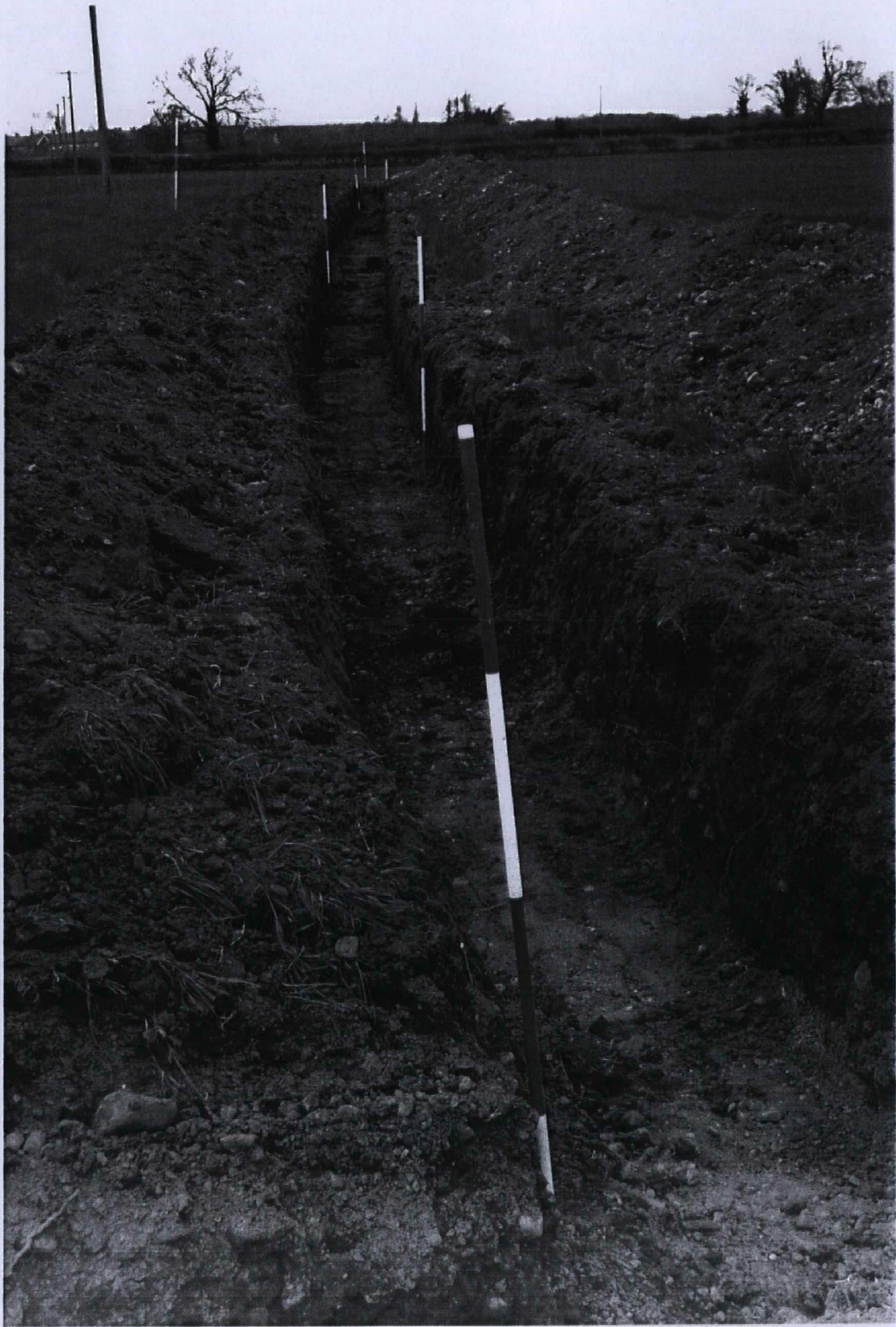
Plate 56. Completed excavation of Trench 1. Facing north-west.