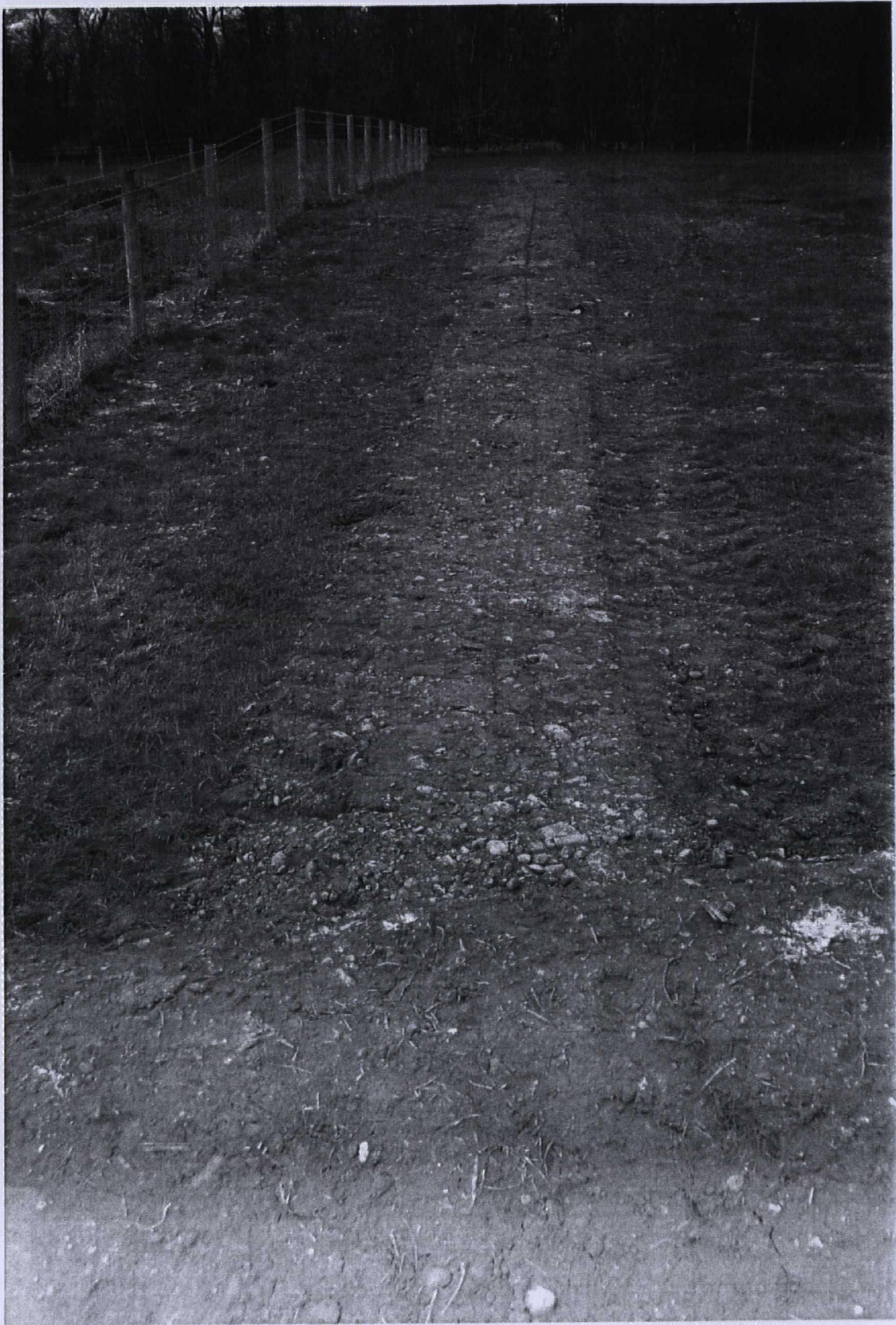
Plate 60. Trench 3. After backfilling. Facing north-west.