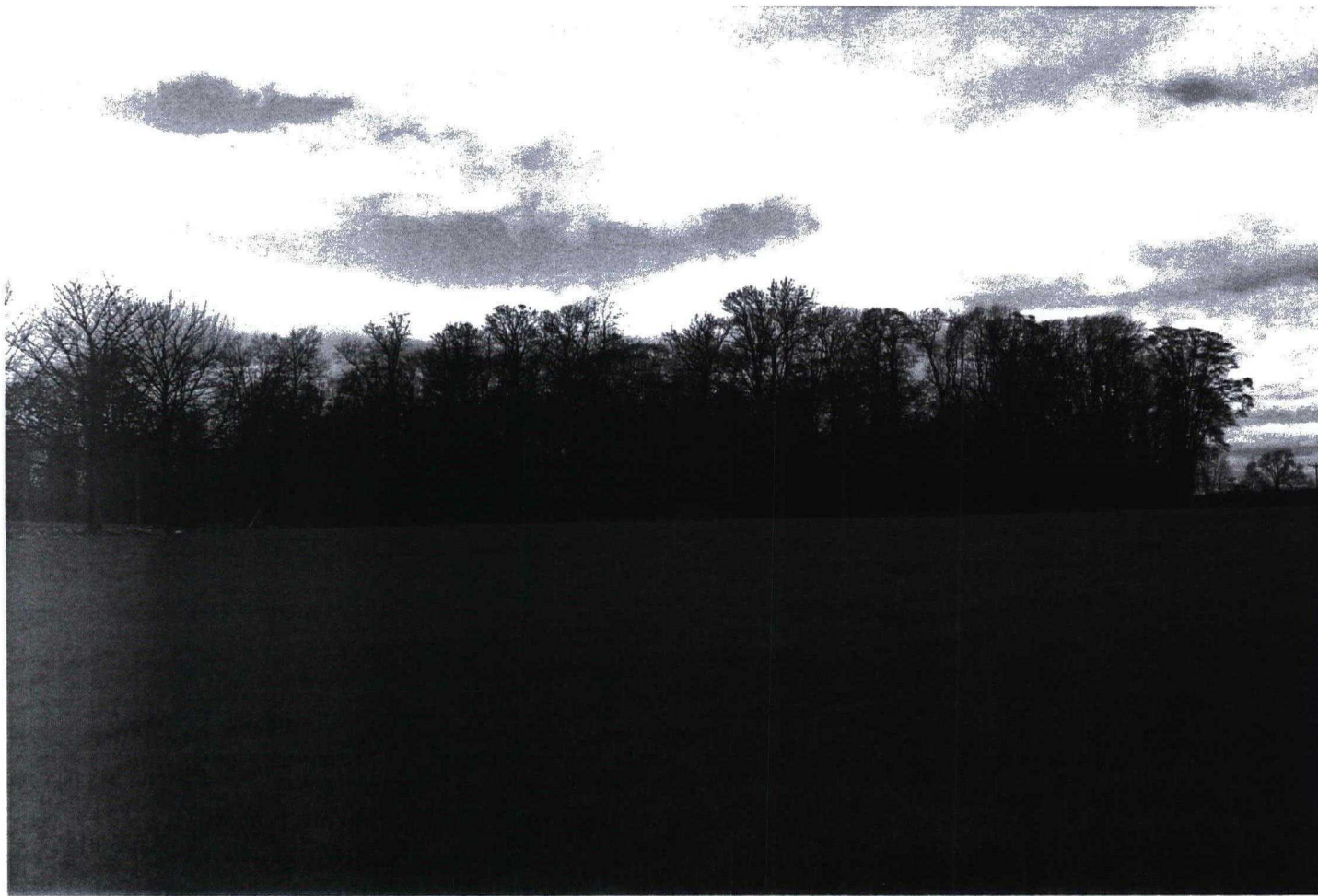
Plate 69. Trench 3 After backfilling. Facing north-west.