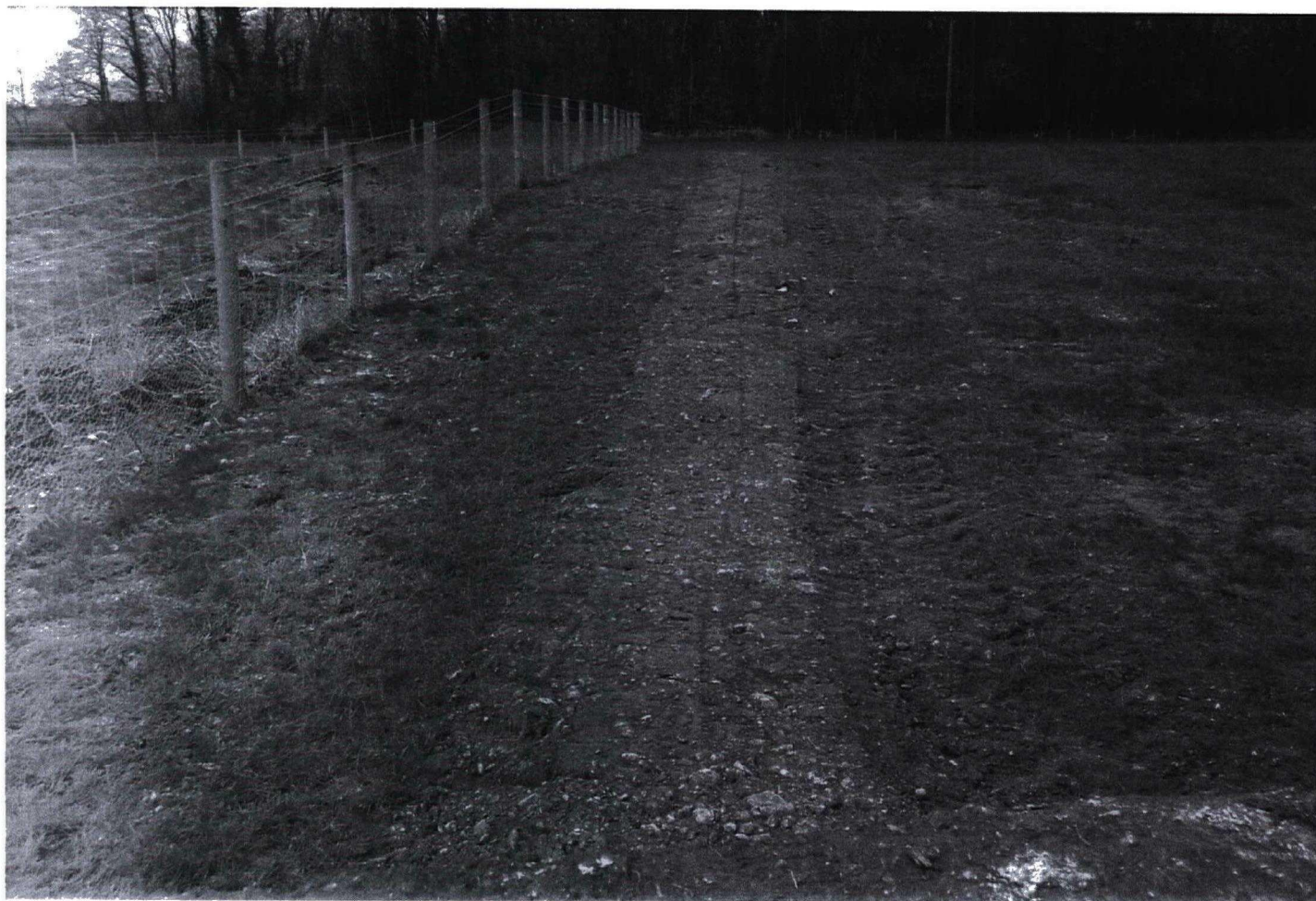
Plate 59. Trench 3. After backfilling Facing north-west.