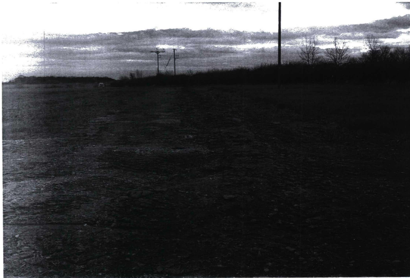
Plate 72. Trench 1. After backfilling. Facing south-east.