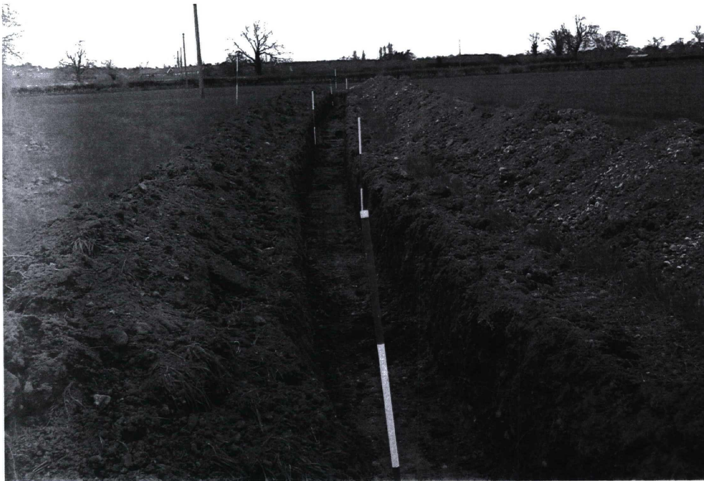
Plate 57. Completed excavation of Trench 1. Facing north-west.