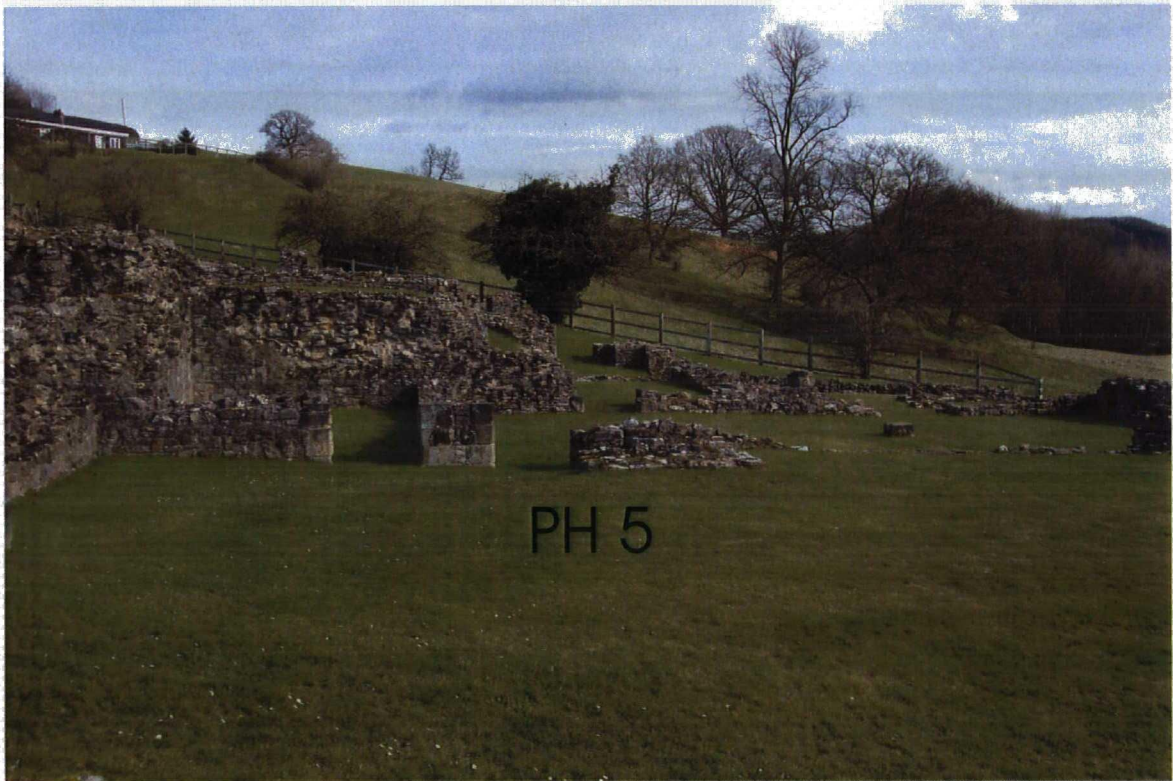
Plate 5. Location of Posthole 5. Facing east.