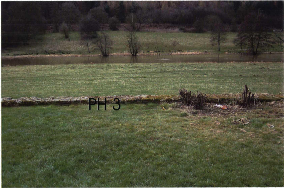
Plate 3. Location of Posthole 3. Facing west.