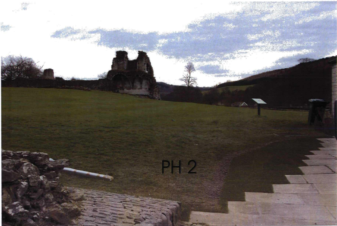
Plate 2. Location of Posthole 2. Facing east.