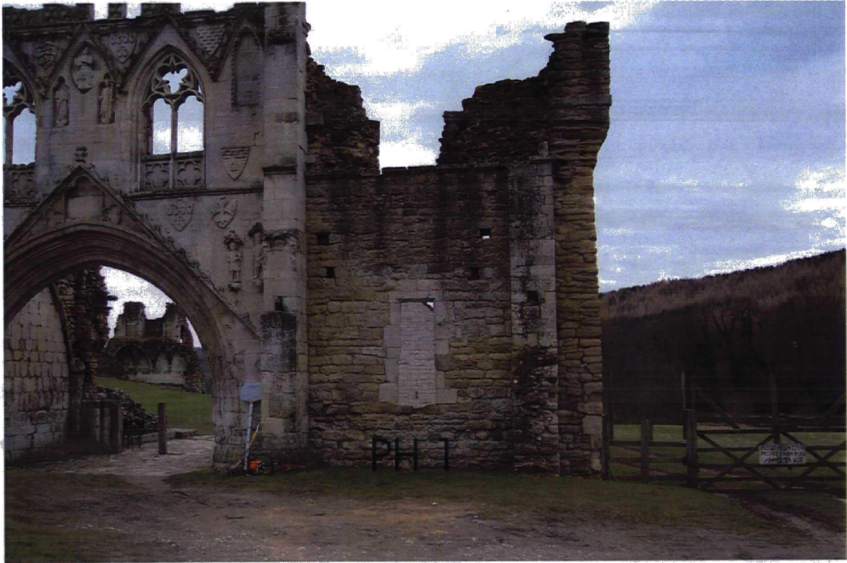
Plate 1. Location of Posthole 1. Facing south-east.