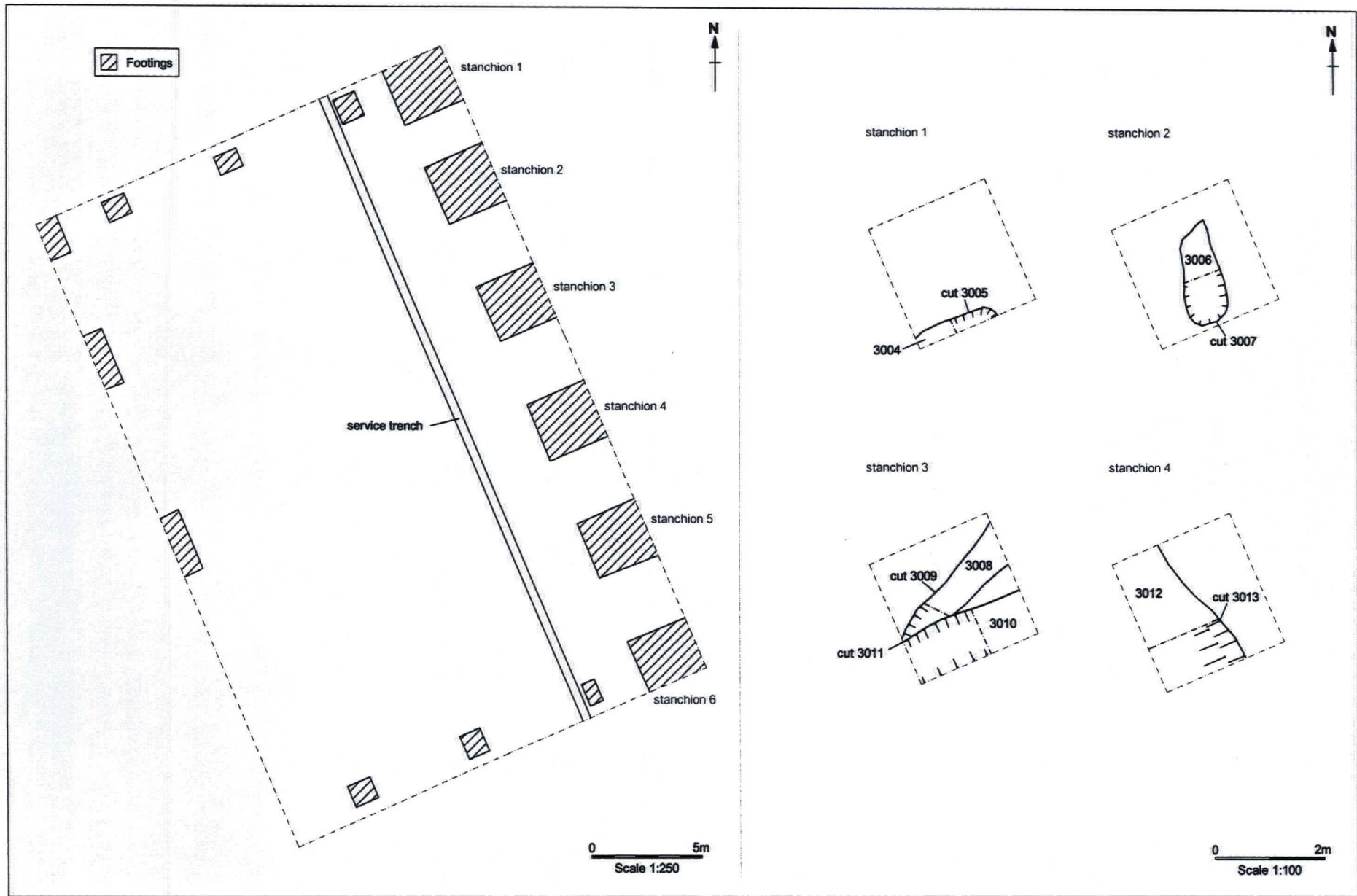
Figure 3. Plan of Factory Extension Features