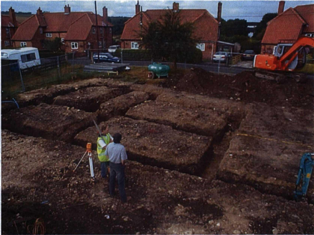
Plate 1. Excavated Foundation Trench. Facing West