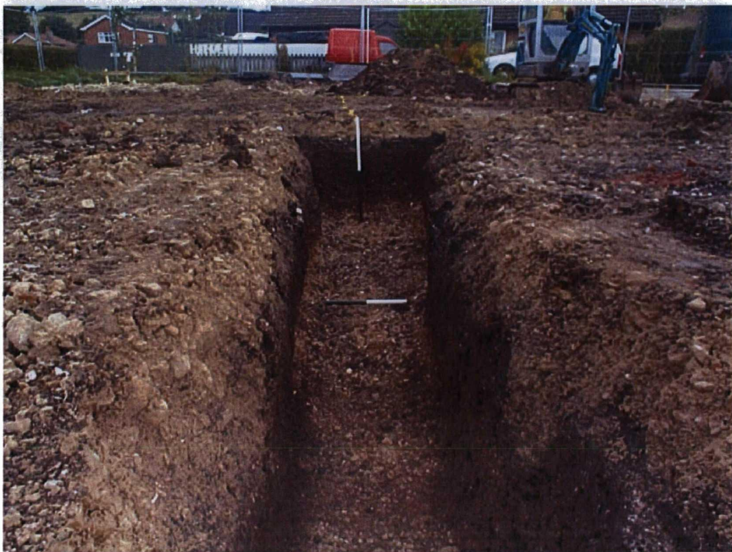
Plate 2. Detail of Foundation Trench. Facing North