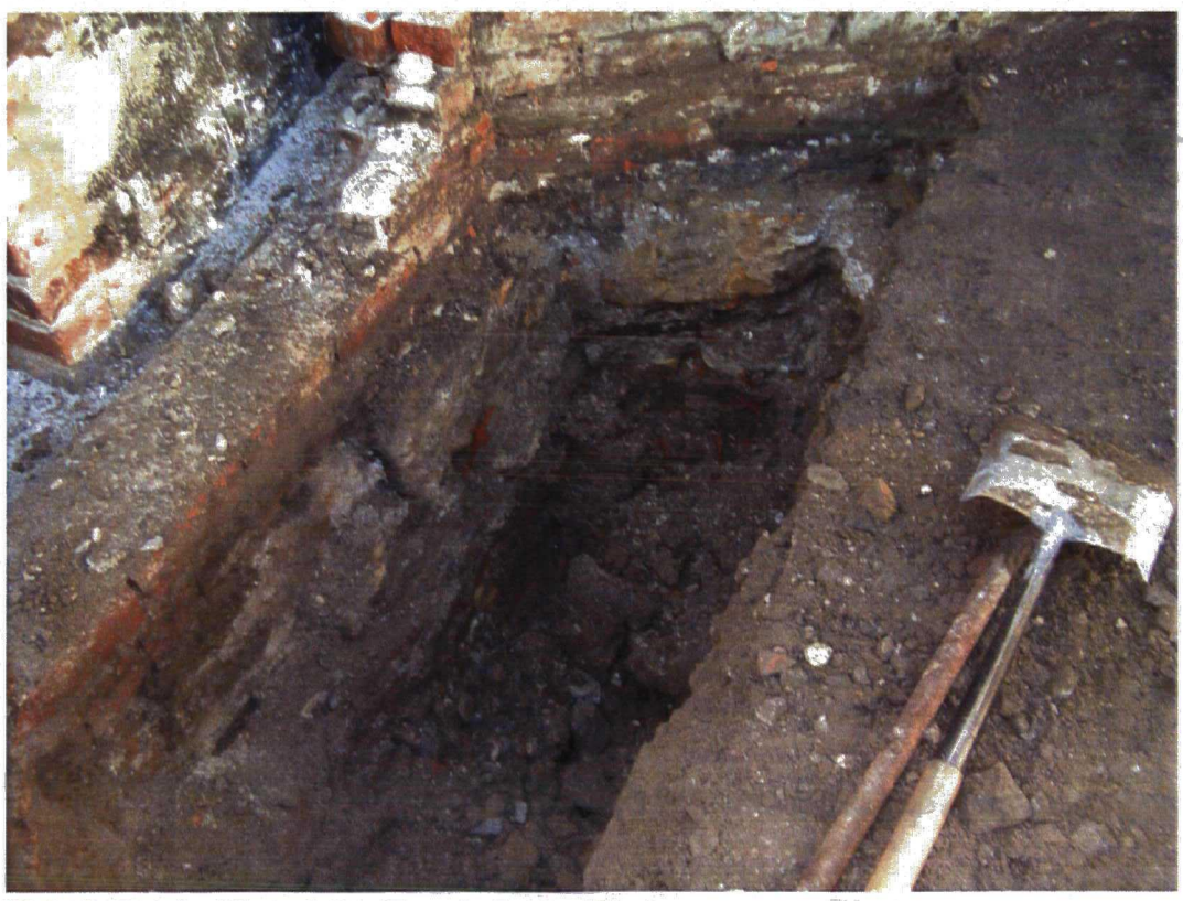
Plate 2. Detail of Foundation Trench. Facing West