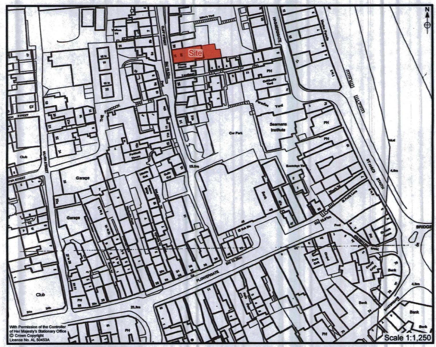
Figure 2. Area of Watching Brief