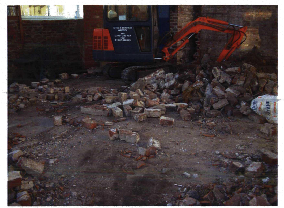
Plate 1. Overall Shot of Site. Facing South West