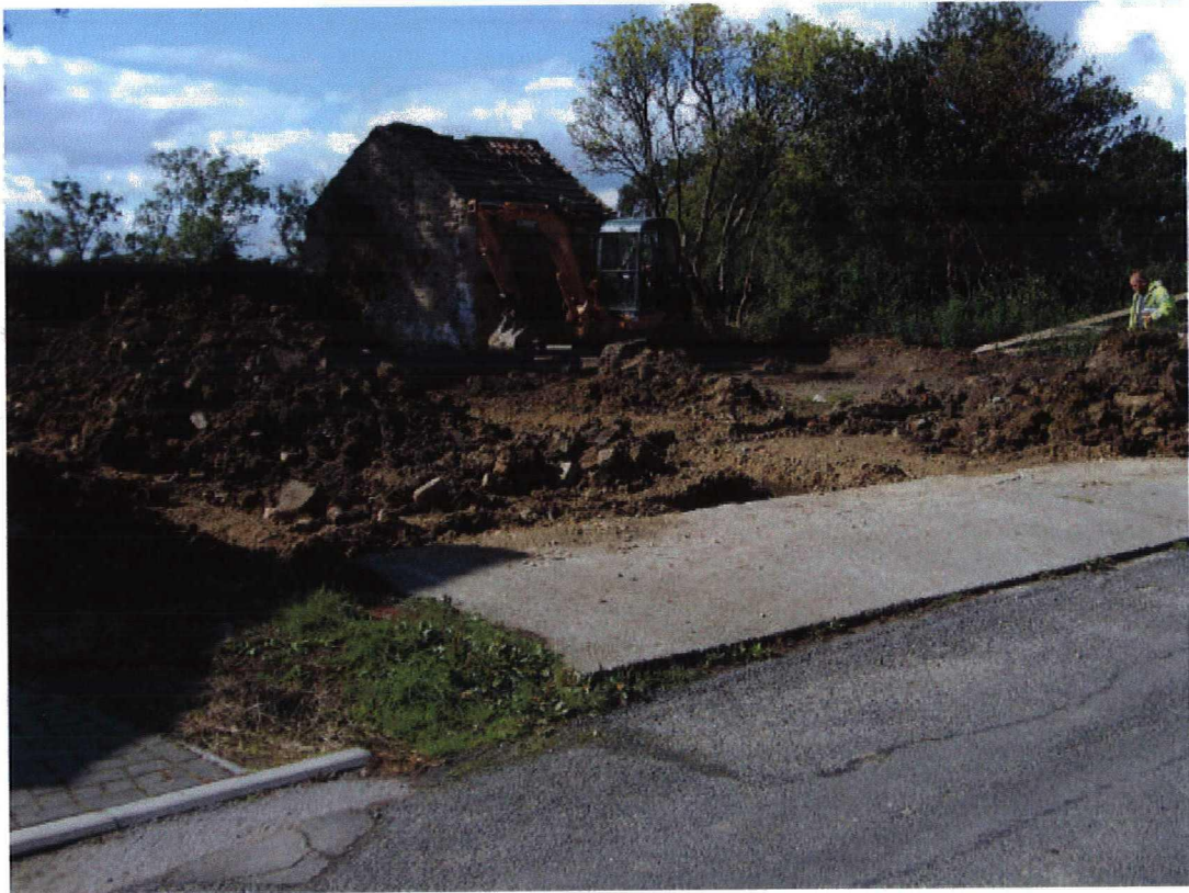
Old Village Hall, Manfield